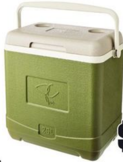
PC® HARD COOLER 26 L 21457443_EA