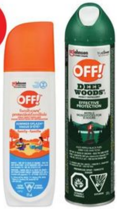
OFF! OR RAID INSECT REPELLENT SELECTED VARIETIES 20001279002_EA/20158572_EA