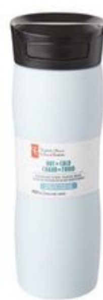
PC® MUGS OR TUMBLERS SELECTED VARIETIES 21217492_EA/21352850_EA