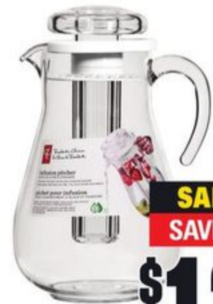
PC® INFUSION PITCHER 21056529_EA