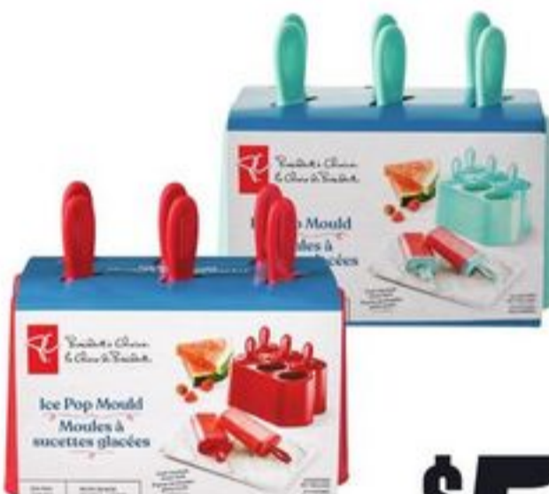
PC® ICE POP MOULD 6 PACK 21316064_EA/21316066_EA