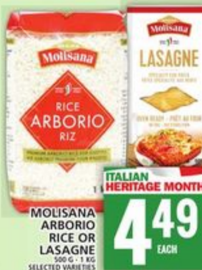
MOLISANA ARBORIO RICE OR LASAGNE 300 G - 1 KG SELECTED VARIETIES