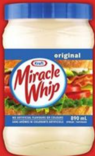
KRAFT MIRACLE WHIP 650 - 890 ML SELECTED VARIETIES