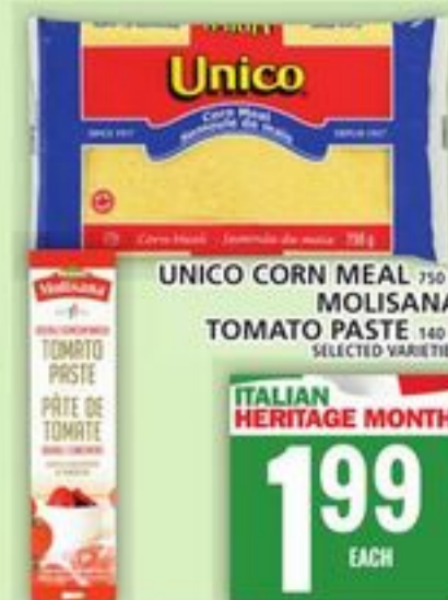
UNICO CORN MEAL 750 G MOLISANA TOMATO PASTE 140 G SELECTED VARIETIES