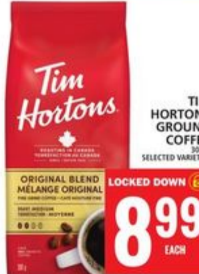
TIM HORTONS GROUND COFFEE 300 G SELECTED VARIETIES