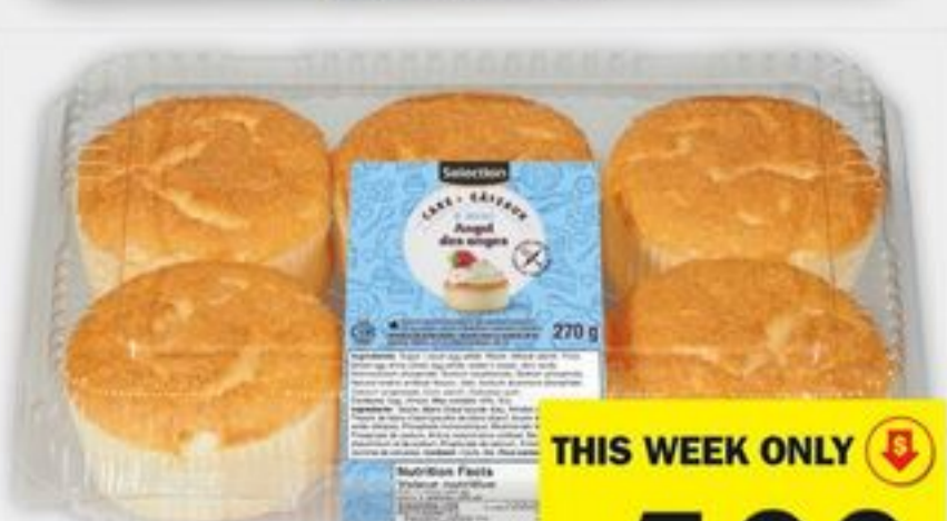
SELECTION SWISS ROLLS 400 G ANGEL FOOD CAKE 270 - 284 G SELECTED VARIETIES