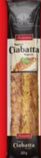
IRRESISTIBLES CIABATTA BAGUETTE 325 G SELECTED VARIETIES