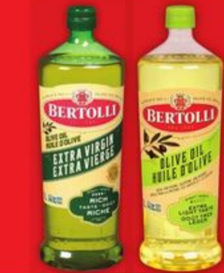
BERTOLI OLIVE OIL 1 L SELECTED VARIETIES