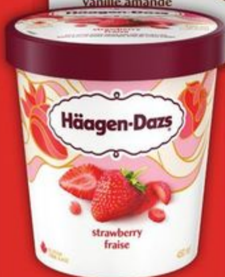
HÄAGEN-DAZS ICE CREAM 450 ML NOVELTIES 3-4.5 SELECTED VARIETIES