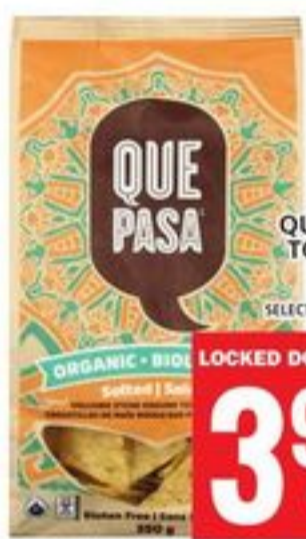
QUE PASA TORTILLA CHIPS 350 G SELECTED VARIETIES