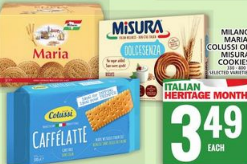
MILANO MARIA, COLUSSI OR MISURA COOKIES 330 - 400 G SELECTED VARIETIES