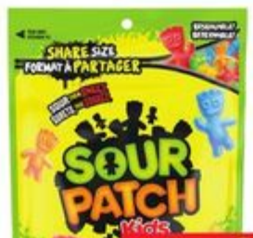
MAYNARDS CANDY 200 - 315 G SELECTED VARIETIES