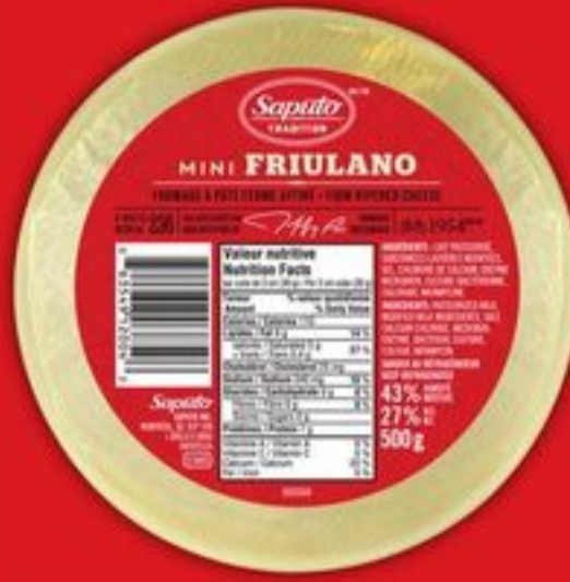
SAPUTO MINI FRIULANO 500 G SELECTED VARIETIES