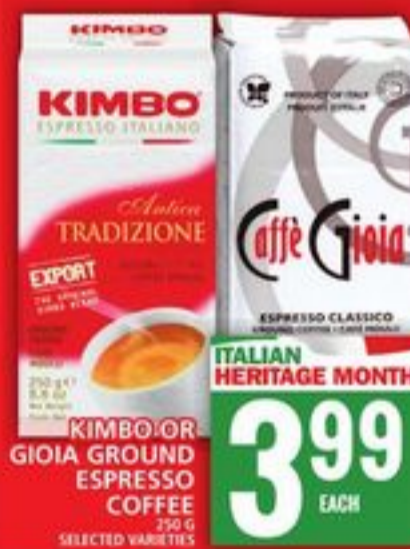
KIMBO OR GIOIA GROUND ESPRESSO COFFEE 250 G SELECTED VARIETIES