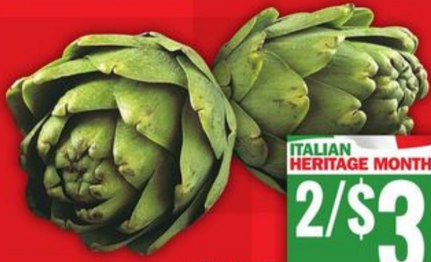
ARTICHOKEs PRODUCT OF U.S.A.