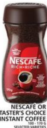
NESCAFÉ OR TASTER'S CHOICE INSTANT COFFEE 100 - 170 G SELECTED VARIETIES