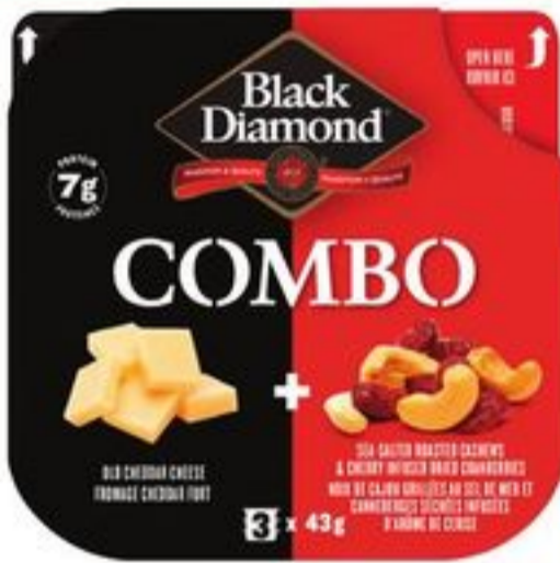
BLACK DIAMOND COMBO 3 X 43 G SELECTED VARIETIES