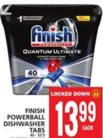
FINISH POWERBALL DISHWASHER TABS 40 SELECTED VARIETIES