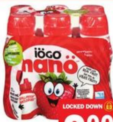
iögo NANO DRINKABLE YOGURT 6 X 93 ML SELECTED VARIETIES