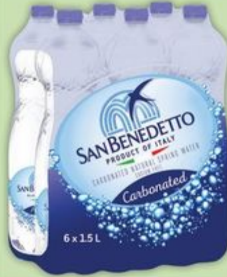
SAN BENEDETTO SPRING WATER 6 X 1.5 L SELECTED VARIETIES