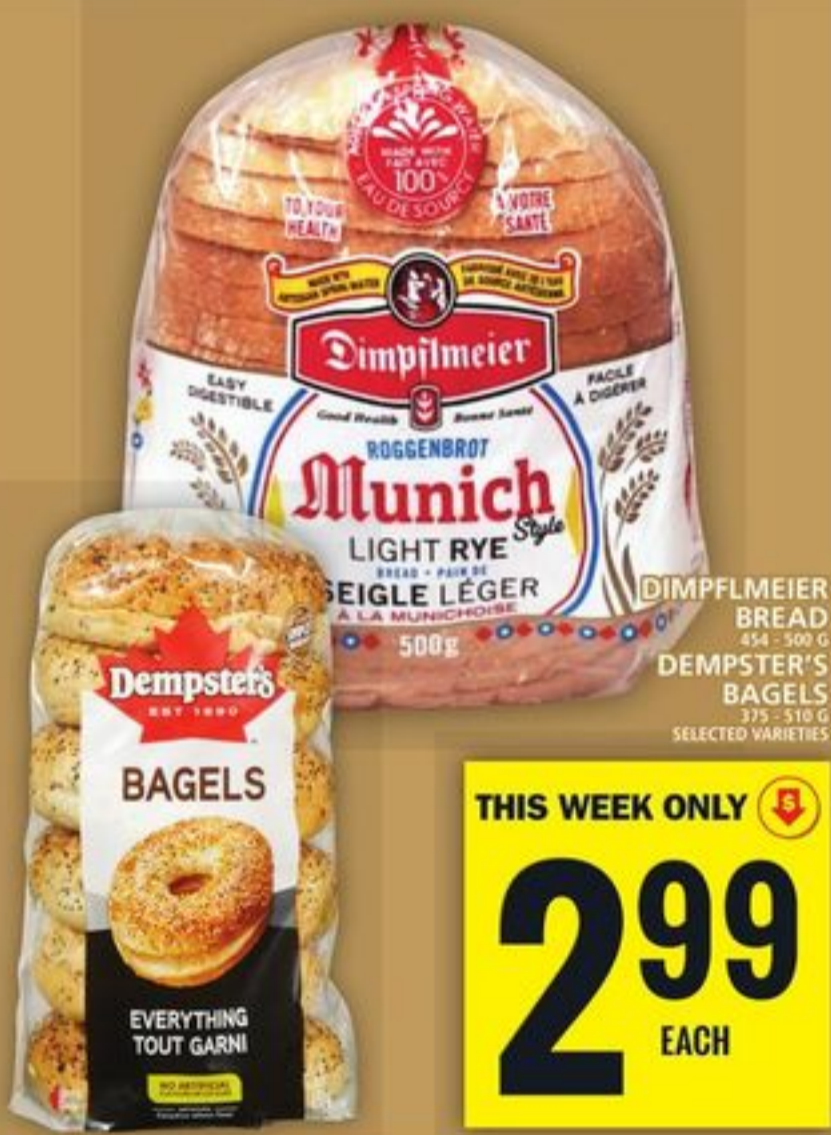
DIMPFLMEIER BREAD 454 - 500 G DEMPSTER'S BAGELS 375 - 510 G SELECTED VARIETIES