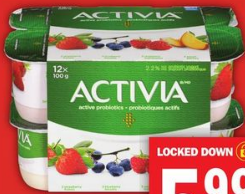
ACTIVIA YOGURT 12x 100g SELECTED VARIETIES