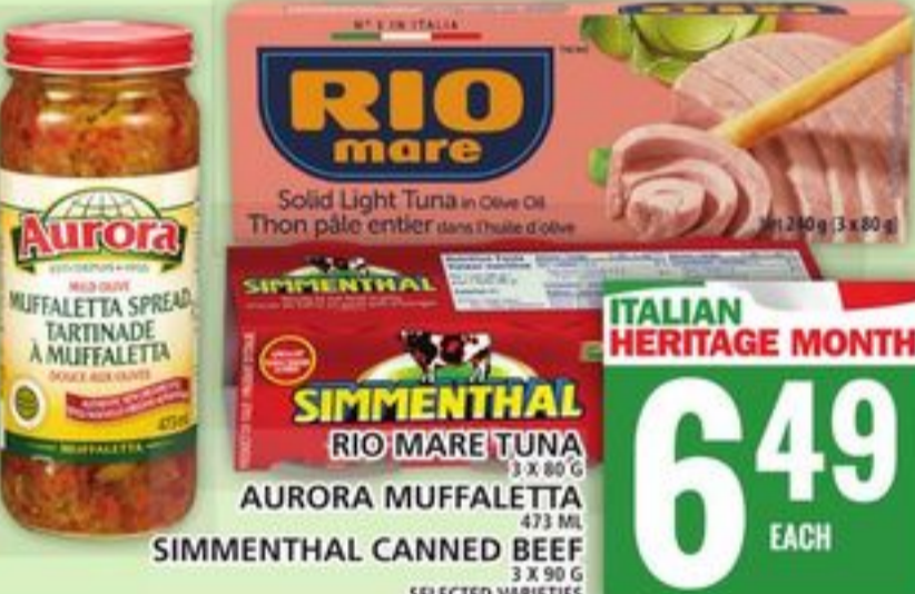
AURORA MUFFALETTA SPREAD TARTINADE À MUFFALETTA 473 ML SIMMENTHAL CANNED BEEF 3 X 90 G SELECTED VARIETIES