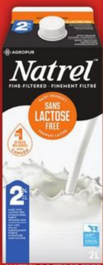
NATREL LACTOSE FREE MILK 2L SELECTED VARIETIES