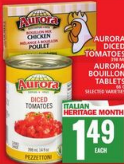
AURORA DICED TOMATOES 298 ML AURORA BOUILLON TABLETS 34 G SELECTED VARIETIES