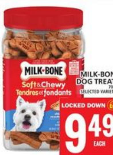
MILK-BONE DOG TREATS 708 G SELECTED VARIETIES