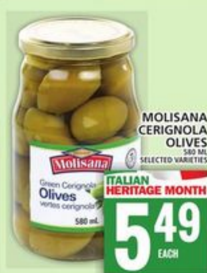
MOLISANA CERIGNOLA OLIVES 500 ML SELECTED VARIETIES