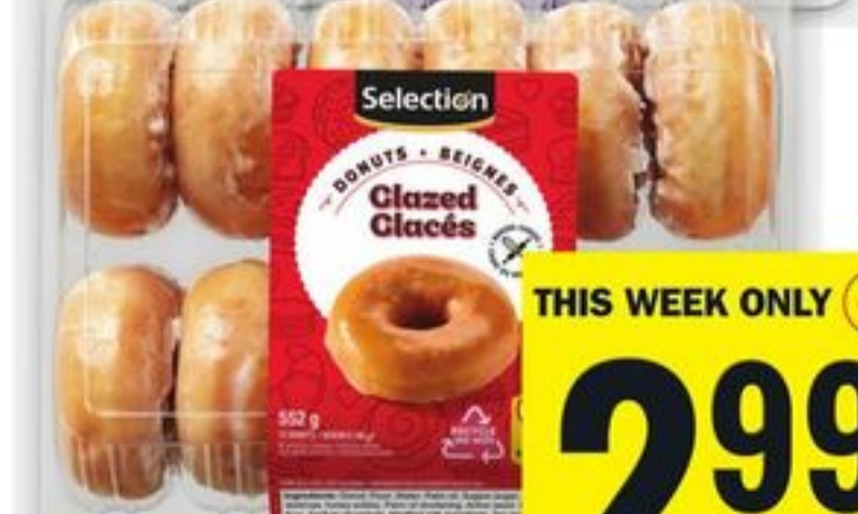
SELECTION DONUTS 400 - 552 G SELECTED VARIETIES