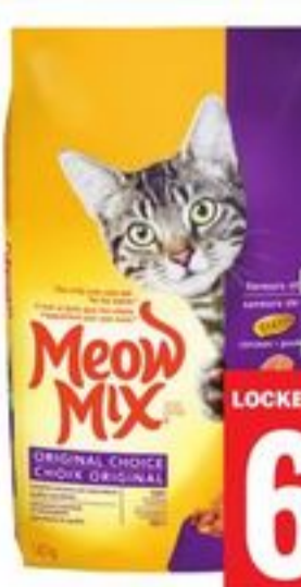
MEOW MIX CAT FOOD 4.2 KG SELECTED VARIETIES