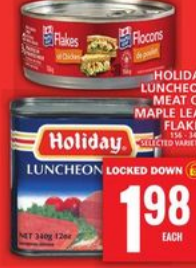
HOLIDAY LUNCHEON MEAT OR MAPLE LEAF FLAKES 156 - 340 G SELECTED VARIETIES