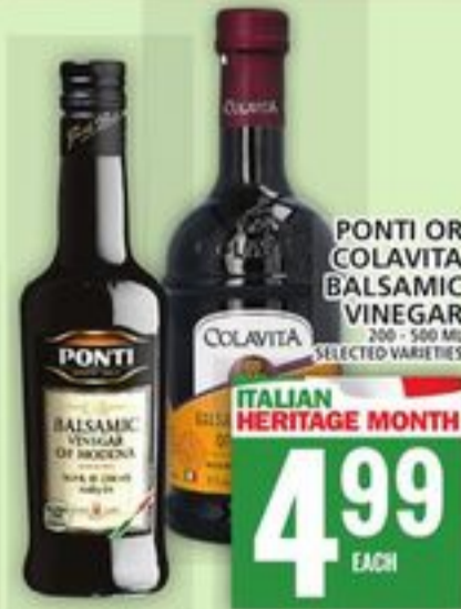
PONTI OR COLAVITA BALSAMIC VINEGAR 200 - 500 ML SELECTED VARIETIES