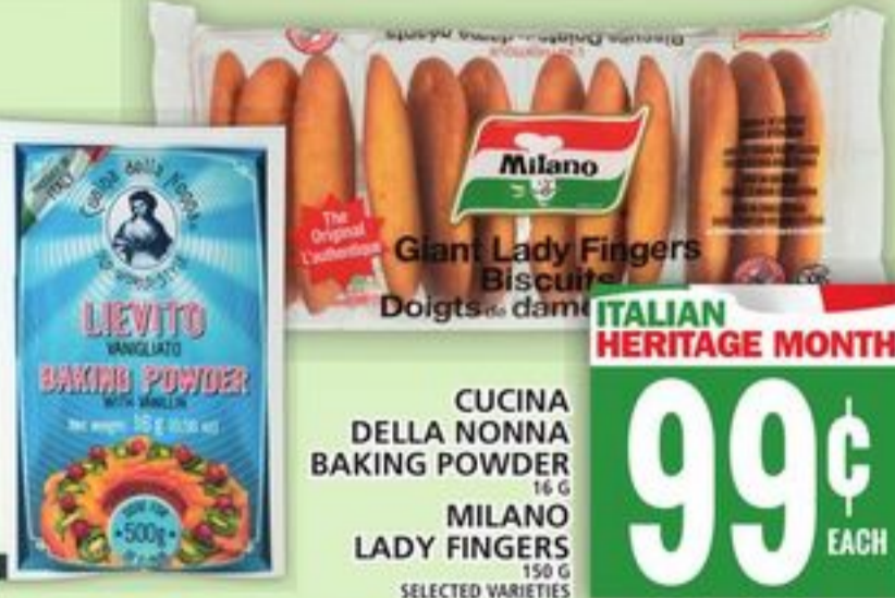
CUCINA DELLA NONNA BAKING POWDER 16 G MILANO LADY FINGERS 150 G SELECTED VARIETIES