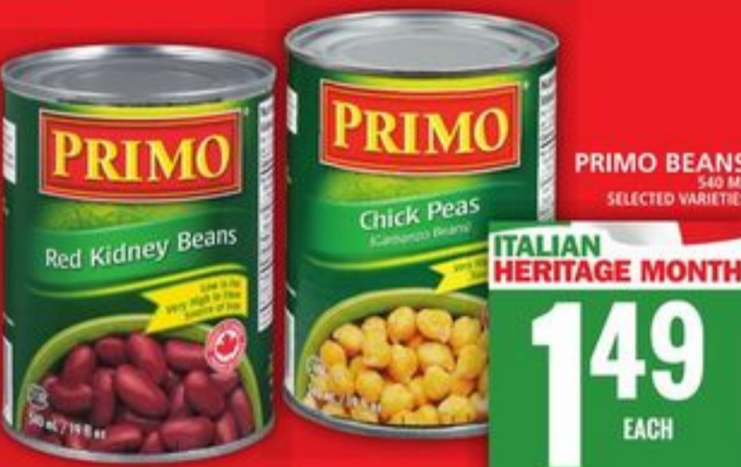
PRIMO BEANS 540 ML SELECTED VARIETIES