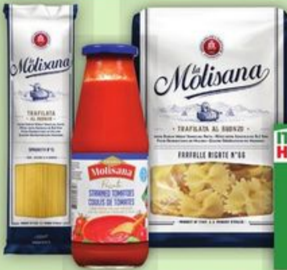
MOLISANA TOMATO PASSATA 680 ML LA MOLISANA PASTA 450 G SELECTED VARIETIES