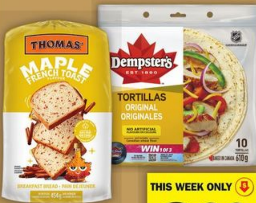
DEMPSTER'S 10" TORTILLAS 488 - 610 G THOMAS BREAKFAST BREAD 380 - 454 G SUN-MAID BREAD 430 G SELECTED VARIETIES