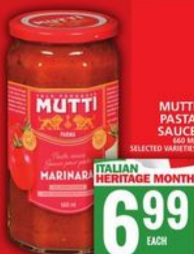
MUTTI PASTA SAUCE 660 ML SELECTED VARIETIES