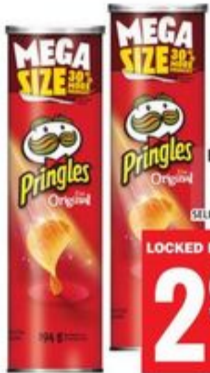
PRINGLES POTATO CHIPS 194 - 203 G SELECTED VARIETIES