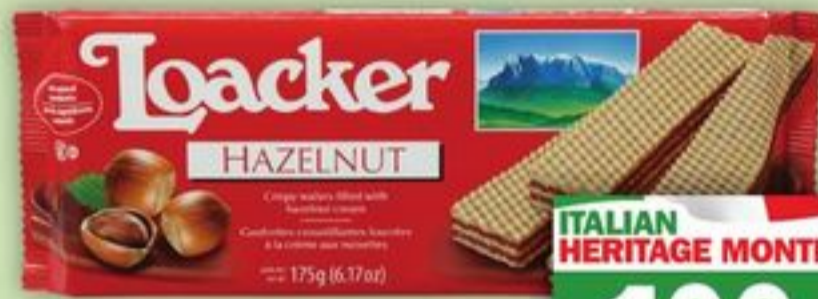
LOCKER WAFERS 175 G SELECTED VARIETIES