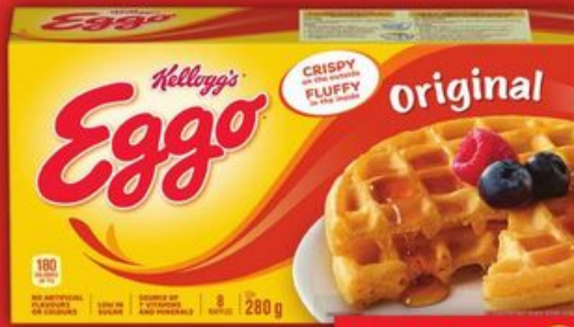
KELLOGG'S EGGO WAFFLES 280 G FROZEN SELECTED VARIETIES