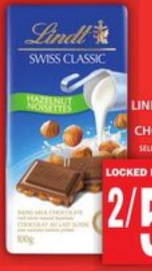
LINDT SWISS CLASSIC CHOCOLATE 100 G SELECTED VARIETIES