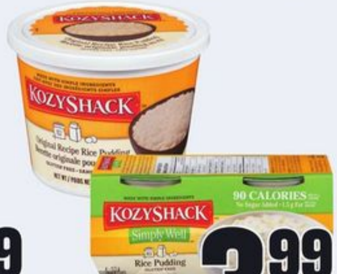
KOZY SHACK RICE PUDDING SELECTED VARIETIES 624 G/4X113 G 20321764003_EA/20323829001_EA