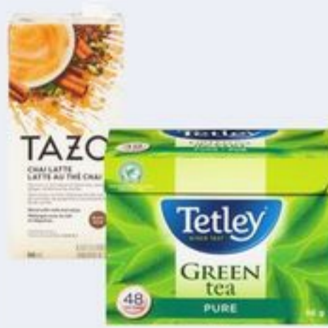
TAZO CONCENTRATE 946 ML, ZAVIDA NESPRESSO COMPATIBLE CAPSULES 10'S OR TETLEY TEA 40/48'S SELECTED VARIETIES 20719978001_EA/21295930_EA