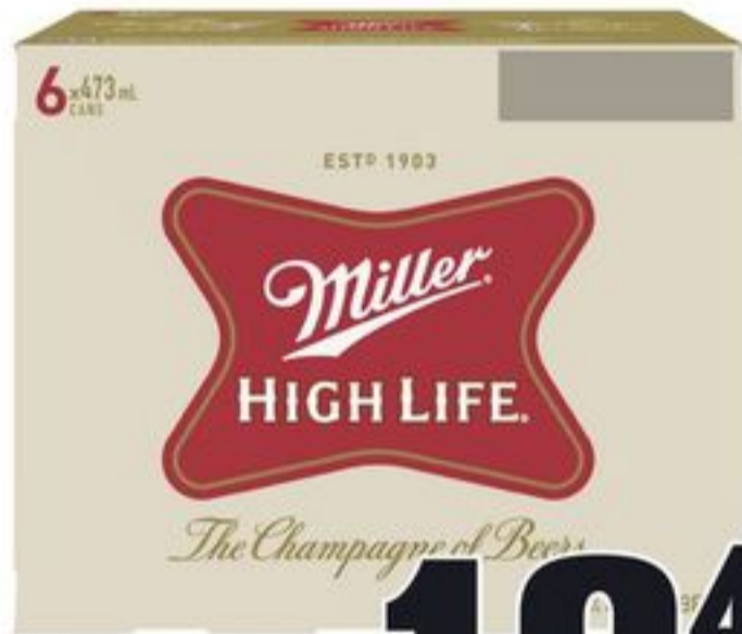
MILLER HIGH LIFE 6X473 ML CANS 21463139_C06