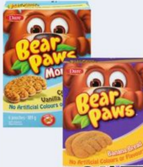
DARE BEAR PAWS COOKIE OR CRUNCHY SELECTED VARIETIES 150-240 G 20642323092_EA/21080779_EA