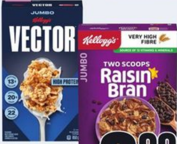
KELLOGG'S JUMBO CEREAL SELECTED VARIETIES 825 G-1.3 KG 20072706_EA/20815737_EA