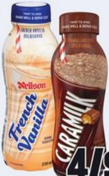
NELSON MILKSHAKES SELECTED VARIETIES 310 ML 21040932_EA/21040942_EA