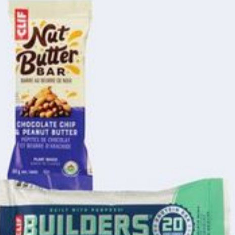
CLIF NUT BUTTER OR BUILDER BARS 50/68 G 20419958001_EA/21511083_EA