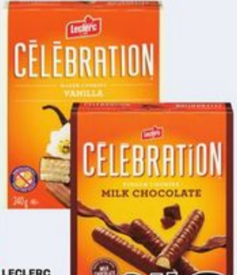
LECLERC CÉLÉBRATION COOKIES SELECTED VARIETIES 240 G 20965242_EA/20965368_EA