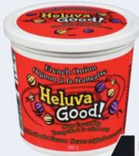
HELUVA GOOD! FRENCH ONION DIP SELECTED VARIETIES 680 G 2031278801_EA