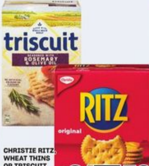
CHRISTIE RITZ WHEAT THINS OR TRISCUIT CRACKERS SELECTED VARIETIES 175-454 G 21030905_EA/21547034_EA