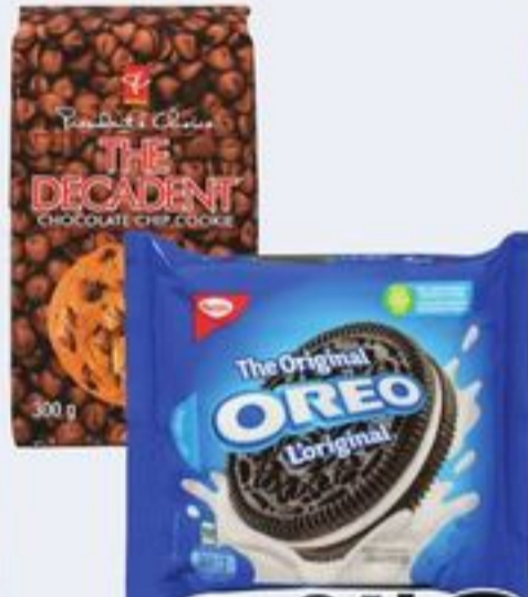
CHRISTIE COOKIES 170-303 G OR PC* THE DECADENT* CHOCOLATE CHIP COOKIES 280/300 G 20612257_EA/21358407_EA