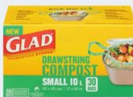
GLAD COMPOSTABLE DRAWSTRING BAGS SELECTED VARIETIES 30'S 21478747_EA