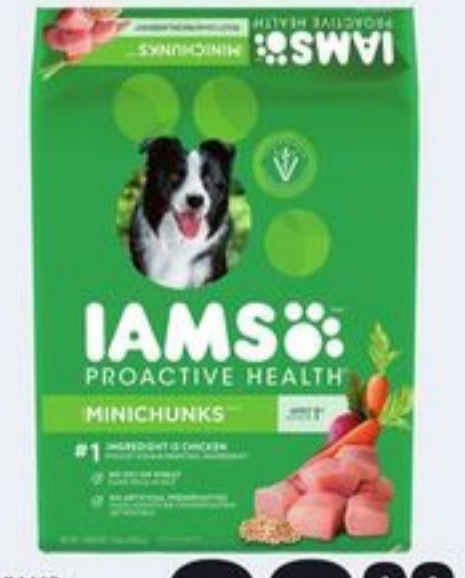
IAMS DOG FOOD SELECTED VARIETIES 6.12-6.8 KG 20646724002_EA