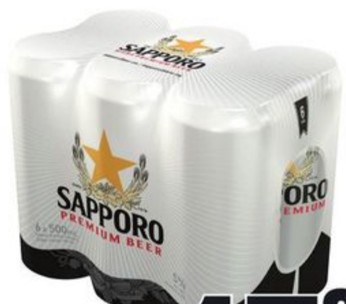
SAPPORO 6X500 ML CANS 21014346_C06