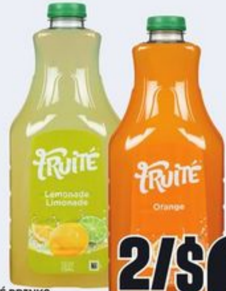
FRUITÉ DRINKS SELECTED VARIETIES 1.54 L 21595744_EA/21595841_EA