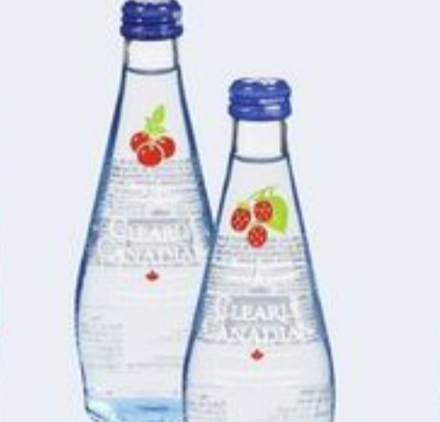
CLEARLY CANADIAN SPARKLING WATER SELECTED VARIETIES 325 ML 21387870_EA/21387926_EA