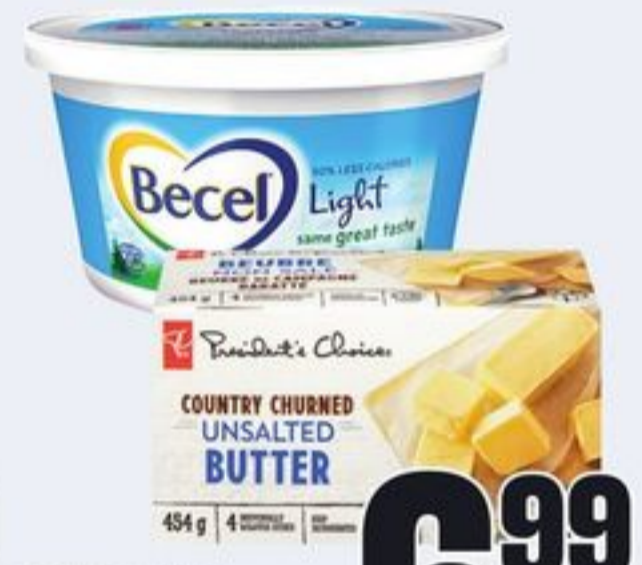
BECEL MARGARINE 637/850 G OR PC* BUTTER FRESH QUARTERS 454 G SELECTED VARIETIES 20297818003_EA/20131456001_EA