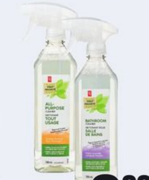
PC* PLANET FIRST CLEANERS SELECTED VARIETIES 700 ML 21543302_EA/21544963_EA