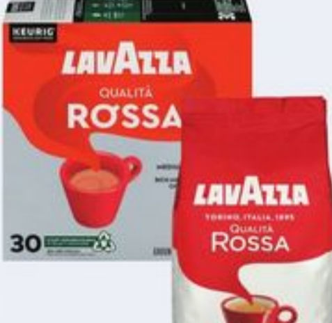
LAVAZZA WHOLE BEAN COFFEE 1 KG OR KCUP 30'S SELECTED VARIETIES 21556082_EA/21589798_EA