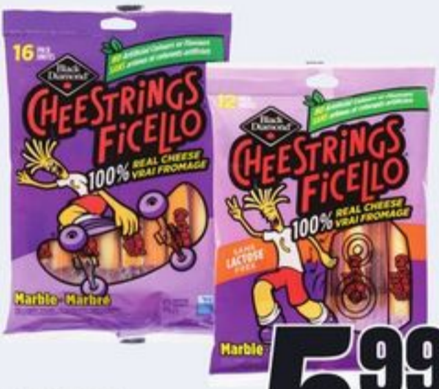
BLACK DIAMOND CHEESTRINGS SELECTED VARIETIES 12/16'S 20763661_EA/21041750_EA