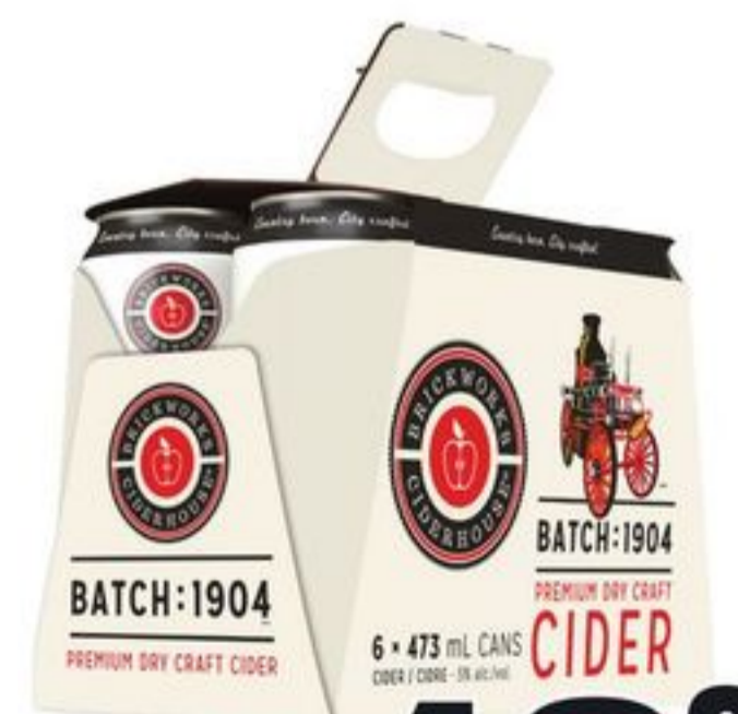
BRICKWORKS CIDERHOUSE BATCH 6X473 ML CANS 21543382_C06