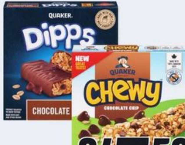
QUAKER DIPPES OR CHEWY GRANOLA BARS SELECTED VARIETIES 120-156 G 20847582_EA/21359366_EA