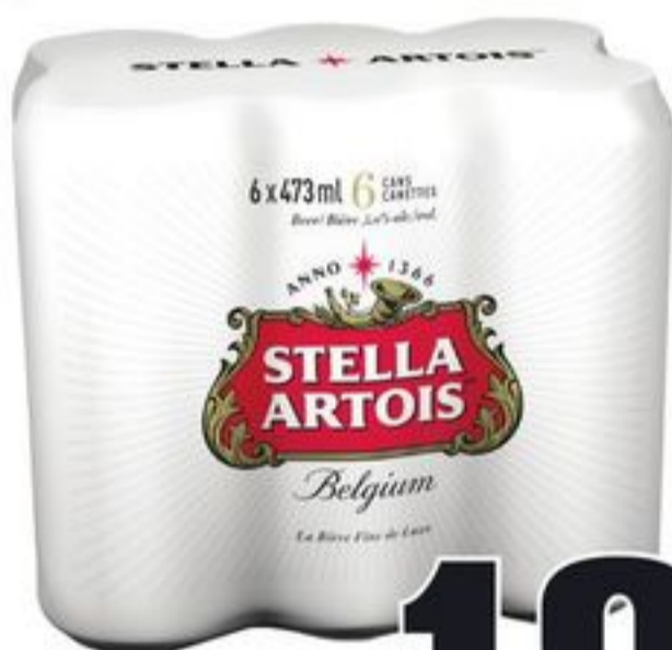
STELLA ARTOIS 6X473 ML CANS 21347368_C06