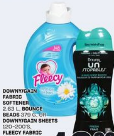
DOWNY/GAIN FABRIC SOFTENER 2.63 L, BOUNCE BEADS 379 G, OR DOWNY/GAIN SHEETS 120-200'S, FLEECY FABRIC SOFTENER 3.5 L OR SHEETS 200'S SELECTED VARIETIES 21311739_EA/21549966_EA