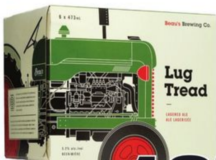
BEAU'S LUG TREAD 6X473 ML CANS 21392266_C06