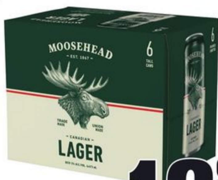
MOOSEHEAD LAGER 6X473 ML CANS 20955220_C06