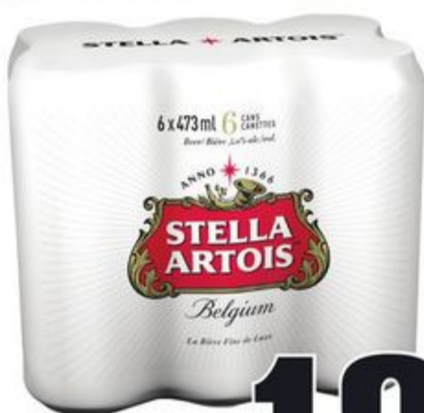
STELLA ARTOIS 6X473 ML CANS 21347368_C06