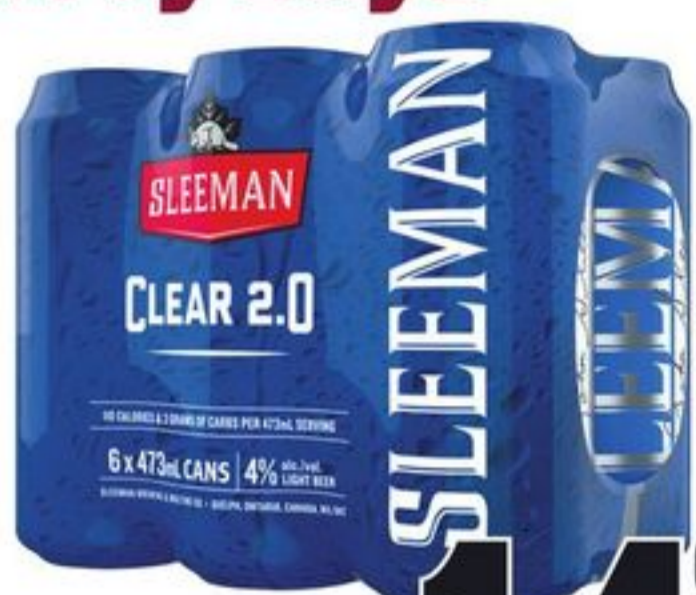
SLEEMAN CLEAR 6X473 ML CANS 21014347_C06