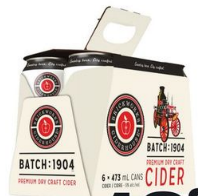
BRICKWORKS CIDERHOUSE BATCH 6X473 ML CANS 21543382_C06