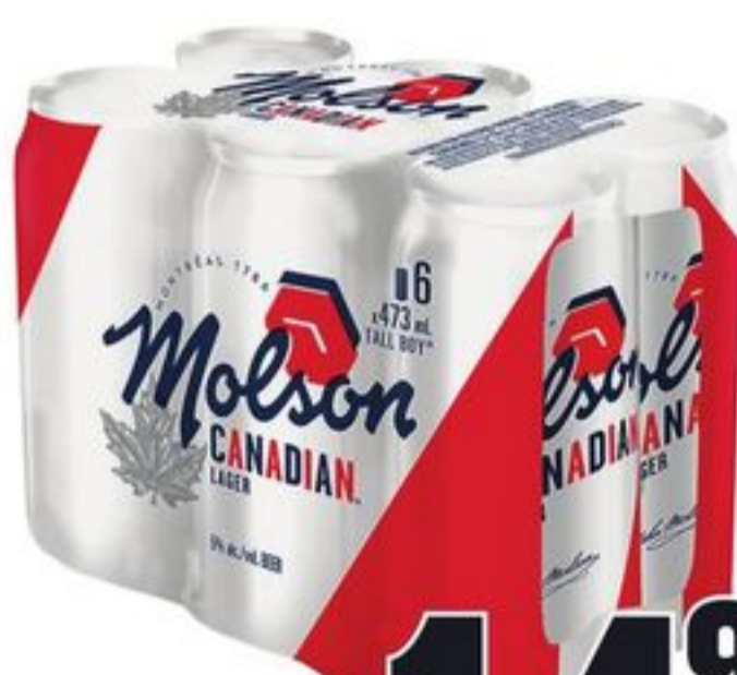
MOLSON CANADIAN 6X473 ML CANS 20944740_C06