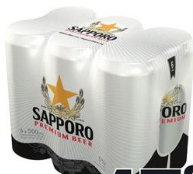
SAPPORO 6X500 ML CANS 21014346_C06