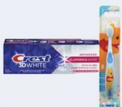
CREST 3D WHITE OR PRO-HEALTH TOOTHPASTE, SCOPE PRO HEALTH OR KIDS RINSE 500 ML OR ORAL-B MANUAL TOOTHBRUSH OR FLOSS SELECTED VARIETIES AND SIZES 20346131002_EA/21506728_EA