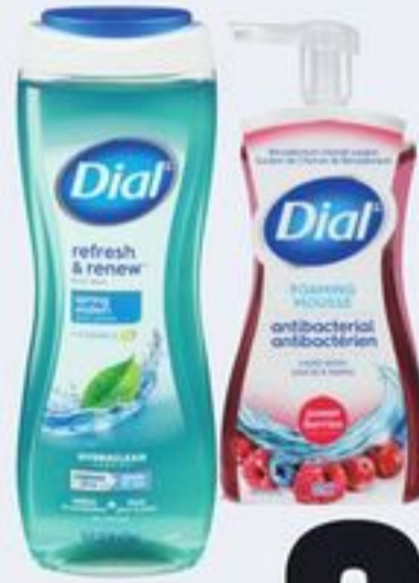
DIAL FOAMING LIQUID HAND SOAP 221 ML OR BODY WASH 473 ML SELECTED VARIETIES 20704566_EA/21311819_EA