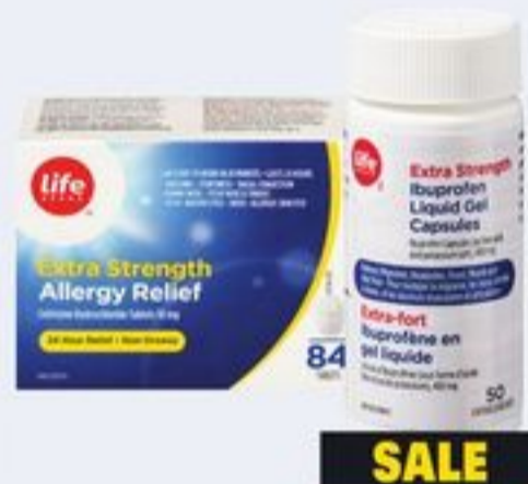
LIFE BRAND PAIN OR ALLERGY RELIEF TABLETS, CAPLETS, SPRAYS, LIQUIDS, PATCHES OR RUBS SELECTED VARIETIES AND SIZES 21134305_EA/21229420_EA