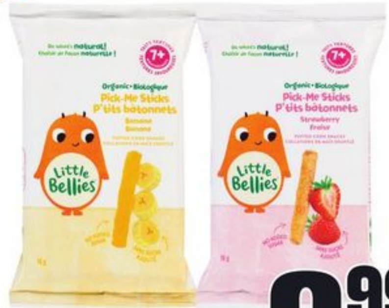
LITTLE BELLIES ORGANIC PICK-ME-STICKS SELECTED VARIETIES 16 G 21540210_EA/21540211_EA