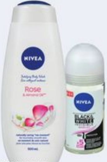
NIVEA BODY WASH 500 ML, ROLL-ON DEODORANT 50 ML OR ANTIPERSPIRANT 51/52 G SELECTED VARIETIES 20321421004_EA/21169839_EA