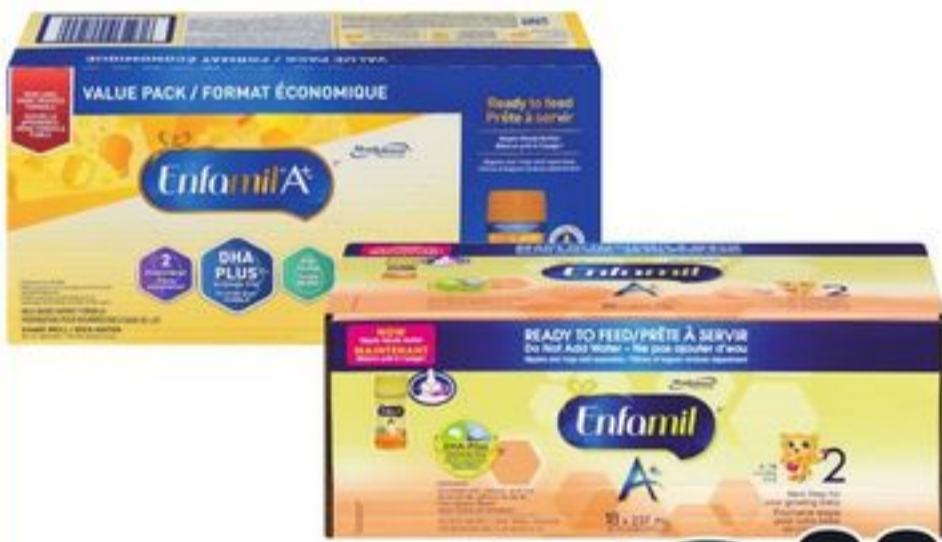
ENFAMIL A+ READY-TO-FEED FORMULA SELECTED VARIETIES 18X237 ML 21208370_C01/21208382_C01