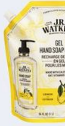
J.R. WATKINS BODY WASH 523 ML OR LIQUID HAND SOAP REFILL 828 ML/1 L SELECTED VARIETIES 20968244_EA/21432700_EA