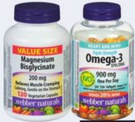
WEBBER NATURALS VITAMINS OR SUPPLEMENTS SELECTED VARIETIES AND SIZES 20783429_EA/21369542_EA