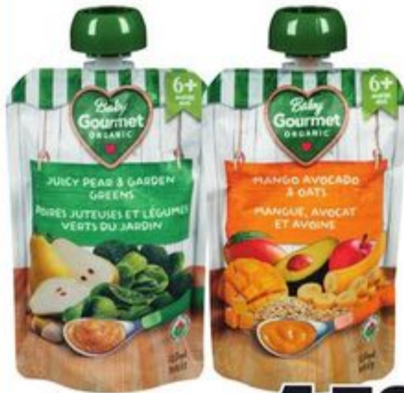
BABY GOURMET ORGANIC BABY FOOD POUCHES SELECTED VARIETIES 113/128 ML 20368074001_EA/21123983_EA