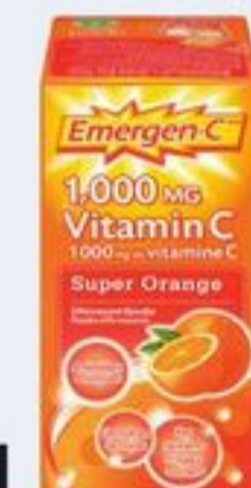
CENTRUM MULTIVITAMINS, EMERGEN-C OR CALTRATE SUPPLEMENTS SELECTED VARIETIES AND SIZES 20997357_EA 21283427_EA