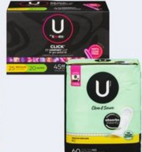
U BY KOTEX SELECTED VARIETIES AND SIZES 21291969_EA 21364230_EA