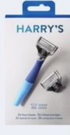
HARRY'S OR FLAMINGO RAZORS, CARTRIDGES, SHAVE GEL OR BALM SELECTED VARIETIES AND SIZES 21360919_EA/21512887_EA