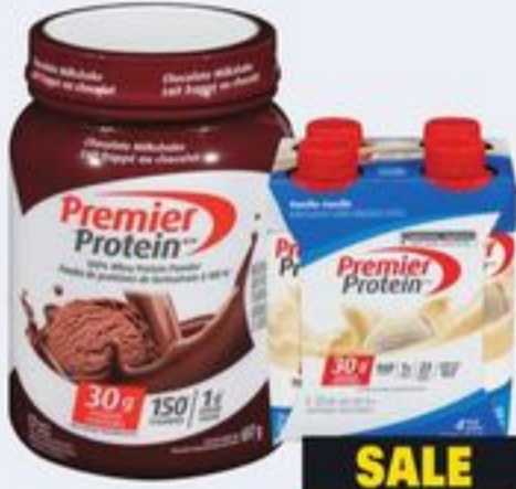
PREMIER PROTEIN POWDER AND READY TO DRINK SHAKES SELECTED VARIETIES AND SIZES 21031108_EA/21469945_EA