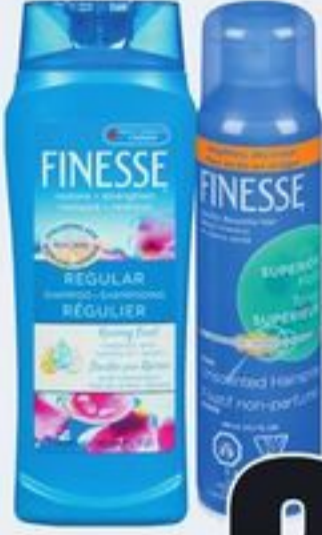
FINESSE HAIR CARE AND STYLING SELECTED VARIETIES AND SIZES 20308415002_EA/20312912004_EA