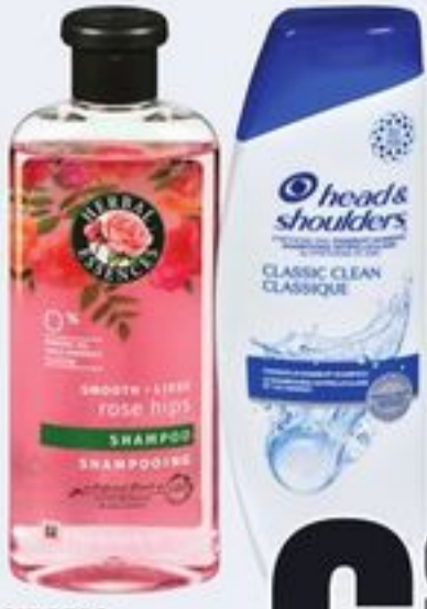
HEAD & SHOULDERS OR HERBAL ESSENCES HAIR CARE SELECTED VARIETIES AND SIZES 21283590_EA/21505016_EA