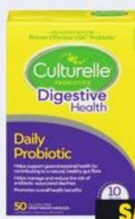
CULTURELLE ADULT, CHILDREN OR BABY DIGESTIVE HEALTH TABLETS, CHEWS OR DROPS SELECTED VARIETIES AND SIZES 20974460_EA