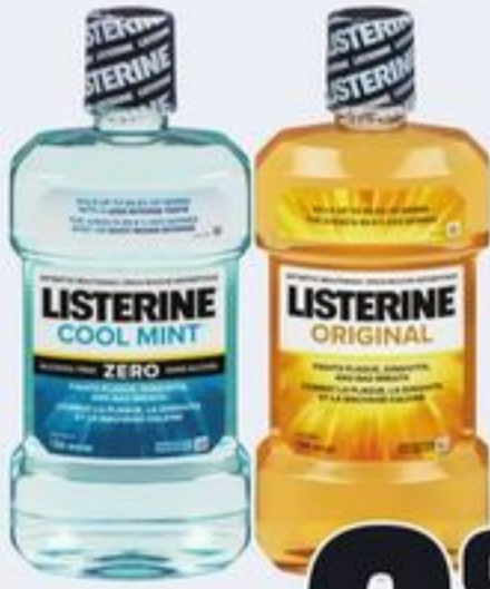
LISTERINE CLASSIC 1 L OR KIDS MOUTHWASH 500 ML SELECTED VARIETIES 20348438001_EA/21091207_EA