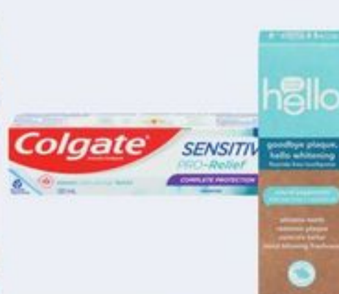
COLGATE OPTIC WHITE OR SENSITIVE PRO RELIEF TOOTHPASTE 70-133 ML, KIDS MANUAL TOOTHBRUSH, HELLO TOOTHPASTE 82-98 ML OR COLGATE PERIOGARD TOOTHPASTE SELECTED VARIETIES AND SIZES 21177027_EA/21353925_EA