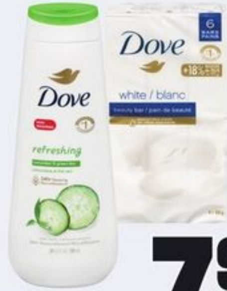
DOVE BAR SOAP 6X106 G OR BODY WASH 532-695 ML SELECTED VARIETIES 21237519_EA/21518329_EA