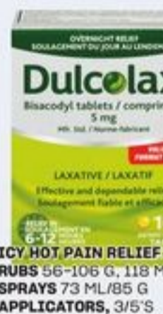
ICY HOT PAIN RELIEF RUBS 56-106 G, 118 ML SPRAYS 73 ML/85 G APPLICATORS, 3/5'S PATCHES OR DULCOLAX DIGESTIVE RELIEF 5 MG TABLETS 25-100'S, KIDS OR ADULT CHEWS 15/30'S OR 10 MG SUPPOSITORY SELECTED VARIETIES AND SIZES 21361052_EA/21470181_EA