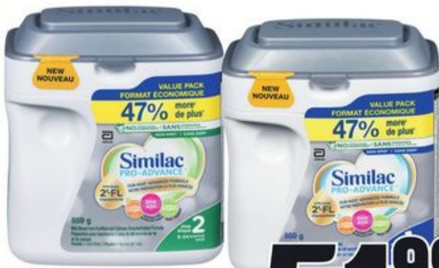
SIMILAC PRO-ADVANCE STEP 1 OR 2 POWDER FORMULA SELECTED VARIETIES 837-859 G 21436985_EA/21437126_EA