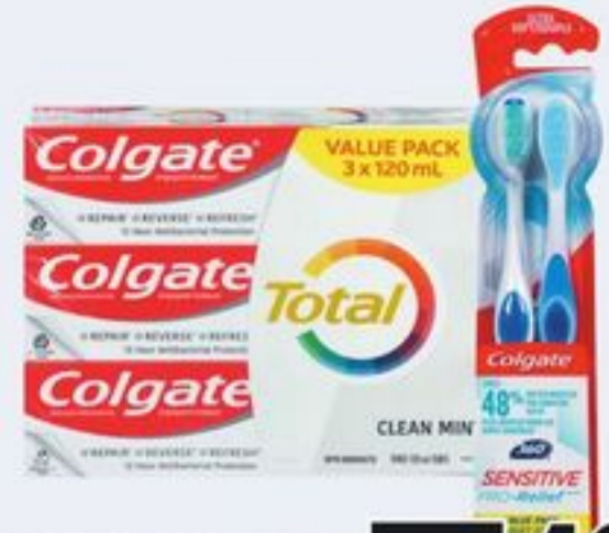
COLGATE TOTAL TOOTHPASTE 3-PACK, 2-PACK MANUAL TOOTHBRUSH, BATTERY TOOTHBRUSH, COLGATE TOTAL OR PRO RELIEF MOUTHWASH SELECTED VARIETIES AND SIZES 20124776002_EA/21166709_EA