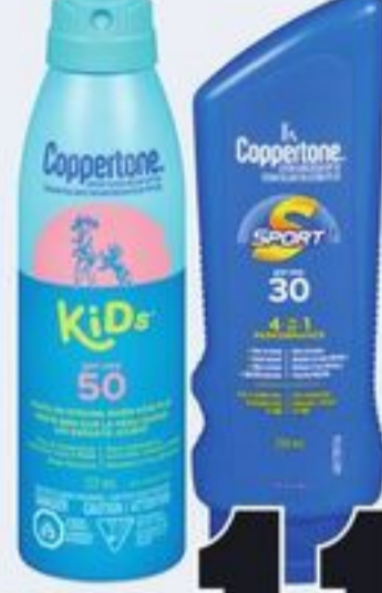
COPPERTONE ADULTS OR KIDS SUN CARE PRODUCTS SELECTED VARIETIES AND SIZES 21524980_EA/21524982_EA