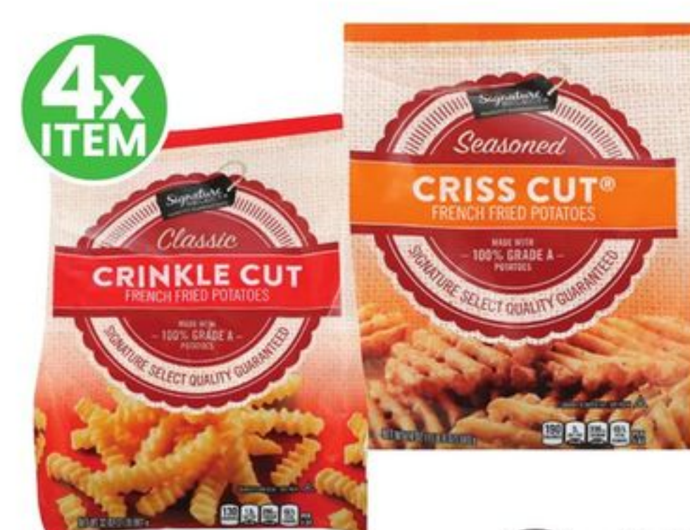
Signature SELECT® Potatoes 20 to 32-oz, select varieties