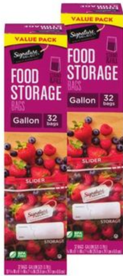
Signature SELECT® Food Storage Bags 32-ct, select varieties