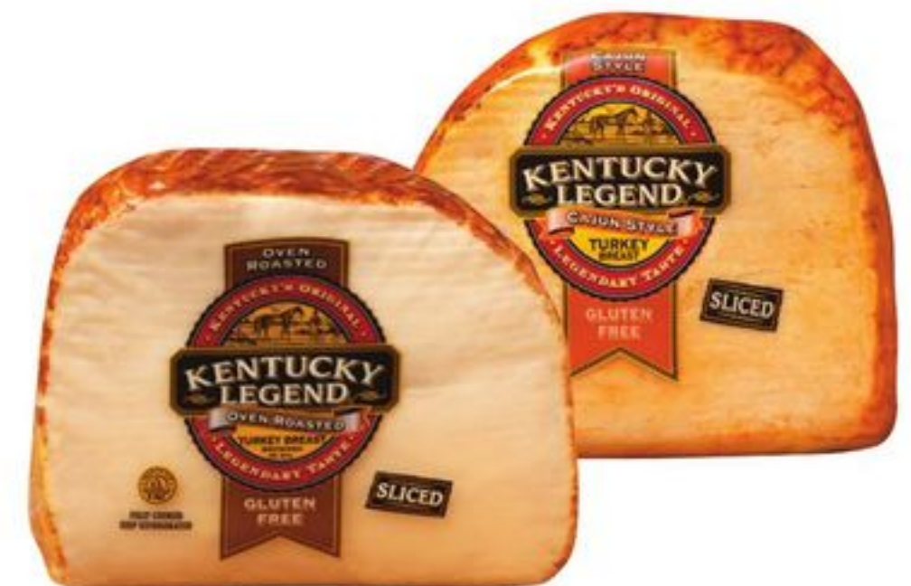
Kentucky Legend Quarter Sliced Turkey Breast Oven Roasted or Cajun