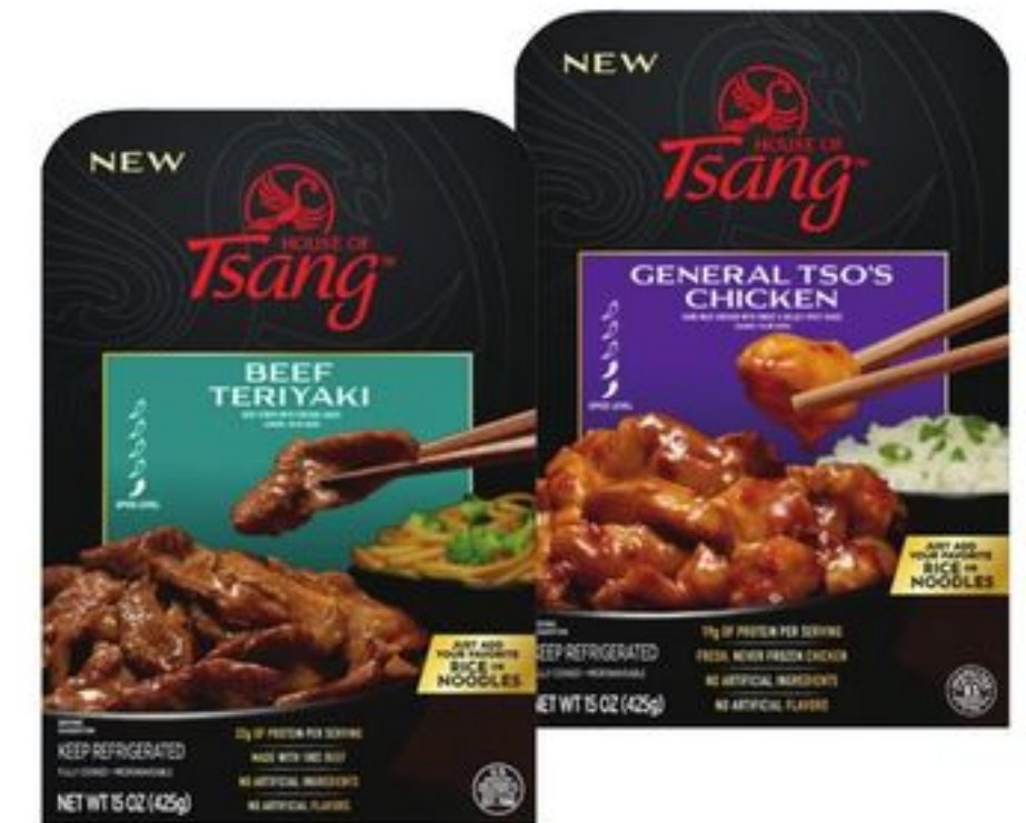
House of Tsang Chicken or Beef Entrées 15-oz, select varieties