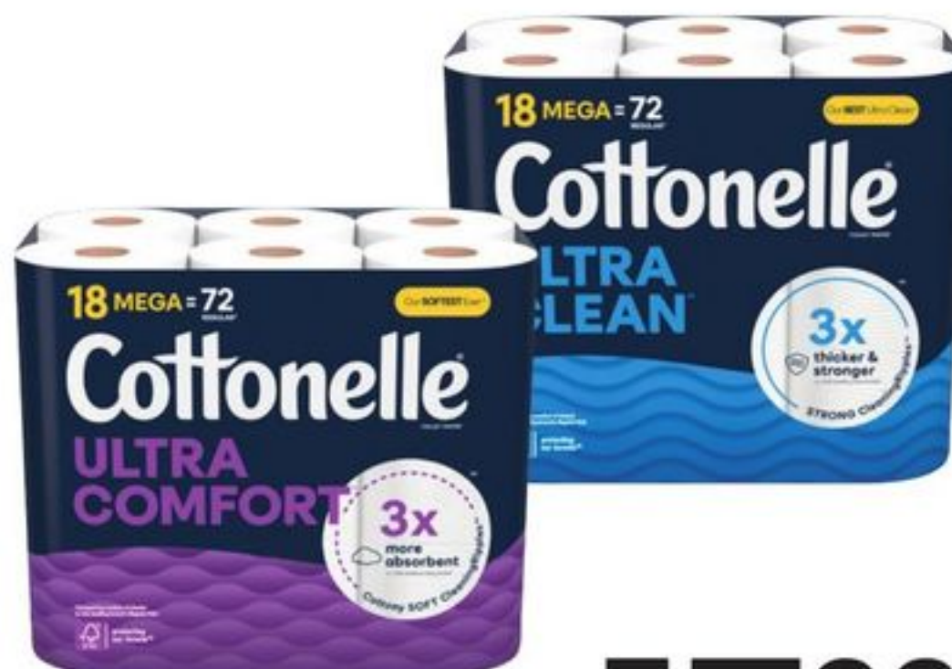
Cottonelle Bath Tissue 18-Mega Rolls, select varieties