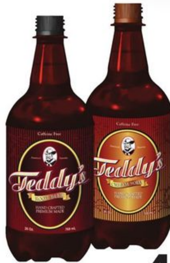
Teddy's Premium Soda 26-oz, select varieties