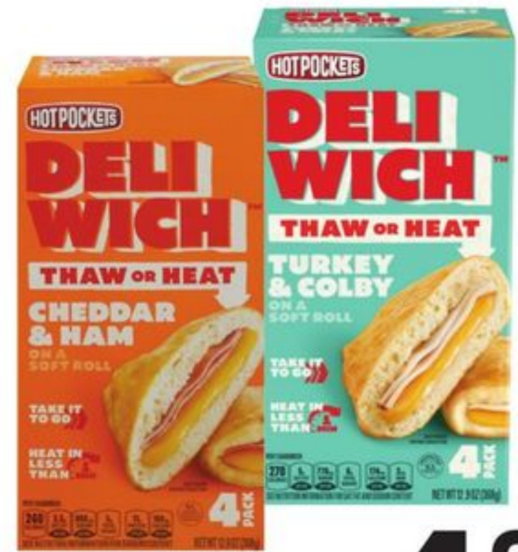
Hot Pockets Brand Deliwich 4-ct, 12.6 to 12.9-oz, select varieties