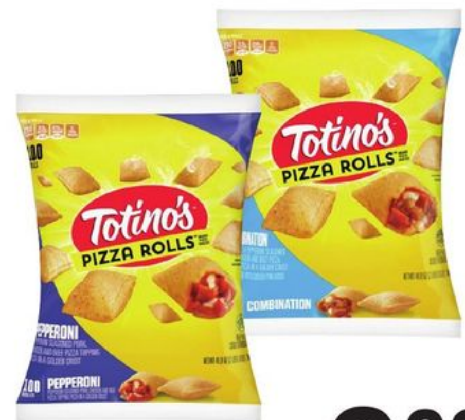
Totino's Pizza Rolls 100-ct, 48.8-oz, select varieties

BUY 1 GET FREE EQUAL OR LESSER VALUE Member Price