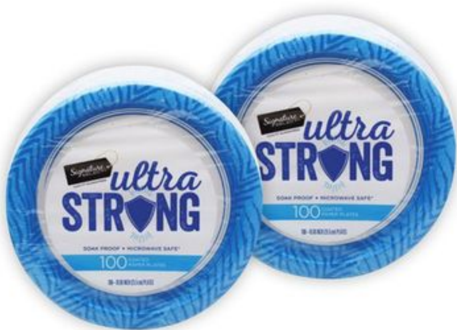
Signature SELECT® Ultra Strong Paper Plates 100-ct