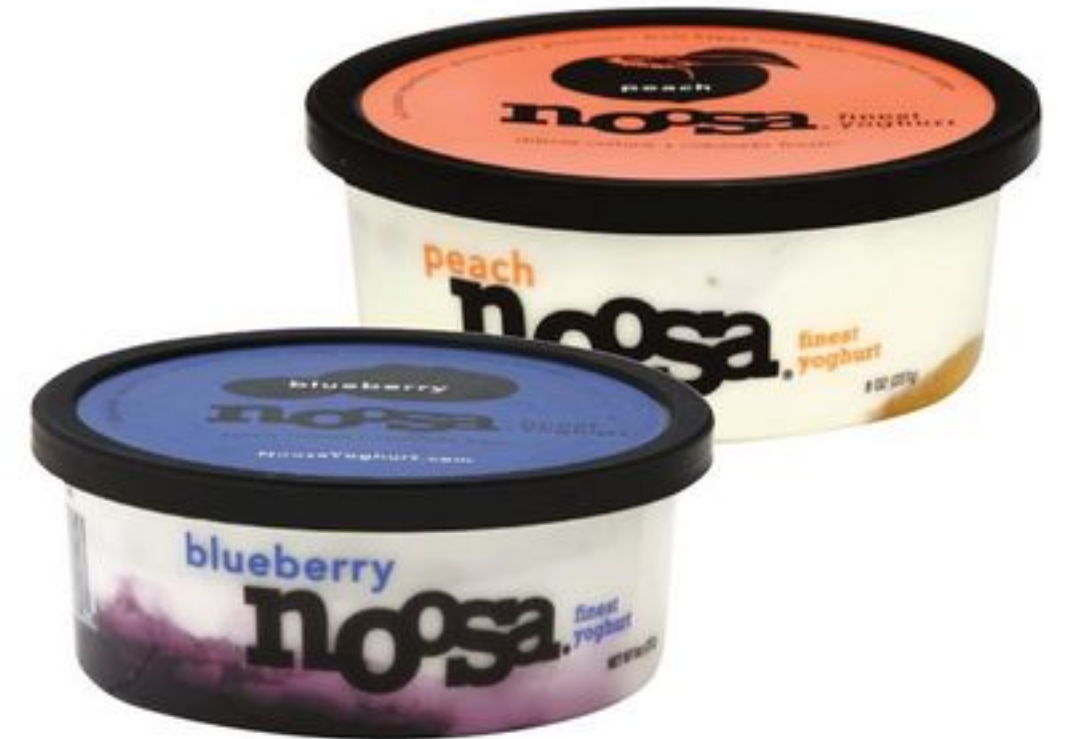
Noosa Finest Yoghurt 8-oz, select varieties