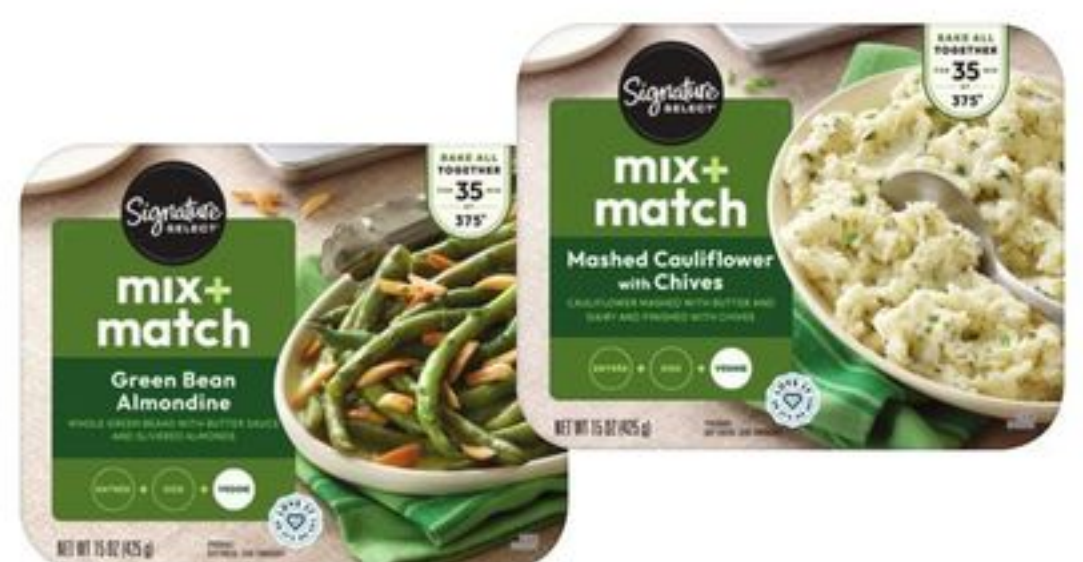
Signature SELECT® Mix + Match Side Dishes 15 to 17-oz, select varieties