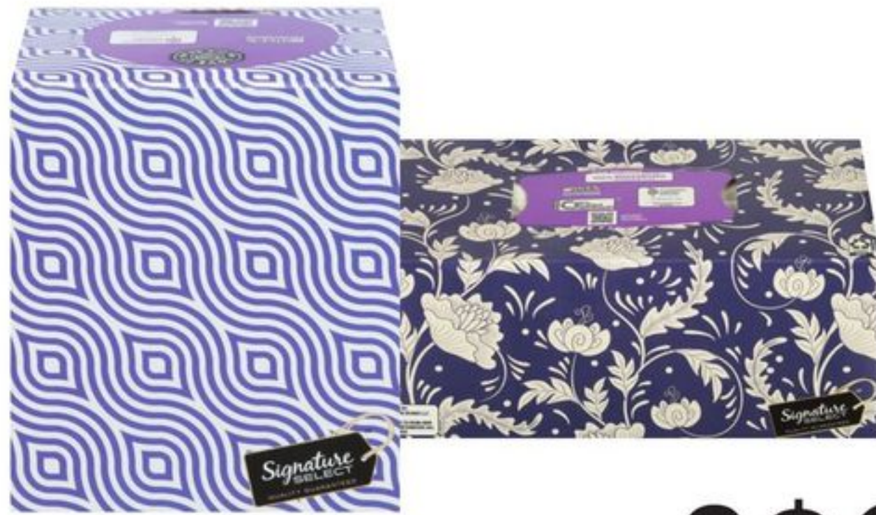
Signature SELECT® Softly Facial Tissue 60 to 160-ct, select varieties