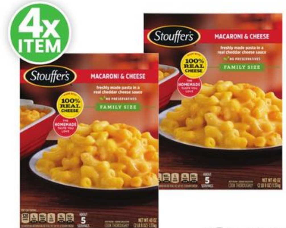
Stouffer's Family Size Macaroni & Cheese 40-oz