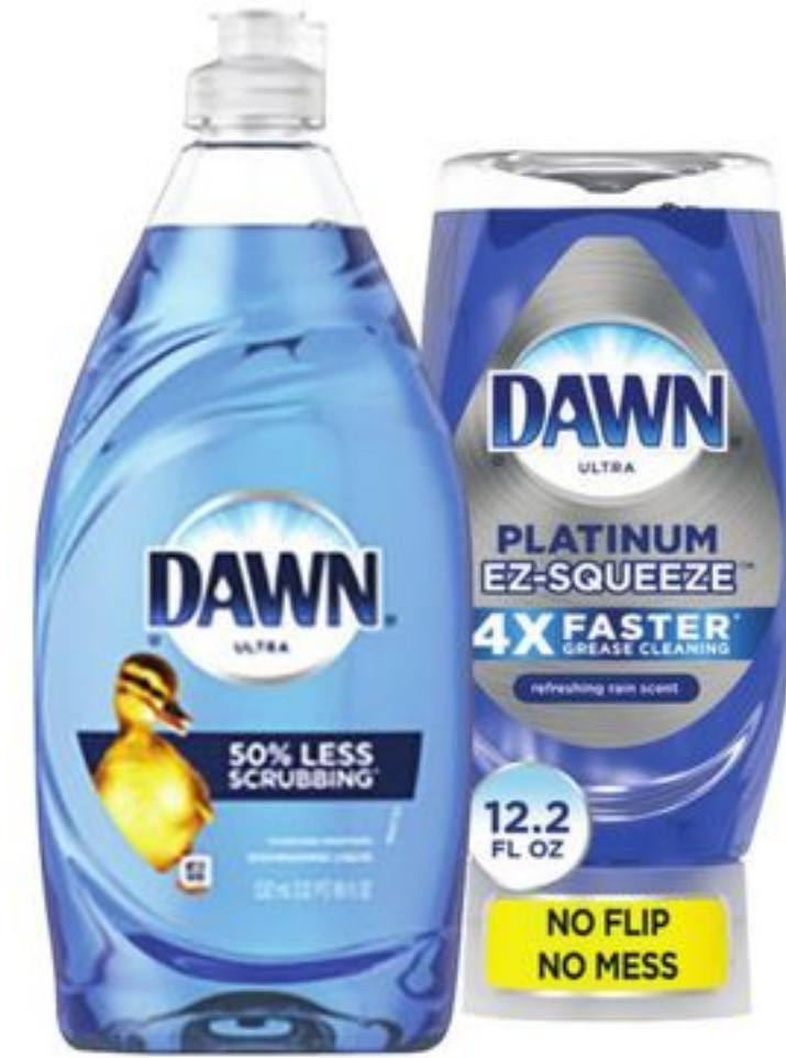
Dawn 14.6 to 18-oz or EZ-Squeeze Dish Detergent 12.2 to 14.7-oz, select varieties