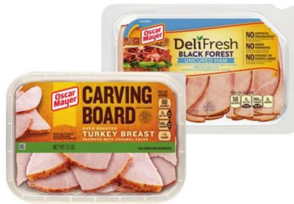
Oscar Mayer Deli Fresh or Carving Board Lunchmeat 7 to 9-oz, select varieties