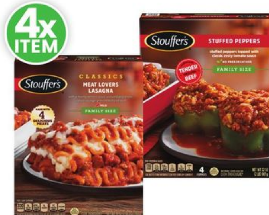
Stouffer's Family Size Entrees 30 to 38-oz, select varieties