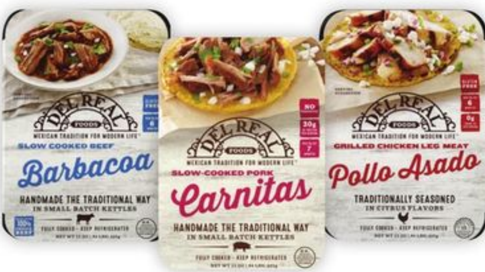
Del Real Foods Dinner Entrées 15-oz, select varieties