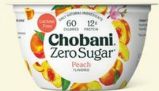
Chobani® Zero Sugar** Greek Yogurt 5.3-oz, select varieties