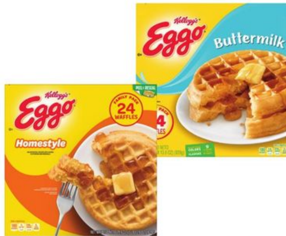
Kellogg's Family Pack Eggo Waffles 24-ct, select varieties