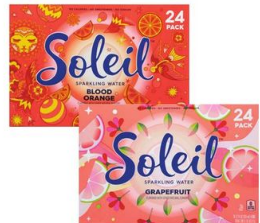
Soleil Sparkling Water 24-Pack, 12-oz Cans, select varieties