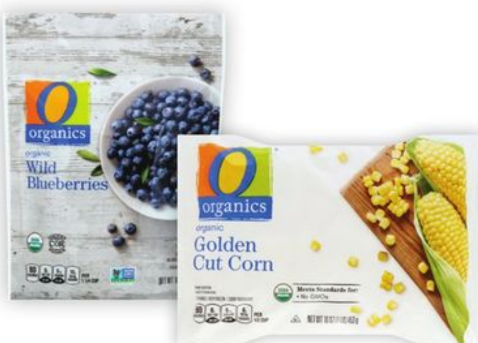
O Organics® Organic Vegetables 10 to 16-oz or Fruit 10-oz, select varieties