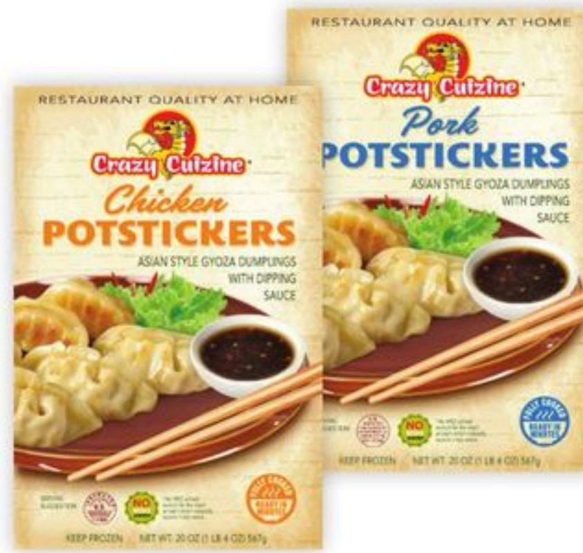
Crazy Cuzine Potstickers 20-oz Chicken or Pork