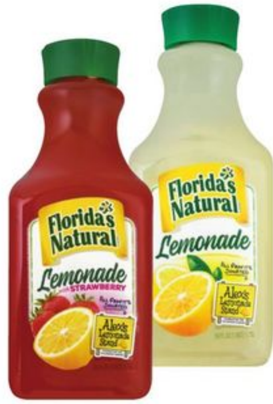
Florida's Natural Natural Lemonade 59-oz Chilled, select varieties