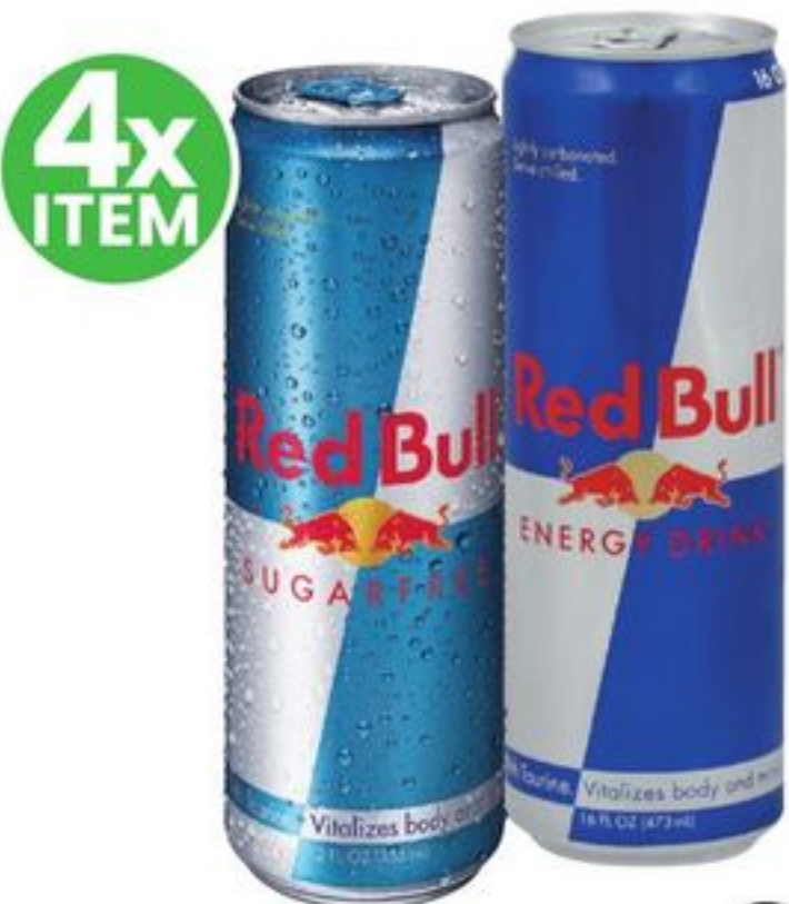
4x ITEM Red Bull Energy Drink 16-oz, select varieties