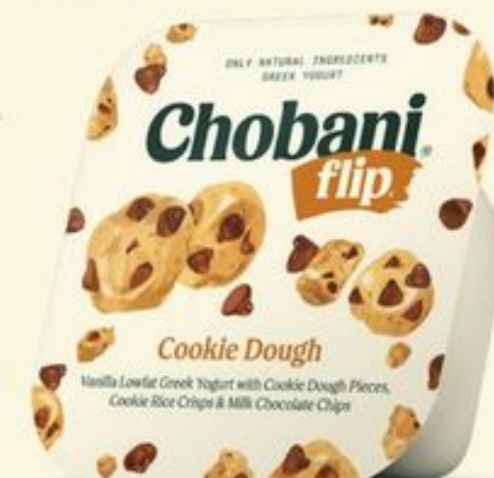
Chobani® Flip® Greek Yogurt 4.5-oz, select varieties