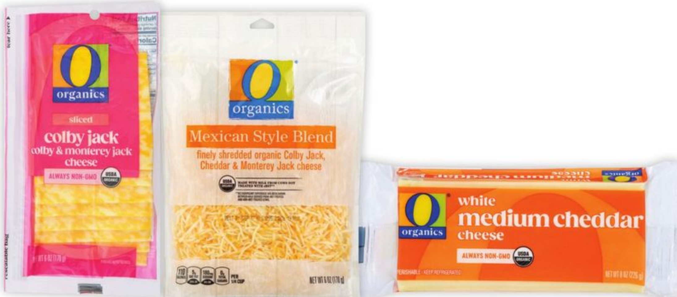
O Organic® Slided, Shredded or Chunk Cheese 6 to 8-oz, select varieties