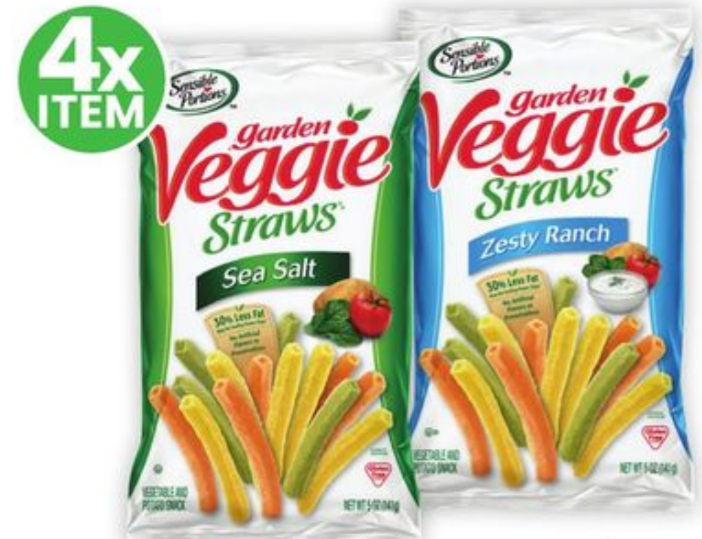
Sensible Portions Garden Veggie Straws 4.25 to 5-oz, select varieties