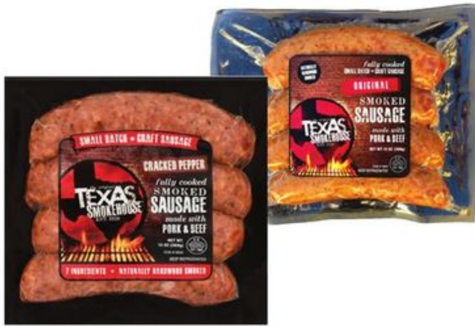
Texas Smokehouse Links 13-oz, select varieties