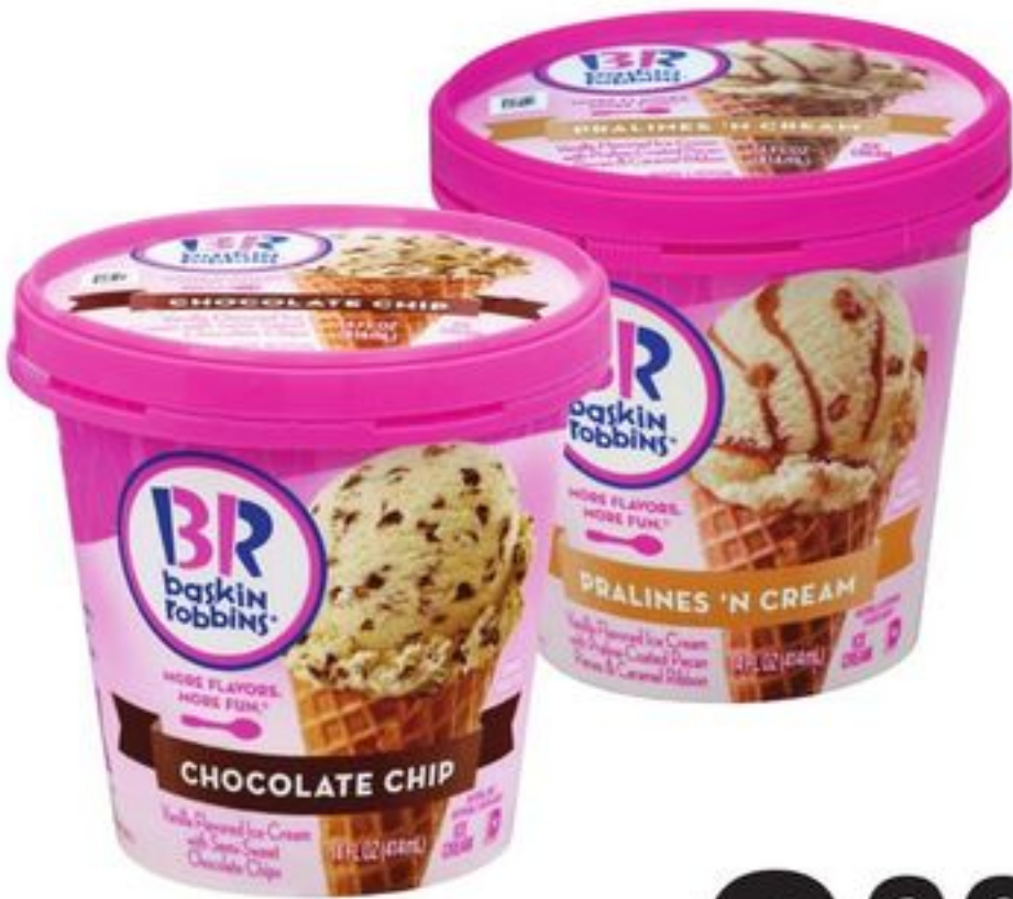
Baskin Robbins Ice Cream 14-oz, select varieties