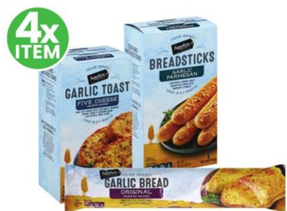
Signature SELECT® Garlic Toast or Bread 11 to 16-oz, Breadsticks 6 to 8-ct, select varieties