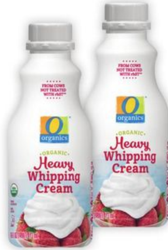
O Organics® Organic Heavy Whipping Cream 16-oz