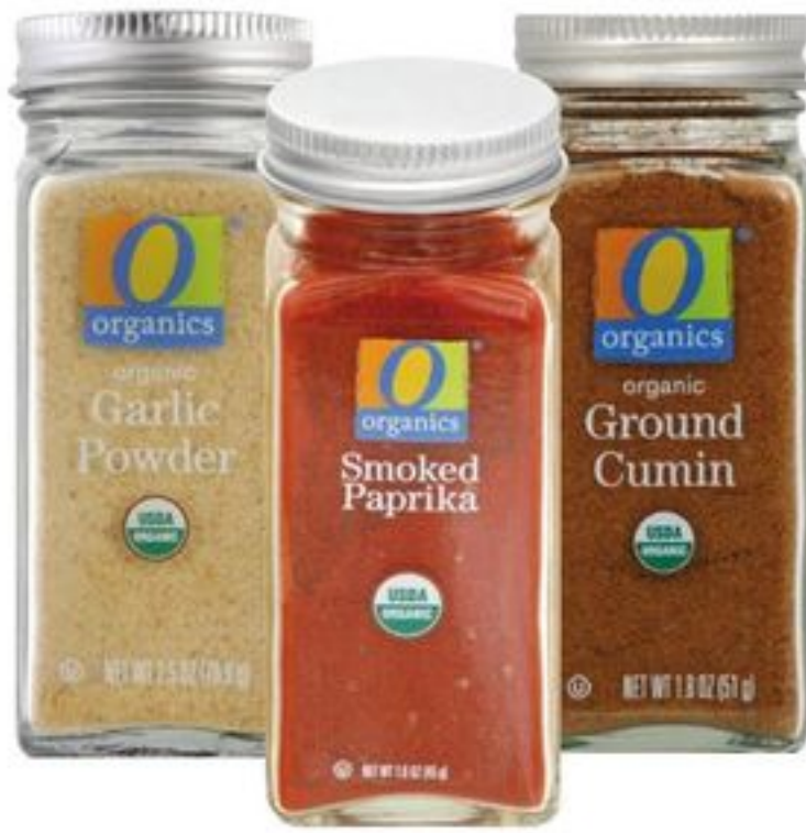
Mix & Match O Organics® Organic Spices 0.6 to 2.5-oz, select varieties

BUY 2 GET 1 FREE EQUAL OR LESSER VALUE Member Price