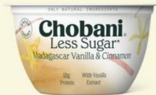
Chobani® Less Sugar* Greek Yogurt 5.3-oz, select varieties