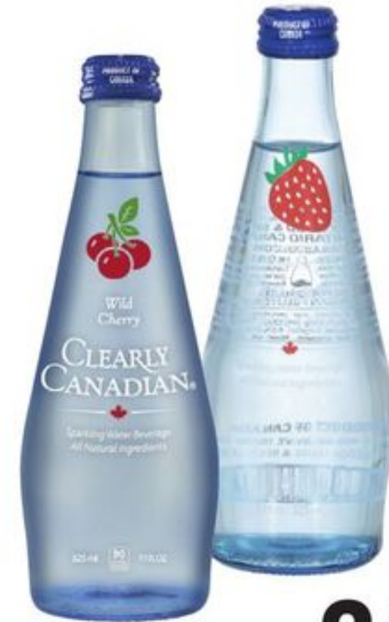
Clearly Canadian Sparkling Water 11-oz, select varieties