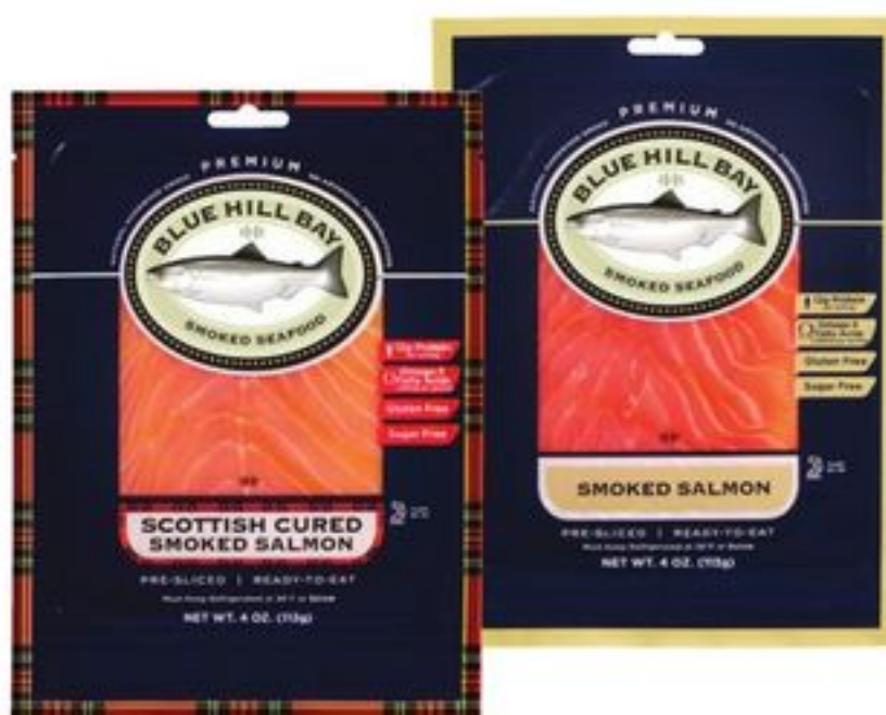
Blue Hill Bay Smoked Salmon 4-oz, select varieties