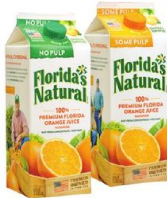
Florida's Natural 100% Premium Orange Juice from Concentrate 52 to 59-oz Chilled, select varieties