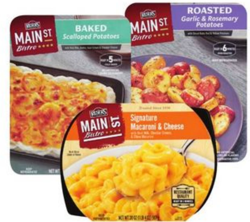
Reser's Main St. Bistro Baked, Roasted or Signature Side Dishes 17 to 32-oz, select varieties