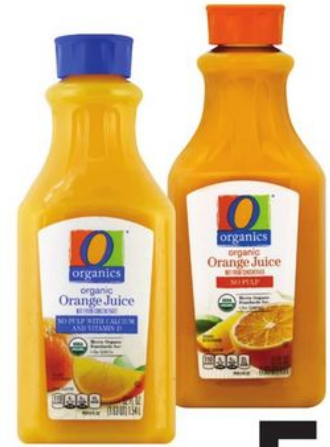
O Organics® Organic Orange Juice 52-oz Chilled, select varieties

BUY 2 GET 1 FREE EQUAL OR LESSER VALUE Member Price