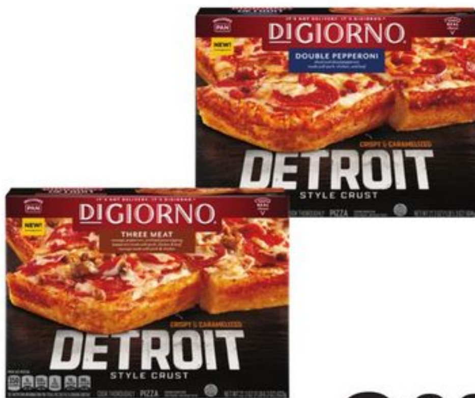
DiGiorno Detroit Style Pizza 21.3 to 25-oz, select varieties