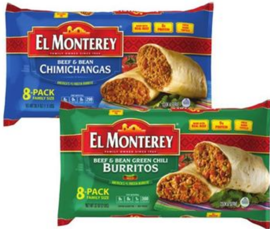
El Monterey Family Pack Burritos or Chimichangas 8-ct, select varieties