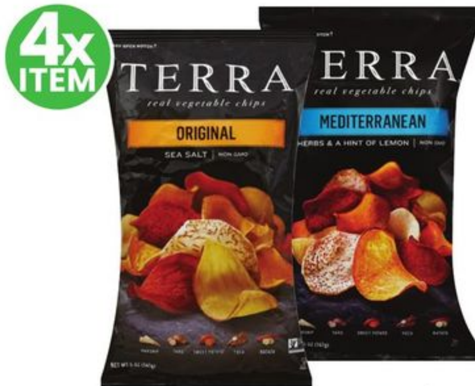
Terra Real Vegetable Chips 5-oz, select varieties