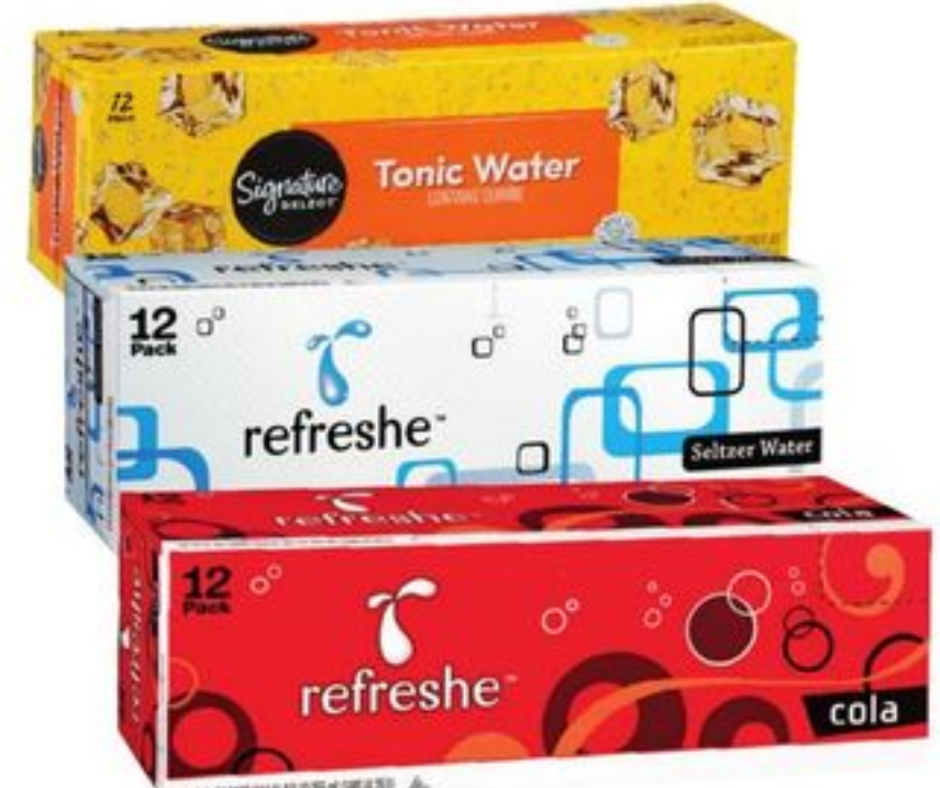
Signature SELECT® Soda, Seltzer Water or Mixers 12-Pack, 12-oz Cans, select varieties