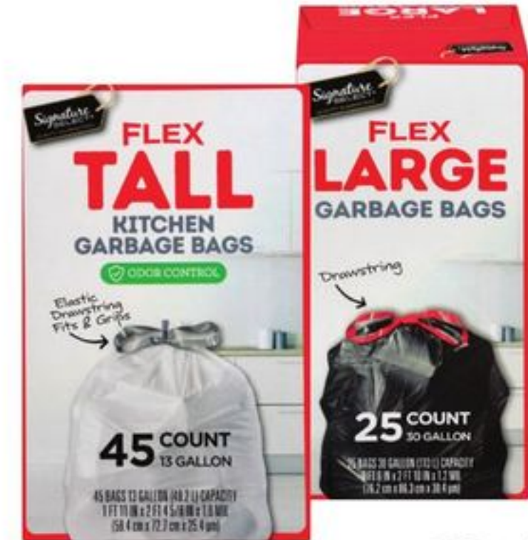
Signature SELECT® Garbage Bags 18 to 45-ct, select varieties