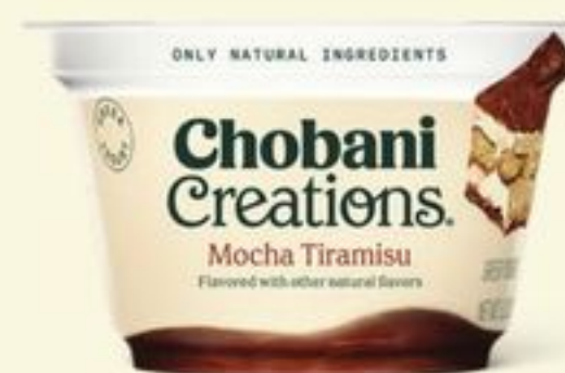
Chobani Creations® Greek Yogurt 5.3-oz, select varieties