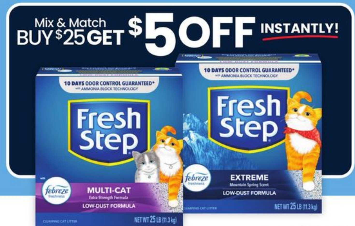
Fresh Step Cat Litter 22.5 to 25-lbs, select varieties