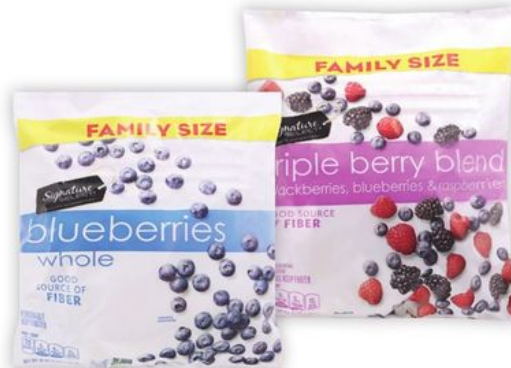
Signature SELECT® Family Size Fruit 40 to 48-oz, select varieties