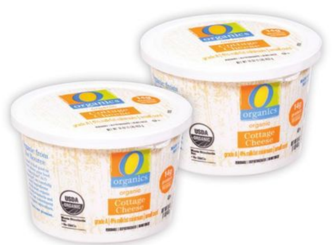
O Organics® Organic Cottage Cheese 16-oz