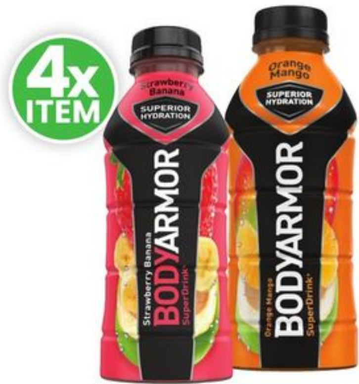
4x ITEM BodyArmor SuperDrink 16-oz Bottle, select varieties

Signature SELECT® Soda, Seltzer Water or Mixers 2-Liters, select varieties 10$10 for Member Price