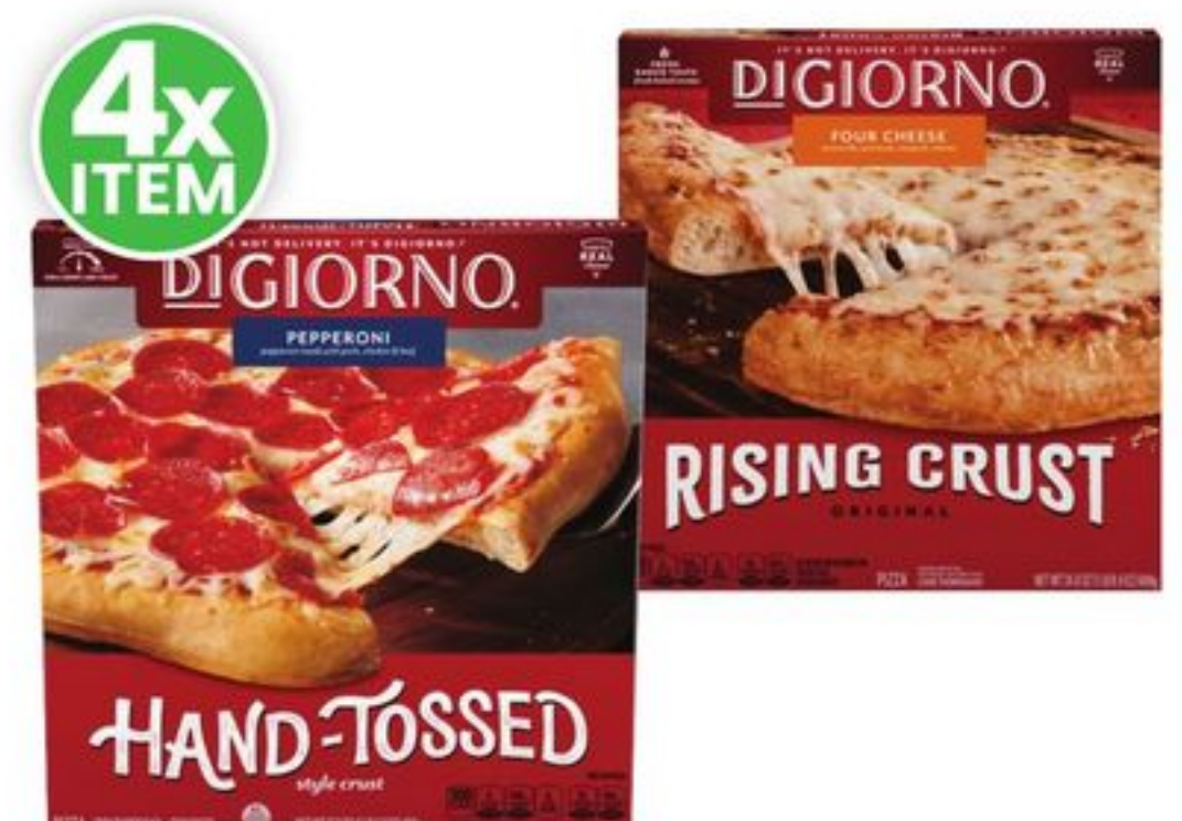
DiGiorno Rising Crust, Hand-Tossed or Thin Crust Pizza 16.9 to 29.3-oz, select varieties