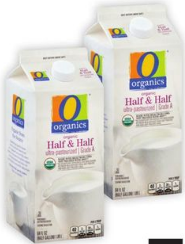
O Organics® Organic Half & Half 64-oz