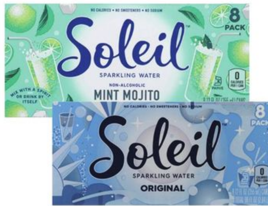
Soleil Original or Mocktails Sparkling Water 8-Pack, 12-oz Cans, select varieties