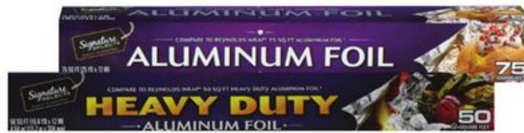
Signature SELECT® Aluminum Foil 50-sq ft or 75-sq ft