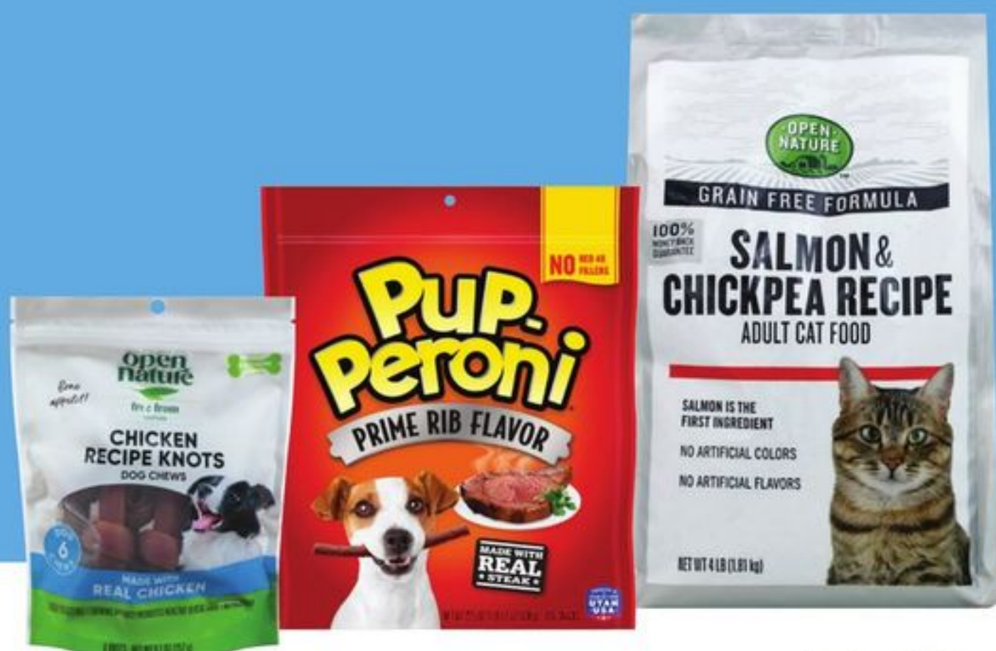
Pup-Peroni Dog Treats 22.5-oz, Open Nature® Dog Treats 12-oz or Cat Food 4-lbs, select varieties