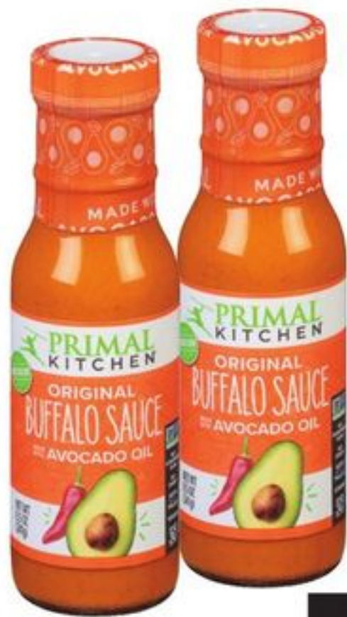
Primal Kitchen Buffalo Sauce 8.5-oz