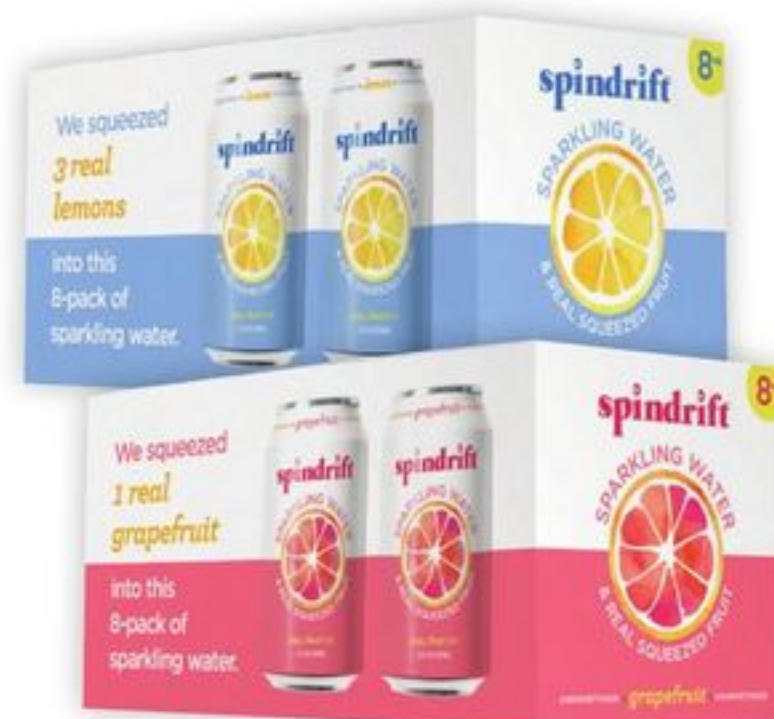
Spindrift Sparkling Water 8-Pack, 12-oz Cans, select varieties