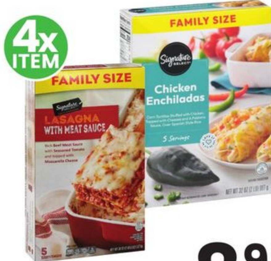
Signature SELECT® Family Size Entrees 32 to 40-oz, select varieties