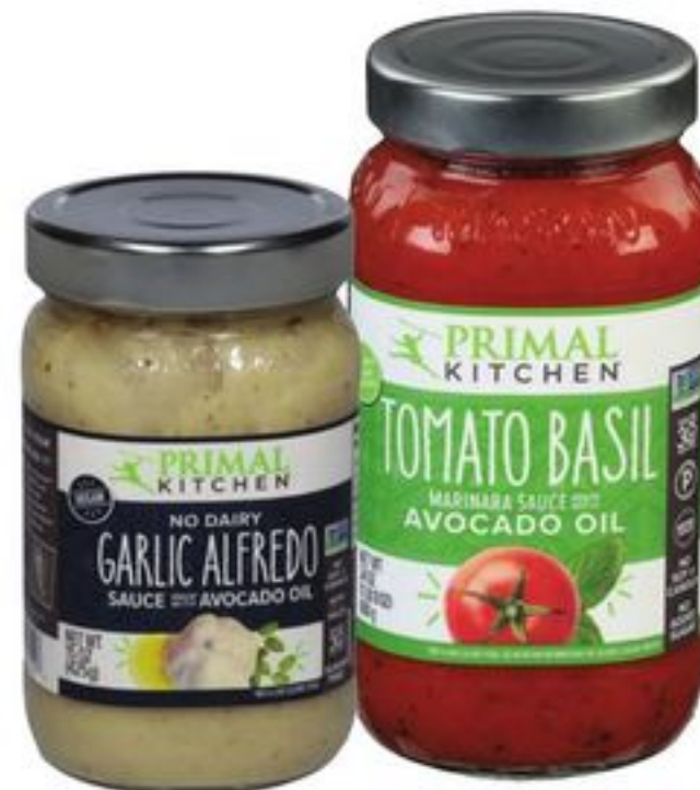
Primal Kitchen Marinara or Alfredo Sauce 15 to 24-oz, select varieties