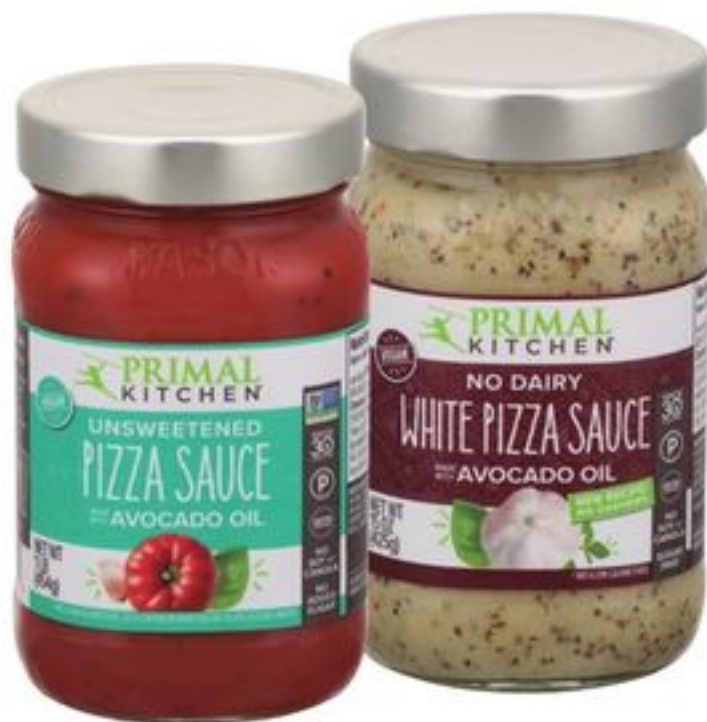
Primal Kitchen Pizza Sauce 15.5 to 16-oz, select varieties