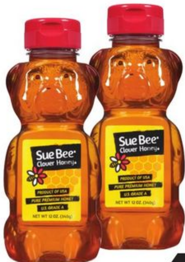
Sue Bee Clover Honey 12-oz