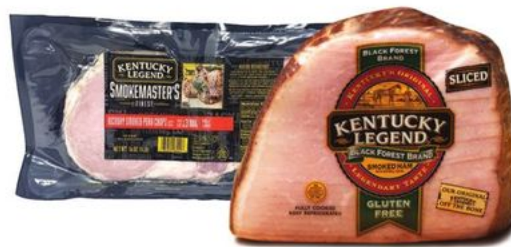
Kentucky Legend Pork Chops 16-oz or Black Forest Ham Sold by the lb, select varieties