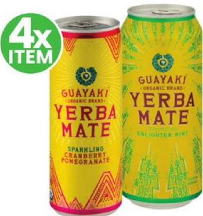
4x ITEM Guayaki Organic Original 15.5-oz or Sparkling Yerba Mate 12-oz Can, select varieties