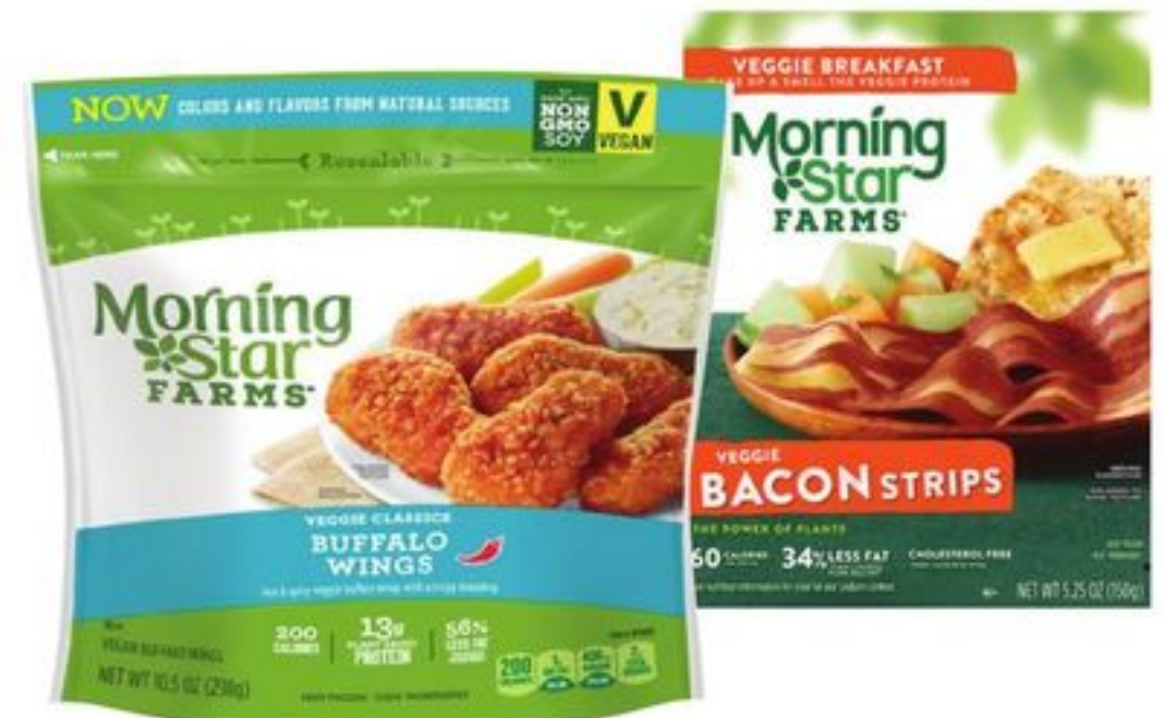
MorningStar Farms Veggie Products 5.25 to 10.5-oz, select varieties