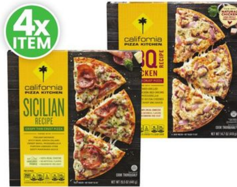
California Pizza Kitchen Pizza 13.4 to 15.5-oz, select varieties