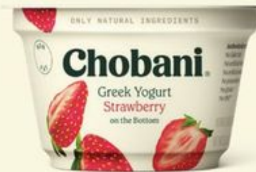
Chobani® Greek Yogurt 5.3-oz, select varieties