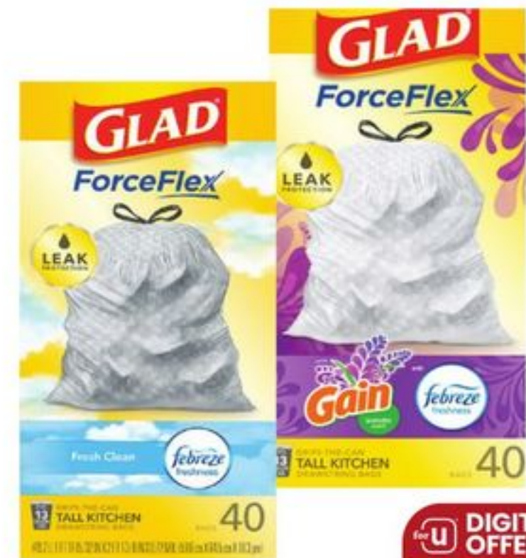
Glad Tall Kitchen Drawstring Bags 25 to 40-ct, select varieties