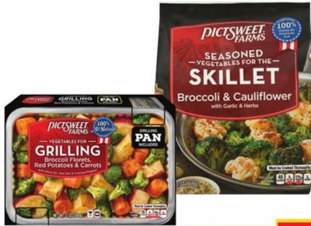
Mix & Match PictSweet Farms Grilling or Skillet Vegetables 11 to 18-oz, select varieties

BUY 1 GET FREE EQUAL OR LESSER VALUE Member Price