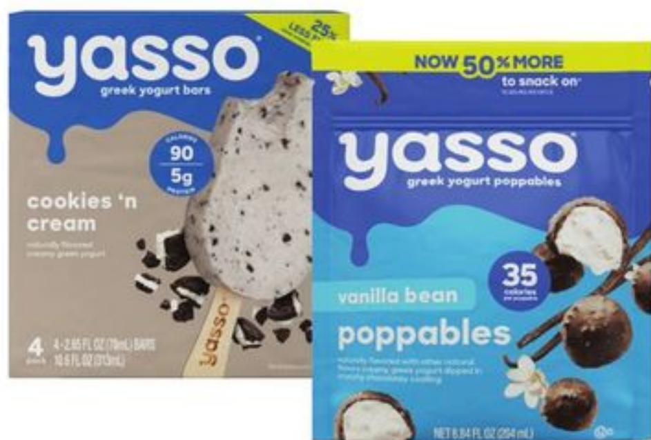
Yasso Greek Yogurt Poppables 12-ct or Bars 4-ct, select varieties