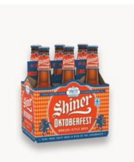
Shiner Oktoberfest 6 pk, 12 oz 9.99