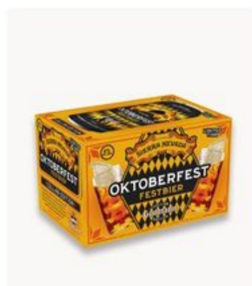
Sierra Nevada Oktoberfest 6 pk, 12 oz 8.99