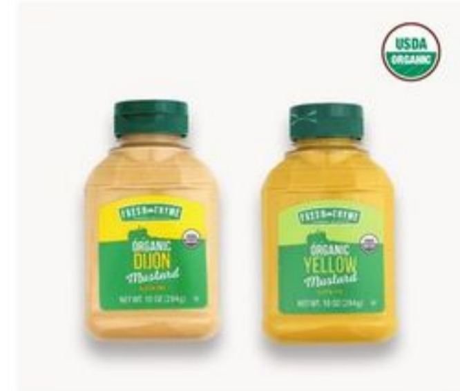
Fresh Thyme Organic Mustard 10 oz 2/$4