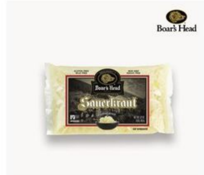
Boar's Head Sauerkraut 16 oz 2.99