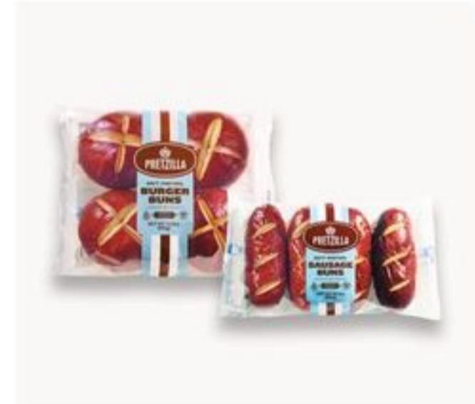
Pretzella Bun or Rolls 8.4-12.8 oz 4.99