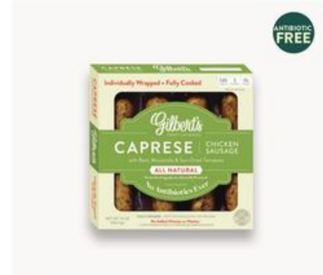
Gilbert's Antibiotic-Free Chicken Sausage 10 oz 6.99