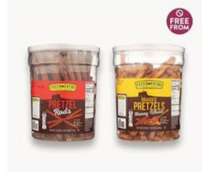
Fresh Thyme Pretzel Tubs 24-26 oz 5.99