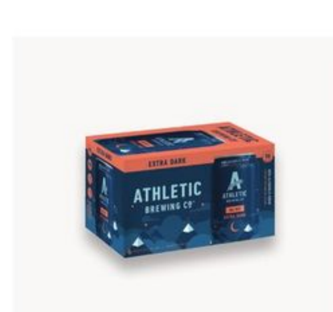
Athletic Brewing Seasonal Beer 6 pk, 12 oz 9.99