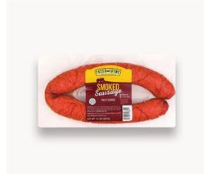
Fresh Thyme Smoked Sausage 14 oz, all varieties 4.99