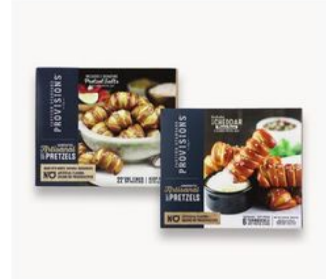
Eastern Standard Provisions Frozen Pretzels 5.25-13.3 oz 5.49