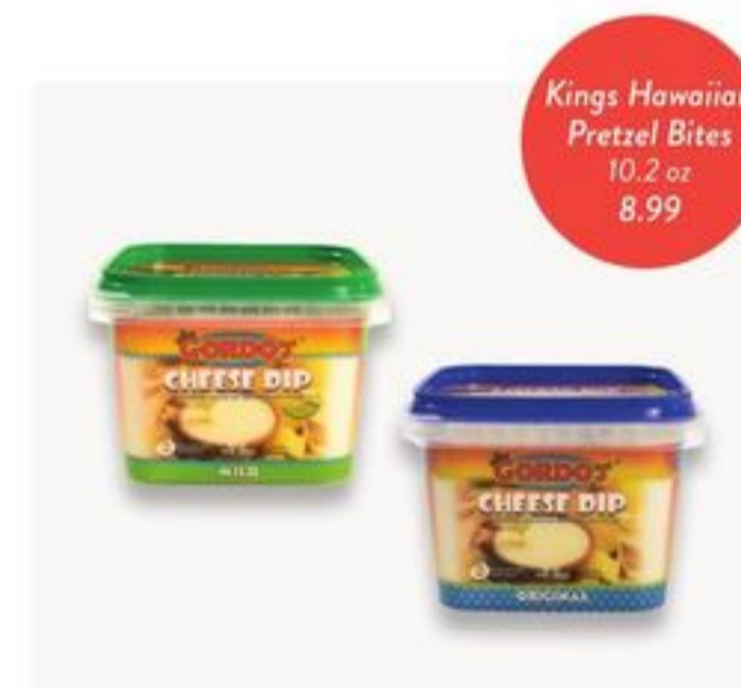
Gordos Dip Homestyle Queso, Original, Mild Cheese Dip 16 oz 5.99