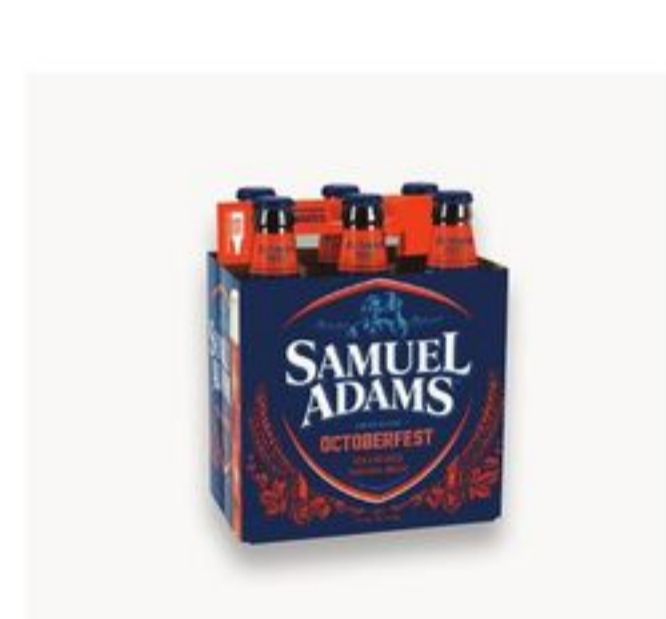
Sam Adams Seasonal Beer 6 pk, 12 oz 8.99