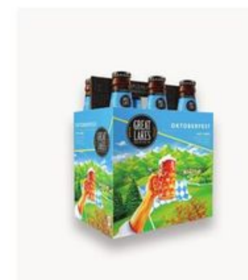
Great Lakes Seasonal Beer 6 pk, 12 oz 9.99