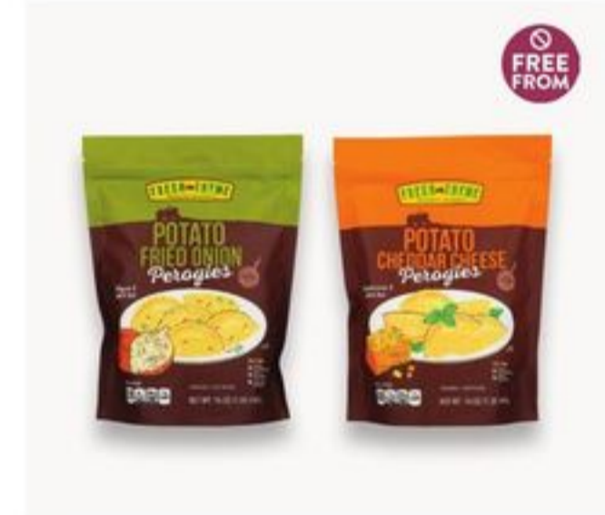
Fresh Thyme Frozen Perogies 16 oz 3.99