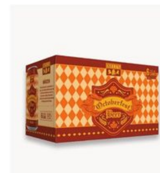
Bell's Seasonal Cans 6 pk, 12 oz 10.99