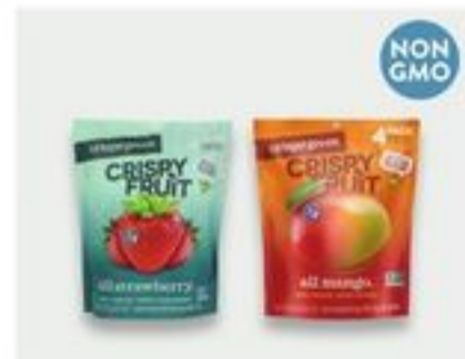
Crispy Green Freeze-Dried Fruit 6.99 4 pk, 1.69-3.39 oz