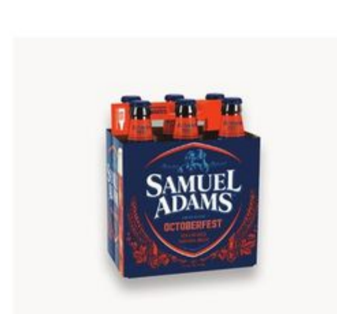
Sam Adams Seasonal Beer 6 pk, 12 oz 8.99