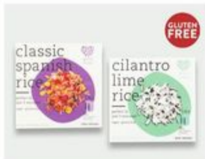
Grain Trust Frozen Rice 4.49 20-30 oz