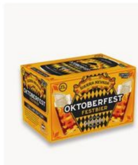
Sierra Nevada Oktoberfest 6 pk, 12 oz 8.99