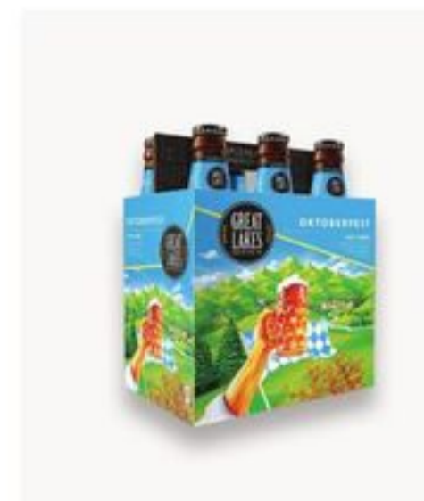
Great Lakes Seasonal Beer 6 pk, 12 oz 9.99