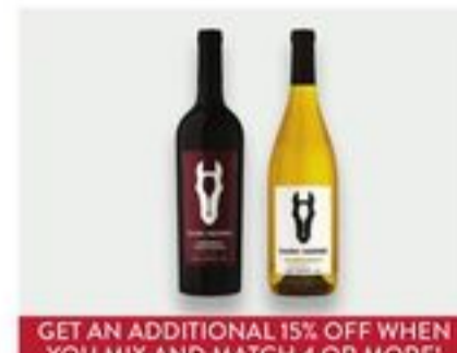
Dark Horse Wine 7.99 GET AN ADDITIONAL 15% OFF WHEN YOU MIX AND MATCH 4 OR MORE! select varieties, 750 ml