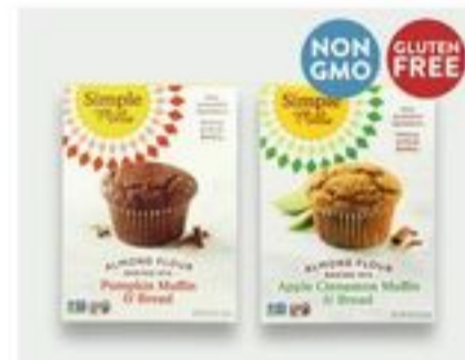
Simple Mills Baking Mixes 6.99 9-12.9 oz