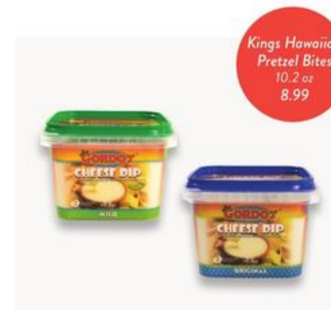
Gordos Dip Homestyle Queso, Original, Mild Cheese Dip 16 oz 5.99