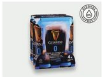
Guinness Zero Draught 7.99 4pk, 14.9 oz