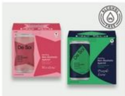
De Soi Non-Alcoholic Mocktails 12.99 select varieties, 4 pk