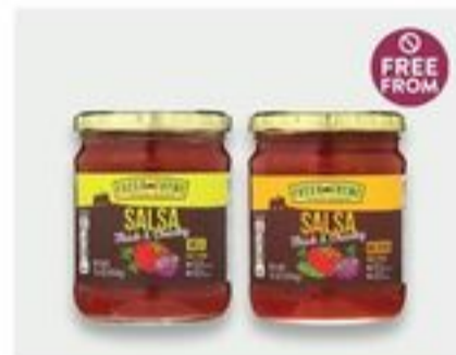
Fresh Thyme Salsa 2.99 16 oz everyday low price