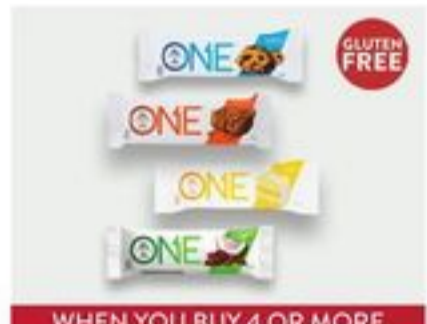
ONE Energy Bars 4/8 60 grams