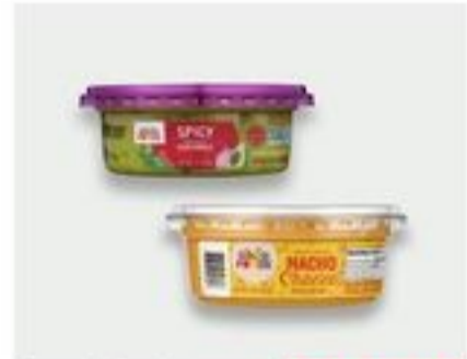
Good Foods Guacamole or Chip Dip Select Varieties. BOGO buy one get one free. Resers Tortilla Yellow Chip 16 oz. $3.99