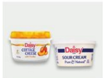
Daisy Cottage Cheese with Fruit or Sour Cream 2/3 6 or 8 oz