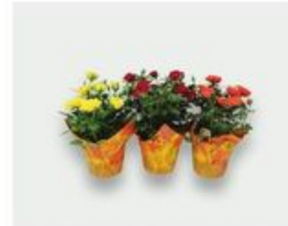
4" Mini Rose in Pot Cover 4.99