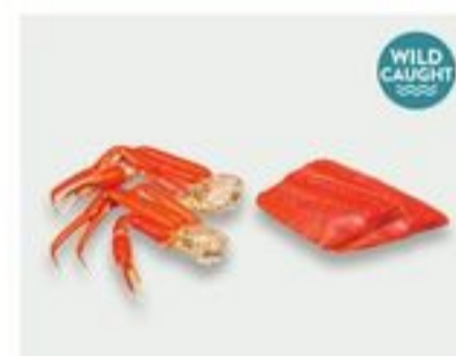
Jumbo Snow Crab Clusters or Sockeye Salmon Fillet 7.99LB previously frozen