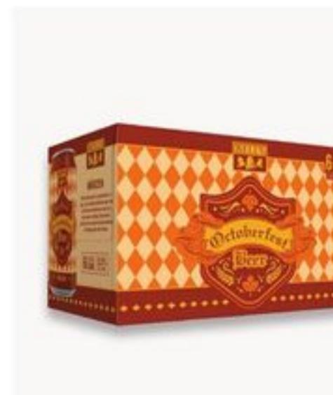
Bell's Seasonal Cans 6 pk, 12 oz 10.99