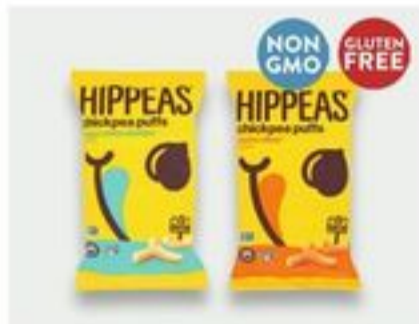
Hippeas Chickpea Puffs 2/6 4 oz