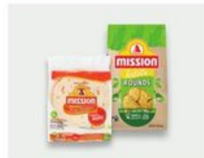
Mission Tortillas or Chips 20% OFF 8-22.5 oz