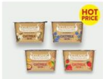
Icelandic Provisions Oatmilk Skyr 2/3 5 oz