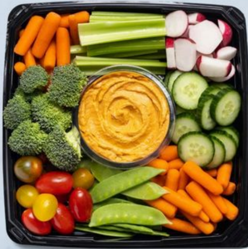
Vegetable & Hummus Snack Square Baby Carrots, Broccoli Florets, Snacking Medley Tomatoes, Radish, Cucumbers, Sugar Snap Peas, Hummus Red Pepper, Celery Sticks Serves 8-10