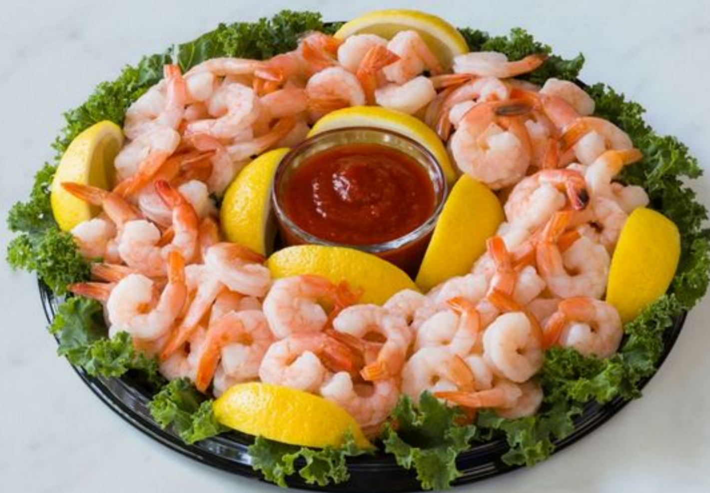
Cooked Shrimp Tray Cooked Shrimp, Cocktail Sauce, Lemons, Kale 12" serves 12-14