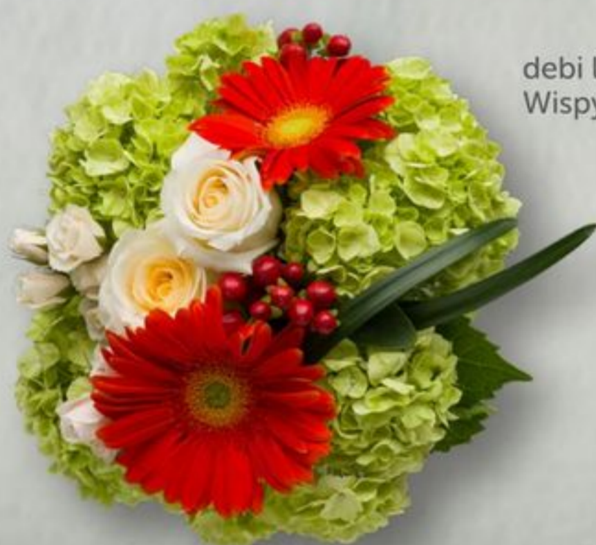
debi lilly™ Wispy Rose