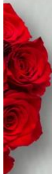
debi lilly™ Red Rose