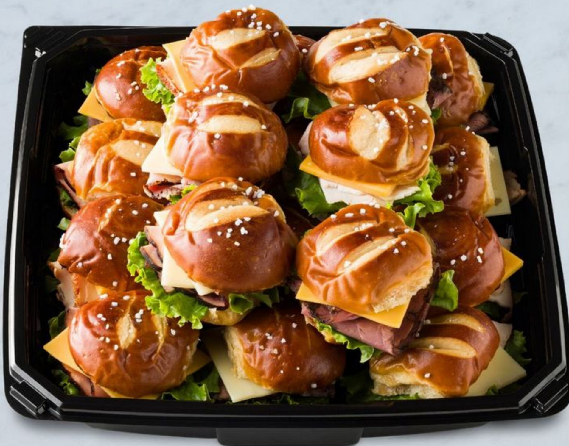
Pretzel Roll Slider Snack Square Pretzel Sliders, Pan Roasted Turkey, Black Forest Ham, Roast Beef, Lettuce, Swiss Cheese, American Cheese, Cheddar Cheese Serves 8-10