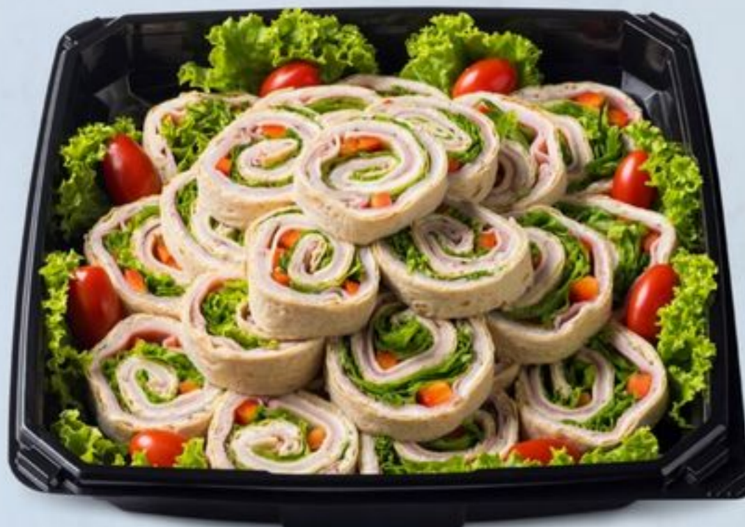
Hye Roller/Pinwheel Snack Square Tortilla, Provolone Cheese, Pan Roasted Turkey, Black Forest Ham, Rondel Garlic & Herb Spread, Lettuce, Red Bell Pepper, Snacking Medley Tomatoes Serves 8-10