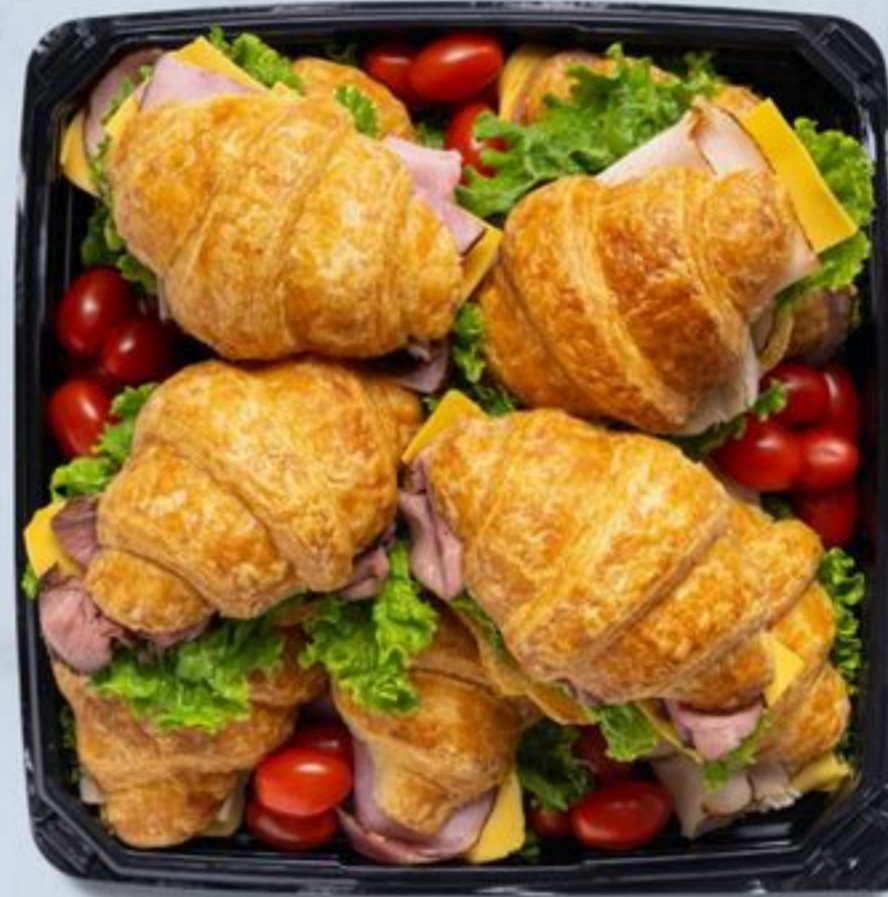
Mini Croissant Snack Square Lettuce, Pan Roasted Turkey, Black Forest Ham, Roast Beef, American Cheese, Snacking Medley Tomatoes Serves 8-10