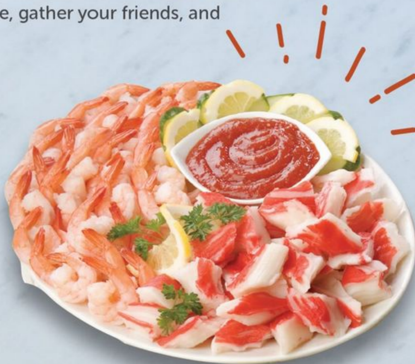
Shrimp and Krab Party Tray 2 lbs cooked shrimp 2 lbs imitation crab flakes cocktail sauce and lemons 12" serves 12-14

Entertaining should be as easy as it is enjoyable. Let us do the hard work—so you can set a beautiful table, gather your friends, and simply dig in.