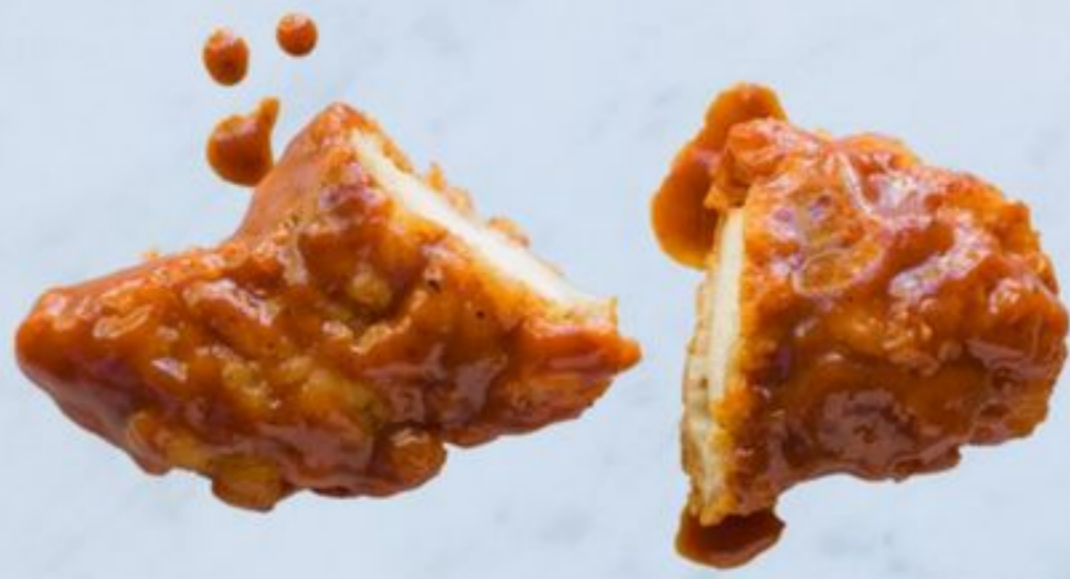
Hot Wings Snack Square Tyson Buffalo Wings, Ranch Dip, Lettuce, Celery Sticks Serves 8-10