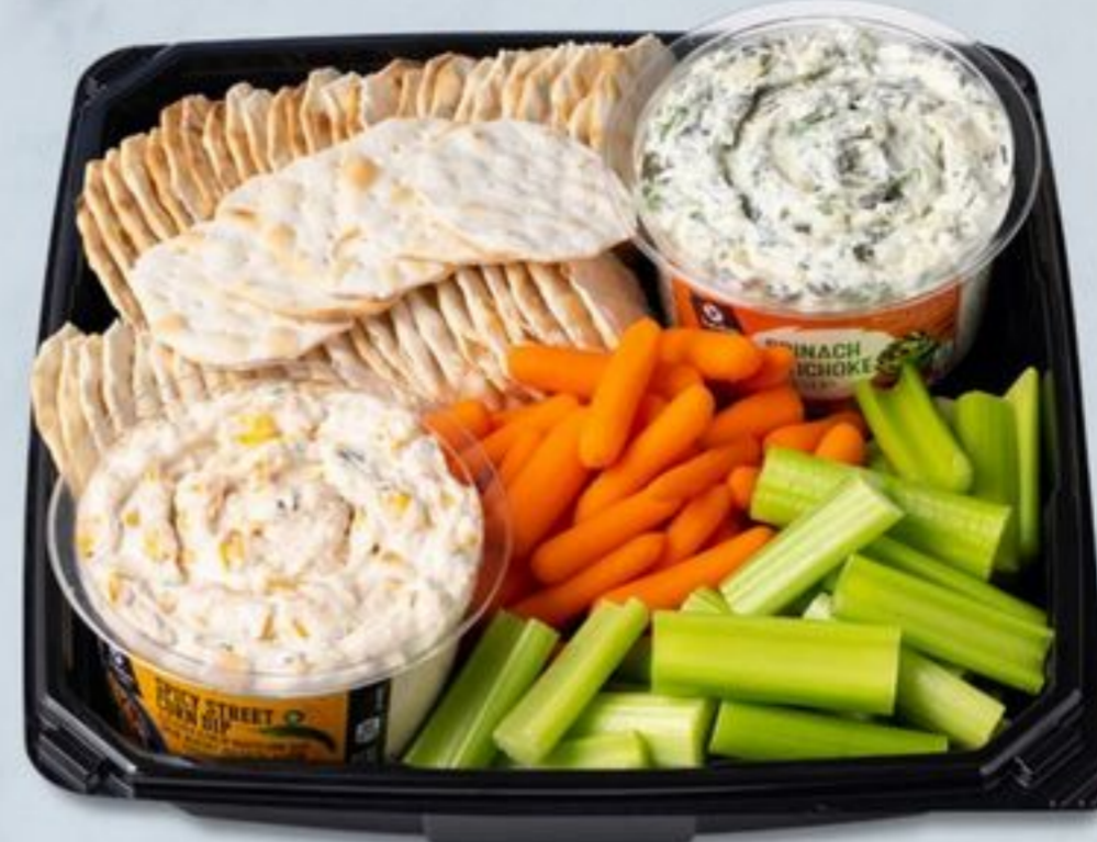
Dip & Veggy Snack Square Spinach Artichoke Dip, Spicy Street Corn Dip, Water Crackers, Carrots, Celery Sticks Serves 8-10