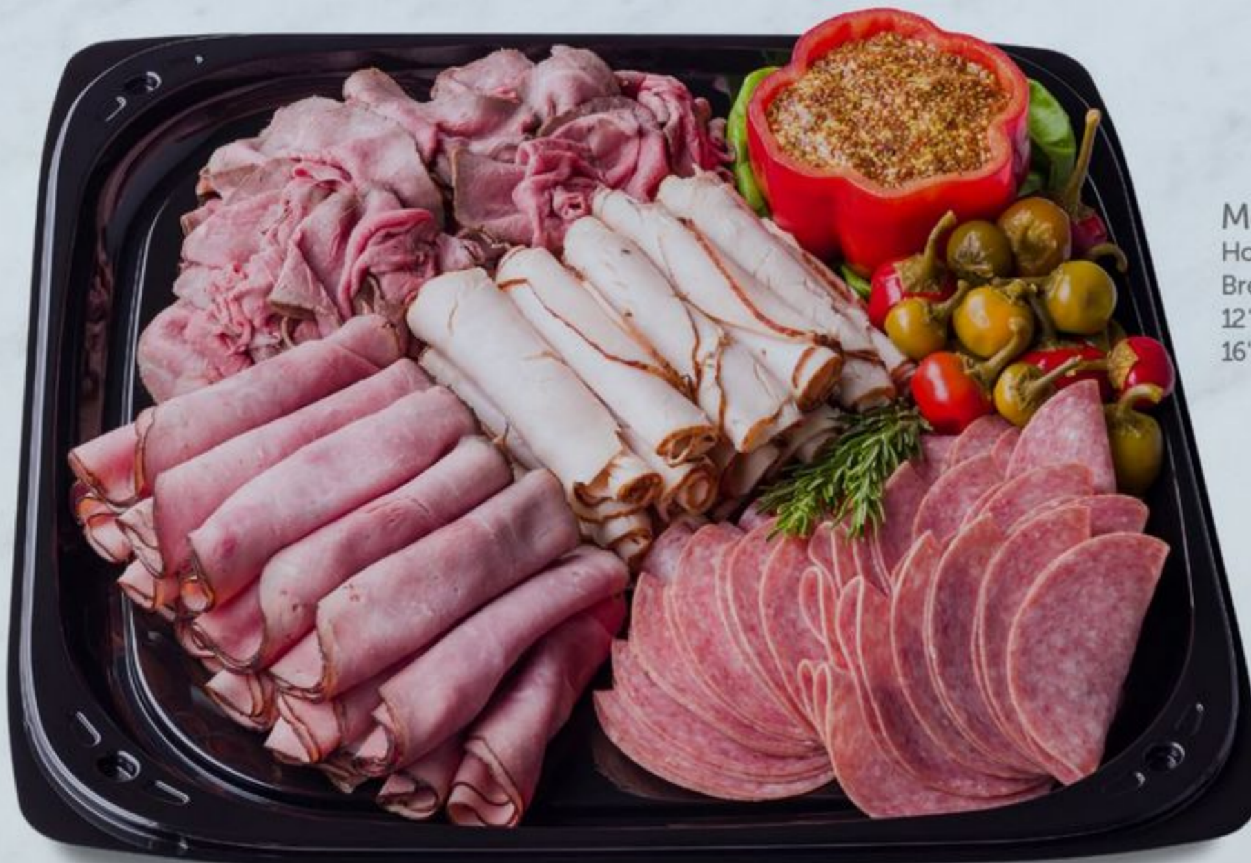
Meat Lover's Tray Honey Ham, Roast Beef, Premium Turkey Breast, Pepper Turkey, Genoa Salami 12" serves 12-16 16" serves 20-25