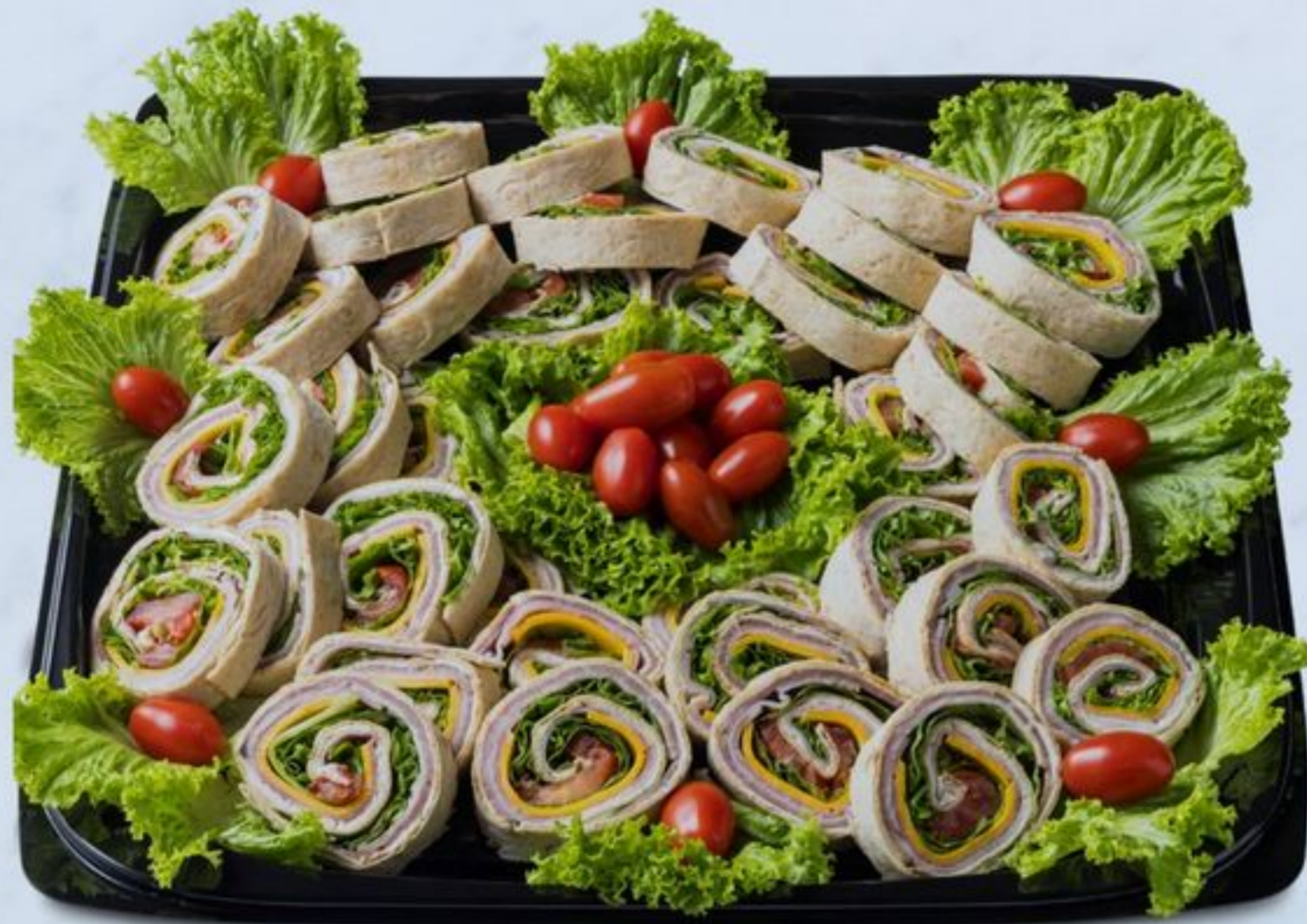
Pinwheel Sandwich Tray Tortilla, Honey Ham, Roast Beef, Premium Turkey Breast, Medium Cheddar, Garlic Herb Cheese Spread with Tomato, Lettuce garnish 16" Serve 12-16 18" Serves 16-18