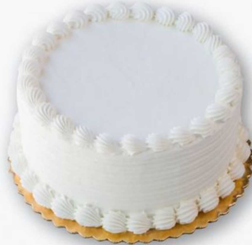
Double Layer Serves 8-10 people