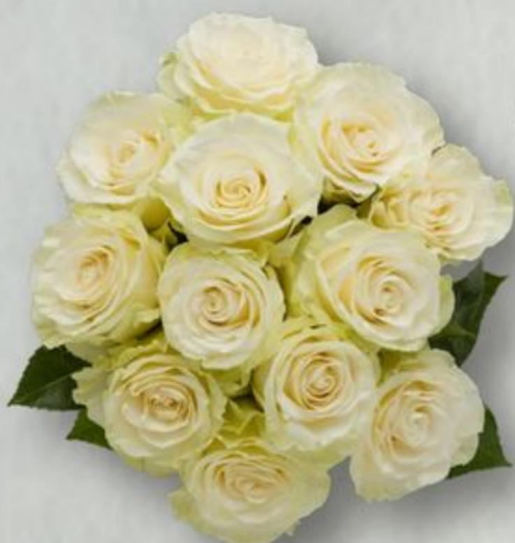
debi lilly™ White Rose