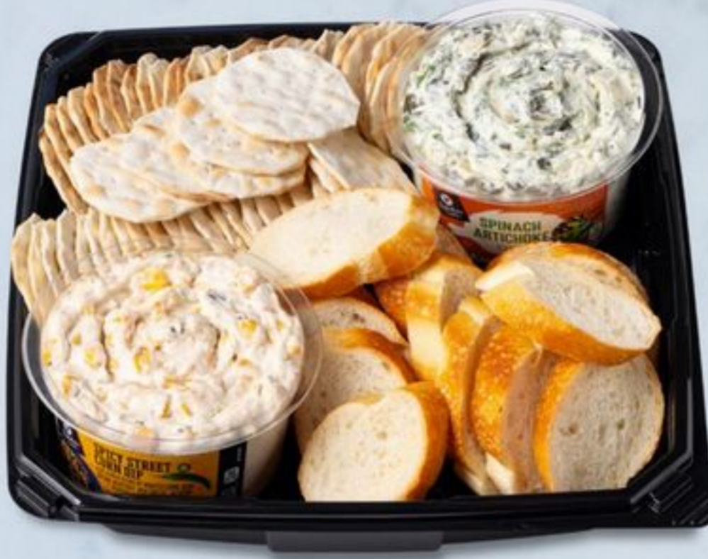
Dip & Cracker Snack Square Spinach Artichoke Dip, Spicy Street Corn Dip, Water Crackers, Baguette - Sliced Serves 8-10