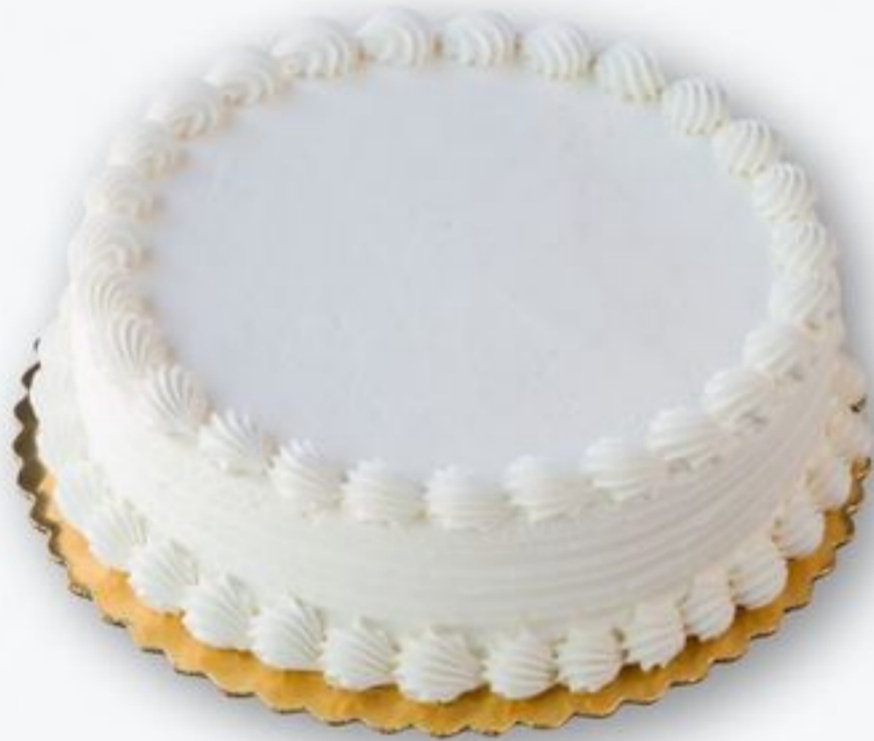
Single Layer Serves 6-8 people