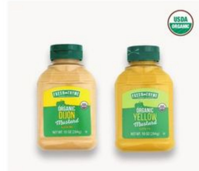
Fresh Thyme Organic Mustard 10 oz 2/$4