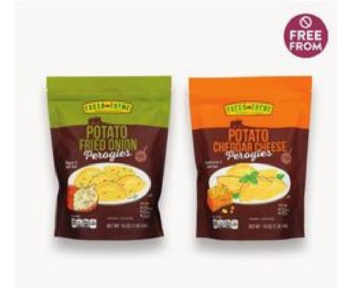
Fresh Thyme Frozen Perogies 16 oz 3.99