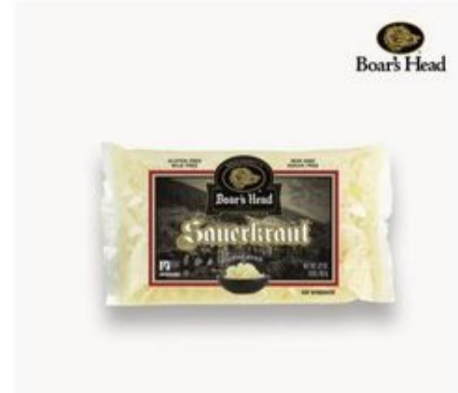
Boar's Head Sauerkraut 16 oz. 2.99