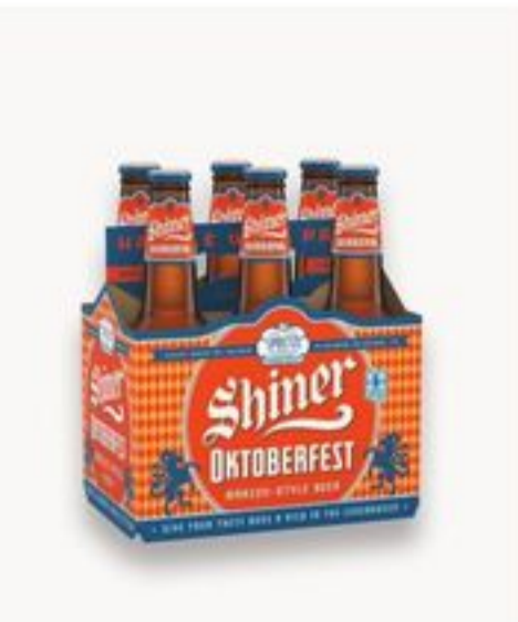
Shiner Oktoberfest 6 pk, 12 oz 9.99