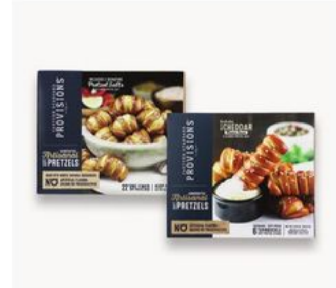
Eastern Standard Provisions Frozen Pretzels 5.25-13.3 oz 5.49