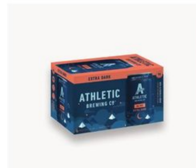
Athletic Brewing Seasonal Beer 6 pk, 12 oz 10.99