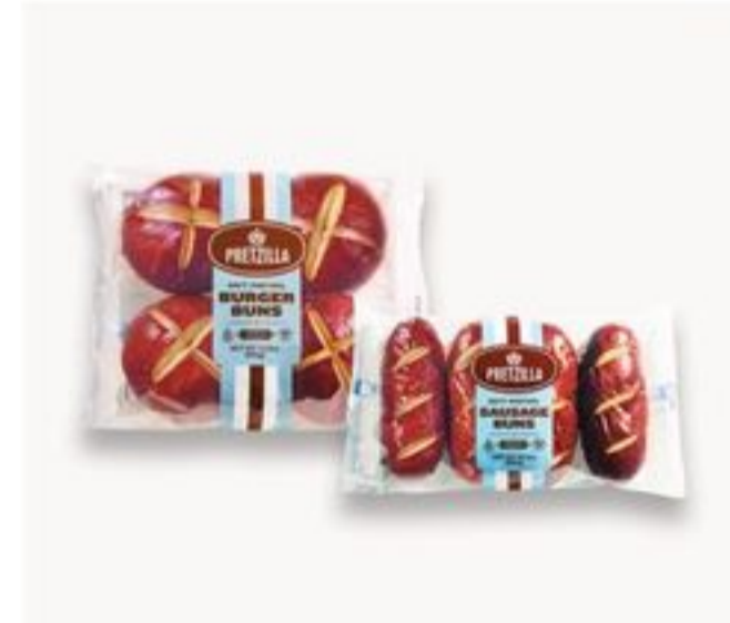
Pretzella Bun or Rolls 8.4-12.8 oz 4.99