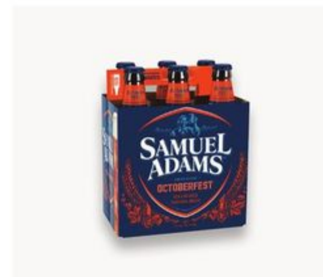
Sam Adams Seasonal Beer 6 pk, 12 oz 10.99