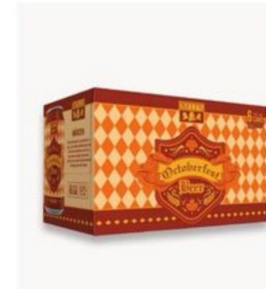
Bell's Seasonal Cans 6 pk, 12 oz 9.99