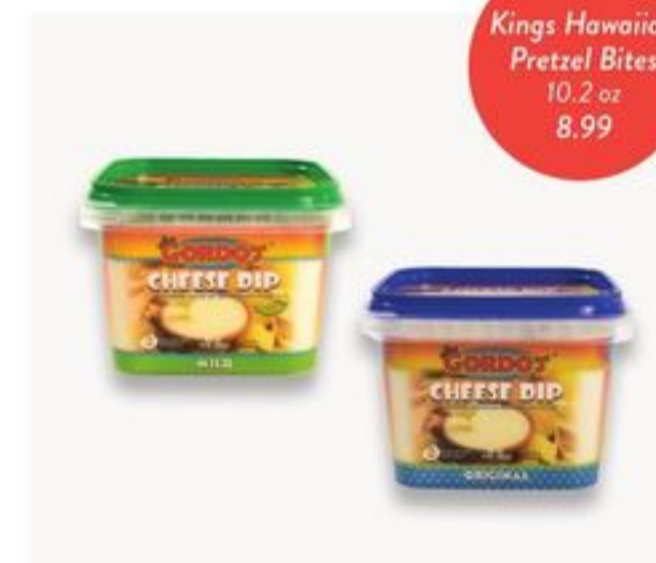
Gordos Dip Homestyle Queso, Original, Mild Cheese Dip 16 oz 5.99