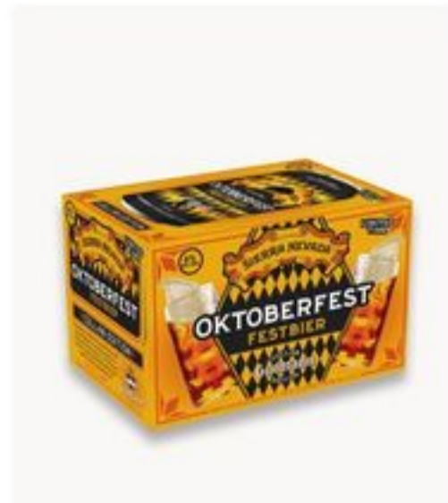
Sierra Nevada Oktoberfest 6 pk, 12 oz 10.99