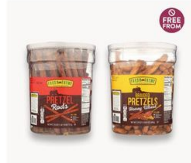
Fresh Thyme Pretzel Tubs 24-26 oz 5.99