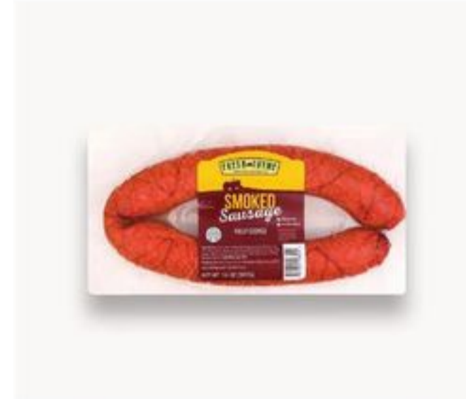
Fresh Thyme Smoked Sausage 14 oz, all varieties 4.99