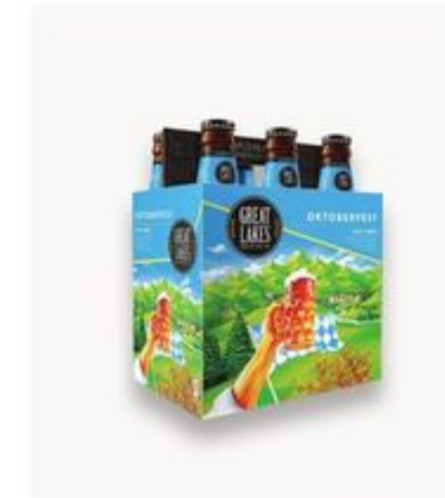
Great Lakes Seasonal Beer 6 pk, 12 oz 10.99