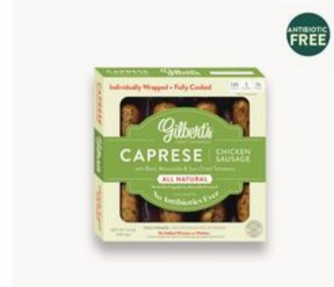
Gilbert's Antibiotic-Free Chicken Sausage 10 oz 6.99