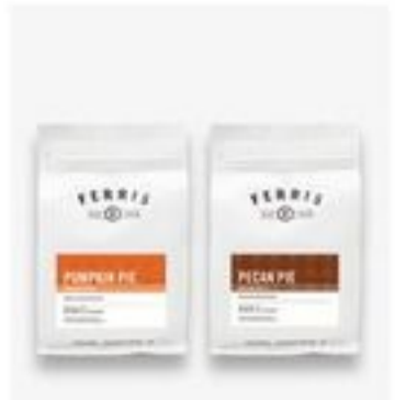
Ferris Pumpkin or Pecan Coffee 12 oz