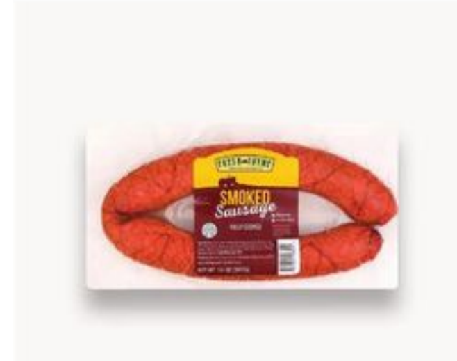
Fresh Thyme Smoked Sausage 14 oz, all varieties