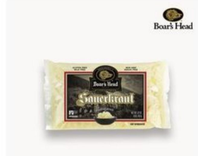
Boar's Head Sauerkraut 16 oz.