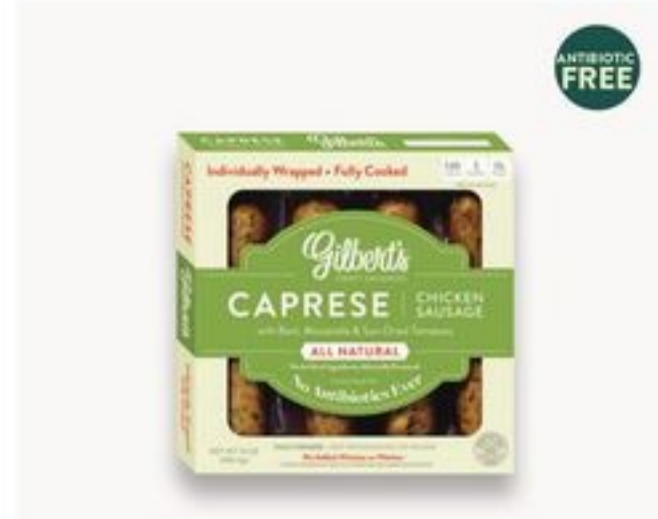
Gilbert's Antibiotic-Free Chicken Sausage 10 oz