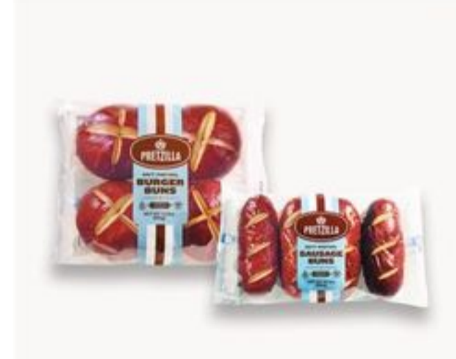
Pretzella Bun or Rolls 8.4-12.8 oz