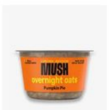
Mush Overnight Pumpkin Pie Oats 5 oz