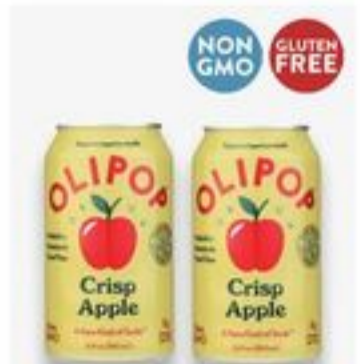
Olipop Prebiotic Crisp Apple Soda 12 oz