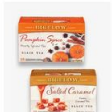
Bigelow Tea 18-20 ct