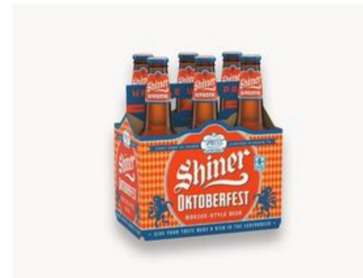
Shiner Oktoberfest 6 pk, 12 oz

Kings Hawaiian Pretzel Bites 10.2 oz 8.99