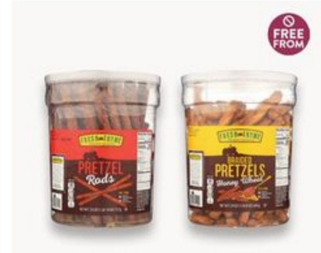
Fresh Thyme Pretzel Tubs 24-26 oz