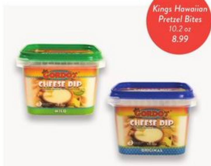
Gordos Dip Homestyle Queso, Original, Mild Cheese Dip 16 oz