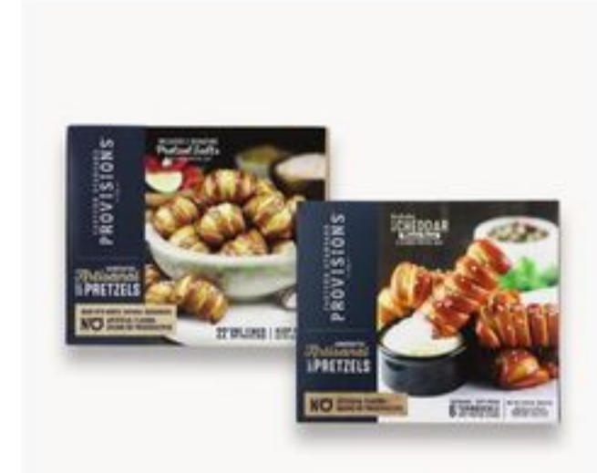
Eastern Standard Provisions Frozen Pretzels 5.25-13.3 oz