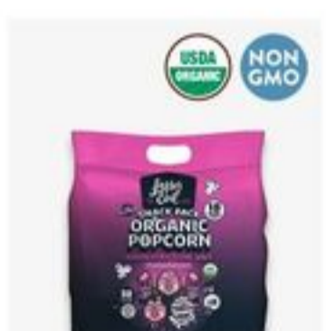
Lesser Evil Halloween Popcorn 18 pk while supplies last