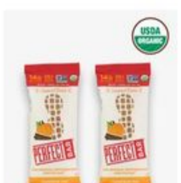
Perfect Bar Pumpkin Pie Bar 2.2 oz