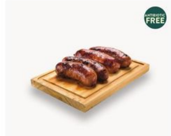
Fresh Thyme Gourmet Pork or Chicken Sausage Links