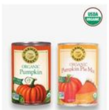
Farmer's Market Organic Pumpkin or Pie Mix 15 oz