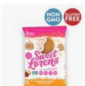
Sweet Loren's Pumpkin Spice Cookie Dough 9.6 oz