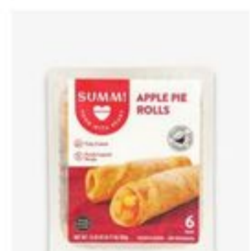
Summ Apple Pie Rolls 12.35 oz