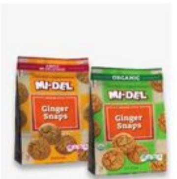
Mi-Del Ginger Snaps 8-10 oz