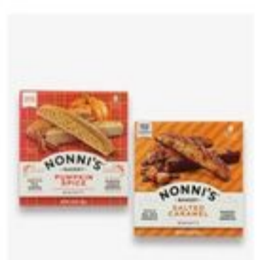
Nonni's Biscotti 5.52-6.88 oz