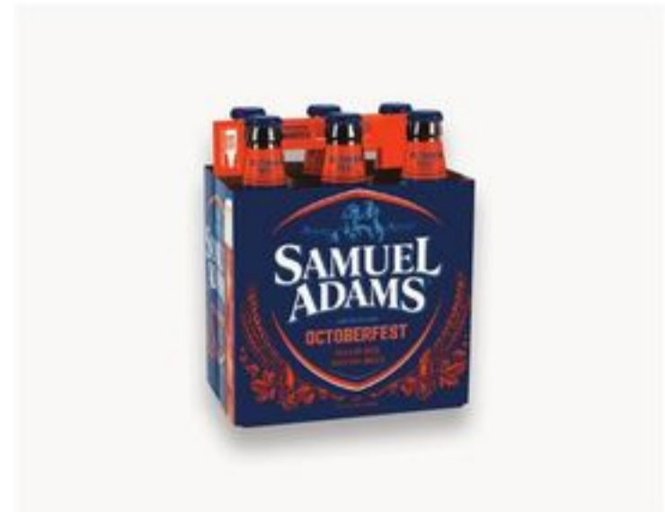
Sam Adams Seasonal Beer 6 pk, 12 oz