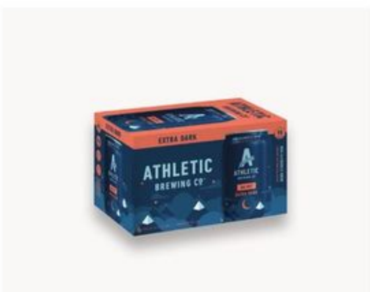
Athletic Brewing Seasonal Beer 6 pk, 12 oz