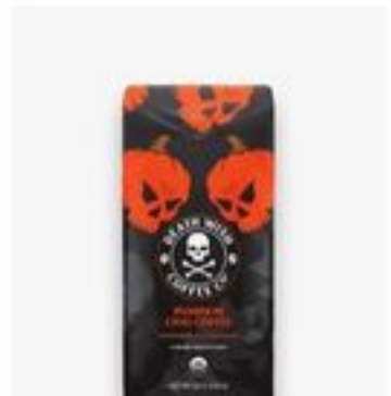
Death Wish Pumpkin Ground Coffee 9 oz