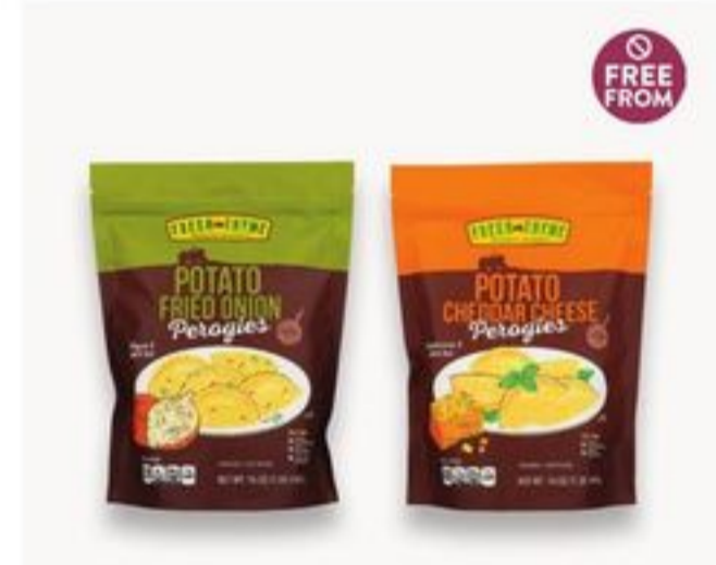
Fresh Thyme Frozen Perogies 16 oz