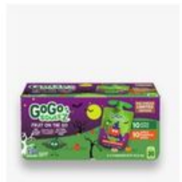
GoGo Squeeze Applesauce Halloween Pack 64 oz 20 pack