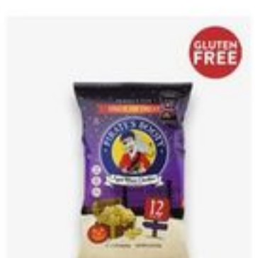
Pirate's Bounty Multipack Popcorn Snacks 12 pk, 0.5 oz while supplies last