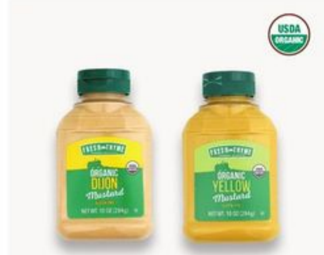
Fresh Thyme Organic Mustard 10 oz