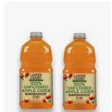
Langer Farms 100% Unfiltered Apple Cider 64 oz