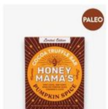
Honey Mama's Refrigerated Cocoa Truffle Pumpkin Spice Bar 2.5 oz