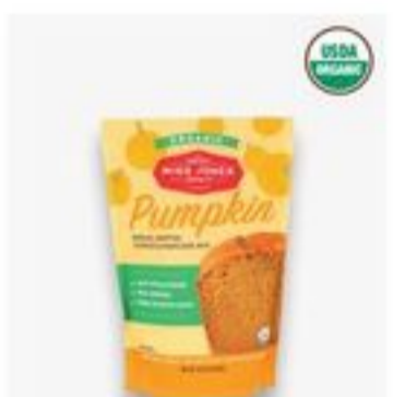
Miss Jones Baking Co Organic Pumpkin Bread Mix 16 oz while supplies last