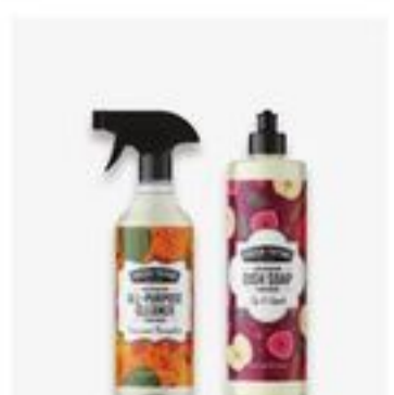
Fresh Thyme Fall Cleaners select varieties