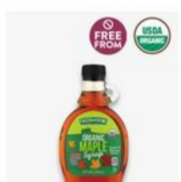
Fresh Thyme Organic Maple Syrup 8 oz everyday low price