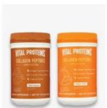
Vital Proteins Salted Caramel or Pumpkin Spice Collagen Peptides