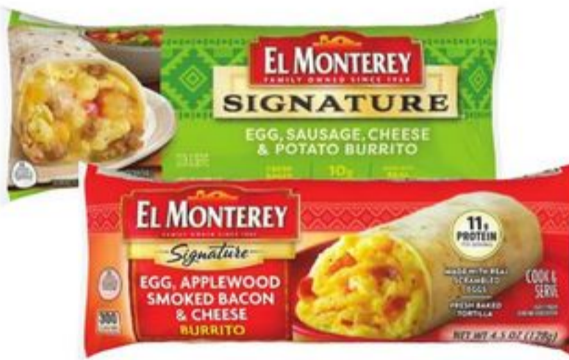
El Monterey Signature Breakfast Burrito 4.5-oz, select varieties