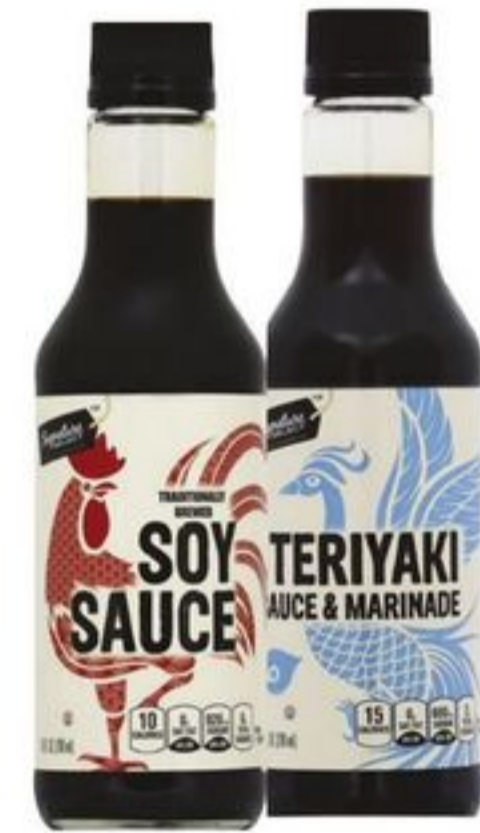
Signature SELECT Soy Sauce or Teriyaki Sauce & Marinade 10-oz, select varieties