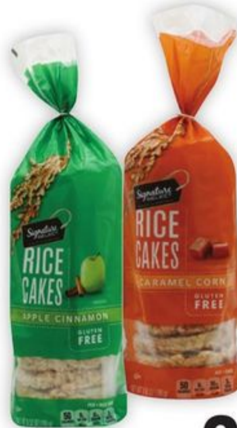
Signature SELECT® Rice Cakes 4.9 to 6.56-oz, select varieties