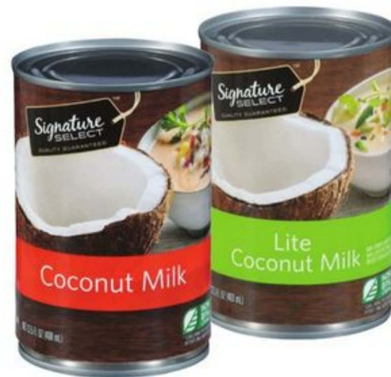
Signature SELECT® Coconut Milk 13.5-oz, select varieties