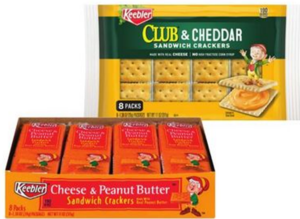
Mix & Match Keebler Sandwich Crackers 8-ct, select varieties

2 99 ea WHEN YOU BUY 2 OR MORE Member Price