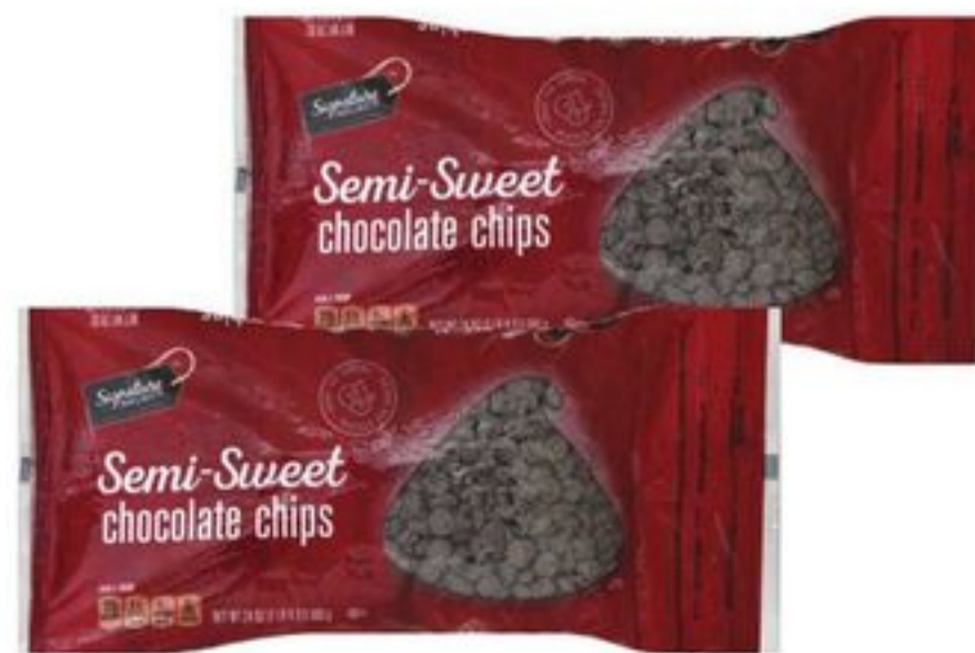
Signature SELECT® Semi-Sweet Chocolate Chips 24-oz