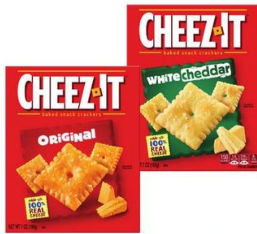
Mix & Match Sunshine Cheez-It Crackers 7-oz, select varieties

2 99 ea WHEN YOU BUY 2 OR MORE Member Price