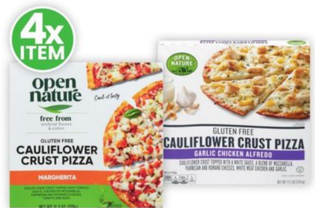
Open Nature® Gluten Free Cauliflower Crust Pizza 10.2 to 11.3-oz, select varieties