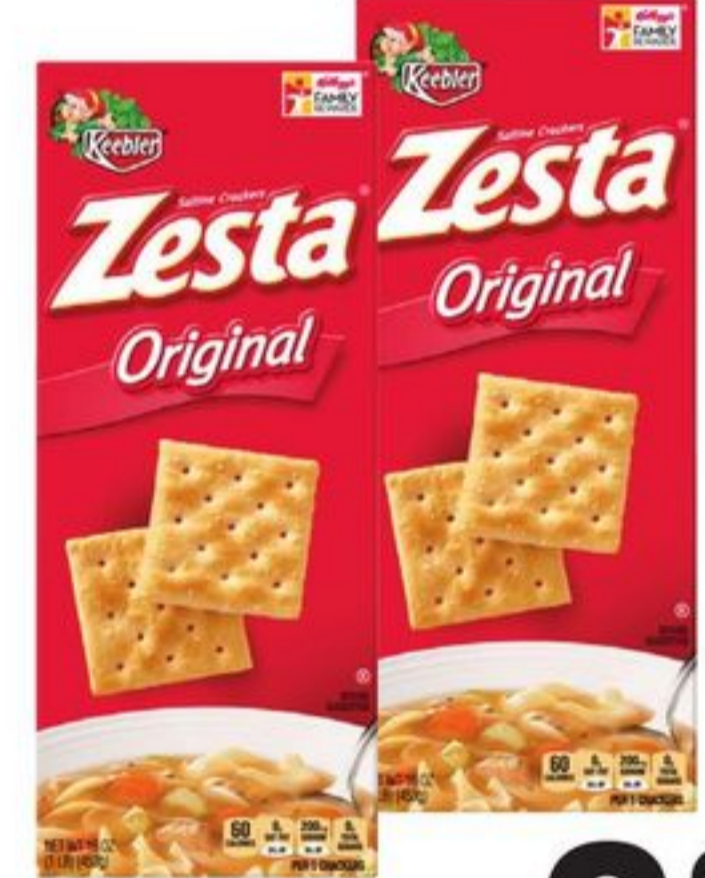
Keebler Zesta Saltine Crackers 16-oz

2 99 ea WHEN YOU BUY 2 OR MORE Member Price