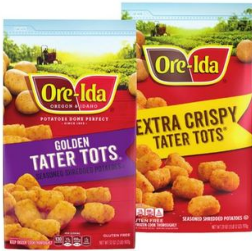
Ore Ida Tater Tots 28 to 32-oz, select varieties