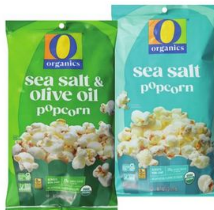
O Organics® Organic Popcorn 4 to 6-oz, select varieties