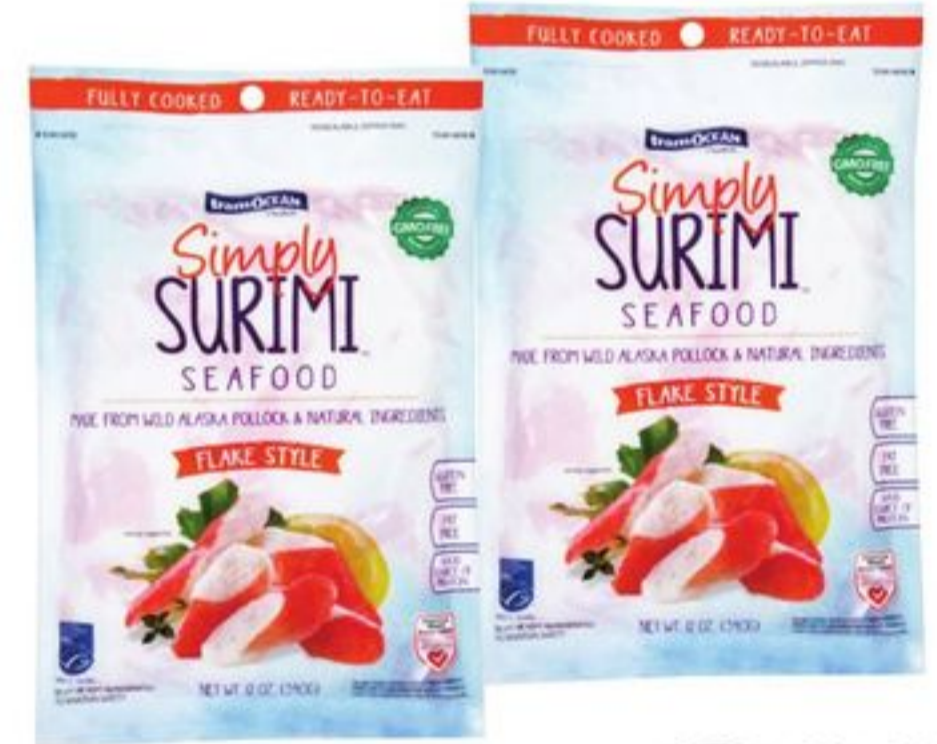
TransOcean Simply Surimi Flakes 12-oz