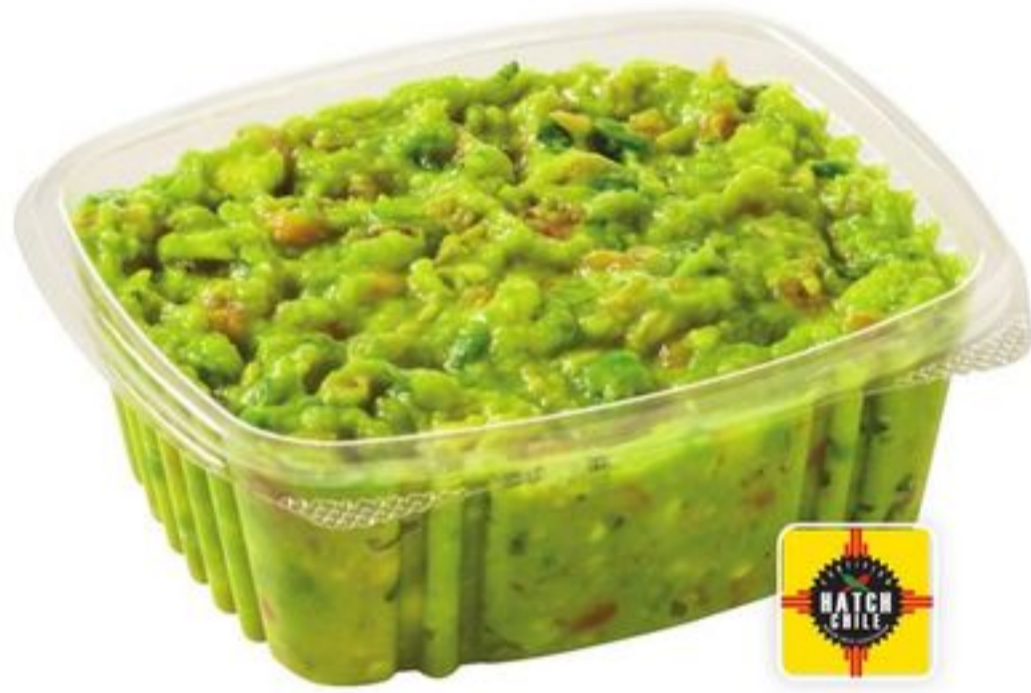
Guacamole 12-oz Regular, Spicy or Hatch Chile