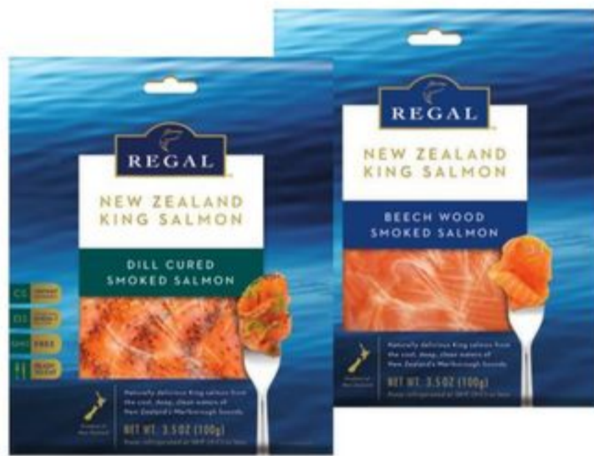
Regal New Zealand Smoked King Salmon 3.5-oz, select varieties