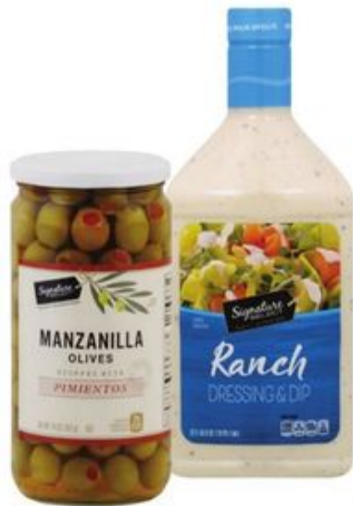
Signature SELECT® Manzanilla Olives Stuffed with Pimientos 14-oz or Ranch Dressing & Dip 52-oz