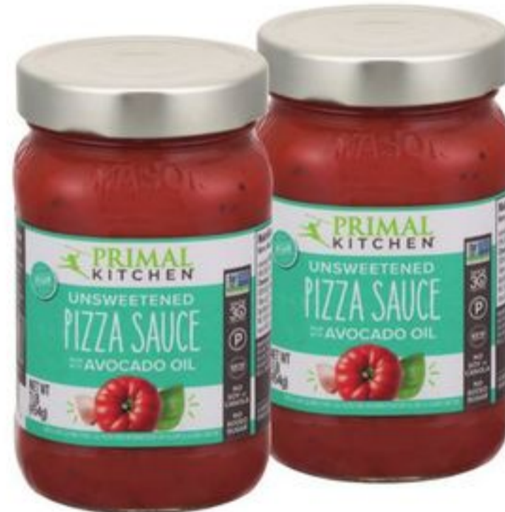
Primal Kitchen Pizza Sauce 15.5 to 16-oz, select varieties