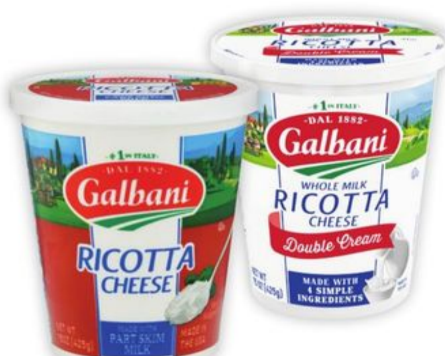
Galbani Ricotta Cheese 15-oz, select varieties