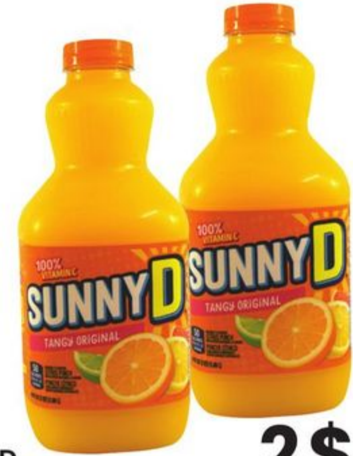
SunnyD Tangy Original Citrus Punch 64-oz