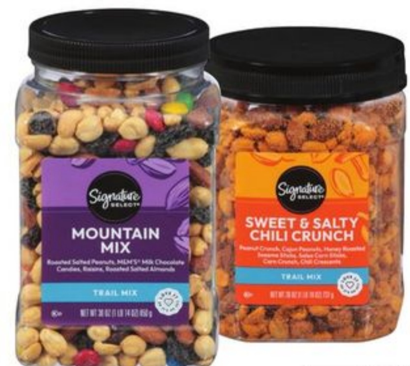
Signature SELECT® Trail Mix 22 to 30-oz, select varieties