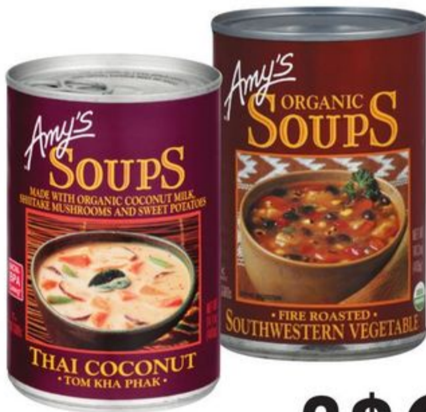
Amy's Soup 13.65 to 14.7-oz, select varieties