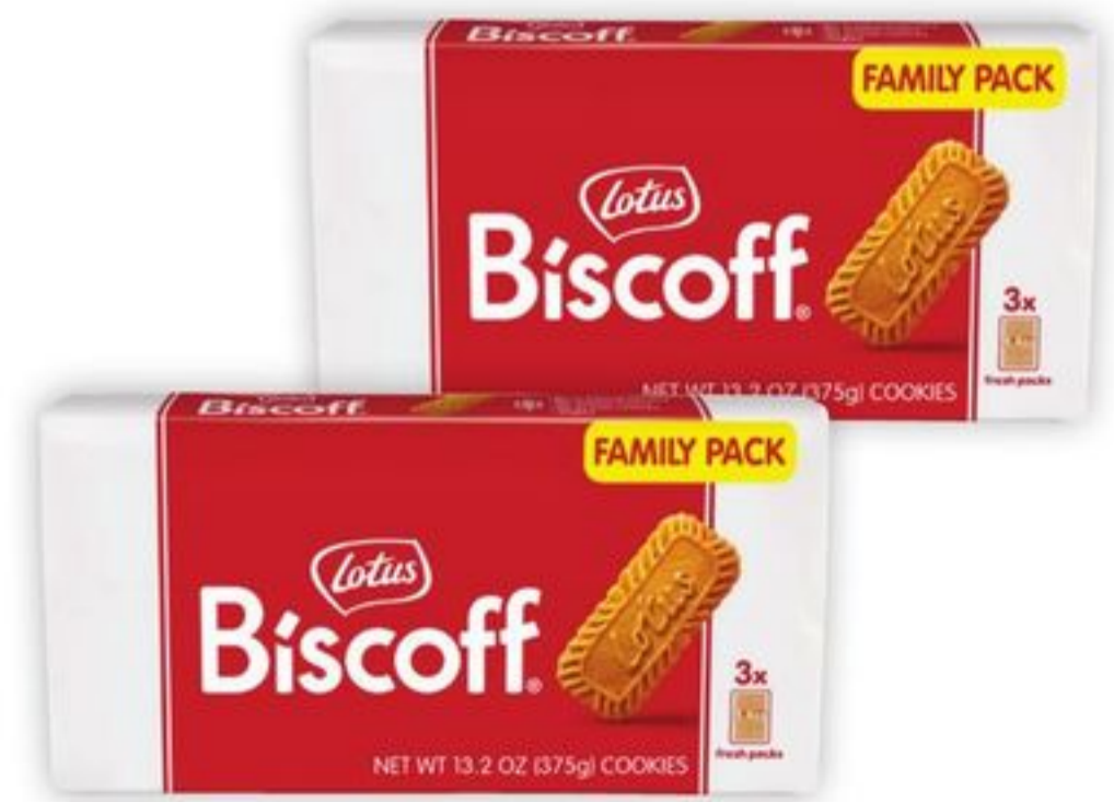
Biscoff Family Pack Cookies 13.2-oz