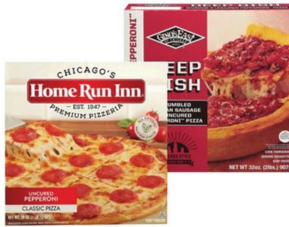
Home Run Inn 27 to 32-oz or Gino's East Deep Dish Pizza 32-oz, select varieties