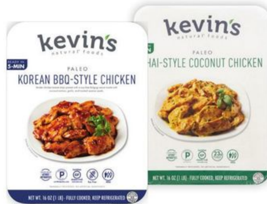
Kevin's Natural Foods Chicken Entrees 16-oz Fully Cooked, select varieties