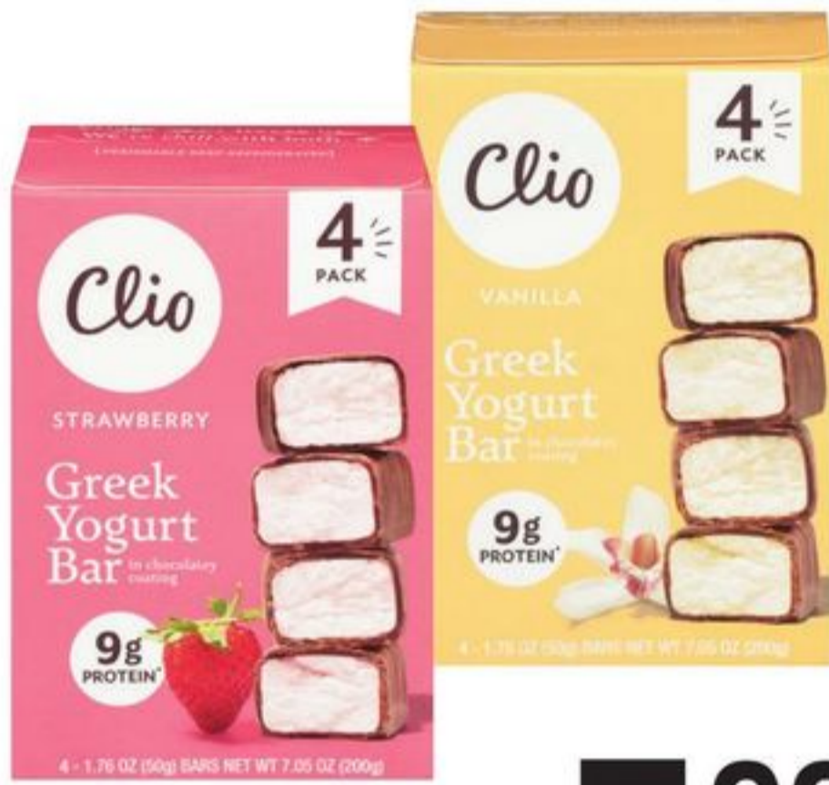
Clio Greek Yogurt Bar 4-ct, select varieties