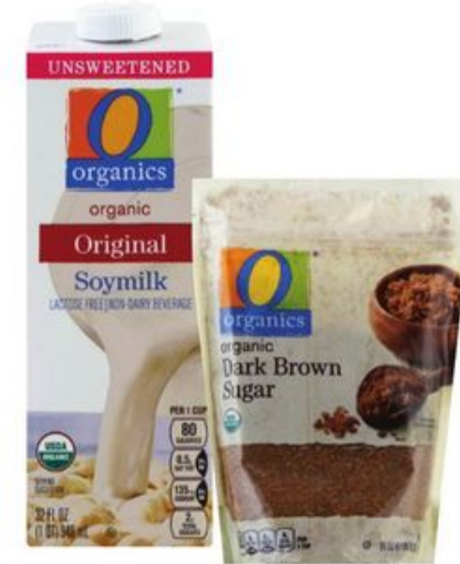
O Organics® Brown Sugar 24-oz or Non-Dairy Beverage 32-oz, select varieties