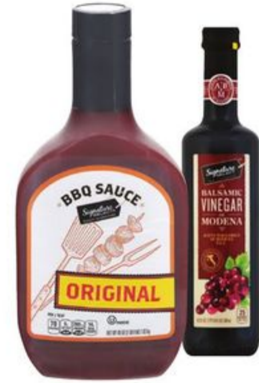
Signature SELECT® Original BBQ Sauce 40-oz or Vinegar Balsamic of Modena 16.9-oz