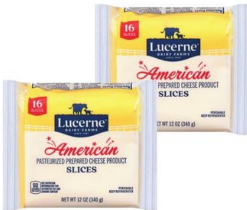
Lucerne® American Cheese Slices 16-ct