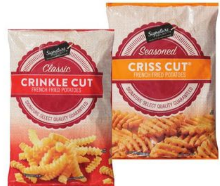
Signature SELECT® Potatoes 20 to 32-oz, select varieties

BUY 1 GET 1 FREE EQUAL OR LESSER VALUE Member Price