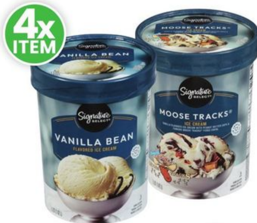
Signature SELECT® Ice Cream 1.5-qt, select varieties