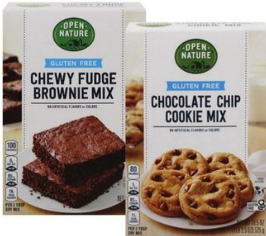
Open Nature® Gluten Free Cookie or Brownie Mix 14 to 18.5-oz, select varieties.