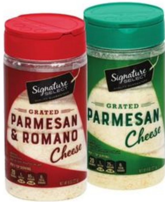
Signature SELECT® 100% Grated Parmesan or Parmesan & Romano Cheese 8-oz