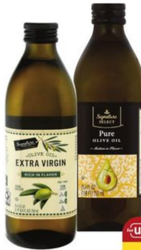
Signature SELECT® Olive Oil 25.4-oz, select varieties