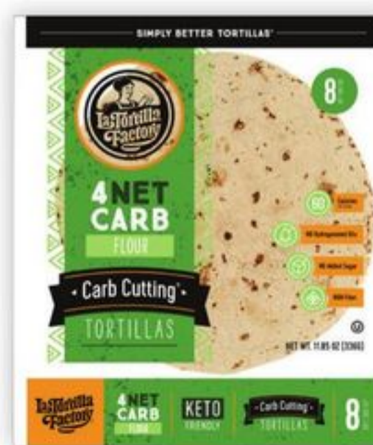
La Tortillas Factory 4 Net Carb Tortillas 8-ct, 11 to 11.85-oz or Patak's Simmer Sauce 15-oz, select varieties