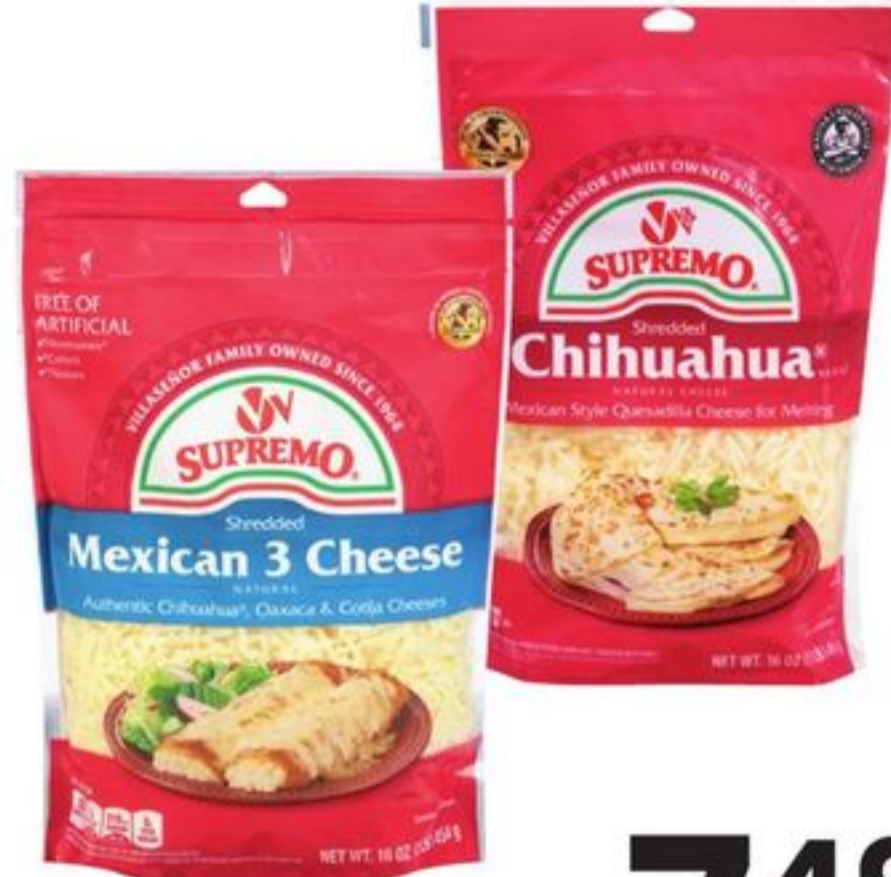
V.V. Supremo Shredded Cheese 16-oz, select varieties