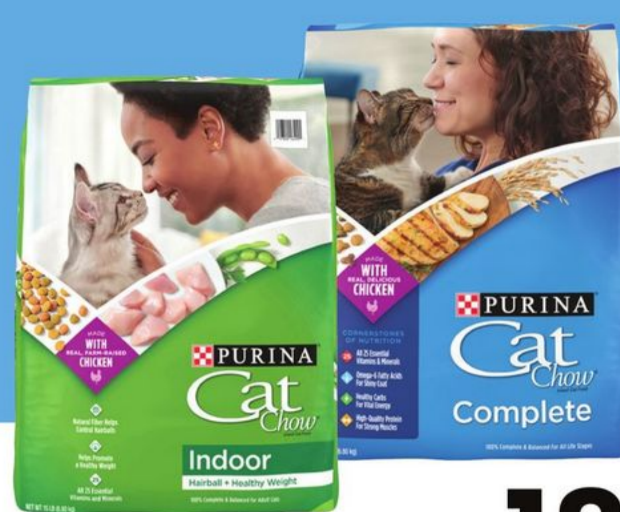
Purina Cat Chow Cat Food 15-lbs, select varieties