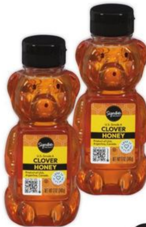
Signature SELECT® Clover Honey 12-oz