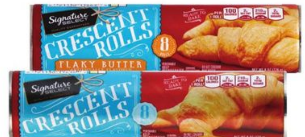
Signature SELECT® Crescent Rolls 8-oz, select varieties