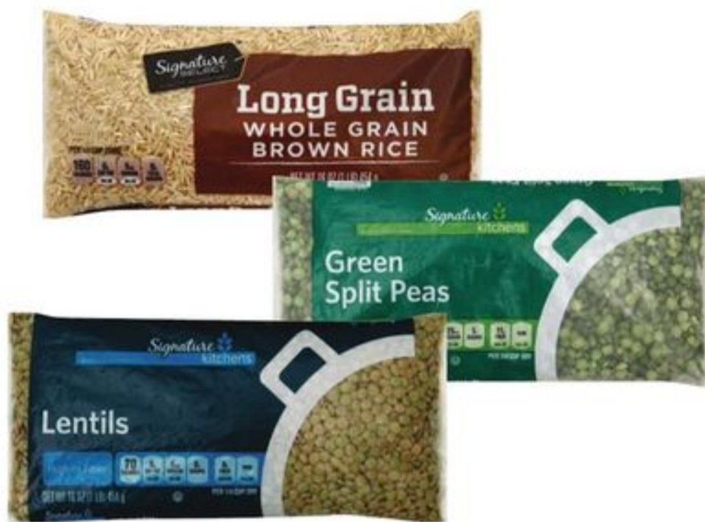
Signature SELECT® Dried Beans or Brown Rice 16-oz, select varieties