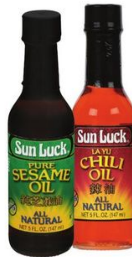
Sun Luck La Yu Chili or Pure Sesame Oil 5-oz