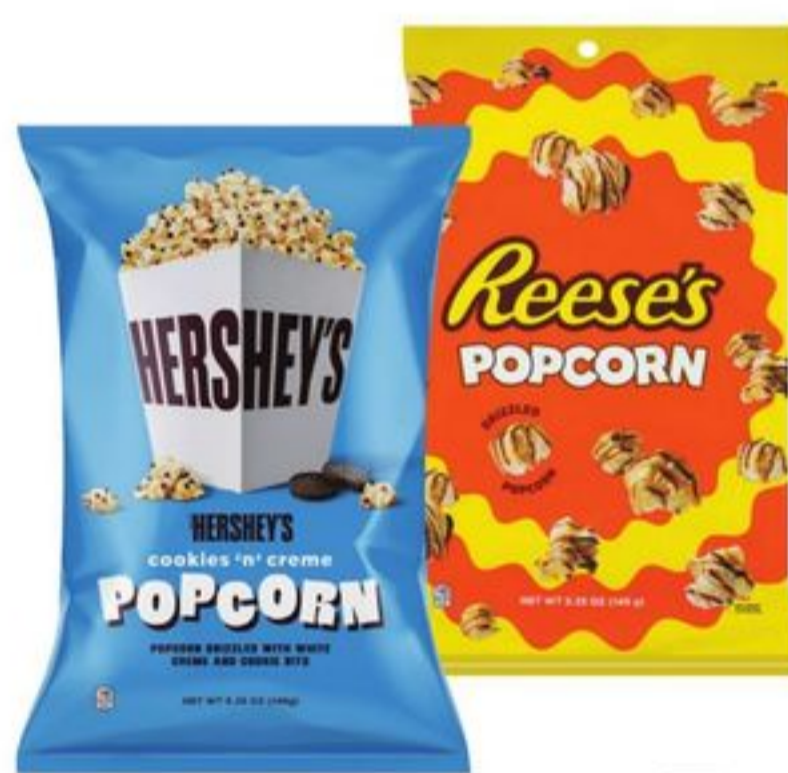
Hershey's or Reese's Popcorn 5.25-oz, select varieties