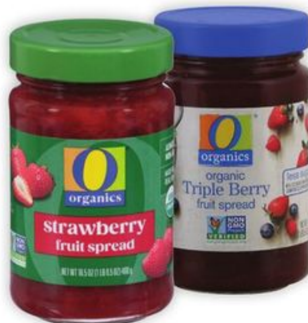
O Organics® Organic Fruit Spread 16.5-oz, select varieties

4 99 ea WHEN YOU BUY 2 OR MORE Member Price