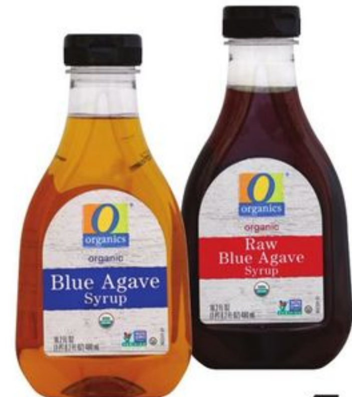
O Organics® Organic Blue Agave Syrup 16.2-oz, select varieties