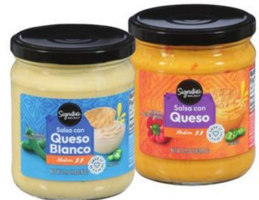
Signature SELECT® Salsa Con Queso 15.5-oz, select varieties