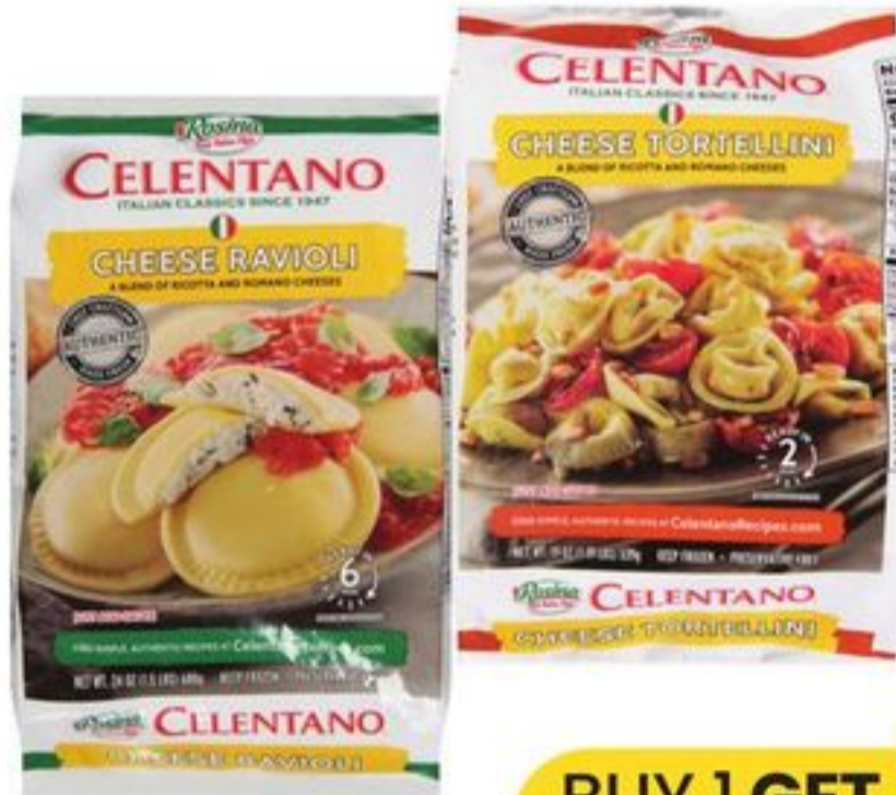
Mix & Match Celentano Pasta 16 to 24-oz, select varieties

BUY 1 GET 1 FREE EQUAL OR LESSER VALUE Member Price