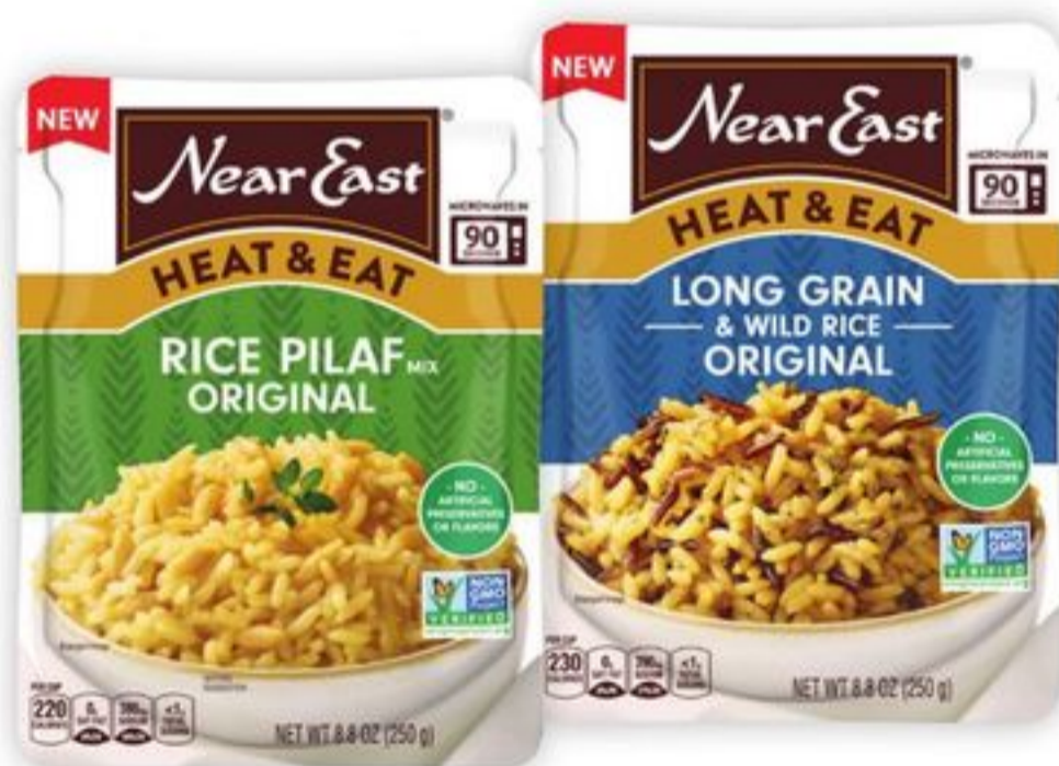
Near East Heat & Eat Sides 8.8-oz, select varieties