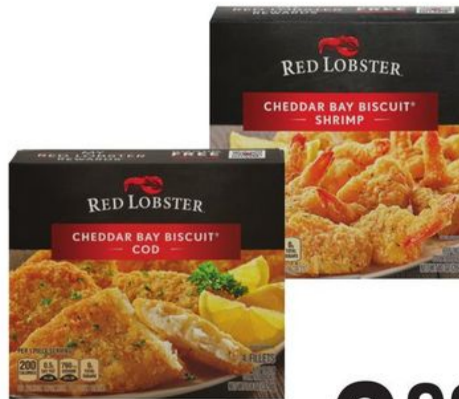
Red Lobster Seafood Selections 6.8 to 13-oz, select varieties