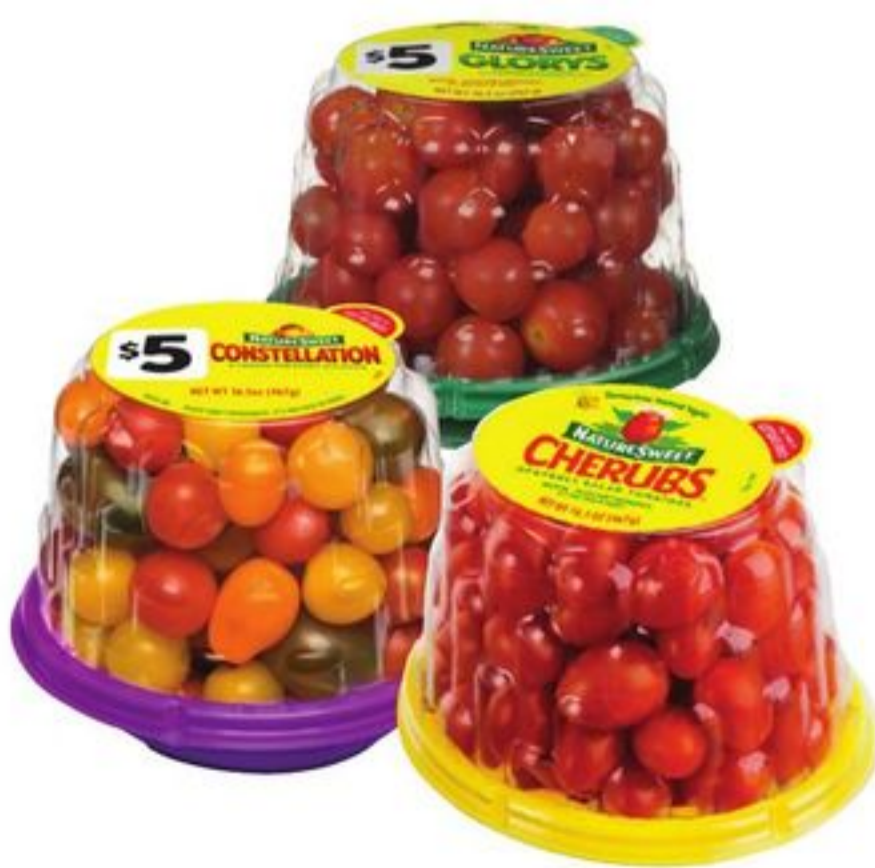
NatureSweet Tomatoes 16.5-oz, select varieties