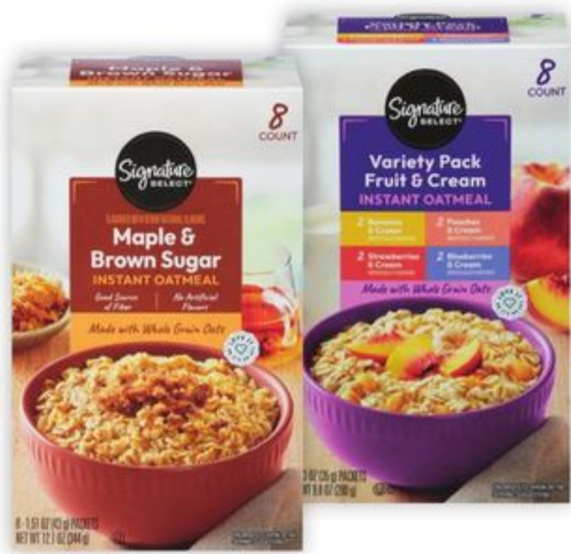
Signature SELECT® Instant Oatmeal 10-ct, select varieties