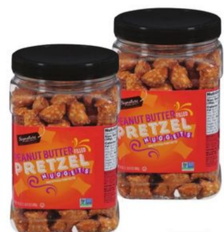
Signature SELECT® Peanut Butter Pretzel Nuggets 24-oz