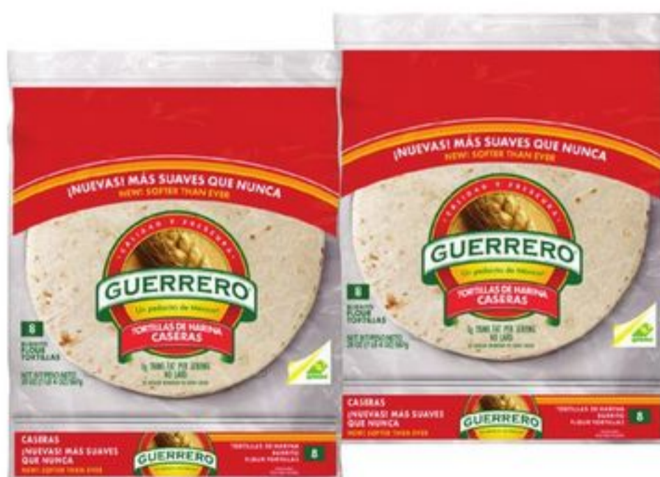
Guerrero Caseras Burrito Flour Tortillas 8-ct, 20-oz