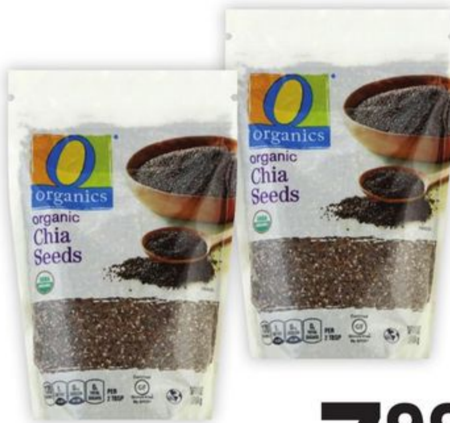
O Organics® Organic Chia Seeds 16-oz