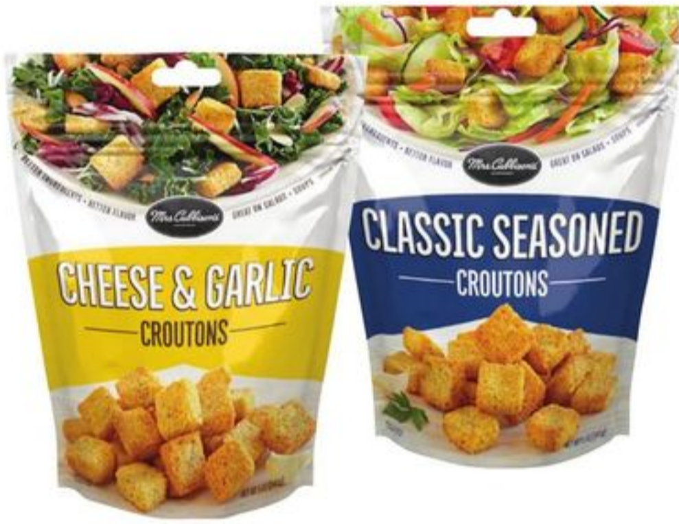
Mrs. Cubbison's Croutons 5-oz, select varieties