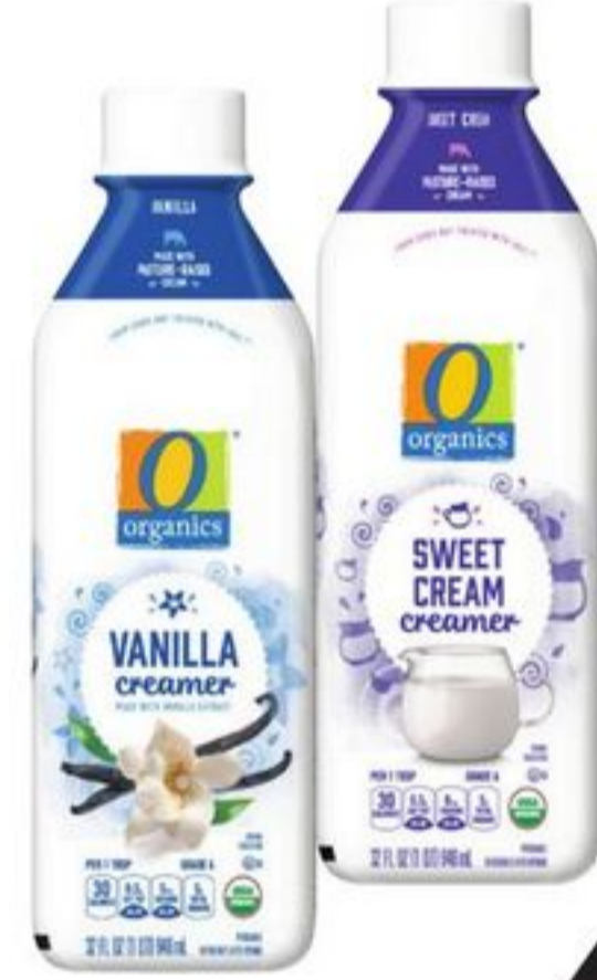
O Organics® Creamer 32-oz Chilled, select varieties