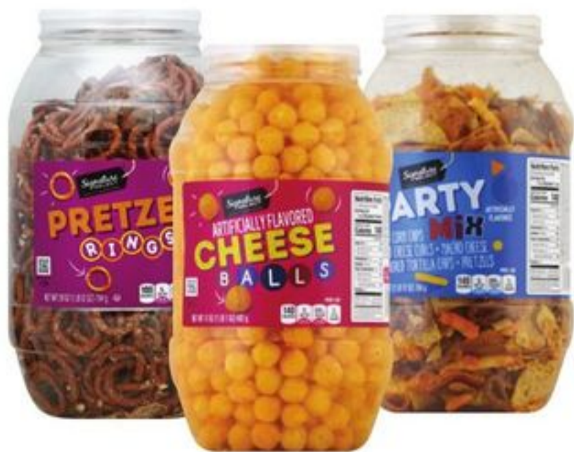
Signature SELECT® Cheese Ball 17-oz, Party Mix or Pretzel Rings 28-oz Barrel