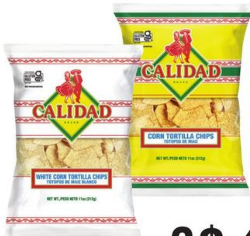
Calidad Tortilla Chips 11-oz, select varieties