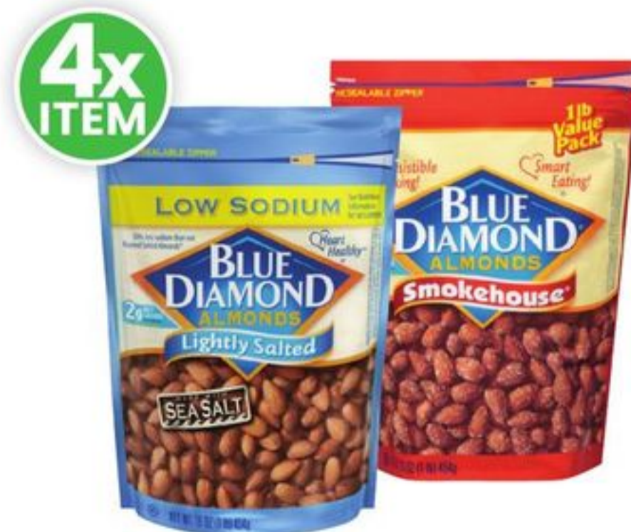
Blue Diamond Value Pack Almonds 16-oz, select varieties