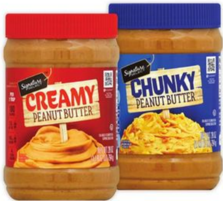
Signature SELECT® Peanut Butter 28-oz, select varieties