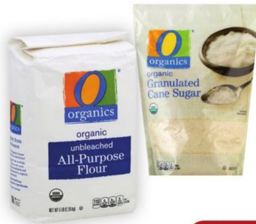
O Organics® Organic Flour 5-lbs or Granulated Cane Sugar 64-oz, select varieties