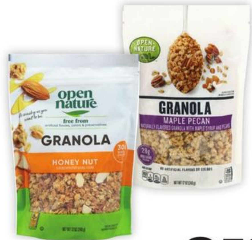
Open Nature® Naturally Flavored Granola 11 to 12.5-oz, select varieties