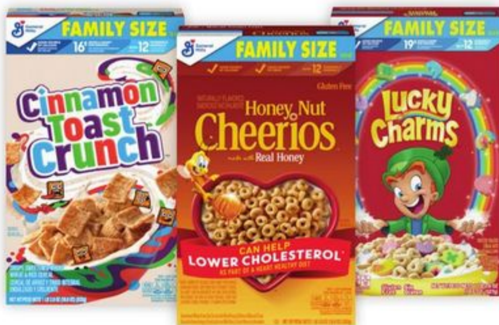
Mix & Match General Mills Family Size Cereal 15.1 to 24-oz, select varieties

4 99 ea WHEN YOU BUY 2 OR MORE Member Price