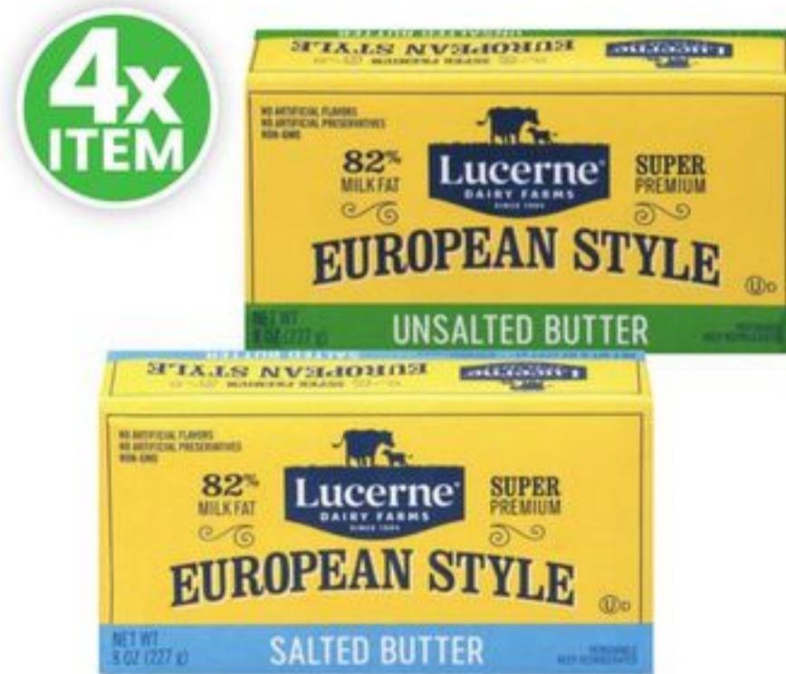
Lucerne® Super Premium European Style Butter 8-oz, select varieties