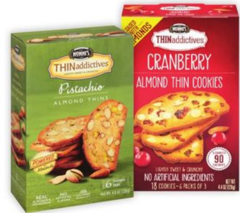
Nonni's Thin Addictives 6-ct, select varieties