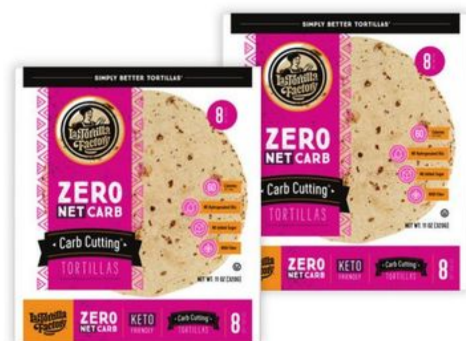
La Tortillas Factory Zero Net Carb Tortillas 8-ct, 11-oz