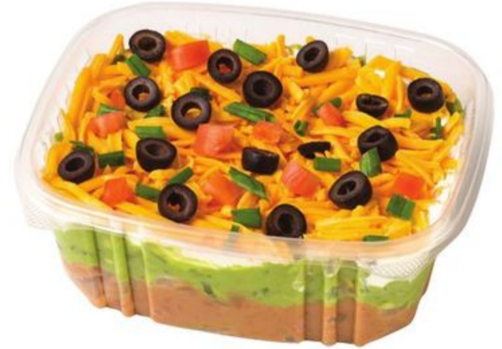
7-Layer Bean Dip 28-oz