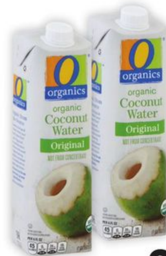
O Organics® Organic Coconut Water 33.8-oz