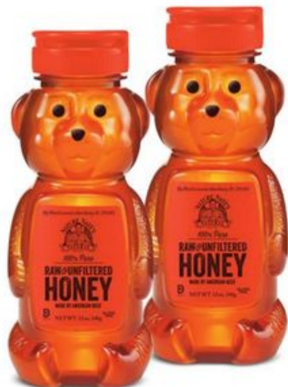
Nate's 100% Pure Raw & Unfiltered Honey 12-oz