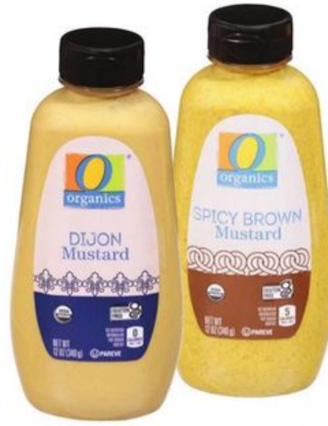
O Organics® Dijon or Spicy Brown Mustard 12-oz, select varieties