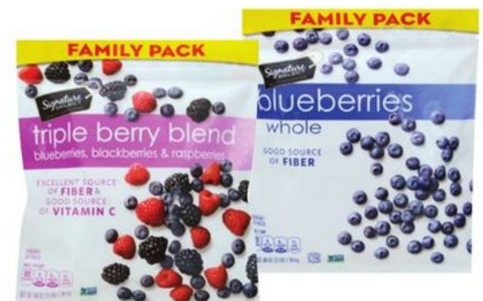
Signature SELECT® Family Size Fruit 40 to 48-oz, select varieties