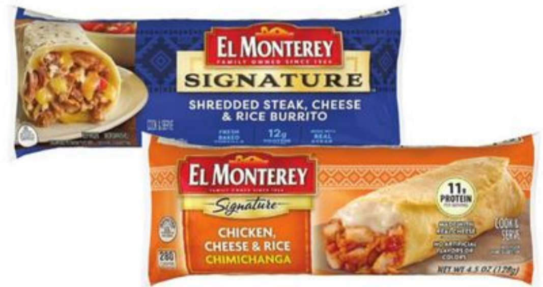
El Monterey Signature Chimichanga or Burrito 4.5 to 4.8-oz, select varieties