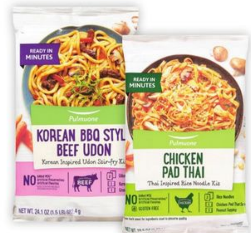
Pulmuone Chicken Pad Thai, Korean BBQ Style Beef or Chicken Teriyaki Udon 19.5 to 24.1-oz, select varieties