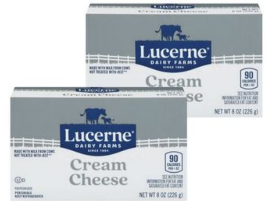
Lucerne® Cream Cheese 8-oz, Brick