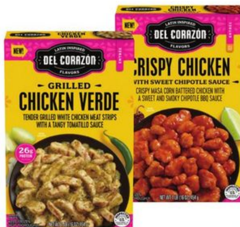
Del Corazon Entrees 16-oz, select varieties