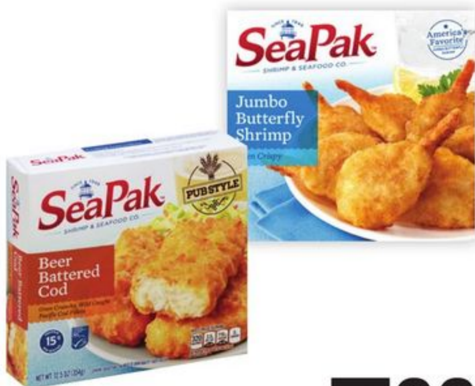
SeaPak Seafood Selections 8.2 to 18-oz, select varieties