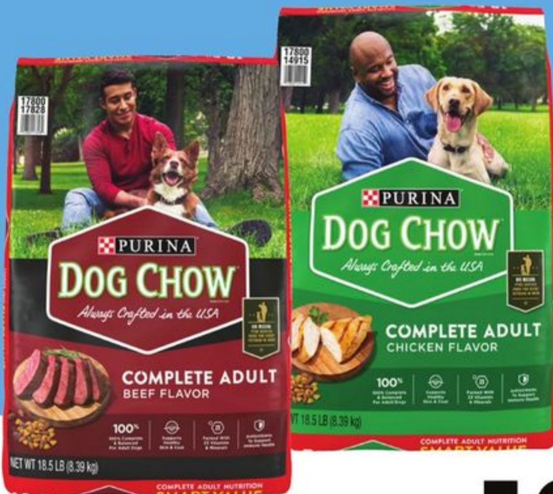
Purina Dog Chow Dog Food 18.5-lbs, select varieties