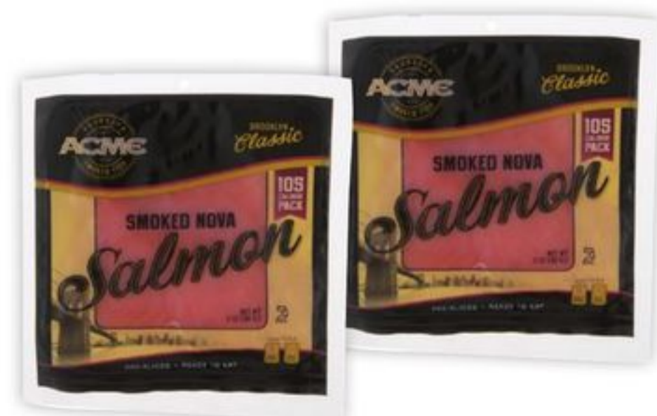
ACME Smoked Nova Salmon 3-oz, select varieties