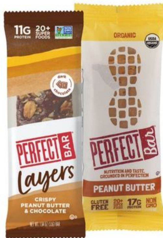
Mix & Match Perfect Bar Meal Replacement Bar 1.4 to 2.5-oz, select varieties