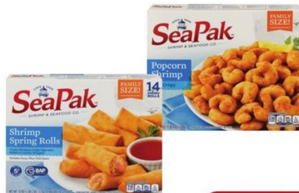
SeaPak Spring Roll or Shrimp Selections 16 to 25-oz, select varieties Limit 5 Total