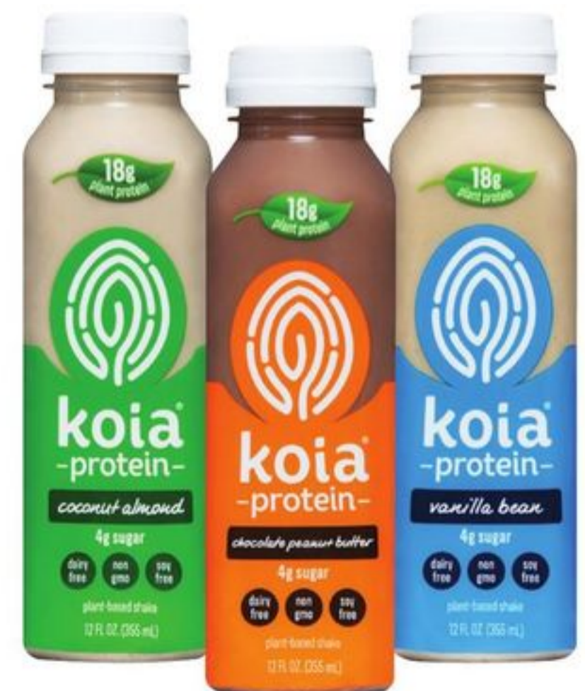
Mix & Match Koia Protein Drinks 12-oz, select varieties