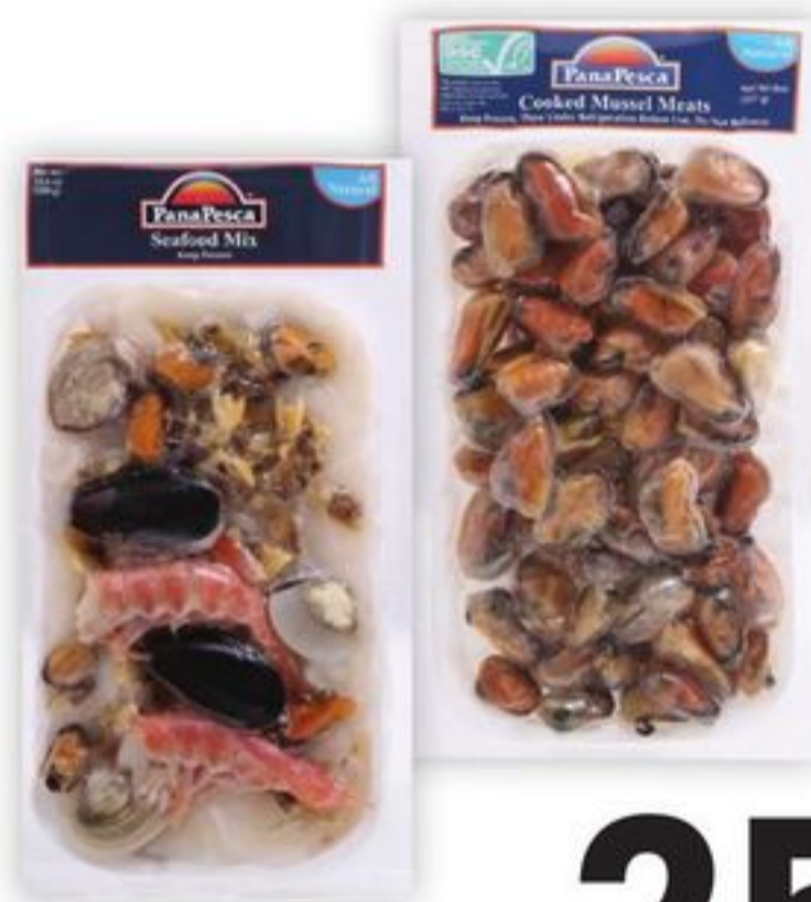
PanaPesca Seafood Selections select sizes and varieties