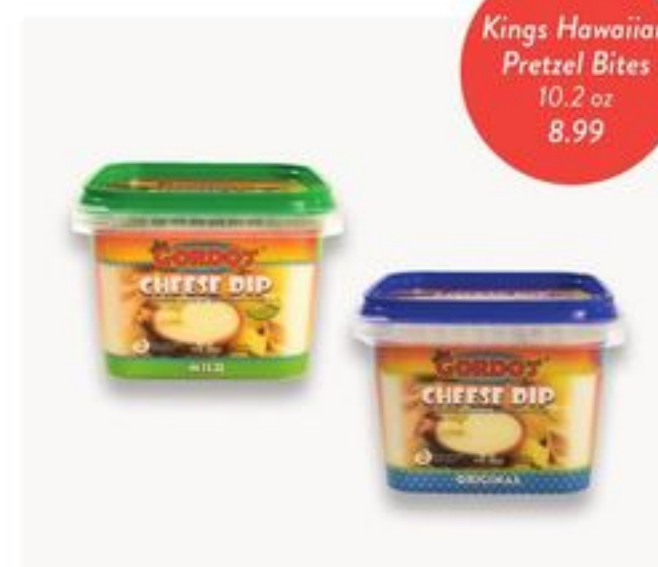
Gordos Dip Homestyle Queso, Original, Mild Cheese Dip 16 oz 5.99