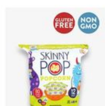
Skinny Pop Multipack Popcorn Snacks 12 pk, 0.5 oz while supplies last