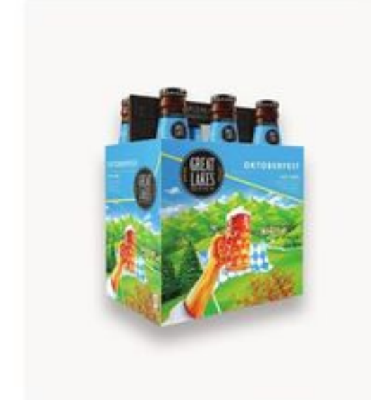
Great Lakes Seasonal Beer 6 pk, 12 oz 10.99