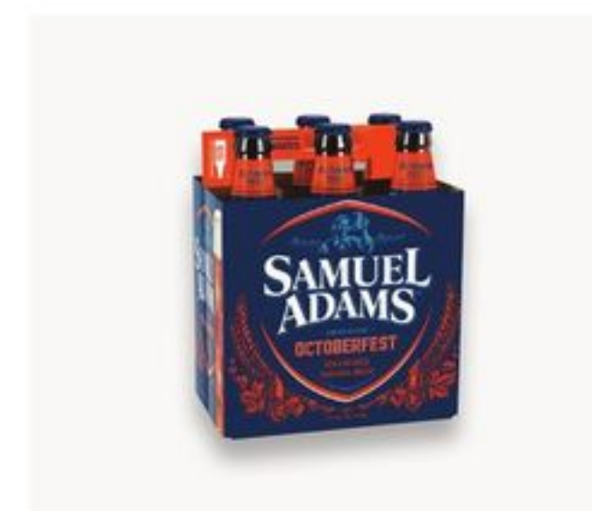
Sam Adams Seasonal Beer 6 pk, 12 oz 10.99