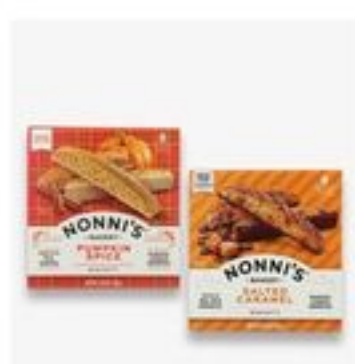
Nonni's Biscotti 5.52-6.88 oz