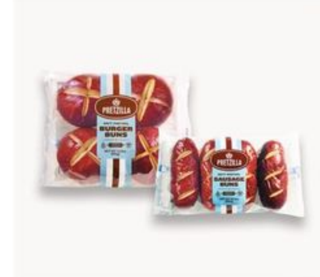
Pretzella Bun or Rolls 8.4-12.8 oz 4.99