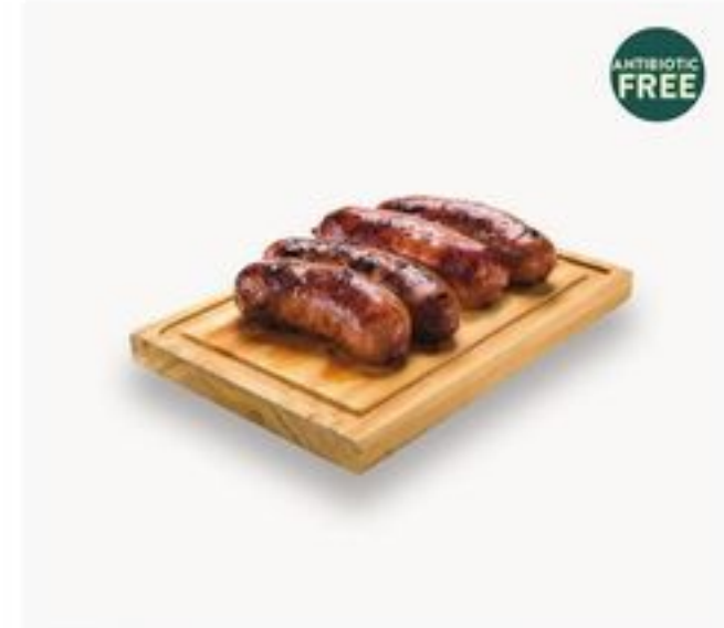
Fresh Thyme Gourmet Pork or Chicken Sausage Links 4.99LB