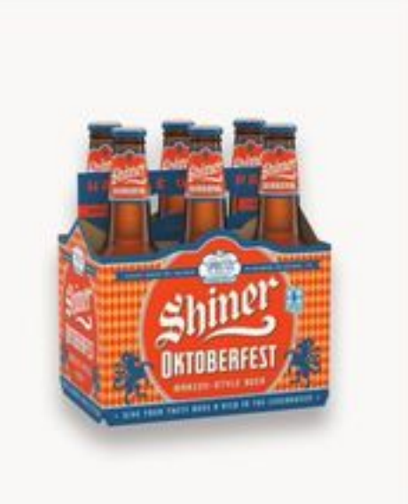
Shiner Oktoberfest 6 pk, 12 oz 9.99