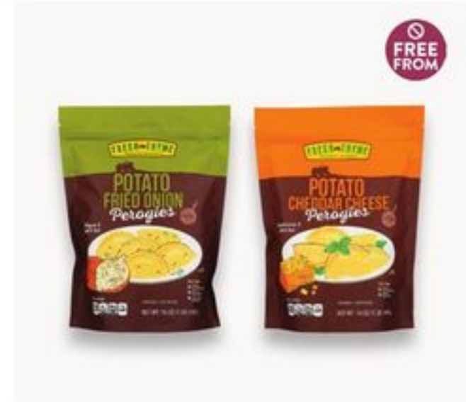
Fresh Thyme Frozen Perogies 16 oz 3.99