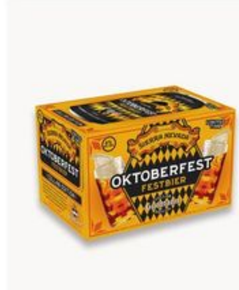
Sierra Nevada Oktoberfest 6 pk, 12 oz 10.99