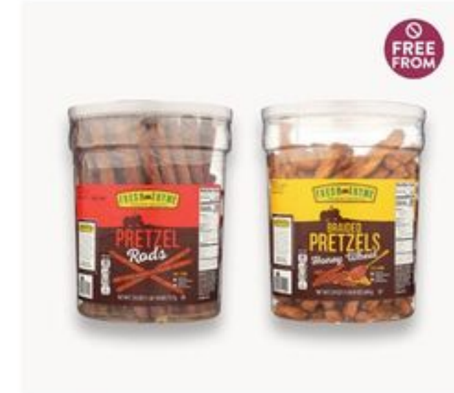
Fresh Thyme Pretzel Tubs 24-26 oz 5.99