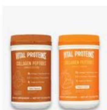
Vital Proteins Salted Caramel or Pumpkin Spice Collagen Peptides