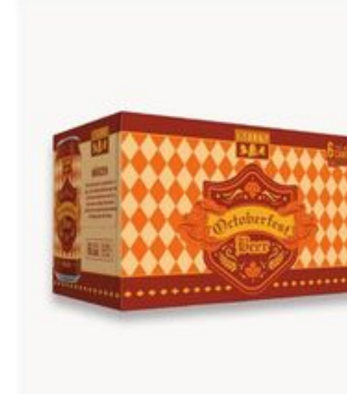
Bell's Seasonal Cans 6 pk, 12 oz 9.99