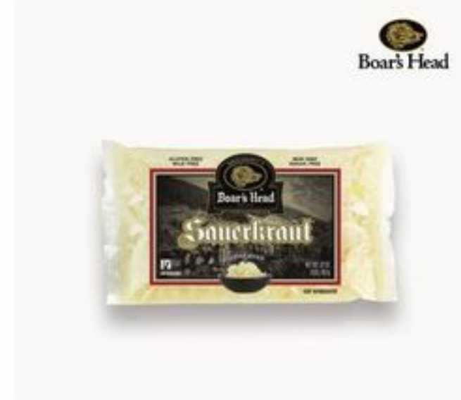
Boar's Head Sauerkraut 16 oz 2.99