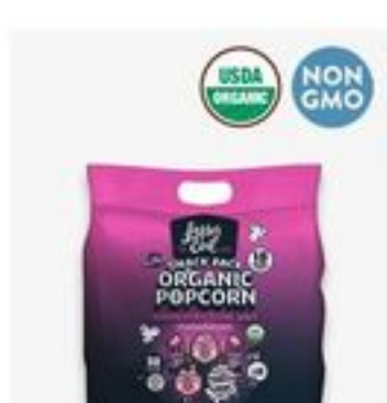
Lesser Evil Halloween Popcorn 18 pk while supplies last