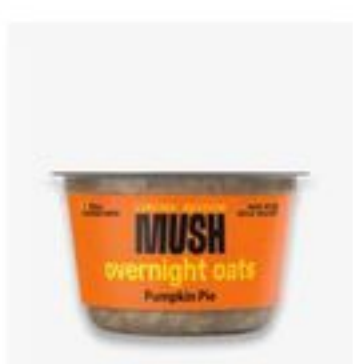
Mush Overnight Pumpkin Pie Oats 5 oz