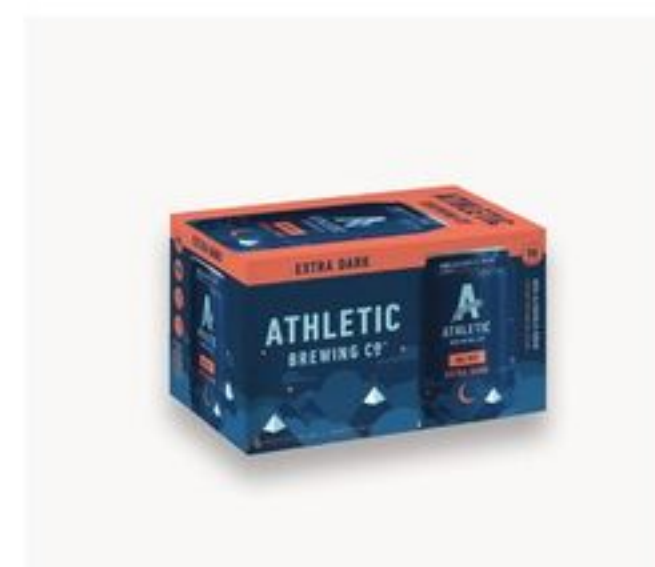
Athletic Brewing Seasonal Beer 6 pk, 12 oz 10.99