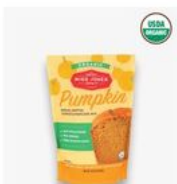
Miss Jones Baking Co Organic Pumpkin Bread Mix 16 oz while supplies last