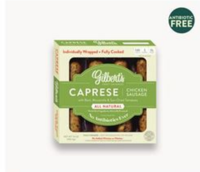
Gilbert's Antibiotic-Free Chicken Sausage 10 oz 6.99