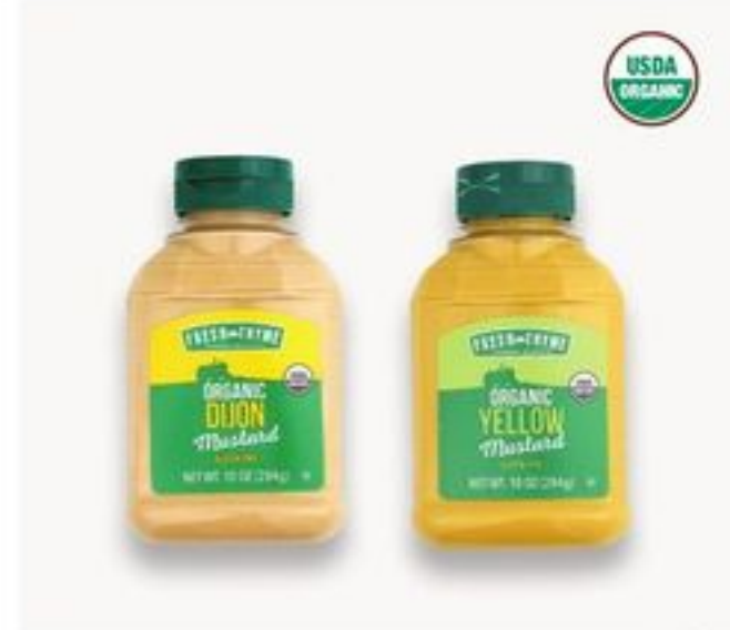
Fresh Thyme Organic Mustard 10 oz 2/$4