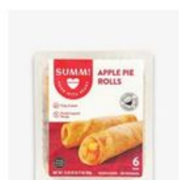
Summ Apple Pie Rolls 12.35 oz