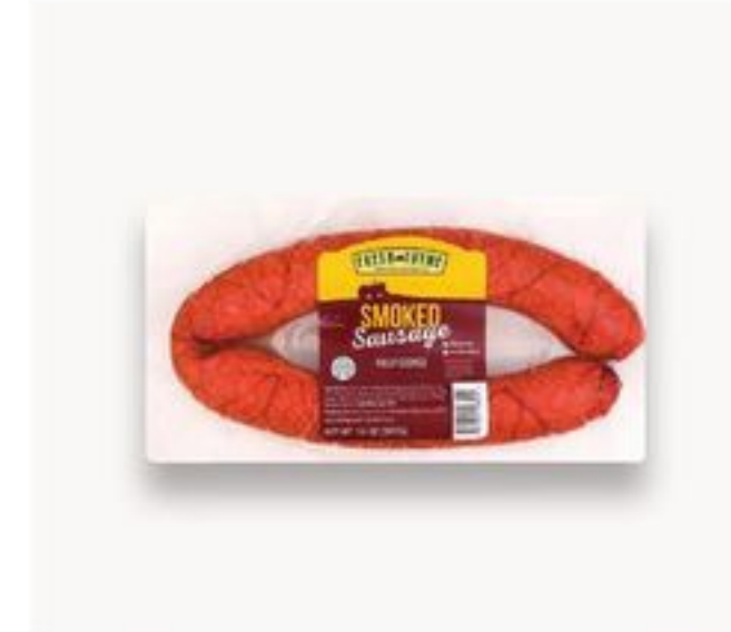
Fresh Thyme Smoked Sausage 14 oz, all varieties 4.99