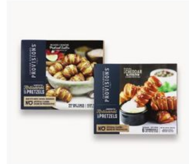
Eastern Standard Provisions Frozen Pretzels 5.25-13.3 oz 5.49