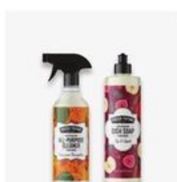
Fresh Thyme Fall Cleaners select varieties