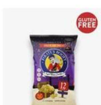
Pirate's Bounty Multipack Popcorn Snacks 12 pk, 0.5 oz while supplies last