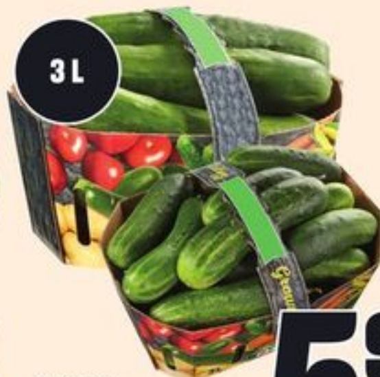
3 L ONTARIO DILL OR SLICER CUCUMBERS PRODUCT OF ONTARIO 3 L 20062076001_EA/21042288001_EA