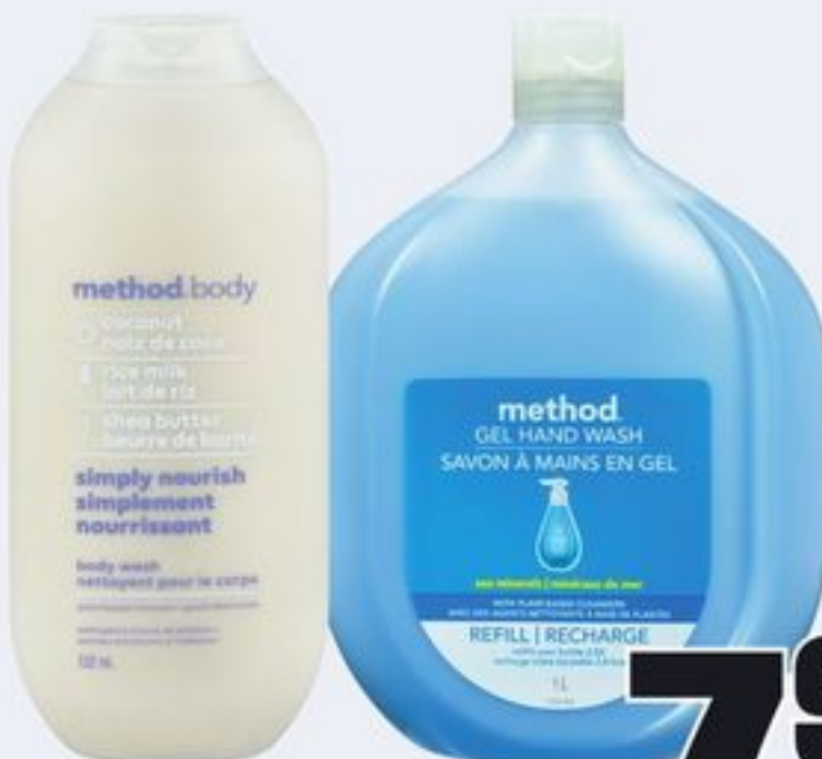
METHOD BODY WASH 532 ML OR LIQUID HAND SOAP REFILL 828 ML/1 L SELECTED VARIETIES 21425039_EA/21425299_EA