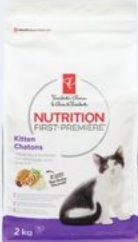
PC ® NUTRITION FIRST ™ CAT FOOD SELECTED VARIETIES 2 KG 21303030_EA