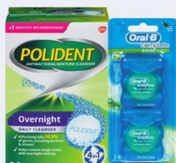
SENSODYNE RAPID RELIEF OR REPAIR AND PROTECT TOOTHPASTE, POLIDENT TABLETS 84-96'S, COLGATE TOTAL TOOTHPASTE 3-PACK OR BATTERY TOOTHBRUSH, CREST PRO HEALTH OR SCOPE MOUTHWASH OR CREST GUM DETOXIFY TOOTHPASTE SELECTED VARIETIES AND SIZES 20437569002_EA/20598749_EA