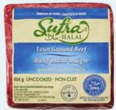
SUFRA® HALAL LEAN GROUND BEEF 454 G 21397283_EA