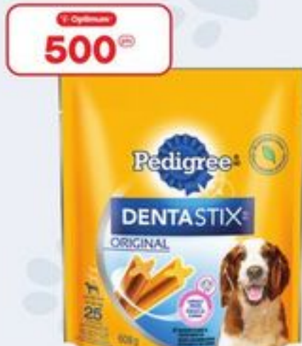
PEDIGREE DENTASTIX TREATS FOR DOGS SELECTED VARIETIES 100 G-1.9 KG 21081180_EA