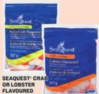
SEAQUEST® CRAB OR LOBSTER FLAVOURED POLLOCK FLAKES OR CHUNKS SELECTED VARIETIES READY-TO-EAT 227 G 20699832_EA/20749901_EA