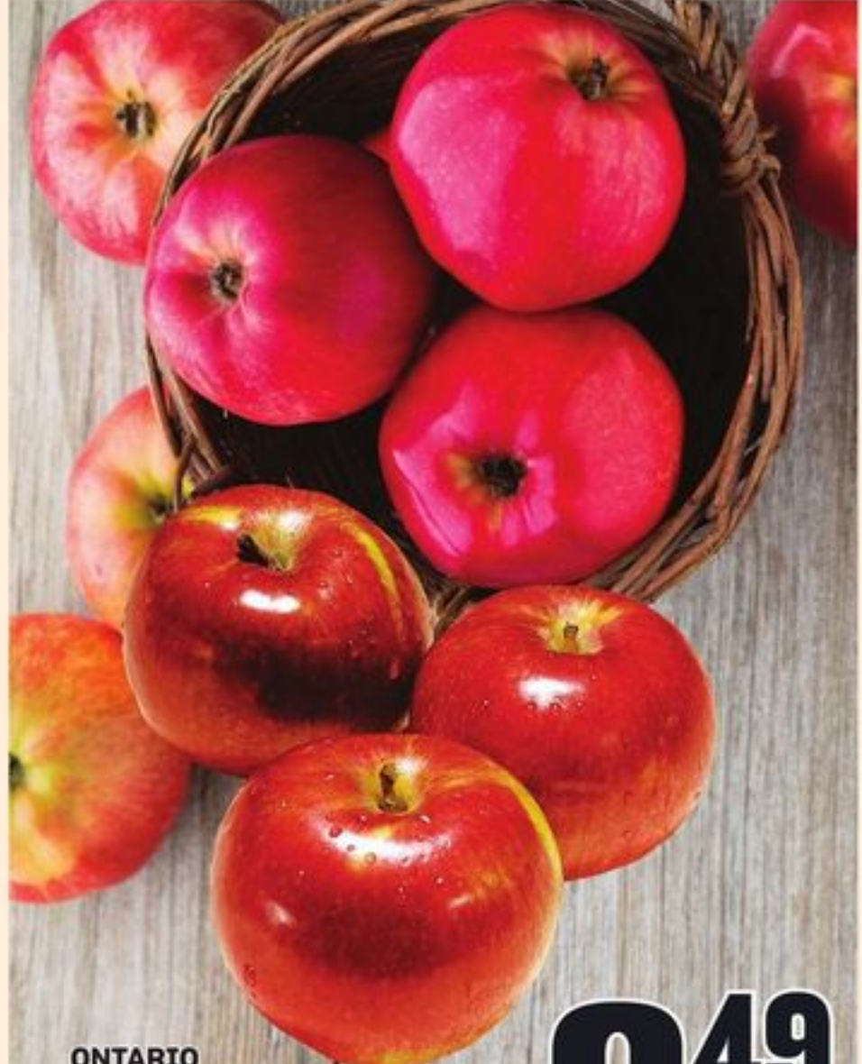
ONTARIO MCINTOSH APPLES PRODUCT OF ONTARIO CANADA FANCY GRADE 5.49/KG 20039956001_KG