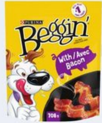
BEGGIN' ® STRIPS DOG TREATS SELECTED VARIETIES 708/850 G 21101589_EA