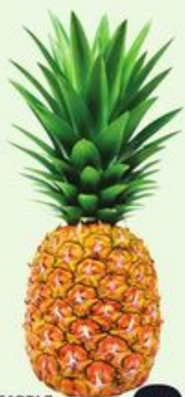
PINEAPPLE PRODUCT OF COSTA RICA EACH 20160992001_EA