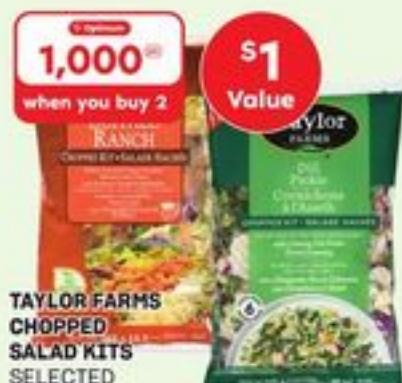
TAYLOR FARMS CHOPPED SALAD KITS SELECTED VARIETIES, PRODUCT OF U.S.A. 267-383 G 21335159_EA 21381575_EA