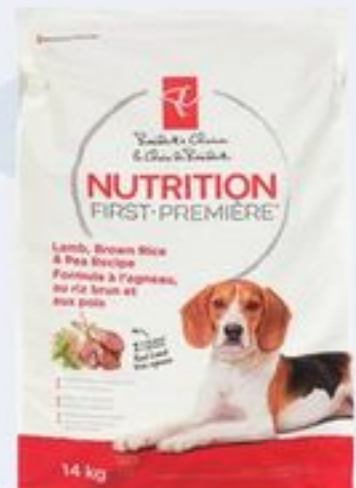
PC ® NUTRITION FIRST ™ DRY DOG FOOD SELECTED VARIETIES 14 KG 21304669_EA