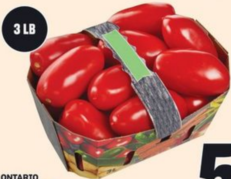
3 LB ONTARIO ROMA TOMATOES PRODUCT OF ONTARIO 3 LB 21930001001_EA