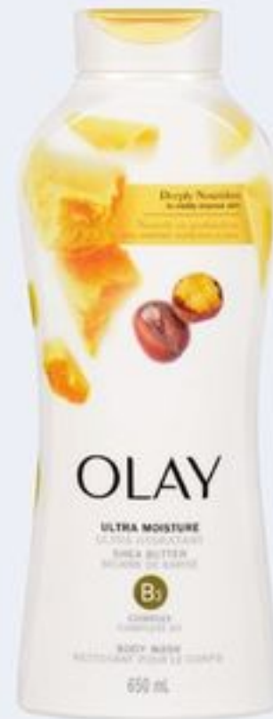
OLAY BODY WASH SELECTED VARIETIES 532/650 ML 21000948_EA