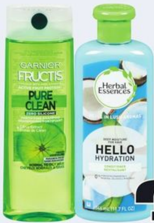
GARNIER FRUCTIS 334-370 ML OR HERBAL ESSENCES 346 ML HAIR CARE SELECTED VARIETIES 21007198_EA/21247098_EA