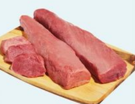
PORK TENDERLOIN CRYOVAC PKG OF 2 8.80/KG 20520970_KG