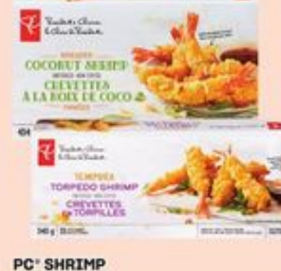
PC® SHRIMP APPETIZERS SELECTED VARIETIES, FROZEN 300-454 G 20135874_EA 20978921_EA