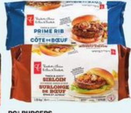
PC® BURGERS SELECTED VARIETIES, FROZEN 568 G -1.36 KG 20941230_EA 20941443_EA