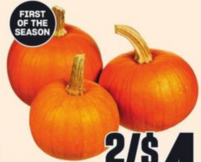
FIRST OF THE SEASON CANADA PIE PUMPKINS PRODUCT OF CANADA EACH 20101185001_EA