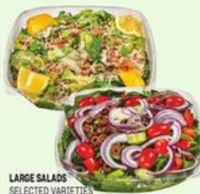
LARGE SALADS SELECTED VARIETIES MADE FRESH IN-STORE DAILY 498-926 G 21363212_EA 21363221_EA