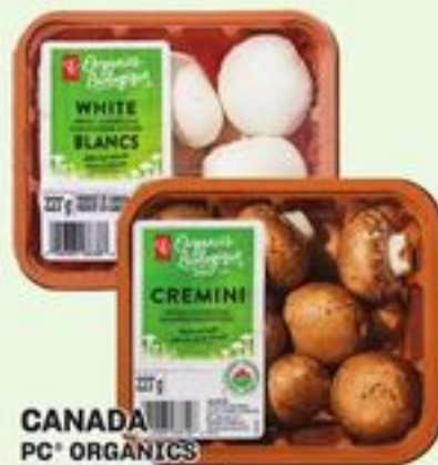
CANADA PC ORGANICS WHOLE CREMINI OR WHITE MUSHROOMS PRODUCT OF CANADA 227 G 21021565_EA 21021499_EA