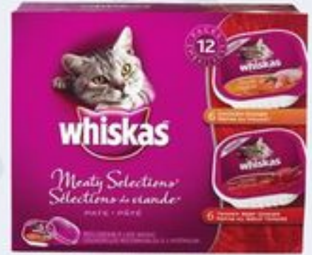
WHISKAS CAT FOOD SELECTED VARIETIES 12'S 20548822_EA