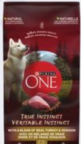
PURINA ONE TRUE INSTINCT ® SMARTBLEND DOG FOOD SELECTED VARIETIES 1.72/1.81 KG 20912587_EA