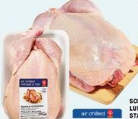
PC® WHOLE CHICKEN AIR CHILLED 7.69/KG 20089413_KG