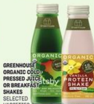
GREENHOUSE ORGANIC COLD-PRESSED JUICE OR BREAKFAST SHAKES SELECTED VARIETIES PRODUCT OF CANADA 300 ML 21107322_EA 21246690_EA