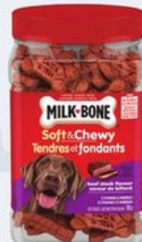
MILK-BONE SOFT & CHEWY TREATS FOR DOGS SELECTED VARIETIES 708 G 21047843_EA