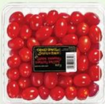
FARMER'S MARKET® GRAPE TOMATOES PRODUCT OF CANADA OR U.S.A. 907 G 20840038001_EA