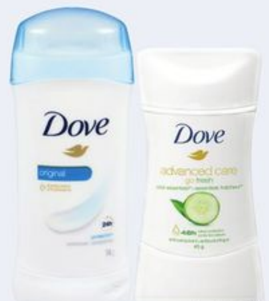
DOVE OR DEGREE DEODORANTS SELECTED VARIETIES 45-76 G 20188212001_EA/20302753001_EA