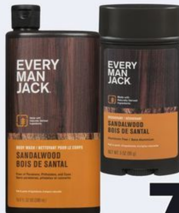
EVERY MAN JACK BODY WASH 500 ML OR DEODORANT 73/85 G SELECTED VARIETIES 20987291_EA/21080324_EA