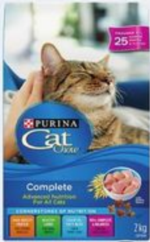
PURINA CAT CHOW SELECTED VARIETIES 1.42-2 KG 20319556001_EA