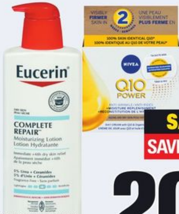
NIVEA LUMINOUS, Q10 MOISTURIZERS, TREATMENTS OR EUCERIN LOTIONS SELECTED VARIETIES AND SIZES 21247151_EA/21085698_EA