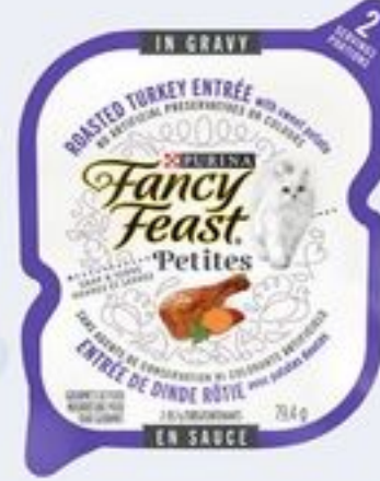
FANCY FEAST PETITES CAT FOOD SELECTED VARIETIES 79.4 G 21439968_EA