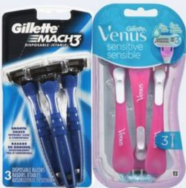
GILLETTE MACH 3 OR VENUS DISPOSABLE RAZORS 1-8'S SELECTED VARIETIES 20179414002_EA/201984907_EA