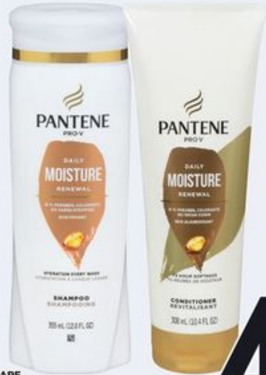
PANTENE HAIR CARE SELECTED VARIETIES 308-355 ML 21431190_EA/21431192_EA