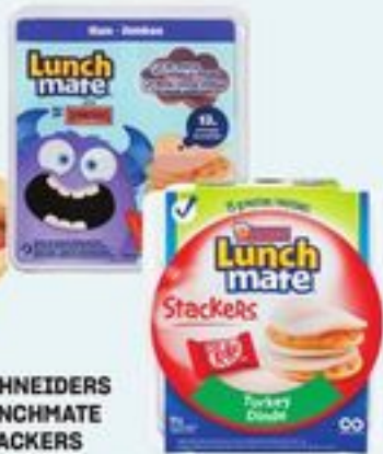
SCHNEIDERS LUNCHMATE STACKERS OR KITS SELECTED VARIETIES 90-132 G 21310834_EA 20770777_EA