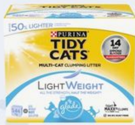
TIDY CATS LIGHT WEIGHT LITTER SELECTED VARIETIES 5.44 KG 21217951_EA