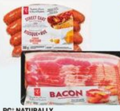
PC® NATURALLY SMOKED BACON 375-500 G OR PC® STREET CART SAUSAGE 500 G SELECTED VARIETIES 20152629_EA/21525048_EA