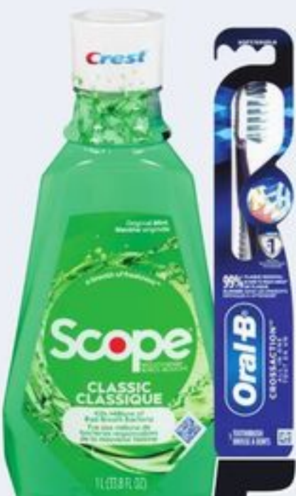
CREST SCOPE CLASSIC 1 L ORAL-B MANUAL TOOTHBRUSH OR CREST REGULAR 4-PACK TOOTHPASTE SELECTED VARIETIES 20347678002_EA/20948747_EA