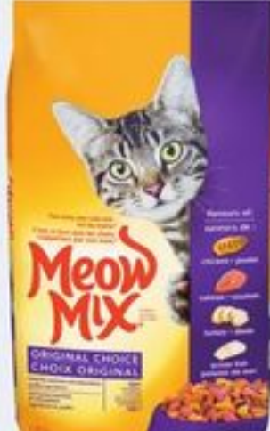
MEOW MIX CAT FOOD SELECTED VARIETIES 1.36-1.6 KG 21586251_EA