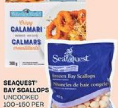
SEAQUEST® BAY SCALLOPS UNCOOKED 100-150 PER LB 400 G OR WATER VIEW MARKET CRISPY CALAMARI UNCOOKED 300 G FROZEN 21454797_EA/21558527_EA