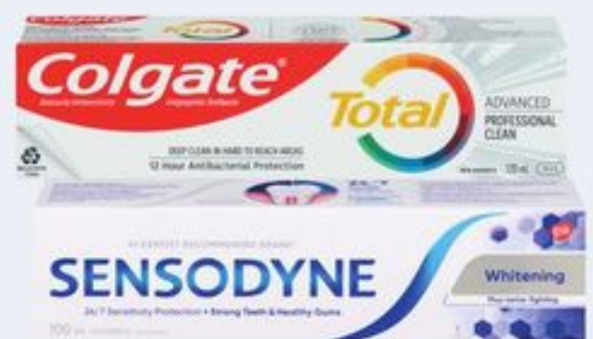
SENSODYNE OR PRONAMEL TOOTHPASTE 75-100 ML, POLIDENT OR POLIGRIP, COLGATE TOTAL OR SENSITIVE PRO-RELIEF TOOTHPASTE, COLGATE 360° MANUAL TOOTHBRUSHES OR COLGATE MOUTHWASH SELECTED VARIETIES 20301179001_EA/21166717_EA