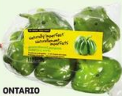
ONTARIO NO NAME® NATURALLY IMPERFECT® GREEN PEPPERS PRODUCT OF ONTARIO 2.5 LB 20969990001_EA