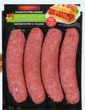
MARCANGELO JUMBO PORK SAUSAGE SELECTED VARIETIES FROZEN 500/675 G 21289731_EA/21289668_EA