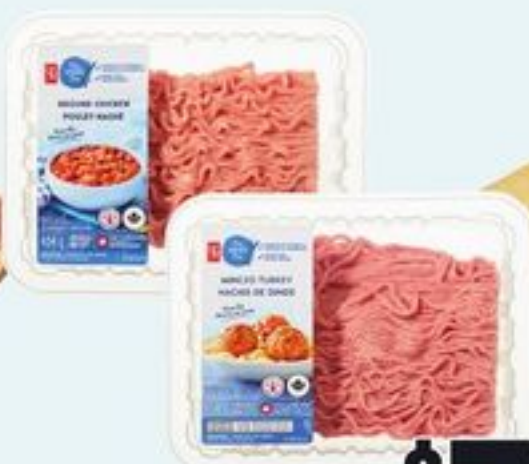
PC® BLUE MENU® GROUND CHICKEN OR TURKEY 454 G 21100091_EA/21100092_EA