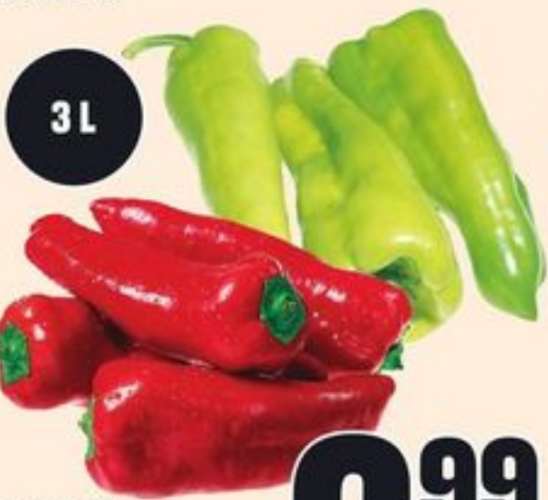
3 L ONTARIO SHEPHERD OR CUBANELLE PEPPERS PRODUCT OF ONTARIO 3 L 21042287001_EA 21042358001_EA