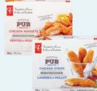
PC® PUB RECIPE® OR GLUTEN-FREE CHICKEN SELECTED VARIETIES FROZEN 600/700 G 21201320_EA/21201321_EA