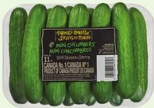
ONTARIO FARMER'S MARKET® MINI CUCUMBERS PRODUCT OF ONTARIO 11'S 21070679001_EA