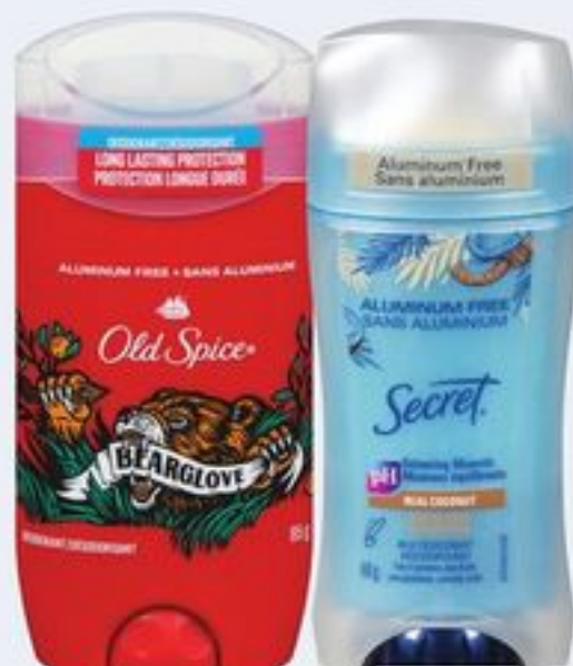
OLD SPICE OR SECRET DEODORANT SELECTED VARIETIES 68-144 G 20757237001_EA/21163772_EA