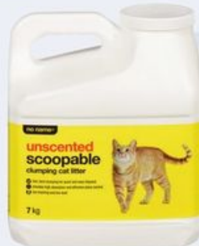
NO NAME ® CAT LITTER SELECTED VARIETIES 7 KG 20023746002_EA