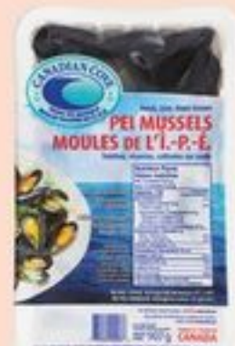
CANADIAN COVE MUSSELS FRESH 907 G 21556624_EA

Fresh seafood items subject to availability.