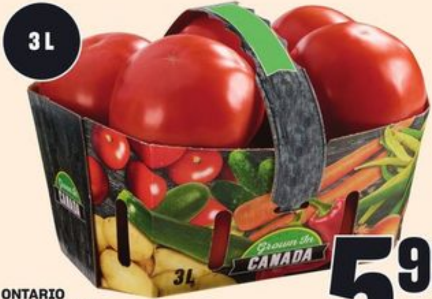
3 L ONTARIO FIELD TOMATOES PRODUCT OF ONTARIO 3 L 20006556_EA