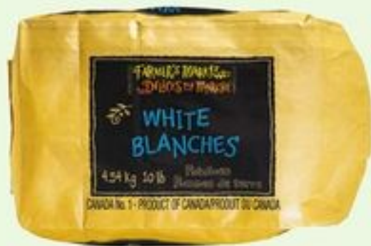
CANADA FARMER'S MARKET® WHITE POTATOES PRODUCT OF CANADA, CANADA NO. 1 GRADE 10 LB BAG 20600997001_EA