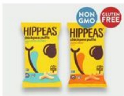
Hippes Chickpea Puffs 2/$6 4 pk