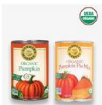
Farmer's Market Organic Pumpkin or Pie Mix 15 oz