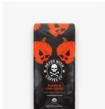
Death Wish Pumpkin Ground Coffee 9 oz