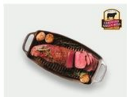
Certified Angus Beef Eye of Round or Bottom Round Roast 4.99LB