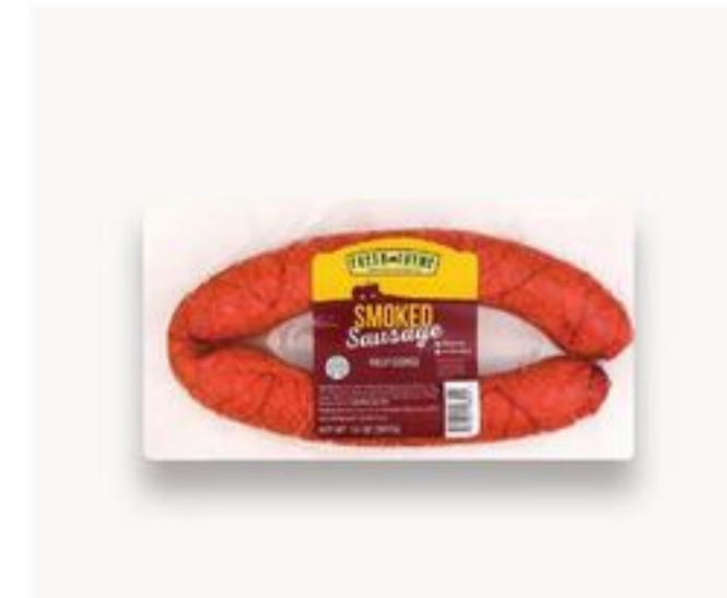
Fresh Thyme Smoked Sausage 14 oz, all varieties