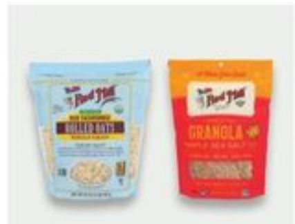
Bob's Red Mill All Breakfast 20% OFF 11-40 oz