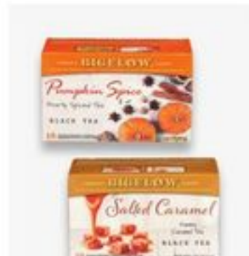
Bigelow Tea 18-20 ct