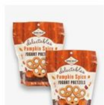
Hayden Valley Pumpkin Spice Yogurt Pretzels 5 oz