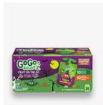
GoGo Squeeze Applesauce Halloween Pack 64 oz 20 pack