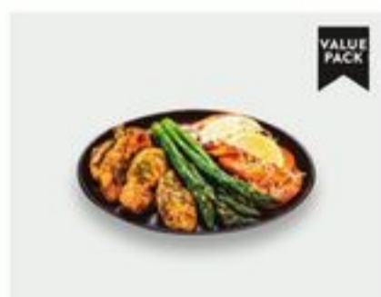
All-Natural Boneless Skinless Chicken Tenderloins 3.99LB