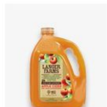
Langer Farms 100% Unfiltered Apple Cider 128 oz