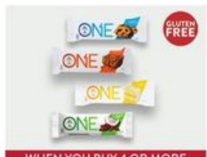
ONE Energy Bars 4/$8 60 grams