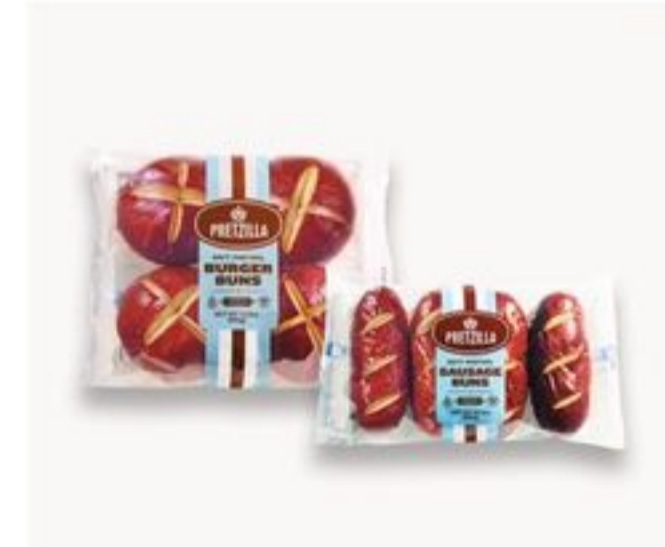
Pretzella Bun or Rolls 8.4-12.8 oz