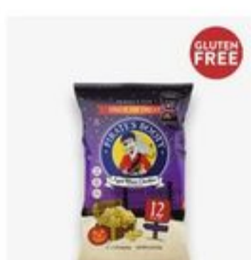
Pirate's Bounty Multipack Popcorn Snacks 12 pk, 0.5 oz while supplies last