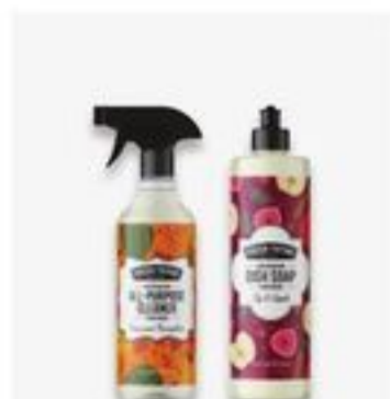
Fresh Thyme Fall Cleaners select varieties