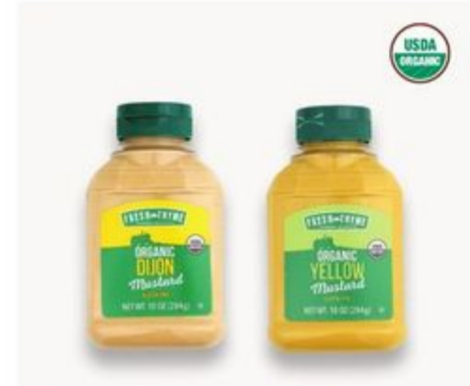
Fresh Thyme Organic Mustard 10 oz