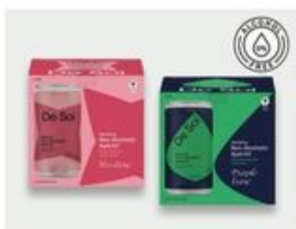
De Soi Non-Alcoholic Mocktails 12.99 select varieties, 4 pk