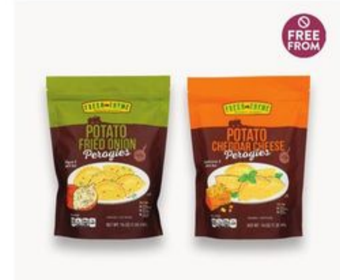
Fresh Thyme Frozen Perogies 16 oz