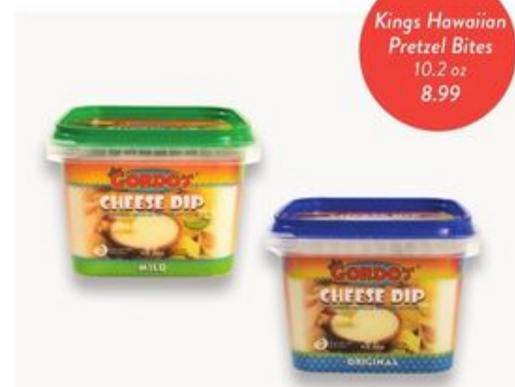
Gordos Dip Homestyle Queso, Original, Mild Cheese Dip 16 oz