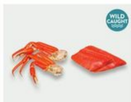
Jumbo Snow Crab Clusters or Sockeye Salmon Fillet 7.99LB previously frozen