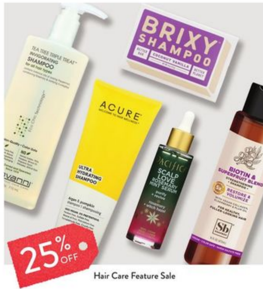
Hair Care Feature Sale