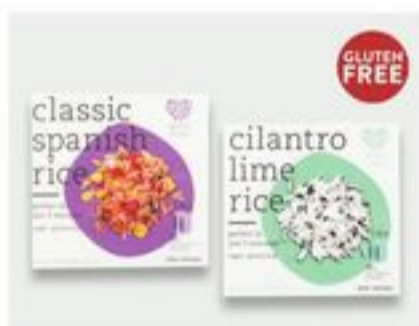
Grain Trust Frozen Rice 4.49 20-30 oz