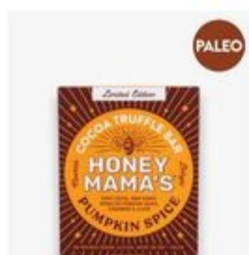
Honey Mama's Refrigerated Cocoa Truffle Pumpkin Spice Bar 2.5 oz