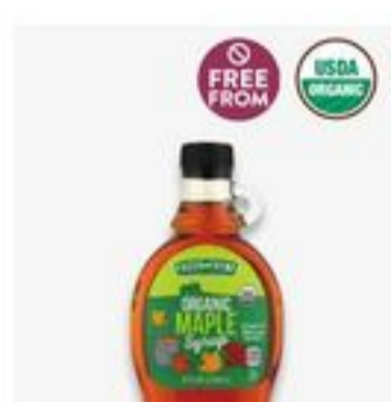
Fresh Thyme Organic Maple Syrup 8 oz everyday low price