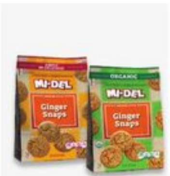
Mi-Del Ginger Snaps 8-10 oz