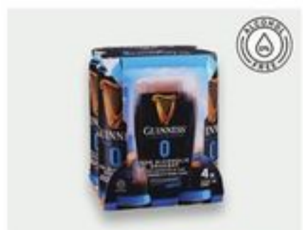
Guinness Zero Draught 7.99 4pk, 14.9 oz