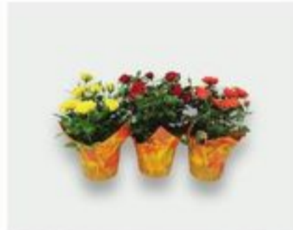
4" Mini Rose in Pot Cover 4.99