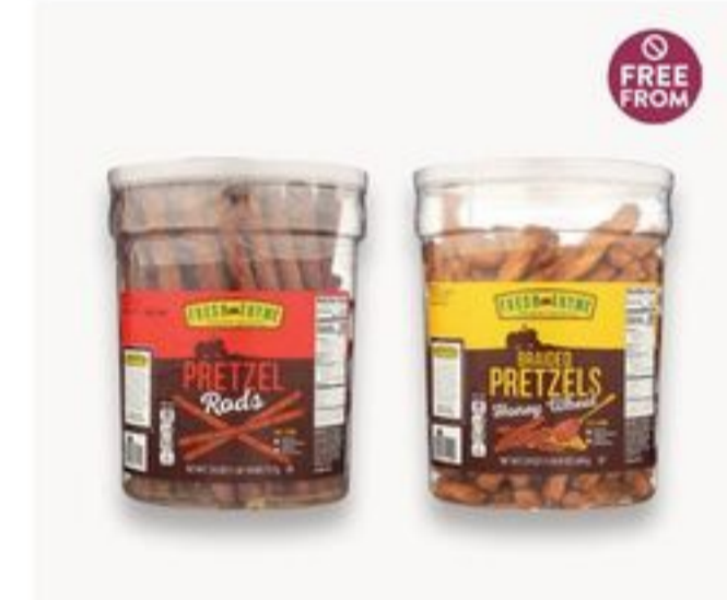
Fresh Thyme Pretzel Tubs 24-26 oz