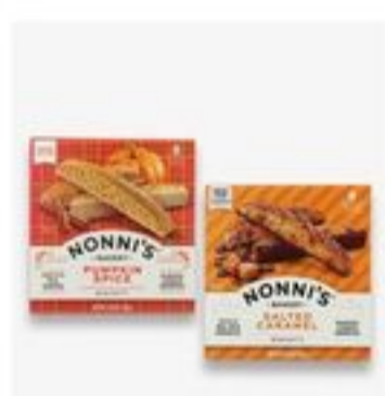
Nonni's Biscotti 5.52-6.88 oz