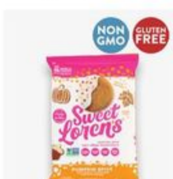
Sweet Loren's Pumpkin Spice Cookie Dough 9.6 oz