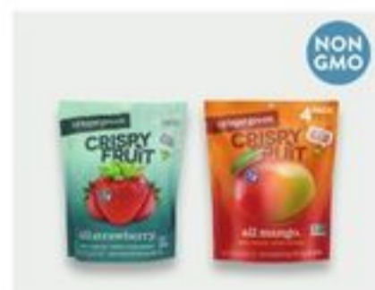
Crispy Green Freeze-Dried Fruit 6.99 4 pk, 1.69-3.39 oz