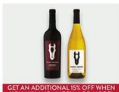
Dark Horse Wine 8.99 select varieties, 750 ml