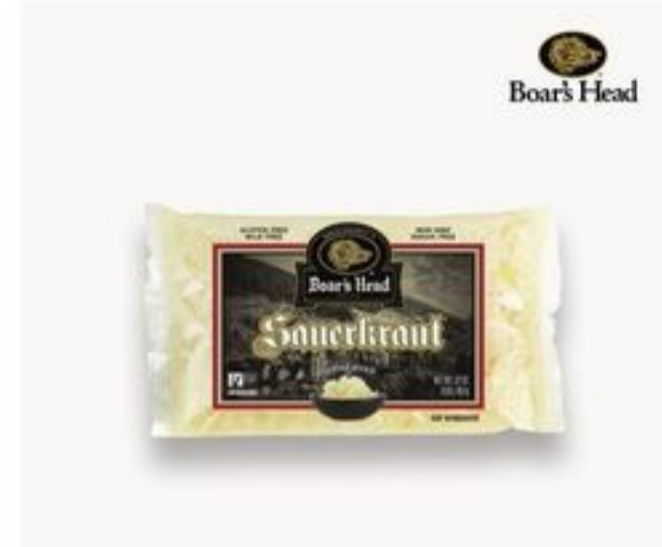
Boar's Head Sauerkraut 16 oz.