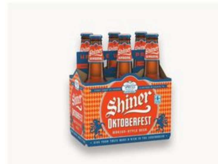
Shiner Oktoberfest 6 pk, 12 oz

Kings Hawaiian Pretzel Bites 10.2 oz 8.99