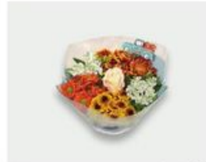
Fall Harvest Bouquet 7.99