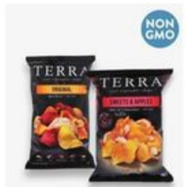
Terra Vegetable Chips 5-5.75 oz