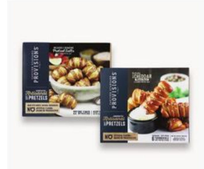
Eastern Standard Provisions Frozen Pretzels 5.25-13.3 oz