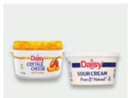
Daisy Cottage Cheese with Fruit or Sour Cream 2/$3 6 or 8 oz