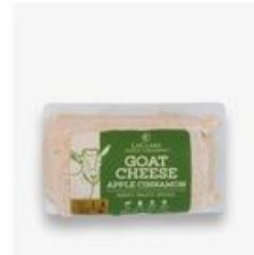
La Clare Apple Cinnamon Goat Cheese 4 oz