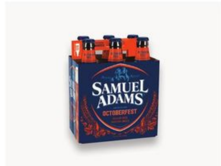
Sam Adams Seasonal Beer 6 pk, 12 oz