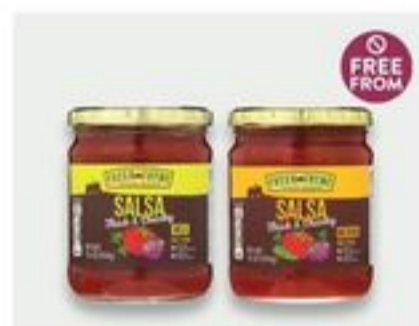
Fresh Thyme Salsa 2.99 16 oz everyday low price