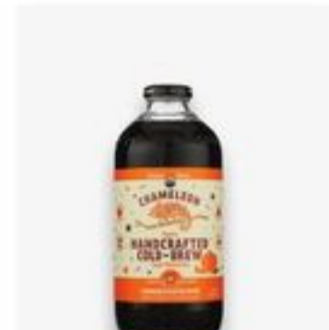
Chameleon Pumpkin Spiced Cold Brew 32 oz