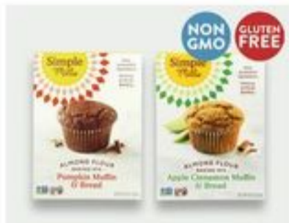
Simple Mills Baking Mixes 6.99 9-12.9 oz