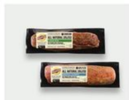
Hatfield Marinated Pork Loin Filets or Tenderloins 4.99 18.4-22 oz