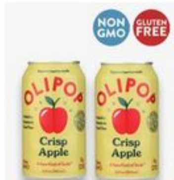
Olipop Prebiotic Crisp Apple Soda 12 oz