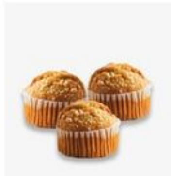
Fresh Thyme Home Made Pumpkin Muffins 4 pk