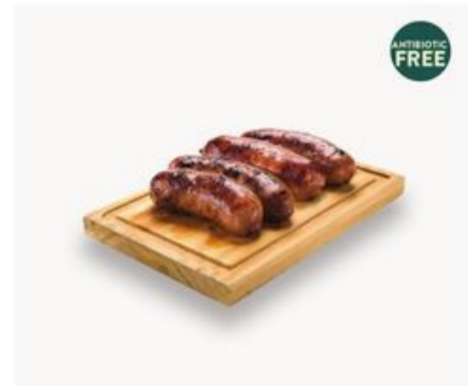
Fresh Thyme Gourmet Pork or Chicken Sausage Links