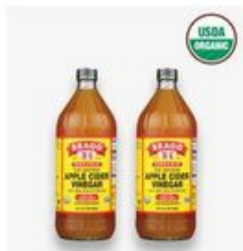
Bragg's Organic Apple Cider Vinegar 32 oz