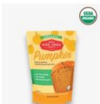
Miss Jones Baking Co Organic Pumpkin Bread Mix 16 oz while supplies last