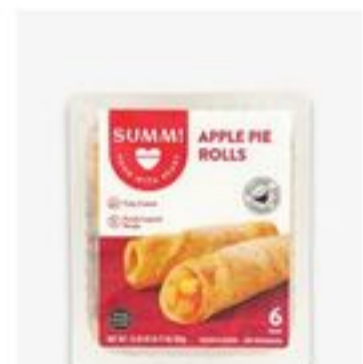
Summ Apple Pie Rolls 12.35 oz