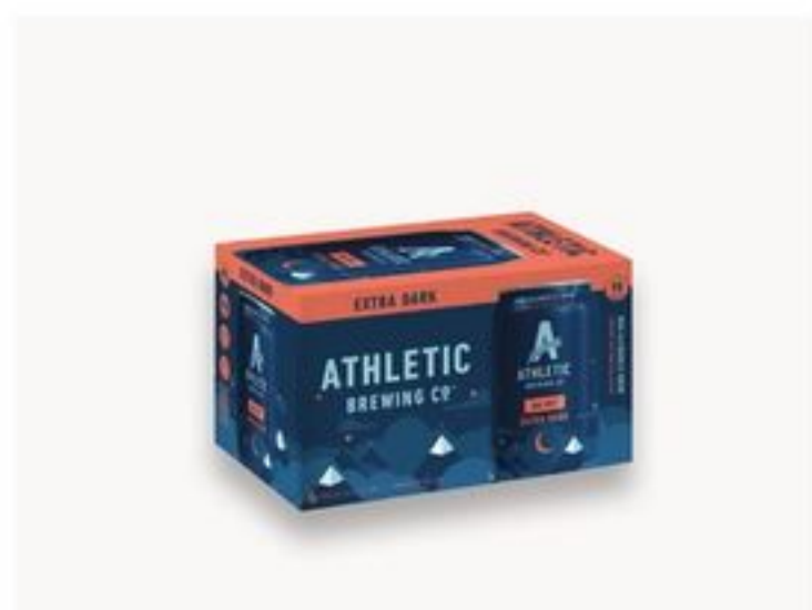
Athletic Brewing Seasonal Beer 6 pk, 12 oz