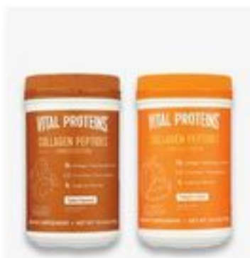
Vital Proteins Salted Caramel or Pumpkin Spice Collagen Peptides