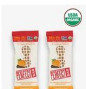
Perfect Bar Pumpkin Pie Bar 2.2 oz