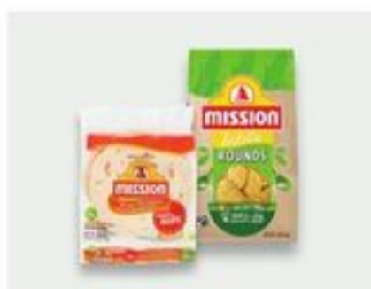
Mission Tortillas or Chips 20% OFF 8-22.5 oz