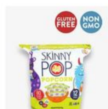
Skinny Pop Multipack Popcorn Snacks 12 pk, 0.5 oz while supplies last