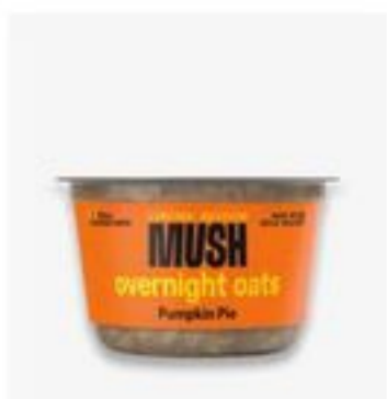
Mush Overnight Pumpkin Pie Oats 5 oz