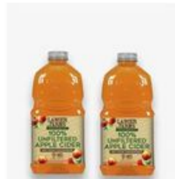
Langer Farms 100% Unfiltered Apple Cider 64 oz