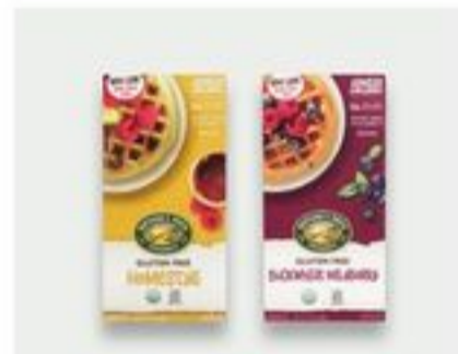
Nature's Path Frozen Waffles 3.99 7.4 oz