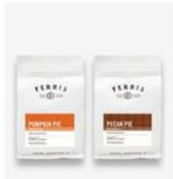
Ferris Pumpkin or Pecan Coffee 12 oz