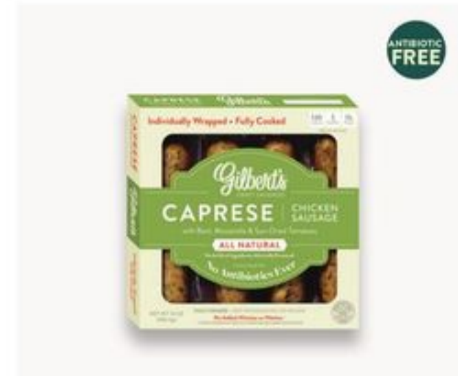
Gilbert's Antibiotic-Free Chicken Sausage 10 oz