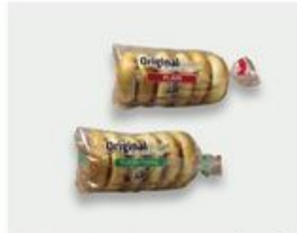
Original Bagel New York Style Bagels 3.99 select varieties, 15.6-25.5 oz