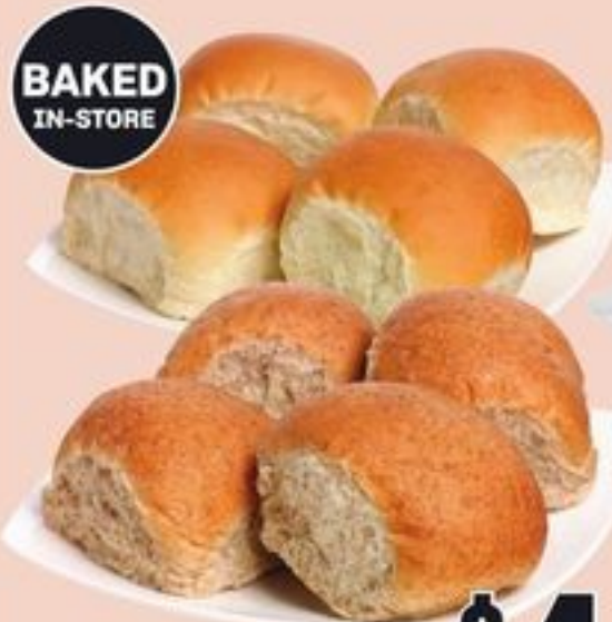
DINNER ROLLS WHITE OR WHEAT 12'S 21392649_EA/21392192_EA