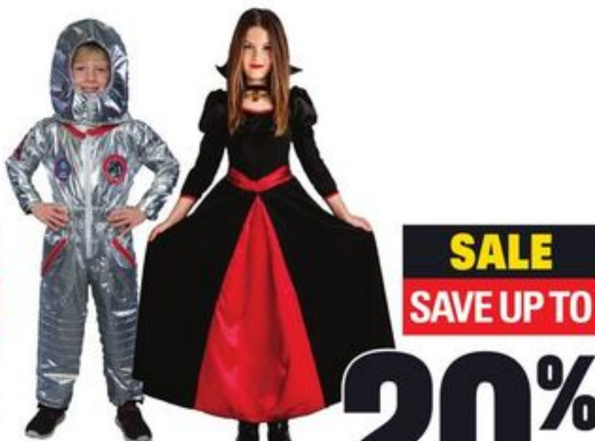
HALLOWEEN COSTUMES SELECTED VARIETIES 21580004_EA/21580039_EA