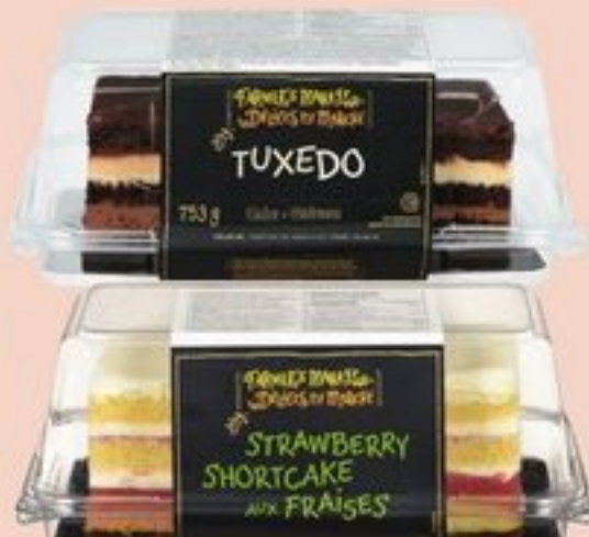
FARMER'S MARKET™ BAR CAKES SELECTED VARIETIES 675-770 G 21500612_EA 21500763_EA