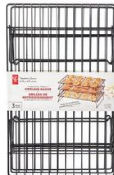
PC® METAL BAKEWARE AND METAL BAKEWARE SETS SELECTED VARIETIES 21154308_EA/21499789_EA