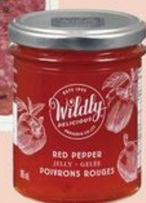
MIX & MATCH BOURSIN 150 G, PC® BRIE 200 G, SAPUTO BOCCONCINI 200 G, MASTRO SLICED SALAMI 125-150 G, WILDLY DELICIOUS JELLY 185 G OR RAINCOAST CRISPS 150 G SELECTED VARIETIES 20116794_EA/20708942_EA