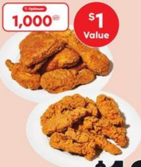
CHICKEN FAVORITES SELECTED VARIETIES, SERVED HOT OR CHILLED 320-700 G 20137058_EA/20992187_EA