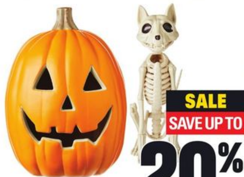
HALLOWEEN PUMPKINS AND DÉCOR 21591759_EA/21576579_EA