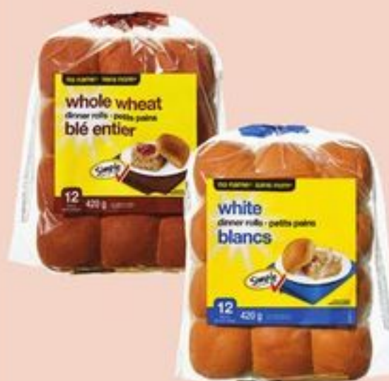
NO NAME™ DINNER ROLLS WHITE OR WHOLE WHEAT 12'S 21431223_EA/21431243_EA