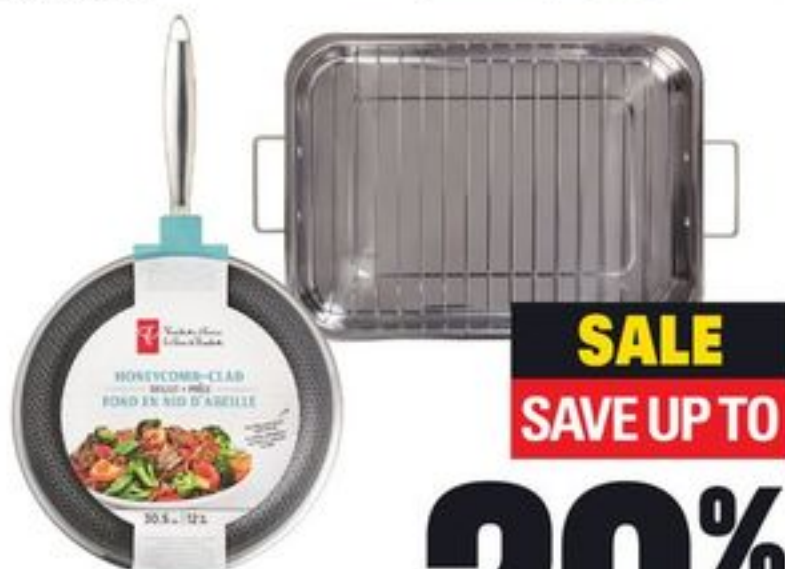
PC® COOKWARE, SKILLETS, WOKS, ROASTERS, SKILLET SETS AND COOKWARE SETS SELECTED VARIETIES 20765811_EA/21492022_EA