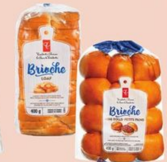
PC® BRIOCHE MINI ROLLS OR SLICED LOAF 400 G 21050280_EA/21410779_EA