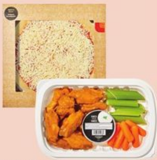
12 PIECE PRE-PACK SAUCED WINGS 728 G AND 12" TAKE AND BAKE PIZZA 510-739 G SELECTED VARIETIES 21456393_EA/21456401_EA