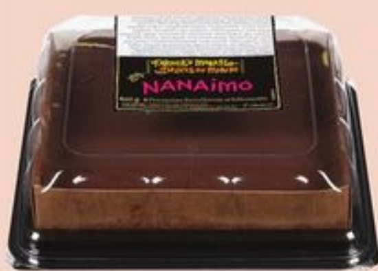
FARMER'S MARKET™ SQUARES SELECTED VARIETIES 400/450 G 21216501_EA