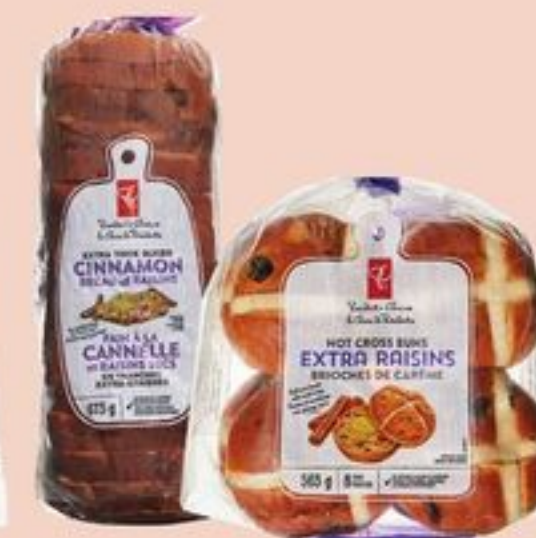
PC® HOT CROSS BUN OR EXTRA THICK CINNAMON RAISIN BREAD 565/675 G 20639729_EA/21577822_EA