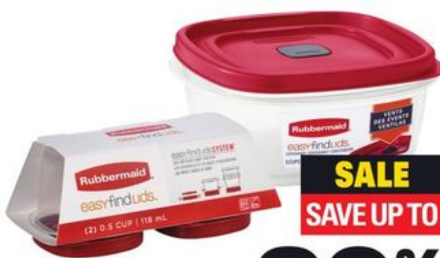
RUBBERMAID FOOD STORAGE CONTAINERS SELECTED VARIETIES 20087546_EA/21182993_EA