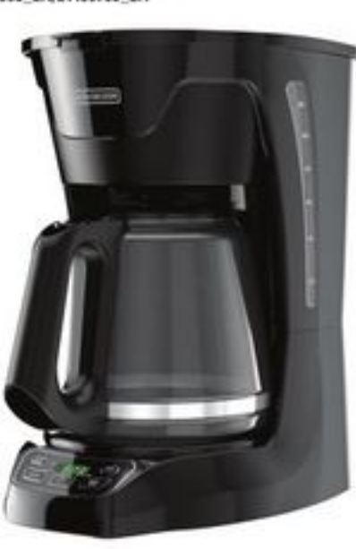
BLACK & DECKER APPLIANCES SELECTED VARIETIES 21195531_EA/21396843_EA