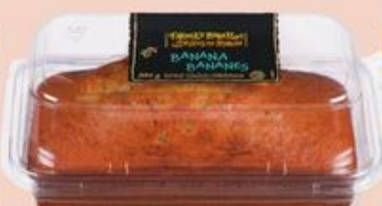
FARMER'S MARKET™ LOAF CAKES WHOLE OR SLICED SELECTED VARIETIES 344-400 G 20565382_EA/21488954_EA