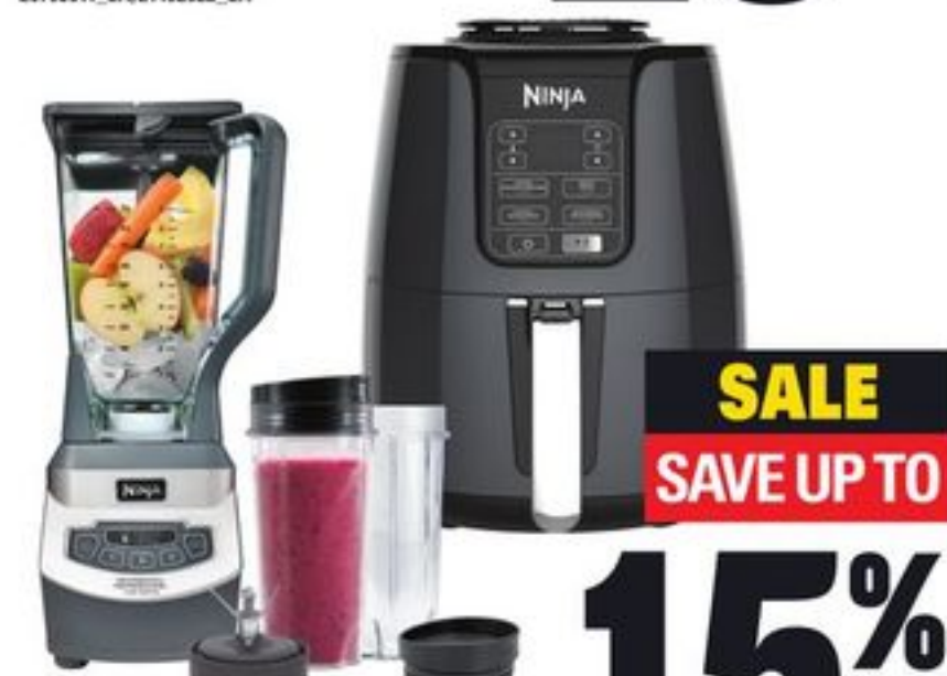
NINJA APPLIANCES SELECTED VARIETIES 21103386_EA/21204063_EA