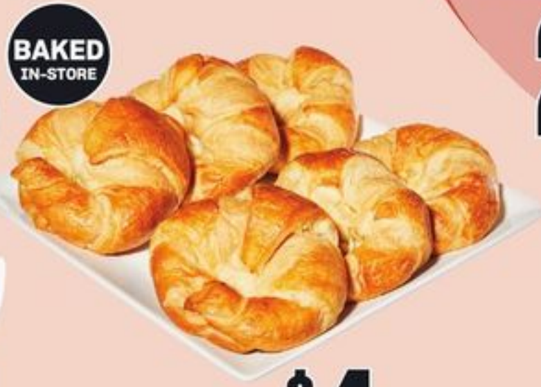
PLAIN CROISSANTS 6'S 21830153_EA