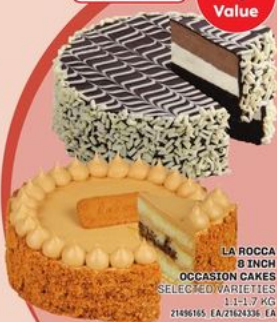
LA ROCCA 8 INCH OCCASION CAKES SELECTED VARIETIES 1.1-1.7 KG 21496165_EA/21624336_EA