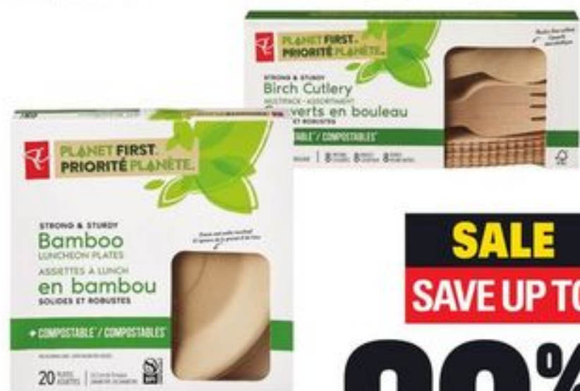
PC® PLANET FIRST™ BAMBOO PLATES, BIRCH CUTLERY OR WHEAT STRAWS SELECTED VARIETIES 21350519_EA/21353079_EA