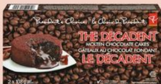
PC® 2 PACK FROZEN DESSERTS SELECTED VARIETIES 113-290 G 20800613_EA