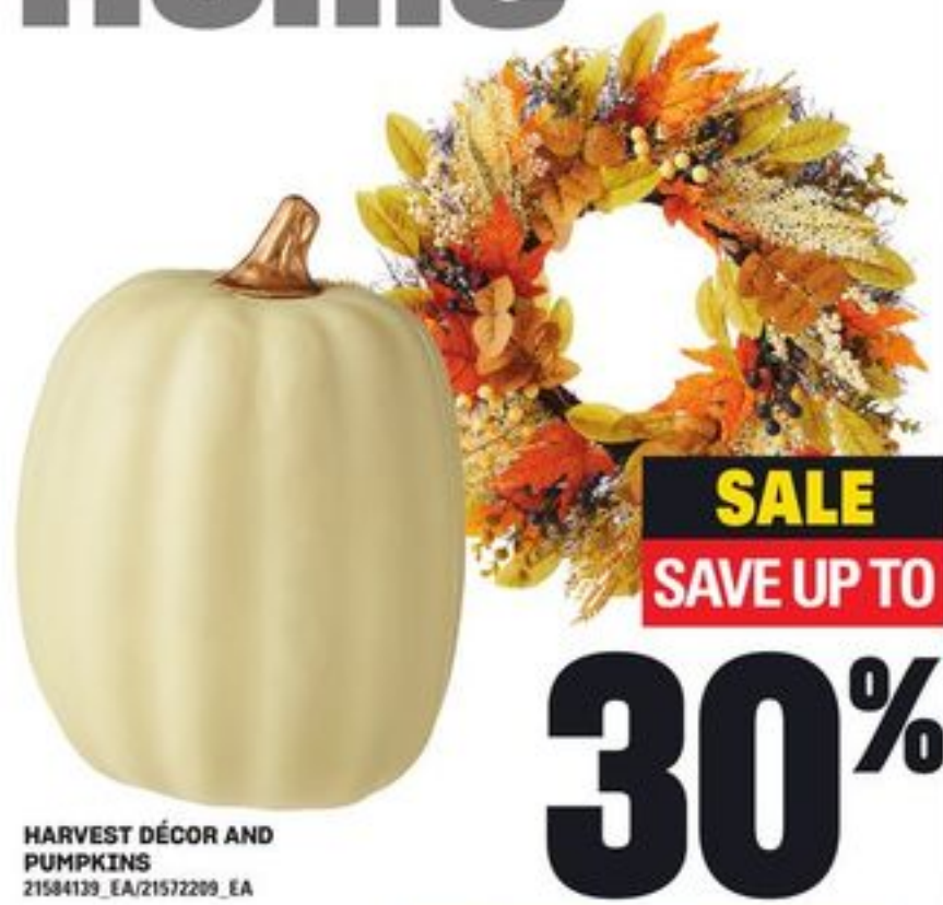
HARVEST DÉCOR AND PUMPKINS 21584139_EA/21572209_EA