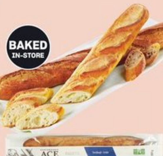
ACE BAKERY BAGUETTE SELECTED VARIETIES 325-400 G 20171171_EA/21314348_EA