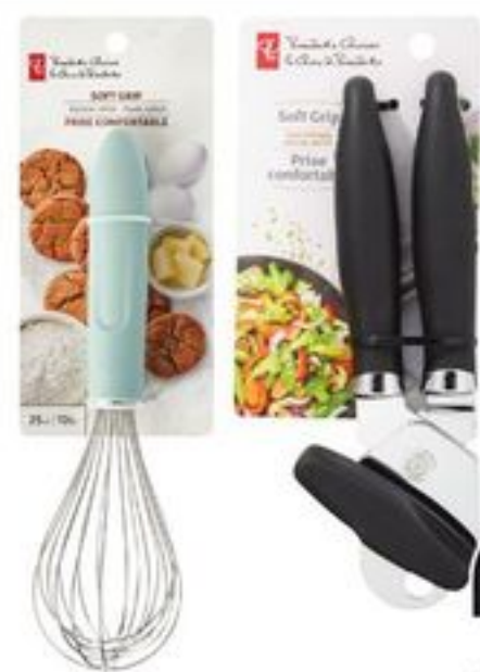
PC® KITCHEN GADGETS SELECTED VARIETIES 21345430_EA/21190090_EA