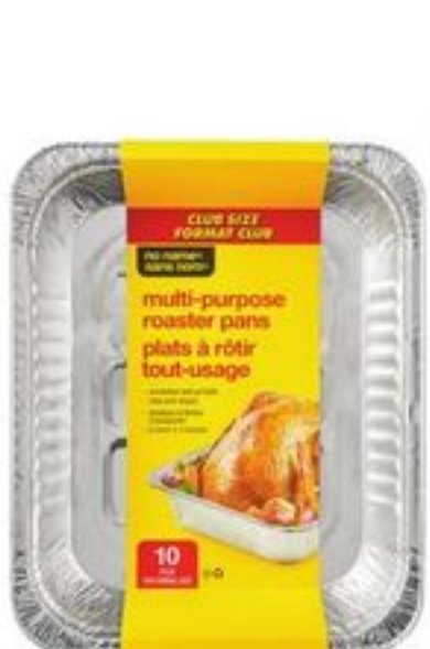
NO NAME® CLUB SIZE FOILWARE SELECTED VARIETIES 21424898_EA/21424907_EA