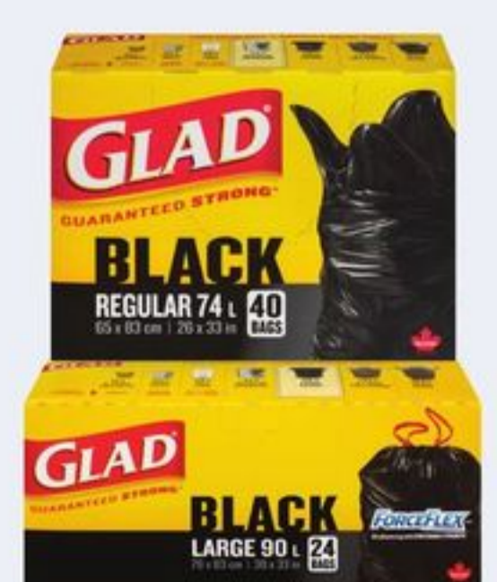
GLAD OUTDOOR BAGS SELECTED VARIETIES 10-90'S 21165477_EA