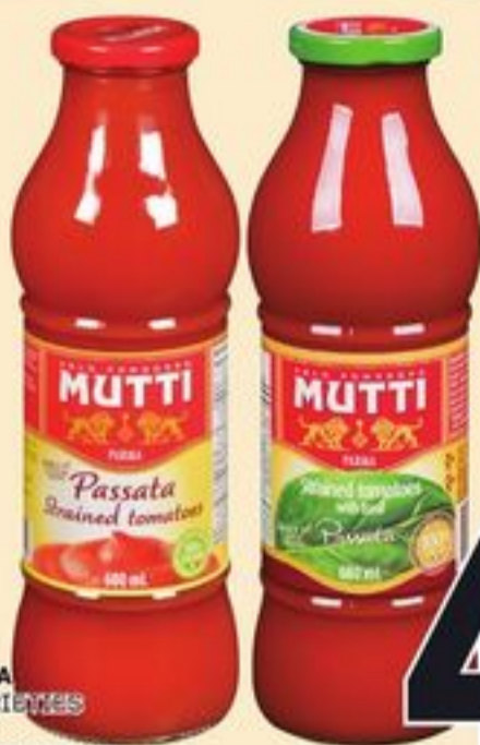
MUTTI PASSATA SELECTED VARIETIES 690 ML 20288490001_EA/20288490002_EA