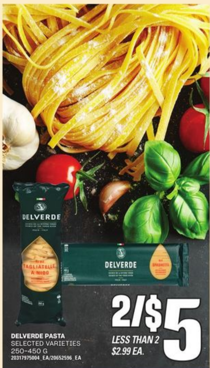
DELVERDE PASTA SELECTED VARIETIES 250-450 G 20317975004_EA/20652596_EA