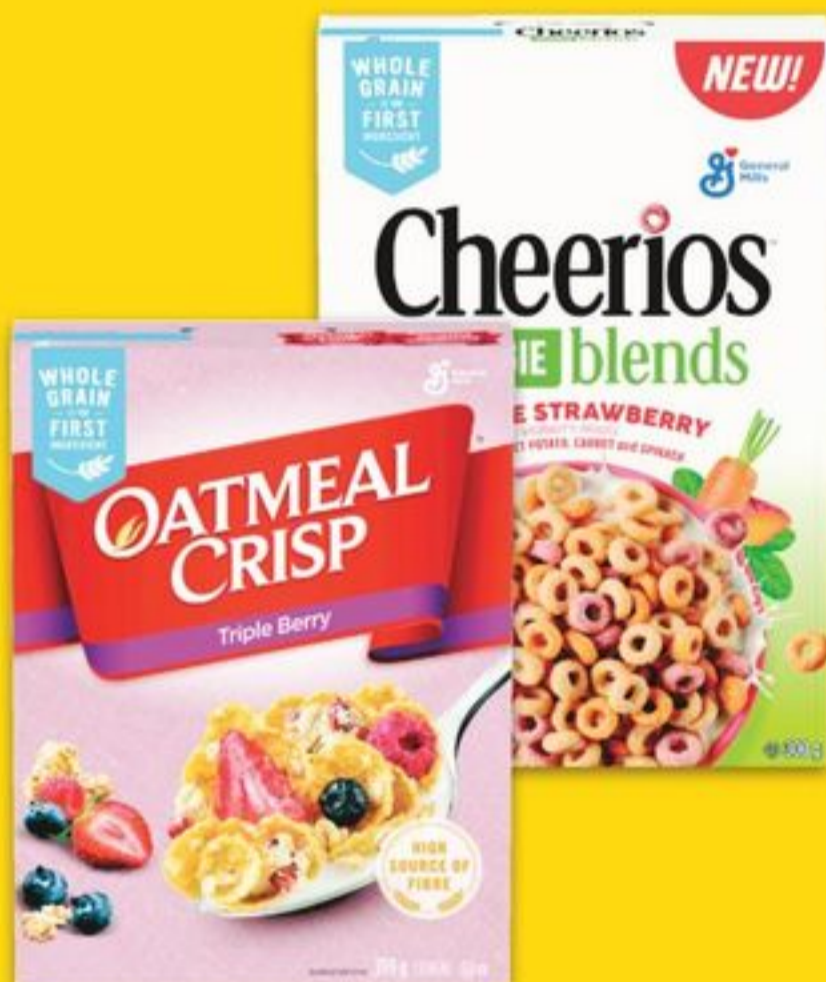
GENERAL MILLS CHEERIOS VEGGIE BLENDS, CHEX, LOADED BITES, OATMEAL CRISP AND NATURE VALLEY GRANOLA CEREAL selected varieties, 300-437 g 21232648 SA/21399148 SA