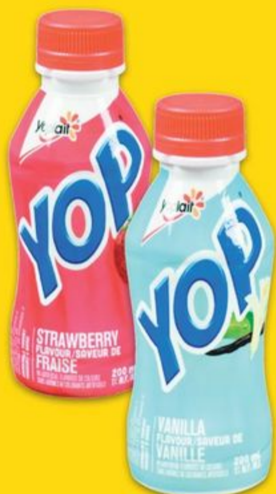
YOPLAIT YOP DRINKABLE YOGURT selected varieties 200 mL 21478178 SA/21478300 SA