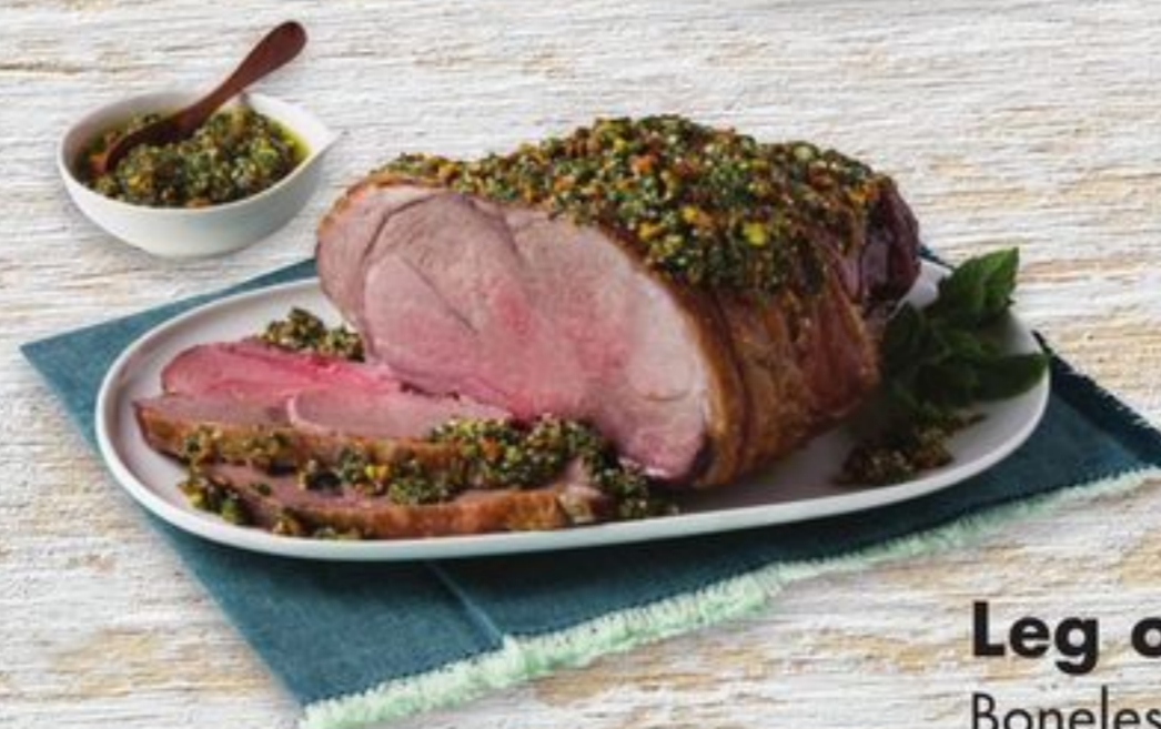
Leg of Lamb Boneless.