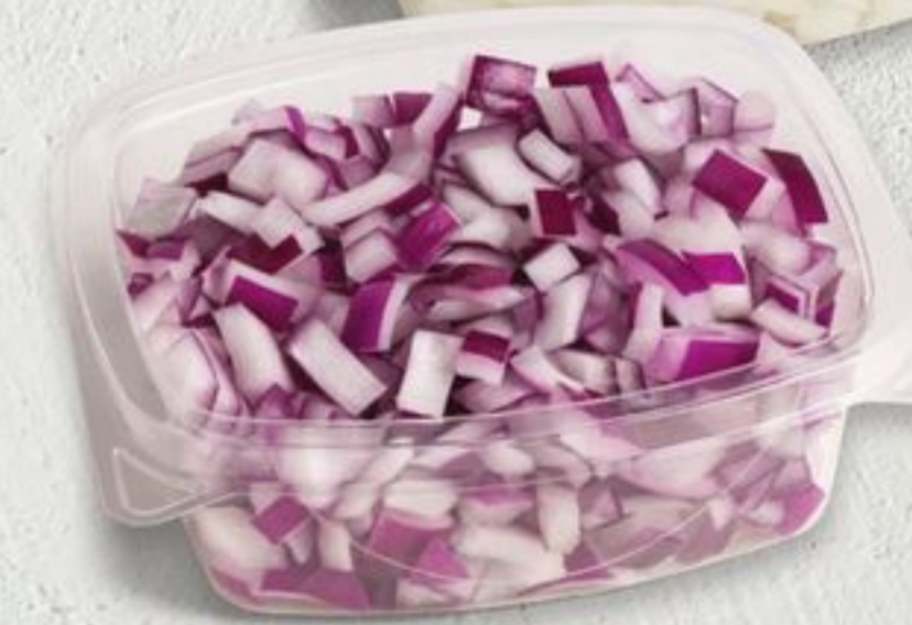
Chopped Red Onions 7-oz.