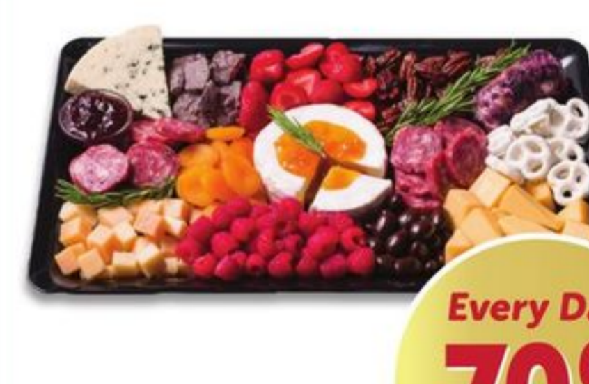
Sweet Treat Tray