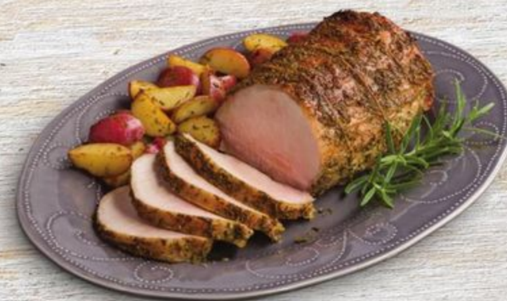
Pork Loin Roast Boneless.