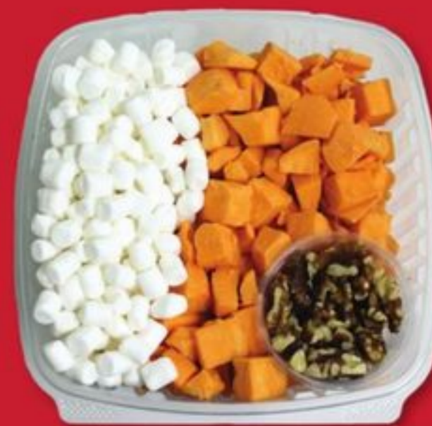
Candied Yams 25-oz.