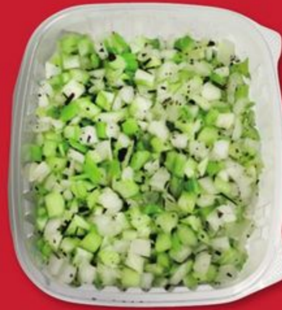
Stuffing Mix 20-oz.