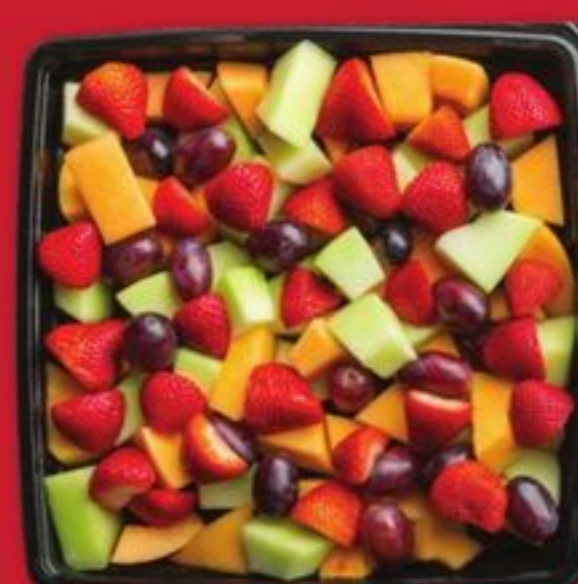
Family Size Fruit Salad Tray 83-oz.