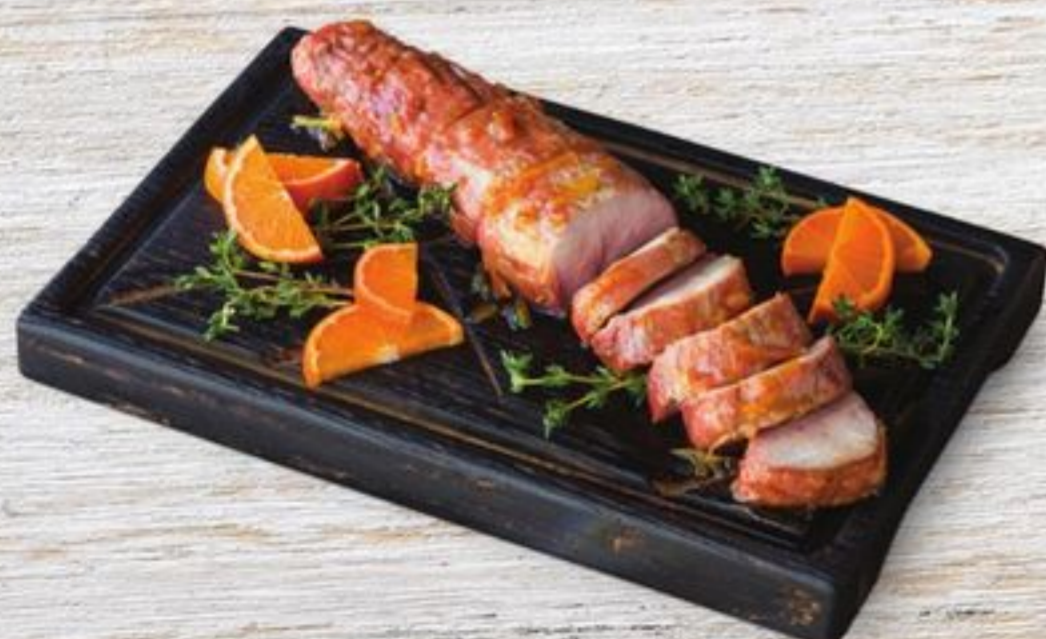
Pork Tenderloin Boneless.