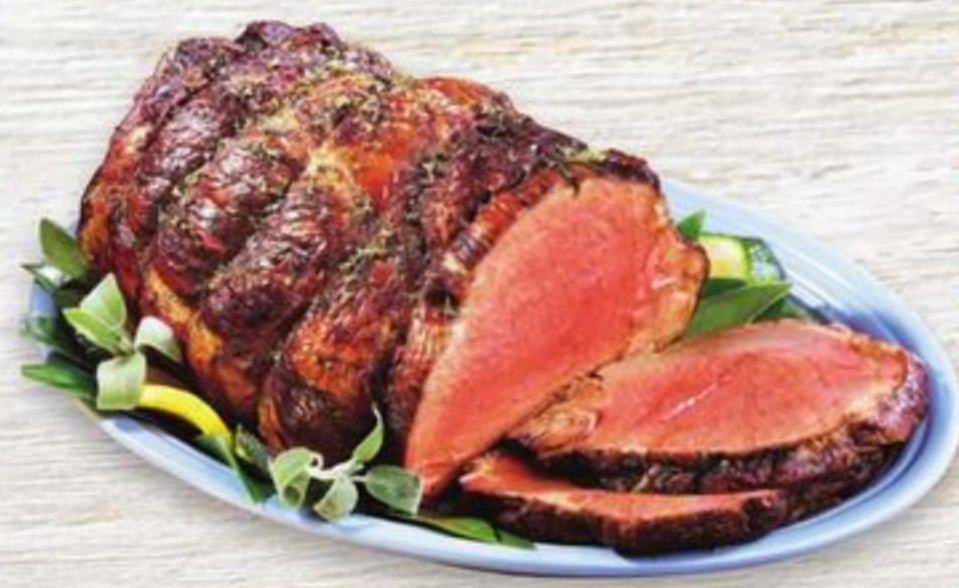
Beef Chuck Cross Rib Roast Boneless.