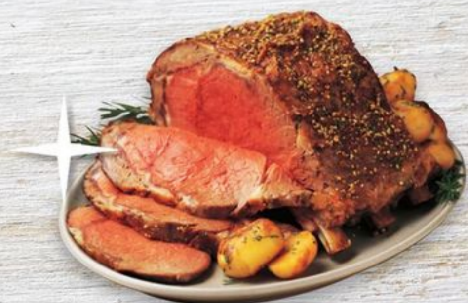
Beef Rib Eye Roast Bone-In.