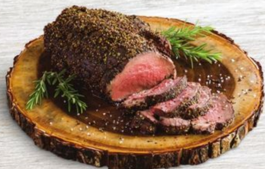
Beef Tenderloin Filet Roast Boneless.