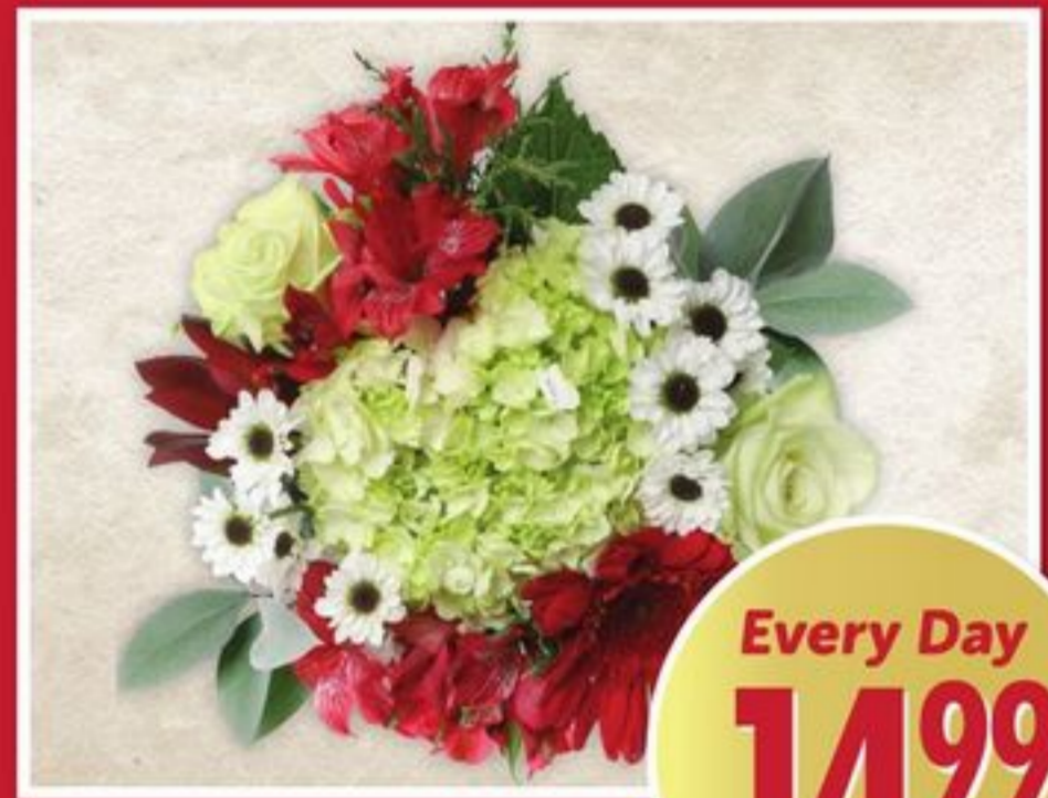
Tis' The Season Bouquet