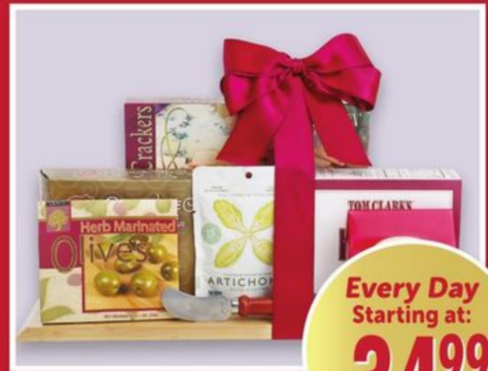
Pre-Made Gift Basket Selected varieties.