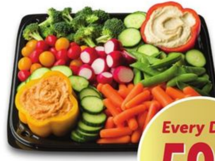
Vegetable and Hummus Tray