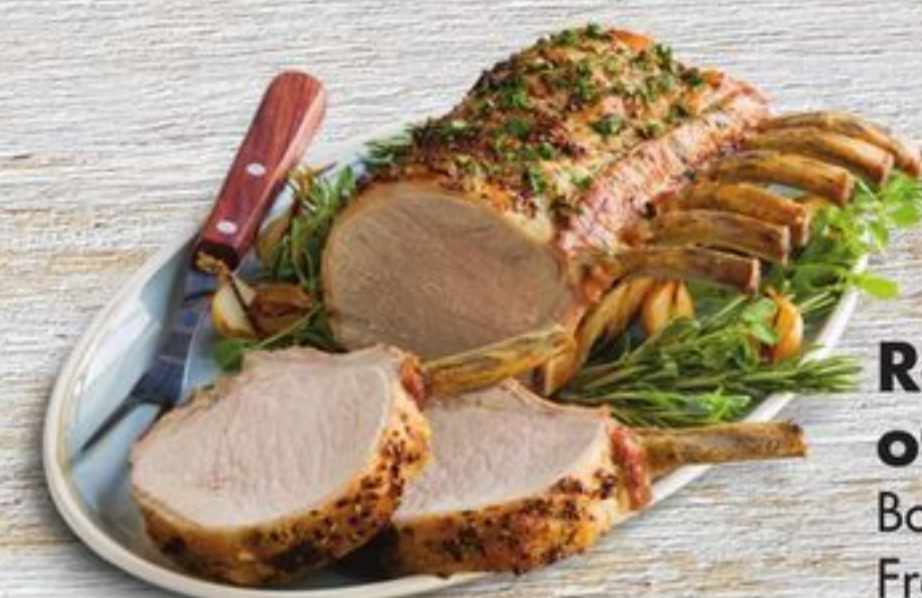
Rack of Pork Bone-In. French Cut.