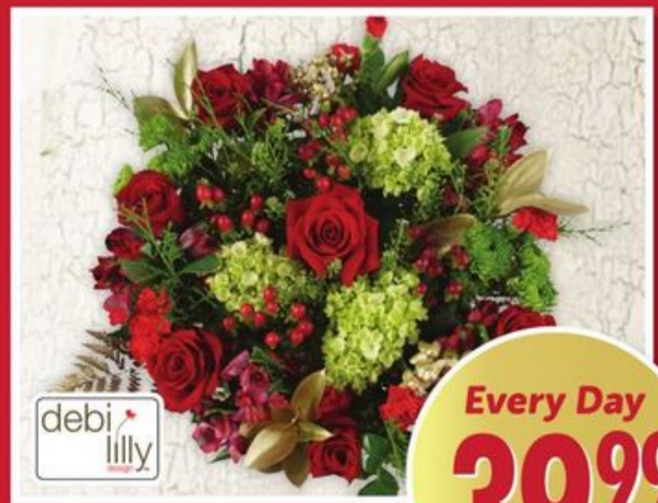
debi lilly design™ Christmas Lux Bouquet