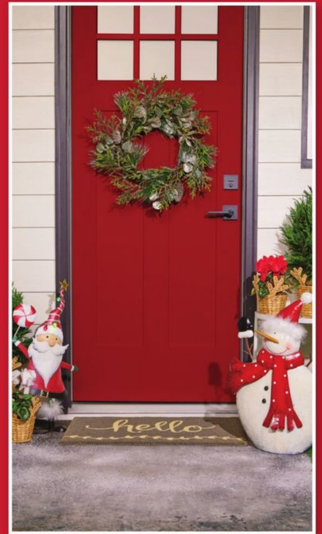
Celebrate the Holidays with Decorative Touches for your Home