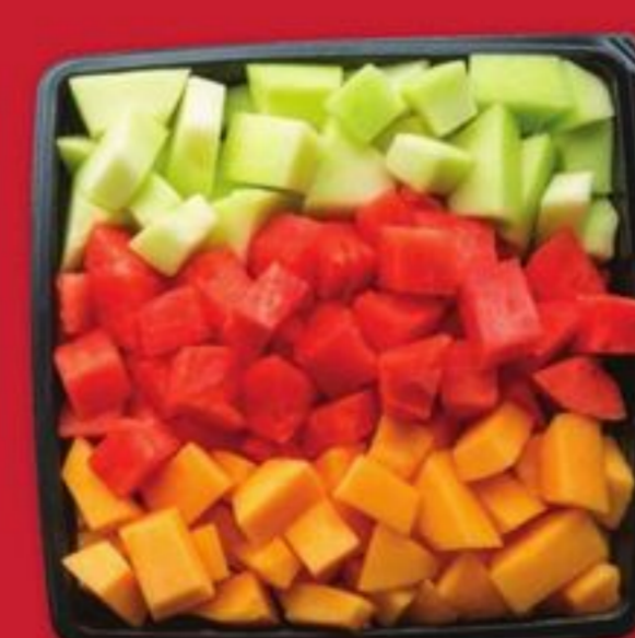
Family Size Melon Medley 83-oz.