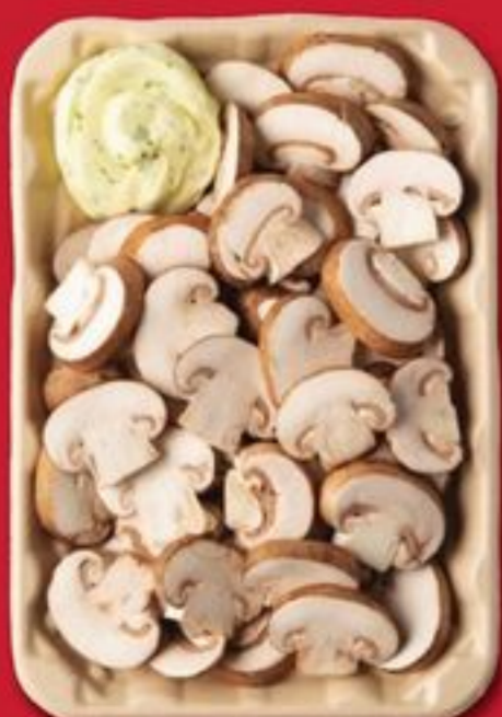
Mushrooms with Roasted Garlic Butter Tray 8.75-oz.