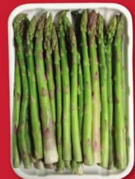
Small Asparagus Tray 10-oz.