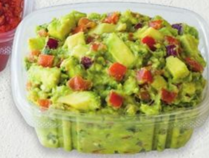
Guacamole – Mild or Spicy 14-oz.