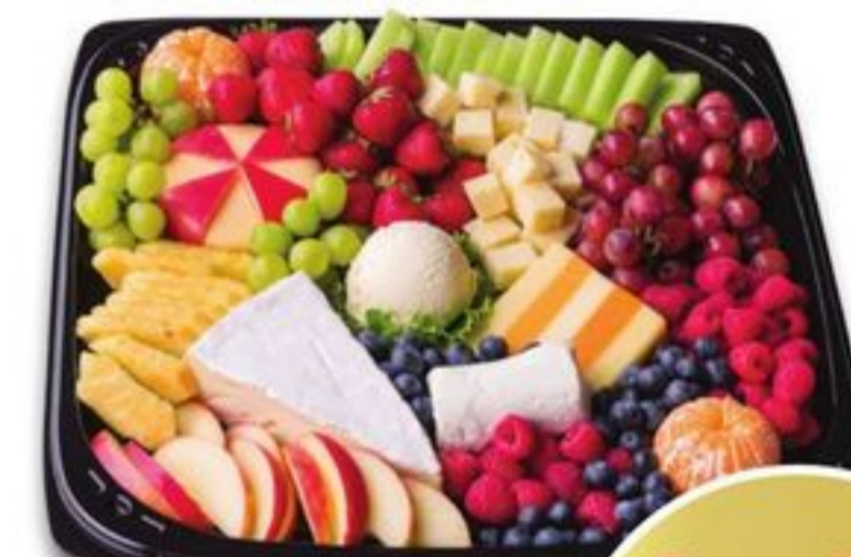
Fine Cheese & Fruit Tray