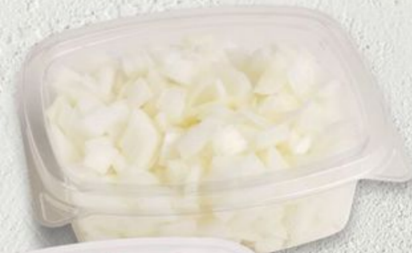
Chopped Yellow Onions 6-oz.