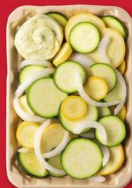
Small Squash Tray with Garlic Butter 14-oz.

Veggies come pre-packaged, pre-cut and full of delicious flavoring. Just cook and enjoy.