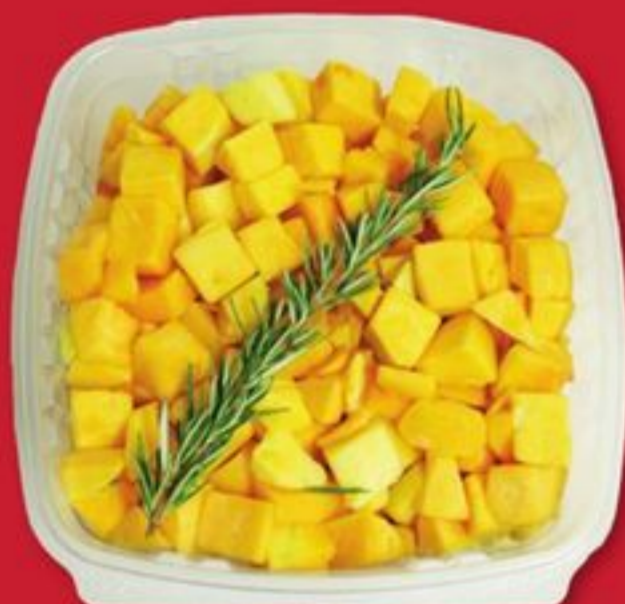
Butternut Squash with Rosemary 32-oz.