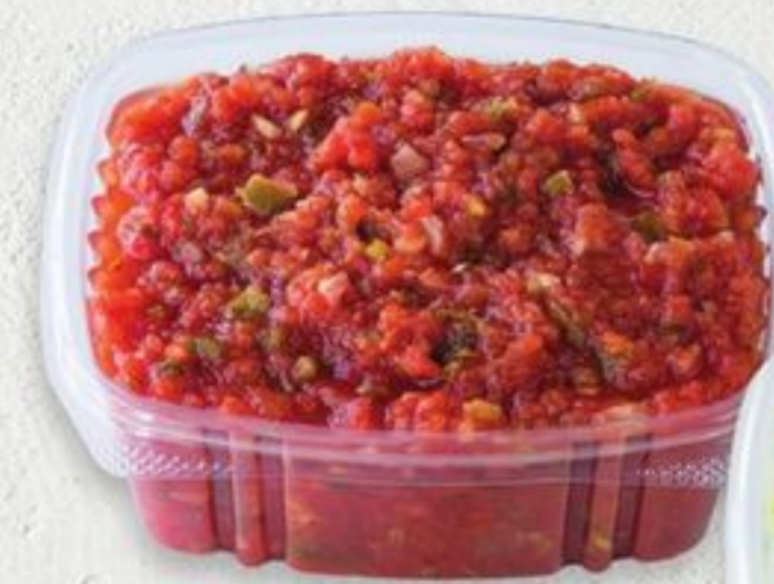
Salsa – Mild or Spicy 12-oz.