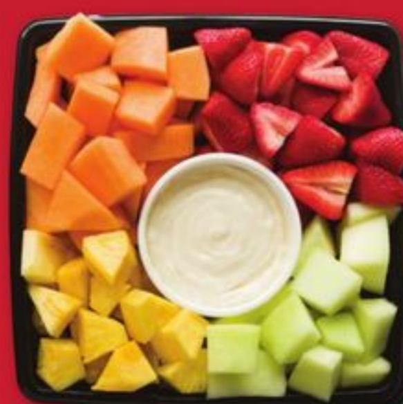
Fruit Tray with Dip 60-oz.