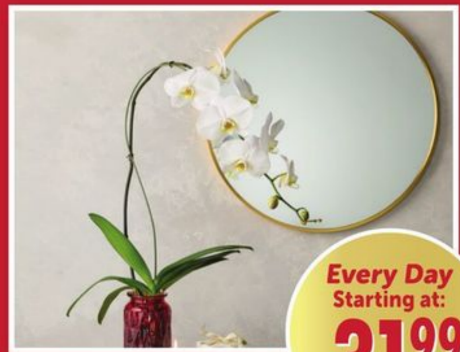
Orchid Phalaenopsis 4-in.