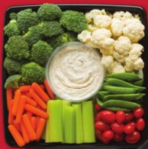
Premium Vegetable Tray with Dip 46-oz.