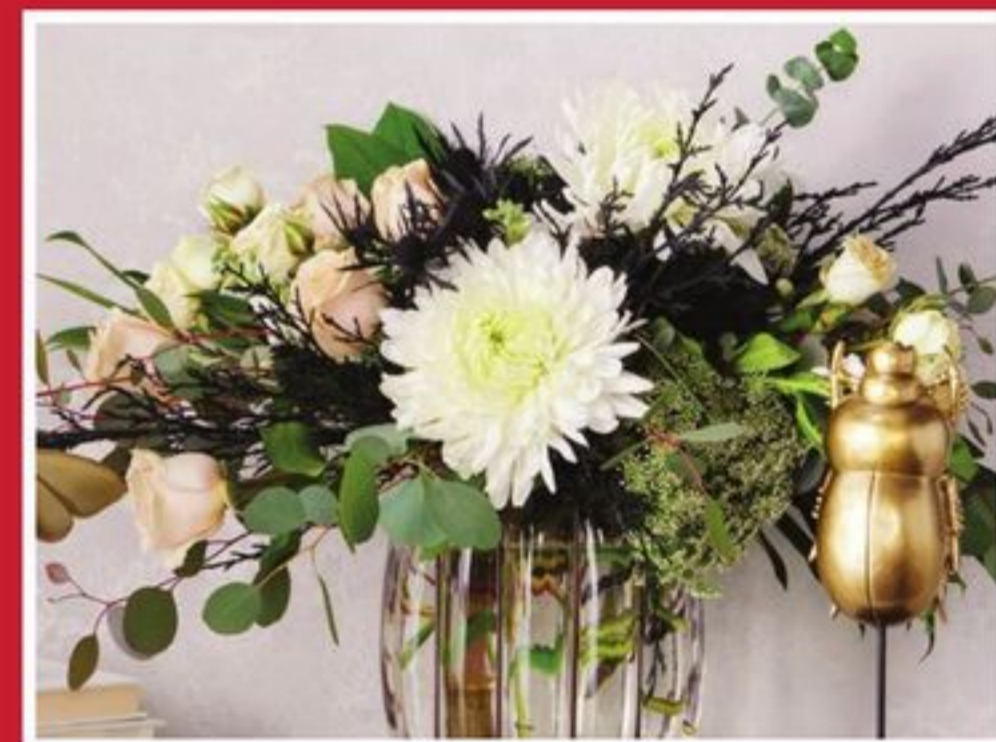
Fall Mum In 6-inch pot.