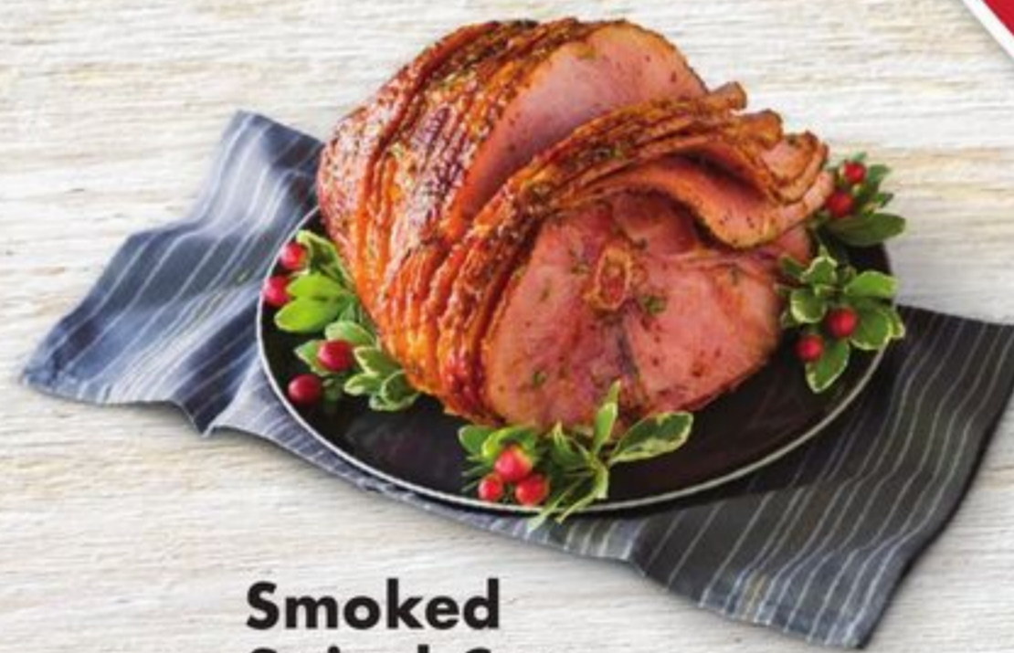
Smoked Spiral Cut Half Ham Bone-In.