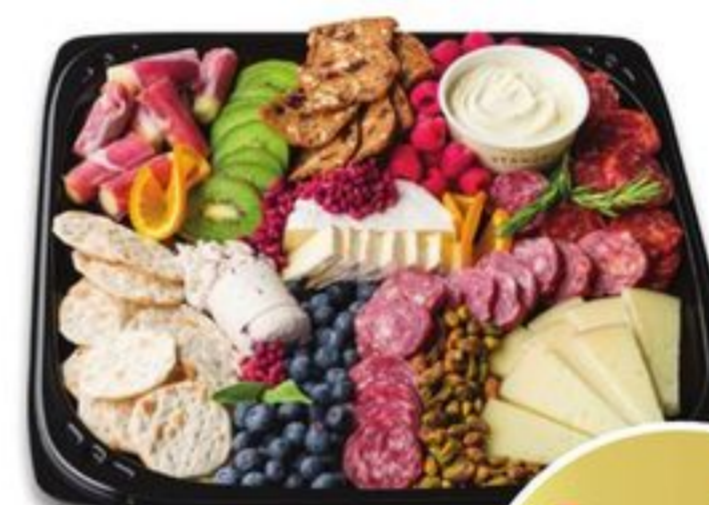
Elegant Charcuterie Tray

Ask about upgrading to a Boar's Head Party Tray Today!