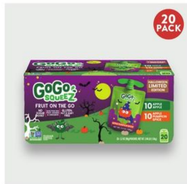
GoGo Squeeze Applesauce Halloween Pack 64 oz