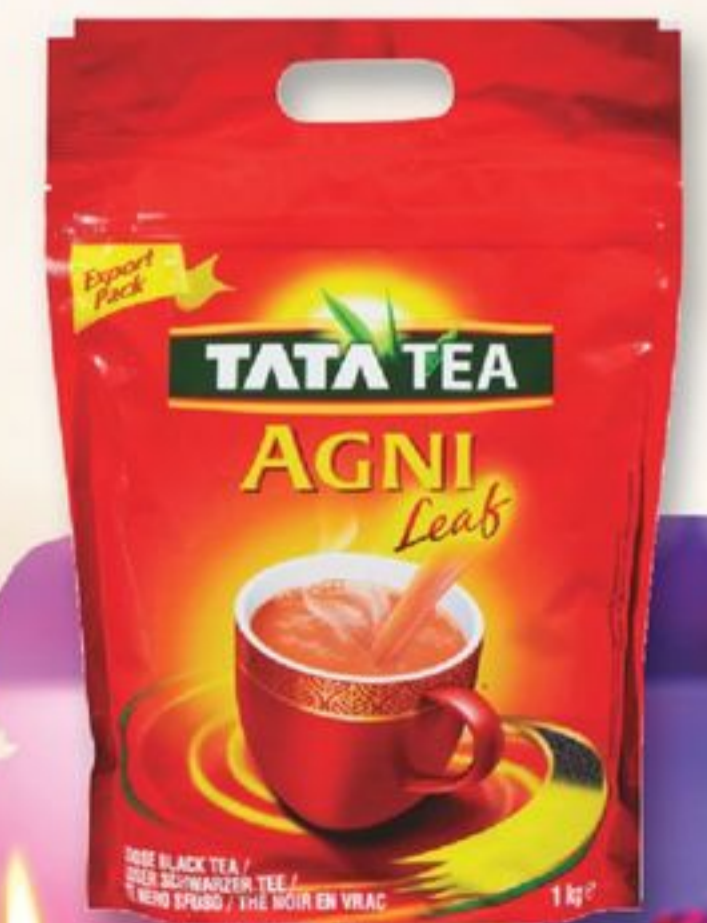
Tata Agni Loose Leaf Tea 1 kg