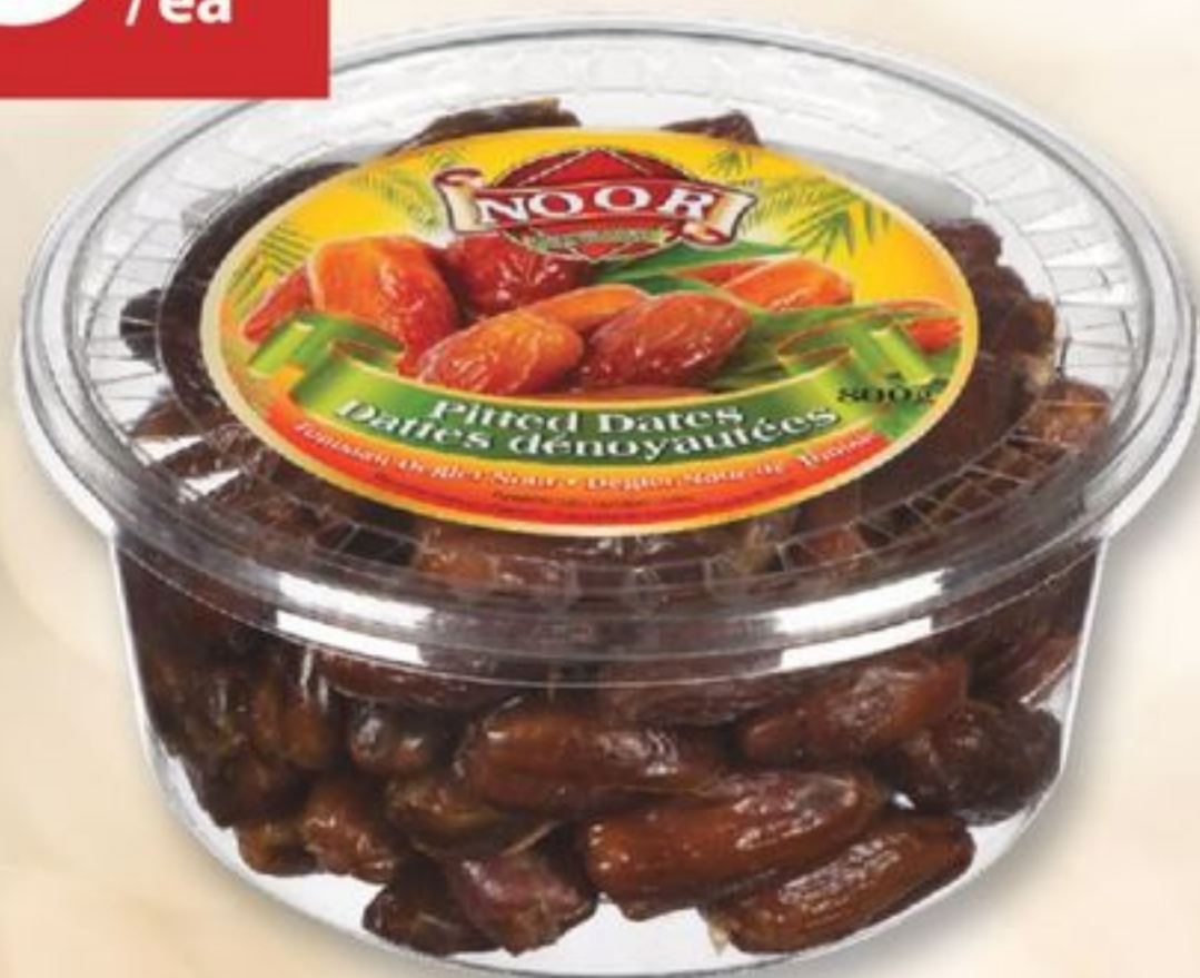
Noor Pitted Dates 800 g