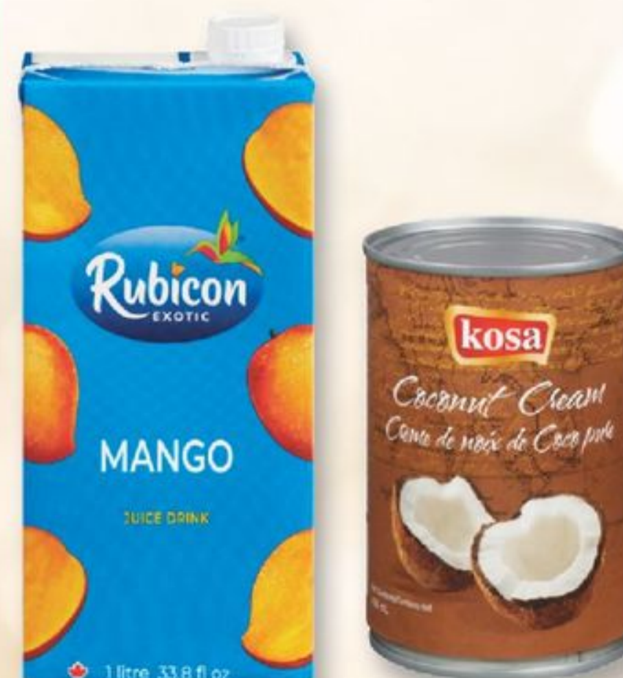
Kosa Coconut Cream 400 mL or Rubicon Juice 1 L

PLUS DEPOSIT & ENVIRONMENTAL LEEVES WHERE APPLICABLE