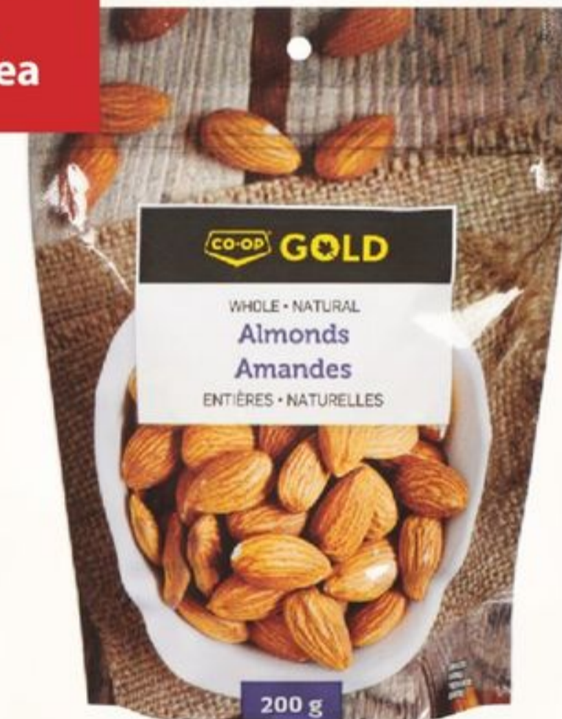
Co-op Gold Almonds 200 g