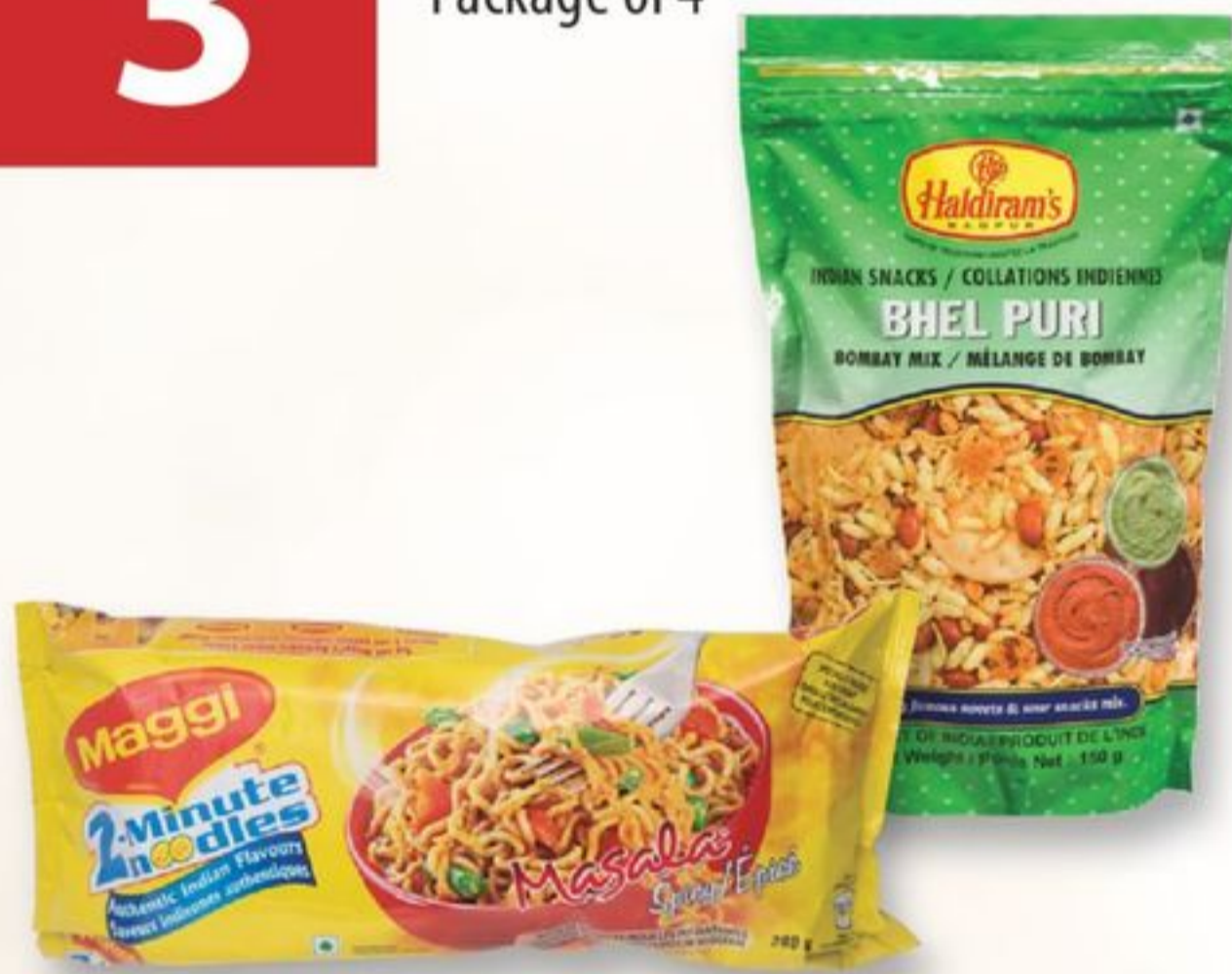
Haldiram's Snacks 150 g or Maggi Masala Noodles Package of 4