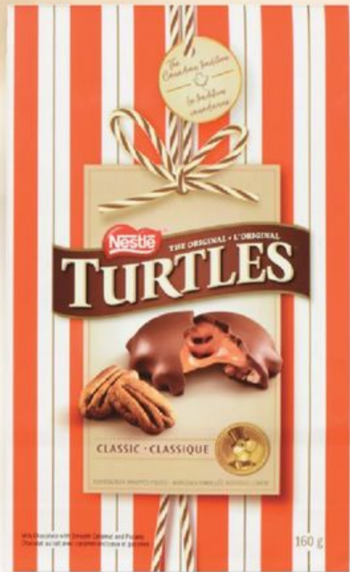
Nestlé Turtles 160 g or Quality Street Chocolates 190 g