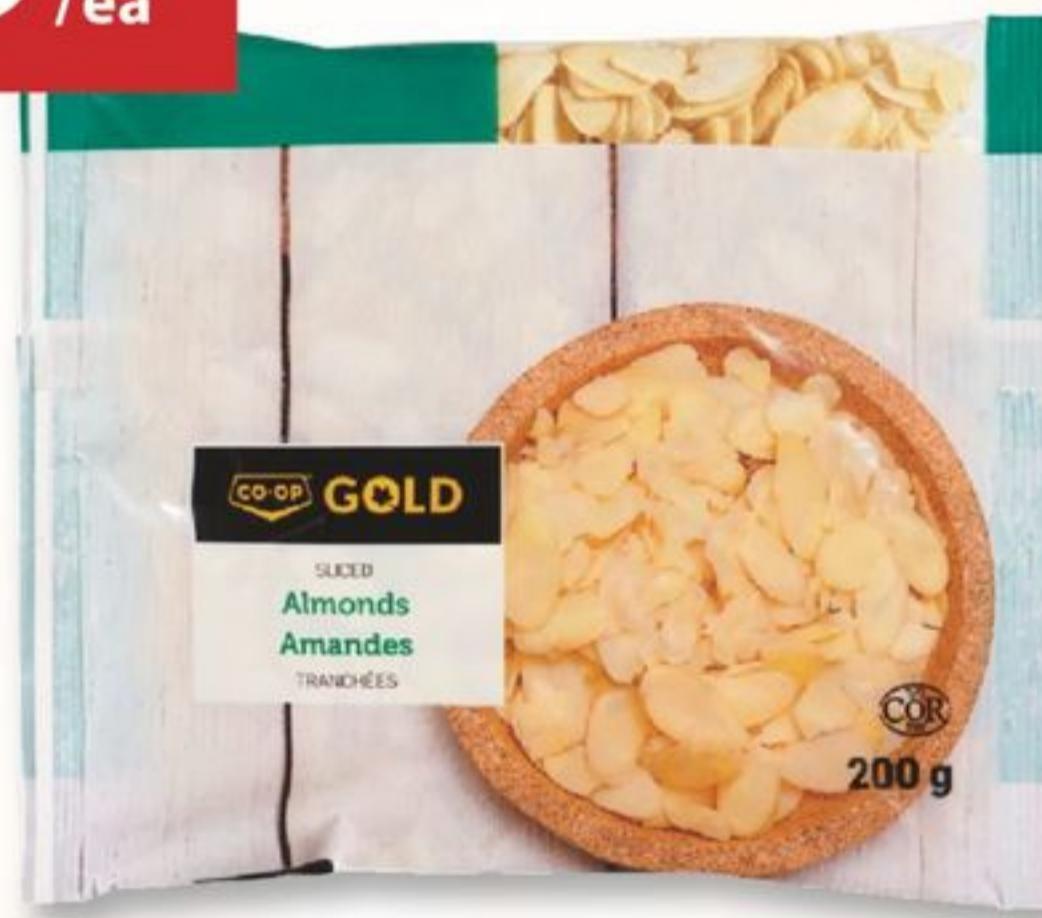
Co-op Gold Almonds Sliced or Slivered 200 g