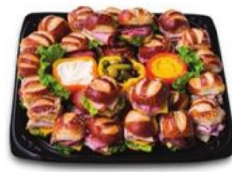
Pretzel Roll Slider Tray 16-inch serves 25-27 18-inch serves 40-45