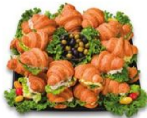
Mini Salad Croissant Tray 16-inch serves 12-16 18-inch serves 16-24