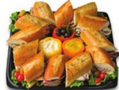
Hoagie Sandwich Tray 16-inch serves 12-14