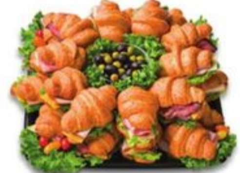
Mini Croissant Tray 16-inch serves 12-16 18-inch serves 16-24