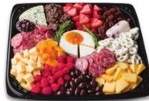
Sweet Treat Tray 12-inch serves 15-20