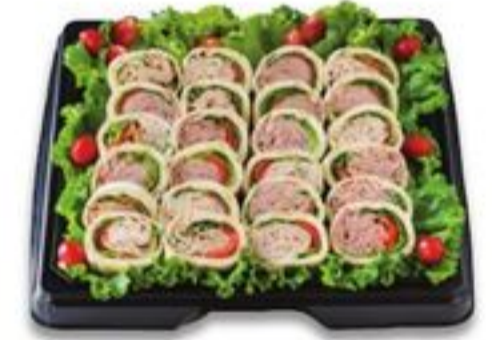
Pinwheel Tray 16-inch serves 12-16 18-inch serves 16-18