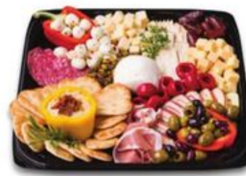
Mediterranean Tray 12-inch serves 15-20