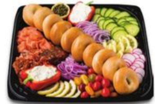
Lox & Bagel Tray 16-inch serves 10-12