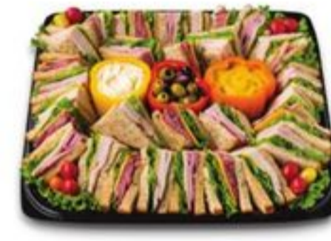
Finger Sandwich Tray 16-inch serves 12-16 18-inch serves 18-24