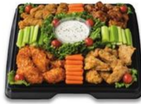
Wing Fling Tray 16-inch serves 12-16