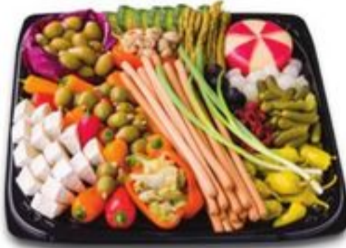
Cocktail Tray 12-inch serves 15-20