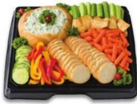
Big Dipper Tray 16-inch serves 15-20