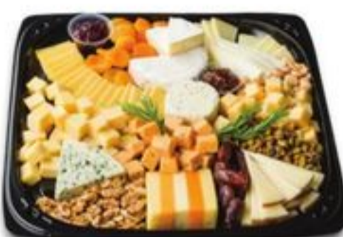
European Cheese Tray 12-inch serves 15-20