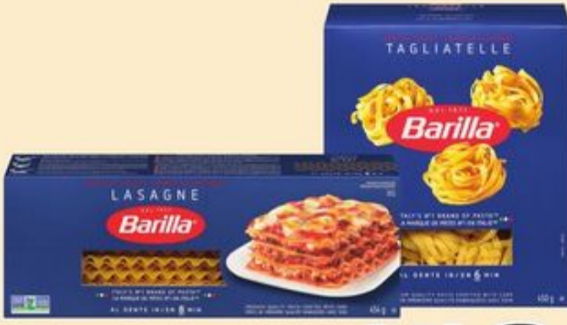
BARILLA LASAGNA 454 G OR NESTED PASTA 450 G SELECTED VARIETIES 20902949_EA/21531693_EA