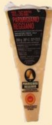
PC ® BLACK LABEL PARMIGIANO REGGIANO CHEESE PRODUCT OF ITALY AGED 36 MONTHS 200 G 20626019_EA