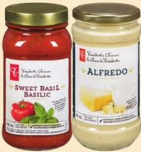
PC ® PASTA SAUCE SELECTED VARIETIES 410/650 ML 20131344009_EA 20320838001_EA