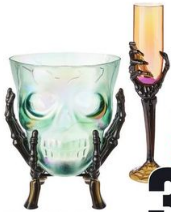
HALLOWEEN SERVEWARE SELECTED VARIETIES 21498419_EA/21498356_EA