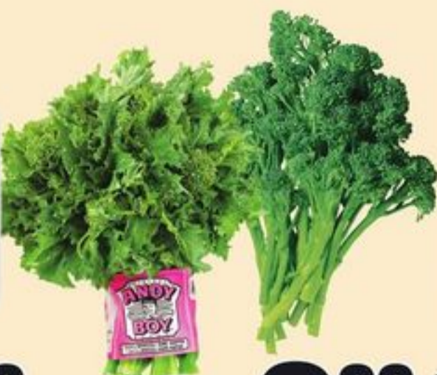
BROCCOLINI OR RAPINI PRODUCT OF USA EACH 20154907_EA/20048070001_EA