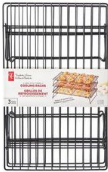
PC® METAL BAKEWARE SELECTED VARIETIES 21154308_EA/21499789_EA