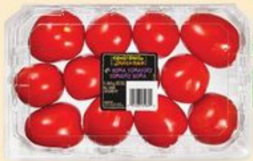
CANADA FARMER'S MARKET ™ ROMA TOMATOES PRODUCT OF CANADA 3 LB 20887458001_EA