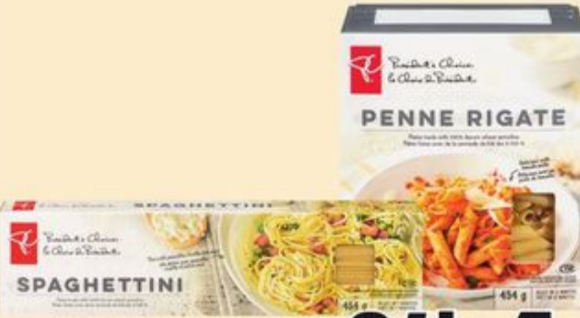
PC ® PASTA SELECTED VARIETIES 454 G 21001578_EA/21001588_EA