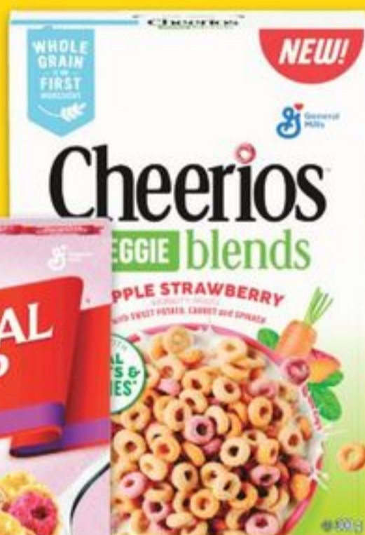
GENERAL MILLS CHEERIOS VEGGIE BLENDS, CHEX, LOADED BITES, OATMEAL CRISP AND NATURE VALLEY GRANOLA CEREAL selected varieties, 300-437 g mélanges de légumes, bouchées garnies, céréales croustillantes à l'avoine et granola 21212648 SA/21212648 SA