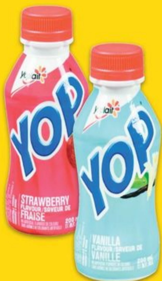
YOPLAIT YOP DRINKABLE YOGURT selected varieties 200 mL yaourt à boire 21479178 SA/21479200 SA