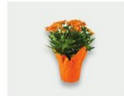
4.5" Fall Mums 3.99