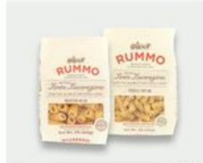
Rummo Bronze Cut Pasta 16 oz 2/6