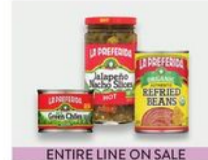
ENTIRE LINE ON SALE La Preferida Authentic Mexican Ingredients 4-16 oz 20% OFF