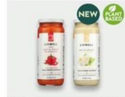
Liwell Plant-Based Superfood Pasta Sauce 16 oz 9.49