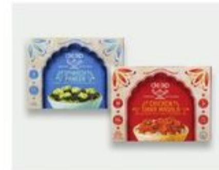
Deep Indian Kitchen Frozen Entrees 7.5-12 oz 4.99