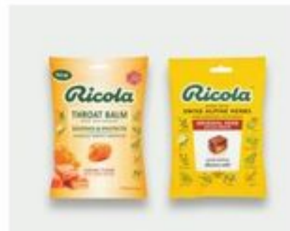
Ricola Lozenges 21-45 drops 25% OFF