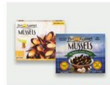
Pier 33 Gourmet Fully Cooked Mussels white wine, butter garlic or tomato garlic 16 oz BOGO