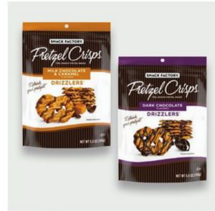
Snack Factory Chocolate Drizzled Pretzel Crisps 5.5 oz, while supplies last