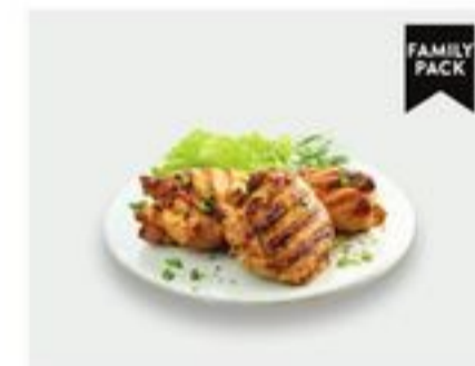
All-Natural Boneless Skinless Chicken Thighs 2.99LB