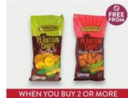
Fresh Thyme Plantain Chips 5-6 oz quantities less than 2 are regular retail 2/5