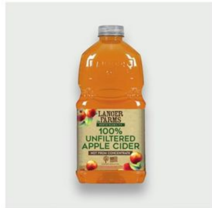
Langer Farms 100% Unfiltered Apple Cider 64 oz