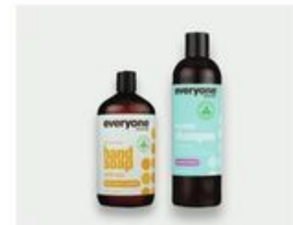
Everyone Body Care select varieties 25% OFF