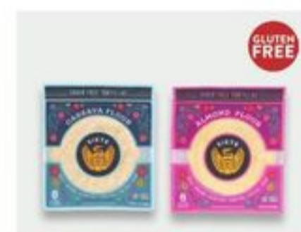
Siete Tortillas 7 oz Siete Burrito Size Tortilla 14.5 oz 7.99 6.99