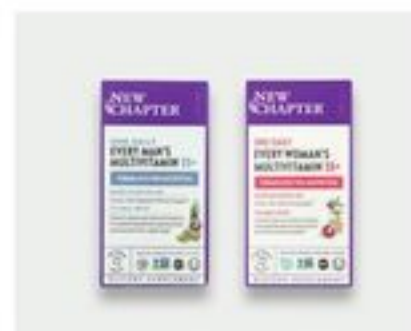
New Chapter Multivitamins select varieties 20% OFF