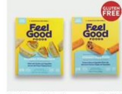
Feel Good Foods Frozen Appetizers 8.2-10 oz 6.99