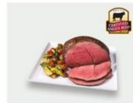
Certified Angus Beef® Bottom Round or Sirloin Tip Roast 4.99LB