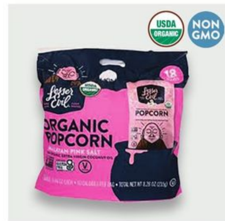
Lesser Evil Halloween Popcorn 18 pk, while supplies last