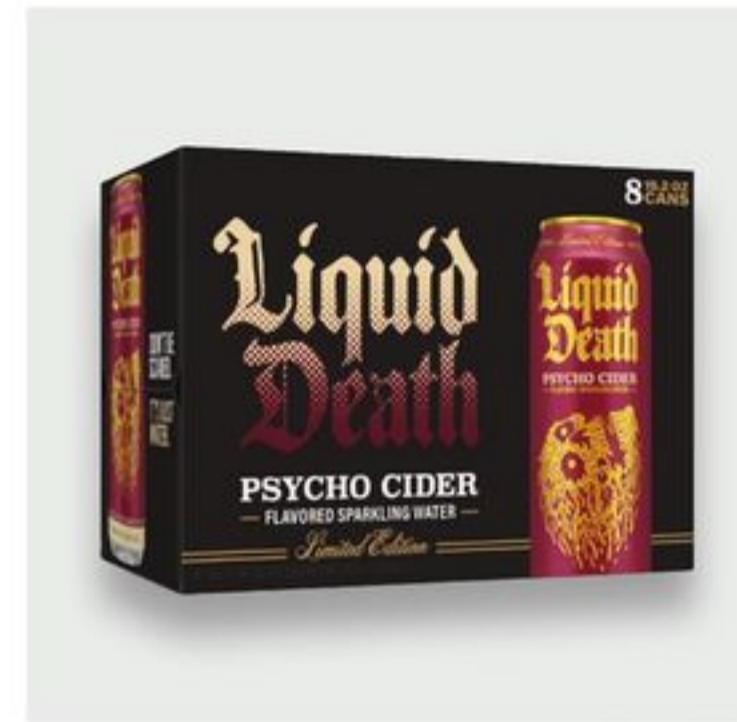
Liquid Death Psycho Cider Sparkling Water 8 pk, 12 oz