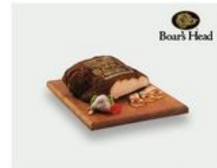
Boar's Head Cajun Turkey Boar's Head Vermont Cheddar... 7.99LB 11.99LB