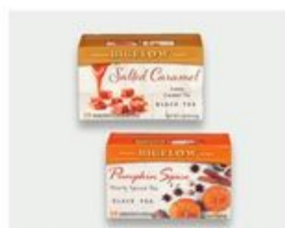
Bigelow Tea 18-20 ct 2/7