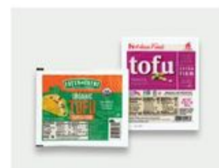
Fresh Thyme or House Foods Tofu 12-16 oz 2/4