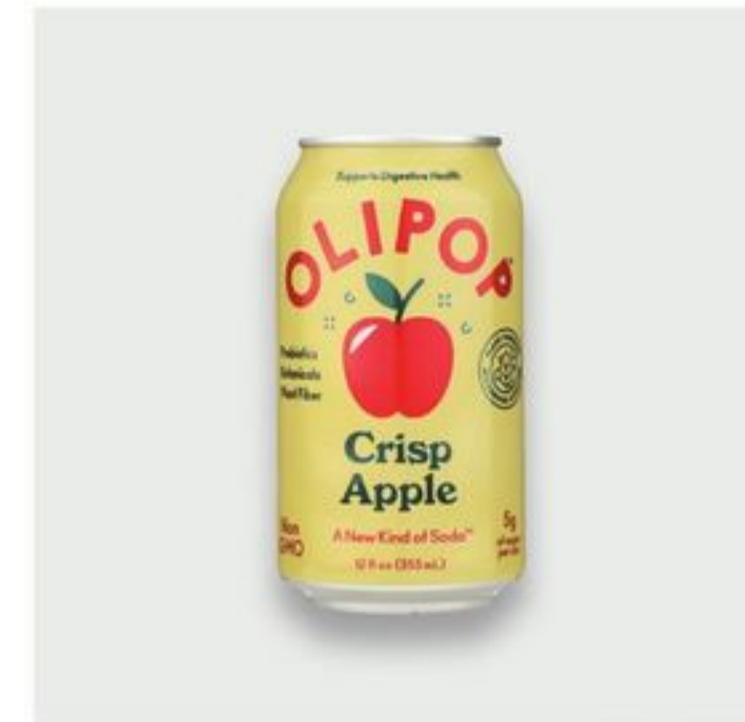
Olipop Prebotic Crisp Apple Soda 12 oz