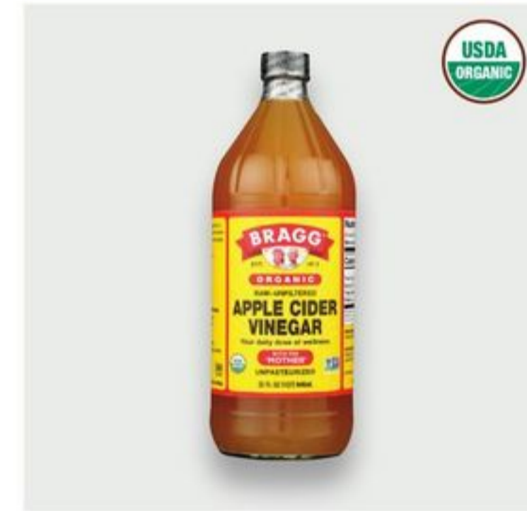
Bragg Organic Apple Cider Vinegar 32 oz