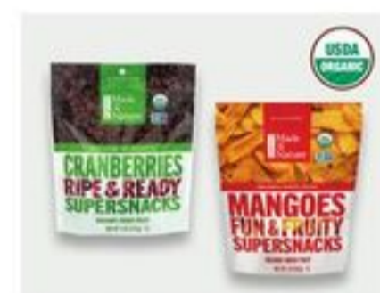
Made in Nature Organic Dried Fruit Supersnacks 5-20 oz 25% OFF