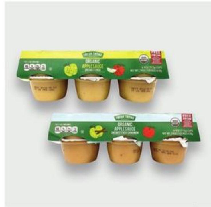
Fresh Thyme Organic Applesauce 23-24 oz