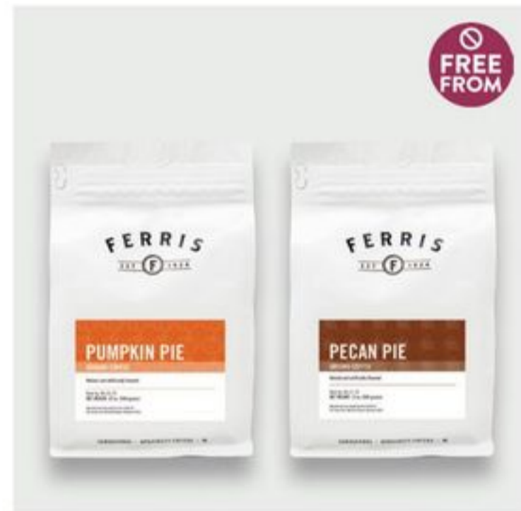
Ferris Pumpkin or Pecan Coffee 12 oz