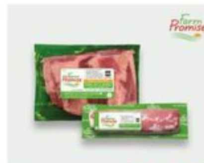
Farm Promise Sea Salt Butt Roast, Loin Filet or Pork Tenderloin equal or lesser value BOGO