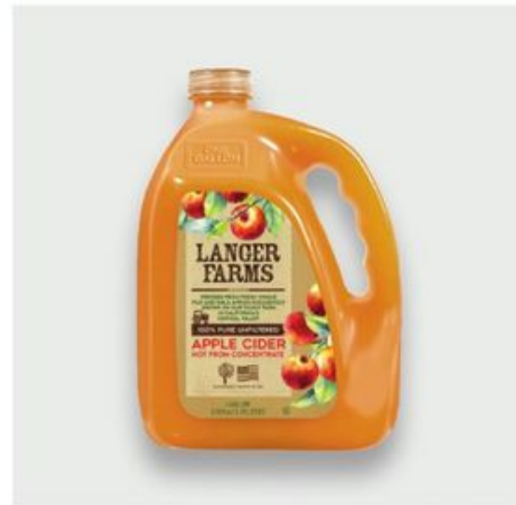
Langer Farms 100% Unfiltered Apple Cider 128 oz