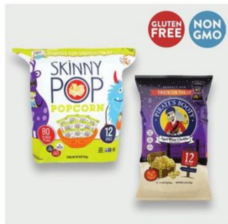
Skinny Pop or Pirate's Booty Multipack Snacks 12 ct, while supplies last