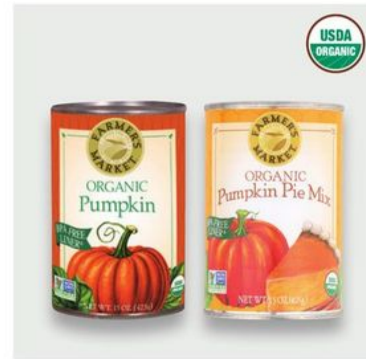
Farmer's Market Organic Pumpkin or Pie Mix 15 oz