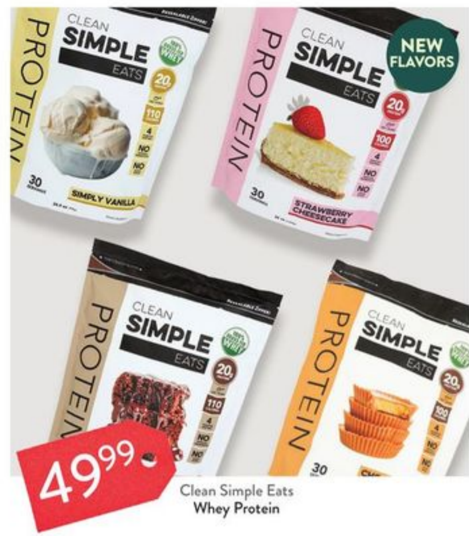
Clean Simple Eats Whey Protein 49.99