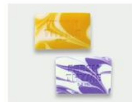
Fresh Thyme Bar Soap 2.8-3.5 oz 3/8