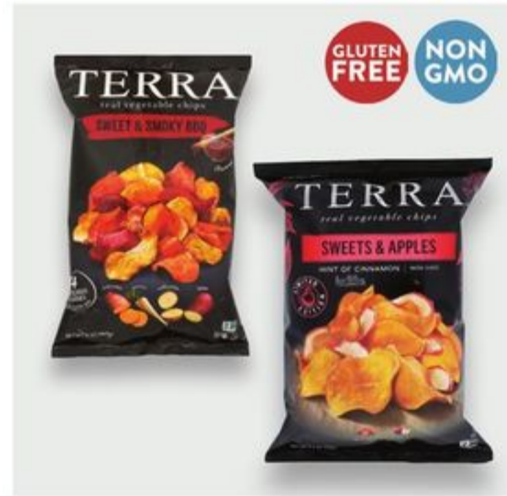
Terra Vegetable Chips 5-5.75 oz