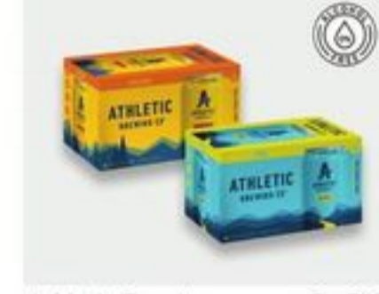
Athletic Brewing Non-Alcoholic Beer select varieties, 6 pk, 12 oz 9.99