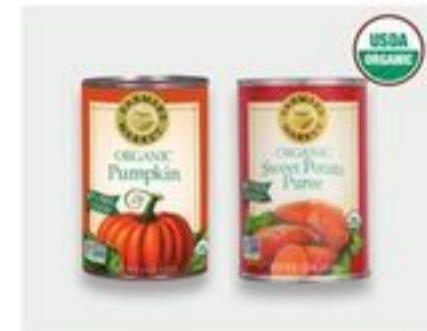
Farmer's Market Organic Pumpkin, Butternut Squash or Sweet Potato Puree 15 oz 2.99