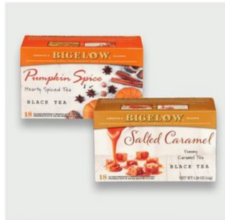
Bigelow Tea 18-20 ct