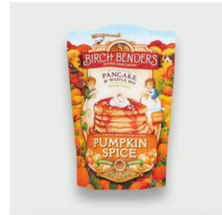
Birch Bender Pumpkin Spice Pancake Mix 16 oz