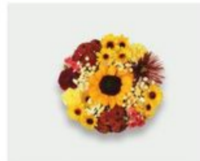
Fields of Gold Bouquet 12.99