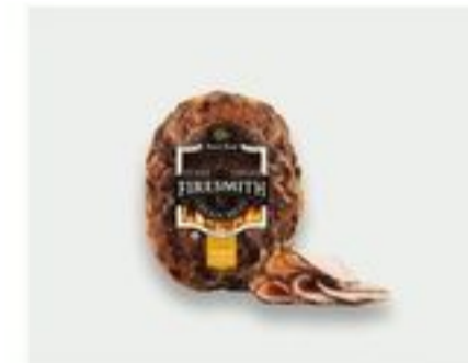
Boar's Head Firesmith Flame-Grilled Chicken Breast 10.99LB