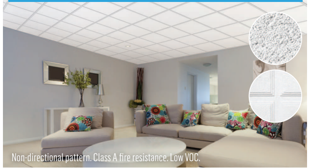
Non-directional pattern. Class A fire resistance. Low VOC.

OUR REG. PRICE ON CGC ELITE SERIES CEILING TILE!