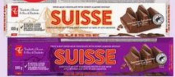
PC® SUISSE SWISS DARK CHOCOLATE, MILK CHOCOLATE OR FRUIT & NUT MILK CHOCOLATE WITH HONEY ALMOND NOUGAT 100 G 21609337_EA/21609356_EA