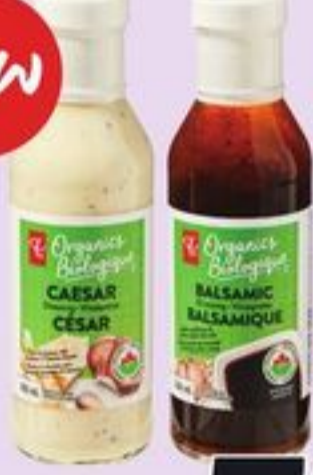
PC® ORGANICS BALSAMIC OR CAESAR DRESSING 350 ML 21609744_EA/21609630_EA