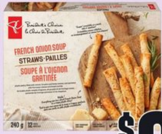
PC® FRENCH ONION SOUP STRAWS FROZEN 240 G 21612011_EA