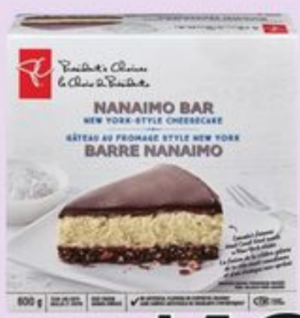
PC® NANAIMO BAR NEW YORK-STYLE CHEESECAKE FROZEN 600 G 21479848_EA