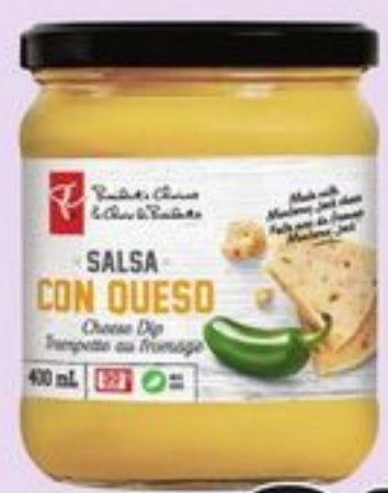
PC® SALSA CON QUESO CHEESE DIP 400 ML 20005283_EA