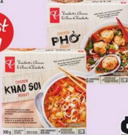
PC® CHICKEN KHAO SOI, CHICKEN PHO, VEGETABLE TOM YUM OR CHICKEN WONTON SOUP BOWL FROZEN 300 G 21565868_EA/21565950_EA