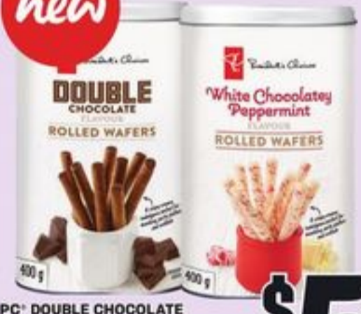
PC® DOUBLE CHOCOLATE OR WHITE CHOCOLATEY PEPPERMINT FLAVOURED ROLLED WAFERS 400 G 21601215_EA/21601372_EA