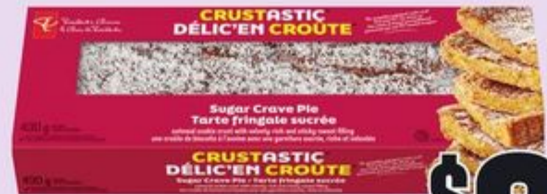
PC® CRUSTASTIC™ SUGAR CRAVE PIE BAR 430 G 21609501_EA