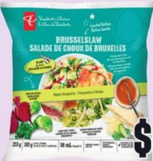
PC® BRUSSELSLAW 253 G 21626132_EA