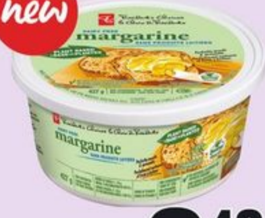
PC® PLANT BASED DAIRY FREE MARGARINE 427 G 21615278_EA