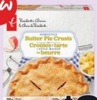
PC® HOMESTYLE BUTTER PIE CRUSTS FROZEN 350 G 21610882_EA