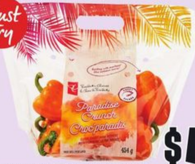
PC® PARADISE CRUNCH SUPER SWEET MINI PEPPERS PRODUCT OF CANADA OR MEXICO 454 G 21534092001_EA