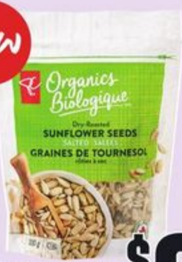
PC® ORGANICS DRY-ROASTED SALTED SUNFLOWER SEEDS 200 G 21517438_EA