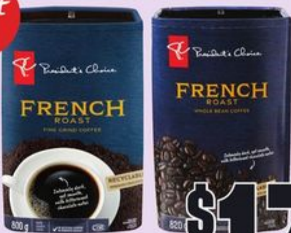
PC® FRENCH ROAST FINE GRIND COFFEE 800 G OR FRENCH ROAST WHOLE BEAN COFFEE 820 G 21592427_EA/21592555_EA