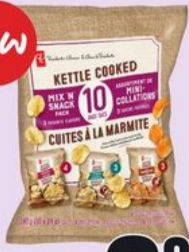
PC® KETTLE COOKED MIX 'N' SNACK PACK POTATOESCHIPS SELECTED VARIETIES 240 G/10X24 G 21613448_EA