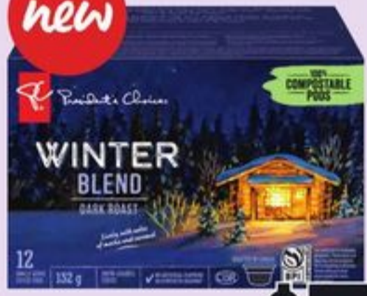
PC® WINTER BLEND DARK ROAST SINGLE SERVE COFFEE PODS 12'S 21598413_EA