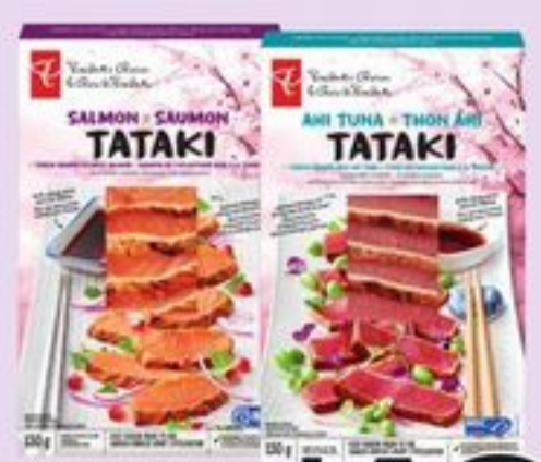
PC® SALMON OR AHI TUNA TATAKI FROZEN 130 G 21616709_EA/21616769_EA