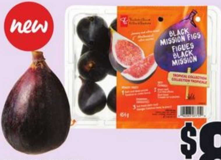
PC® BLACK MISSION FIGS PRODUCT OF MEXICO 454 G 21633482002_EA