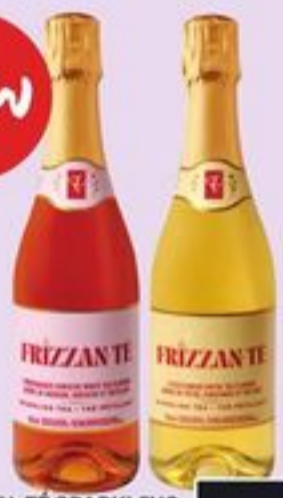
PC® FRIZZANTÉ SPARKLING TEA BEVERAGE POMEGRANATE HIBISCUS WHITE TEA FLAVOUR OR PEACH GINGER GREEN TEA FLAVOUR 750 ML 21597948_EA/21597914_EA