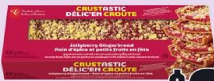
PC® CRUSTASTIC™ JOLLYBERRY GINGERBREAD PIE BAR 430 G 21609492_EA