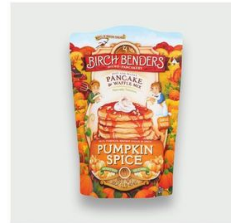
Birch Bender Pumpkin Spice Pancake Mix 16 oz