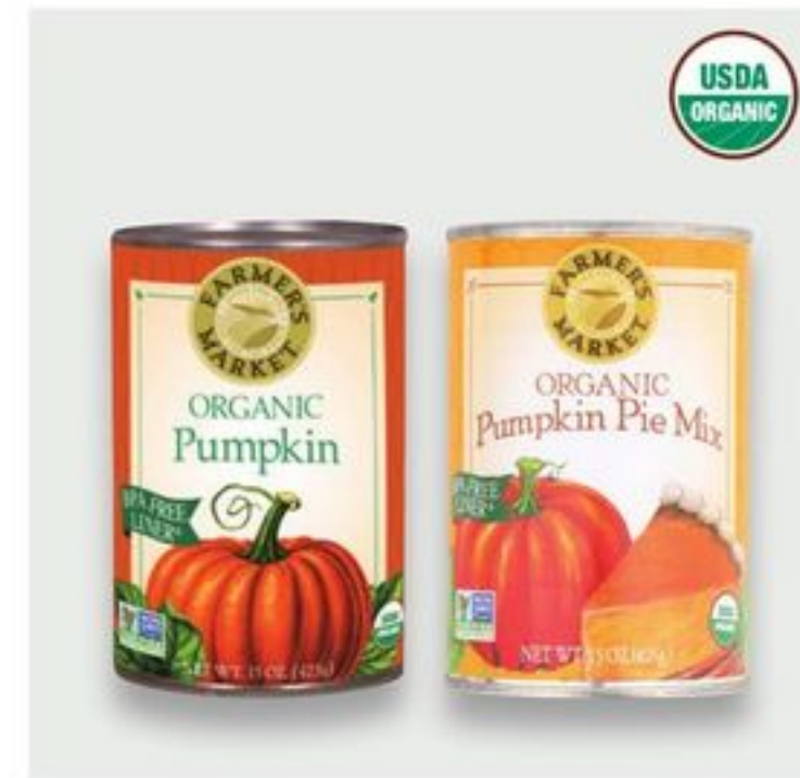
Farmer's Market Organic Pumpkin or Pie Mix 15 oz