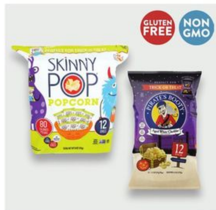
Skinny Pop or Pirate's Booty Multipack Snacks 12 ct, while supplies last