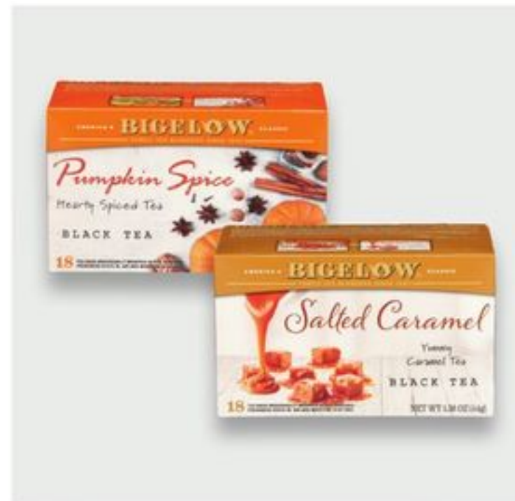
Bigelow Tea 18-20 ct