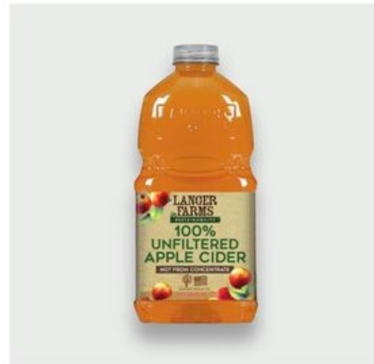
Langer Farms 100% Unfiltered Apple Cider 64 oz