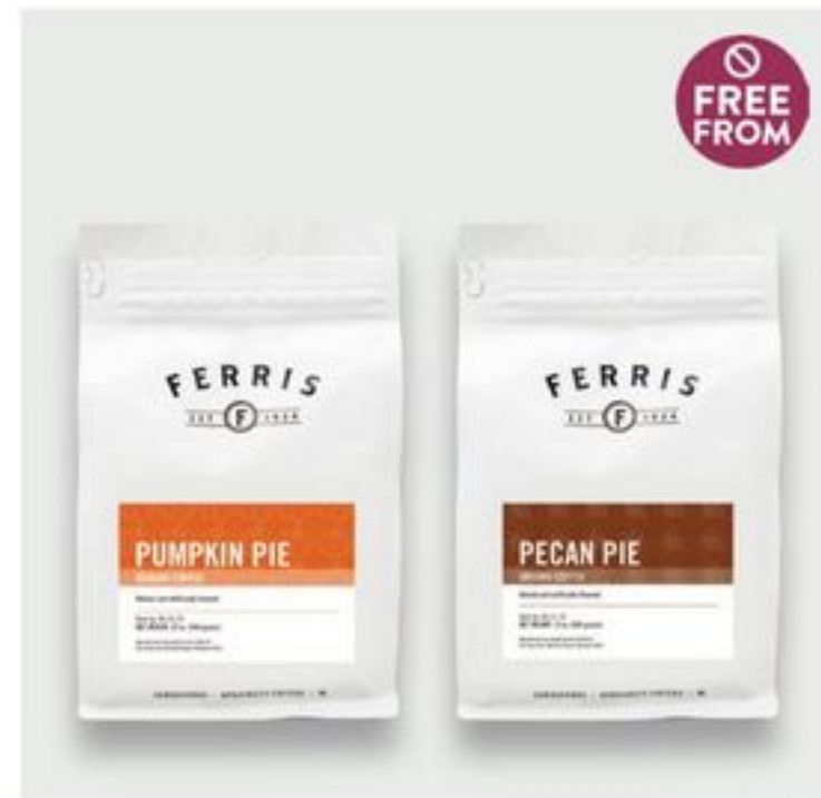
Ferris Pumpkin or Pecan Coffee 12 oz