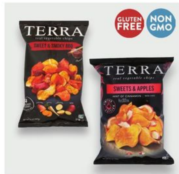
Terra Vegetable Chips 5-5.75 oz