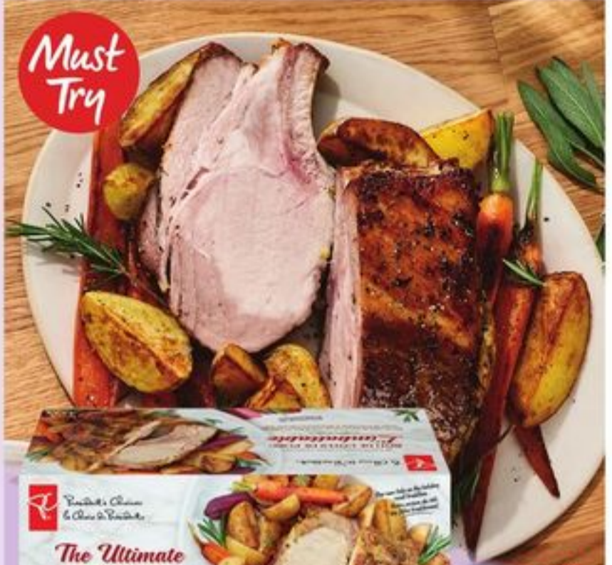
PC® THE ULTIMATE PORK RIB ROAST FROZEN 1.1 KG 21616767_EA