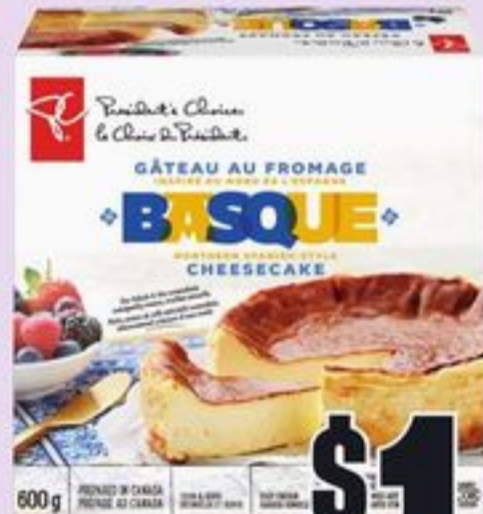
PC® NORTHERN SPANISH STYLE BASQUE CHEESECAKE FROZEN 600 G 21609491_EA