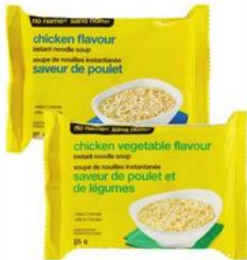
NO NAME® INSTANT NOODLES SELECTED VARIETIES 85 G 20301274001_EA 20305832_EA