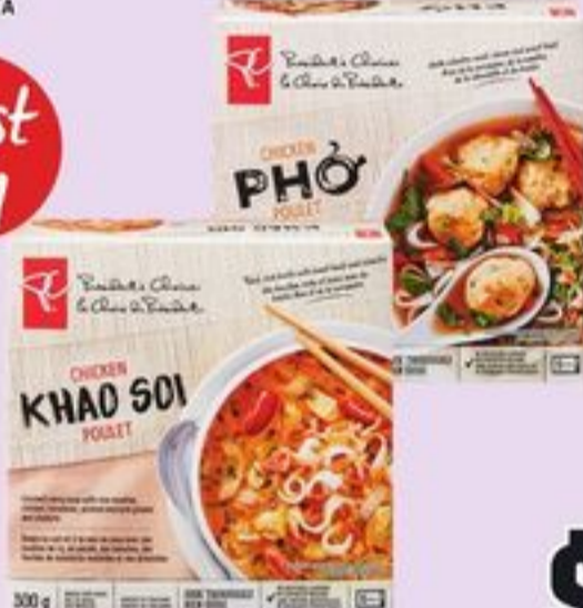
PC® CHICKEN KHAO SOI, CHICKEN PHO, VEGETABLE TOM YUM OR CHICKEN WONTON SOUP BOWL FROZEN 300 G 21565868_EA/21565950_EA