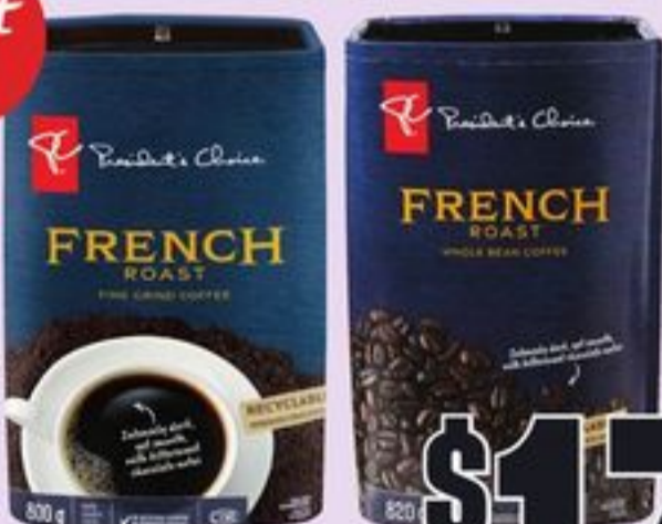
PC® FRENCH ROAST FINE GRIND COFFEE 800 G OR FRENCH ROAST WHOLE BEAN COFFEE 820 G 21592427_EA/21592555_EA