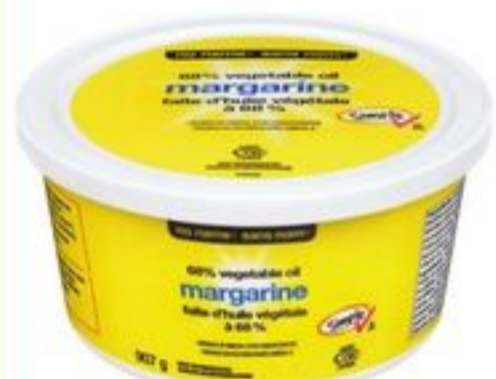
NO NAME® NON HYDRO MARGARINE 907 G 20073675_EA