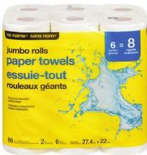
NO NAME® PAPER TOWELS JUMBO 6=8 ROLLS 20078625_EA