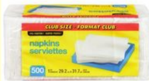
NO NAME® NAPKINS CLUB SIZE 500'S 20306897_EA