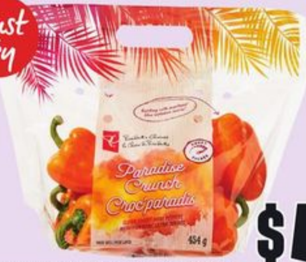
PC® PARADISE CRUNCH SUPER SWEET MINI PEPPERS PRODUCT OF CANADA OR MEXICO 454 G 21534092001_EA