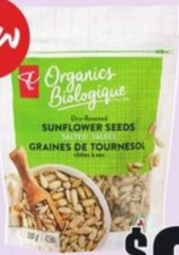
PC® ORGANICS DRY-ROASTED SALTED SUNFLOWER SEEDS 200 G 21517438_EA