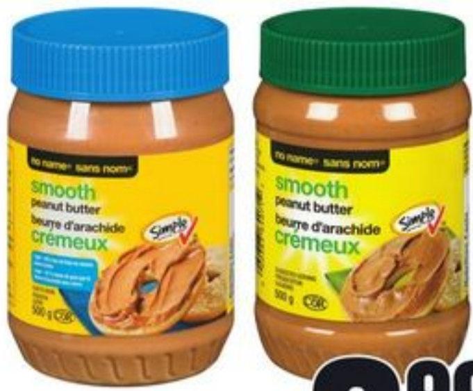
NO NAME® PEANUT BUTTER SELECTED VARIETIES 500 G 20316212001_EA/20316212003_EA