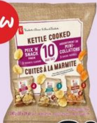
PC® KETTLE COOKED MIX 'N' SNACK PACK POTATOES SELECTED VARIETIES 240 G/10X24 G 21613448_EA