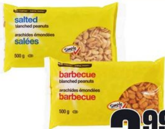
NO NAME® BLANCHED PEANUTS SELECTED VARIETIES 500 G 20318062001_EA 20318062002_EA