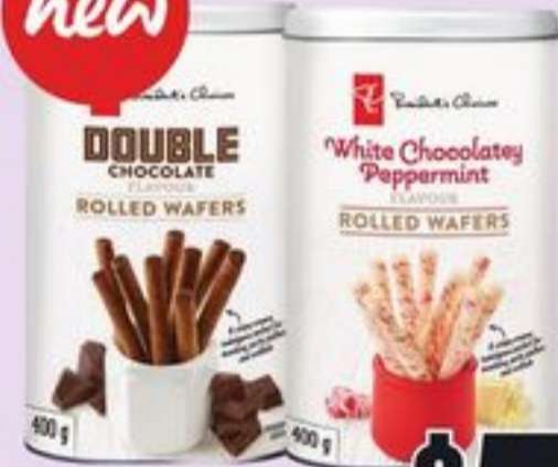
PC® DOUBLE CHOCOLATE OR WHITE CHOCOLATE PEPPERMINT FLAVOURED ROLLED WAFERS 400 G 21601215_EA/21601372_EA