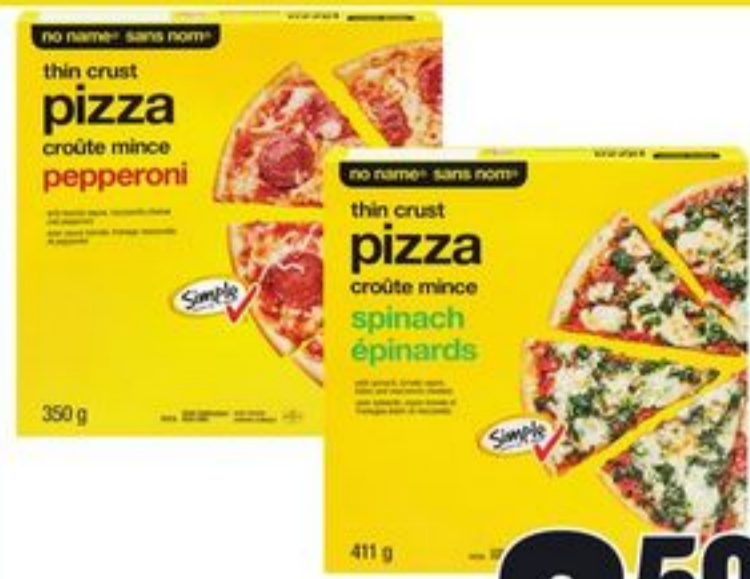
NO NAME® PIZZA SELECTED VARIETIES FROZEN 369-411 G 21541441_EA/21541444_EA