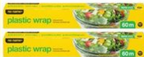
NO NAME PLASTIC WRAP 60 M 21120002_EA