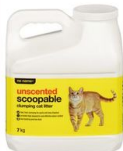
NO NAME® CAT LITTER SELECTED VARIETIES 7 KG 20023746002_EA