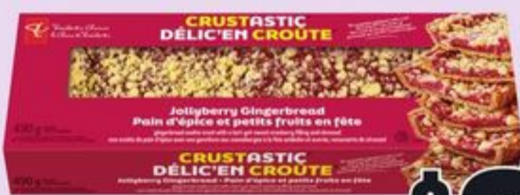
PC® CRUSTASTIC™ JOLLYBERRY GINGERBREAD PIE BAR 430 G 21609492_EA