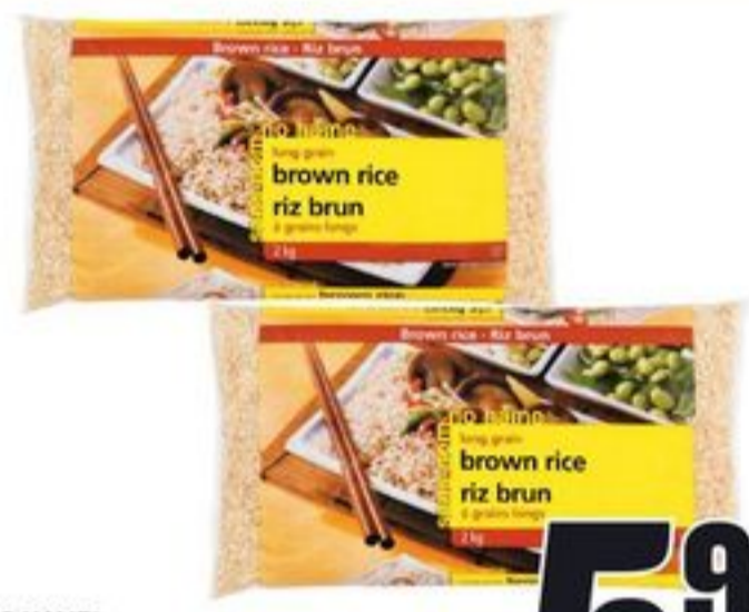
NO NAME® LONG GRAIN BROWN RICE SELECTED VARIETIES 2 KG 20009675_EA