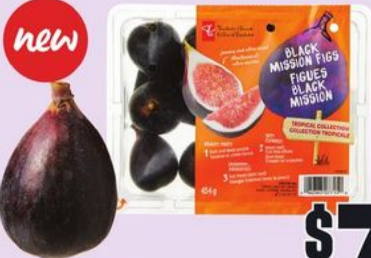
PC® BLACK MISSION FIGS PRODUCT OF MEXICO 454 G 21633482002_EA