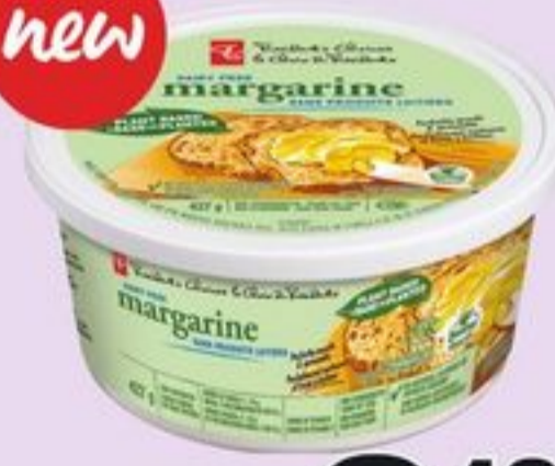
PC® PLANT BASED DAIRY FREE MARGARINE 427 G 21615278_EA