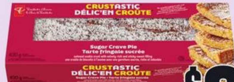
PC® CRUSTASTIC™ SUGAR CRAVE PIE BAR 430 G 21609501_EA