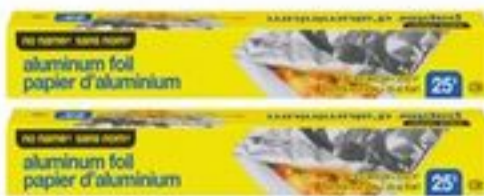
NO NAME FOIL 25 FT 21119986_EA