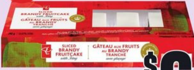
PC® SLICED BRANDY FRUITCAKE WITH ICING 210 G 21599272_EA