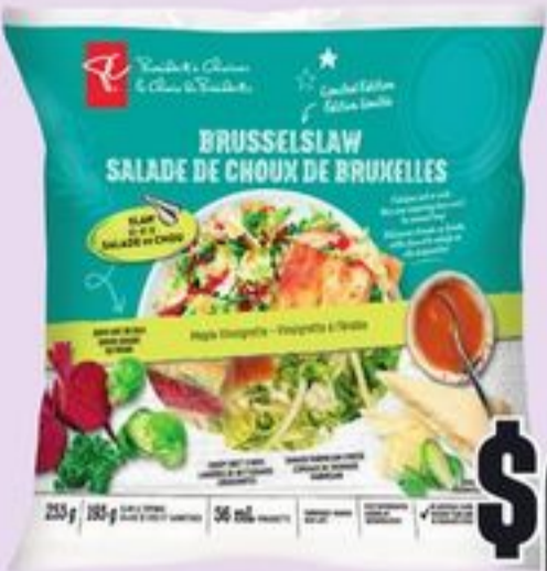
PC® BRUSSELSLAW 253 G 21626132_EA