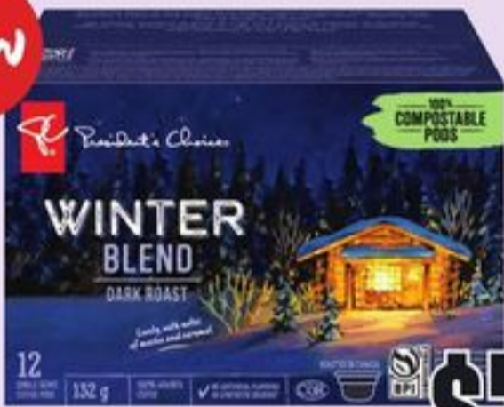
PC® WINTER BLEND DARK ROAST SINGLE SERVE COFFEE PODS 12'S 21598413_EA