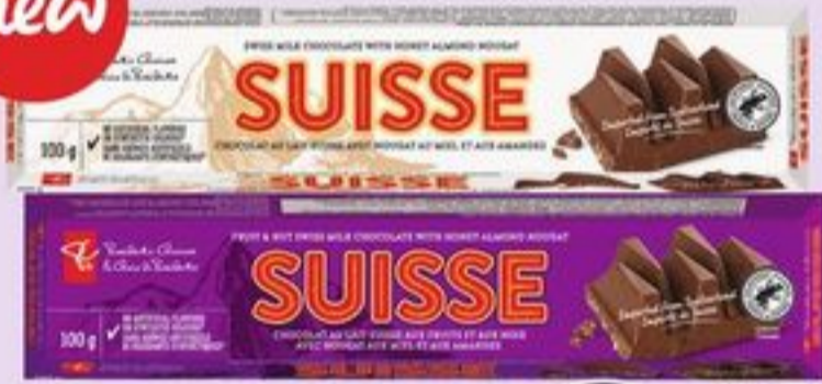
PC® SUISSE SWISS DARK CHOCOLATE, MILK CHOCOLATE OR FRUIT & NUT MILK CHOCOLATE WITH HONEY ALMOND NOUGAT 100 G 21609337_EA/21609356_EA