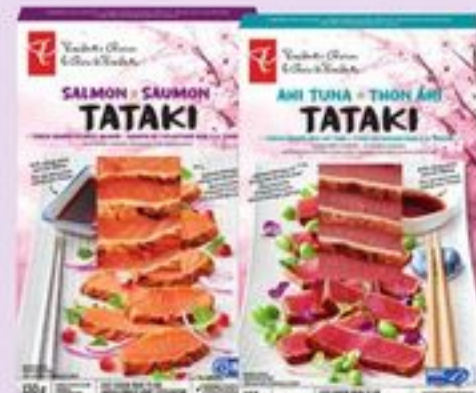
PC® SALMON OR AHI TUNA TATAKI FROZEN 130 G 21616709_EA/21616769_EA