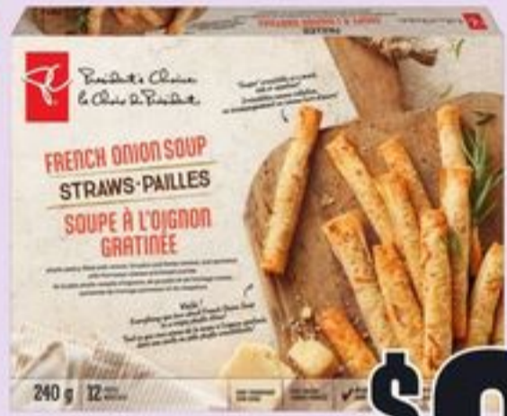
PC® FRENCH ONION SOUP STRAWS FROZEN 240 G 21612011_EA