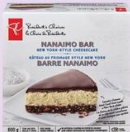
PC® NANAIMO BAR NEW YORK-STYLE CHEESECAKE FROZEN 600 G 21479848_EA