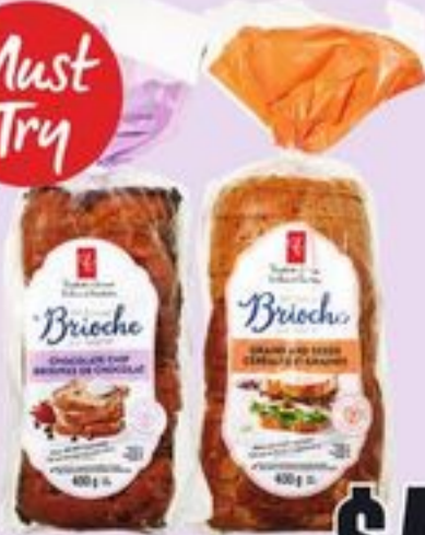
PC® ALL-BUTTER GRAINS AND SEEDS OR ALL-BUTTER CHOCOLATE CHIP BRIOCHE LOAF 400 G 21607097_EA/21607172_EA