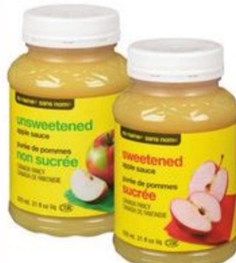
NO NAME® APPLE SAUCE SELECTED VARIETIES 620 ML 21379698_EA 21379757_EA