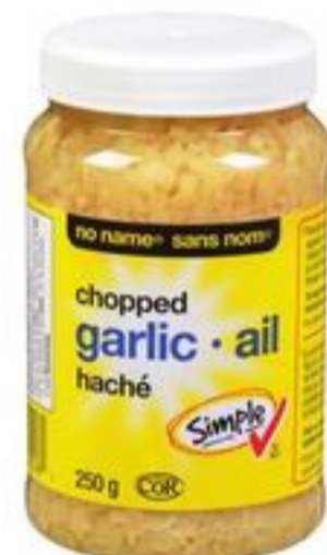
NO NAME® CHOPPED GARLIC 250 G 20123251_EA