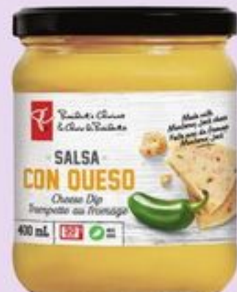
PC® SALSA CON QUESO CHEESE DIP 400 ML 20005283_EA