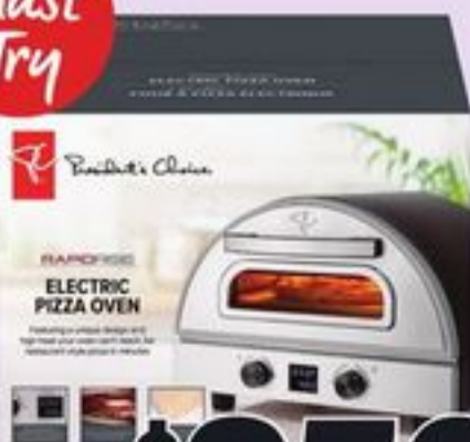
PC® RAPIDRISE ELECTRIC PIZZA OVEN EACH 21584275_EA