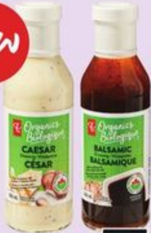
PC® ORGANICS BALSAMIC OR CAESAR DRESSING 350 ML 21609744_EA/21609630_EA