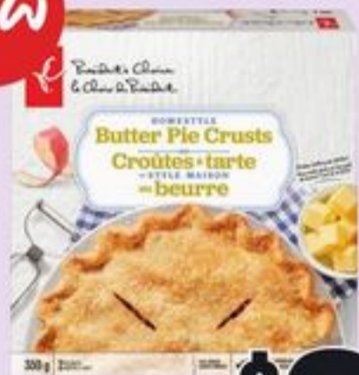
PC® HOMESTYLE BUTTER PIE CRUSTS FROZEN 350 G 21610882_EA