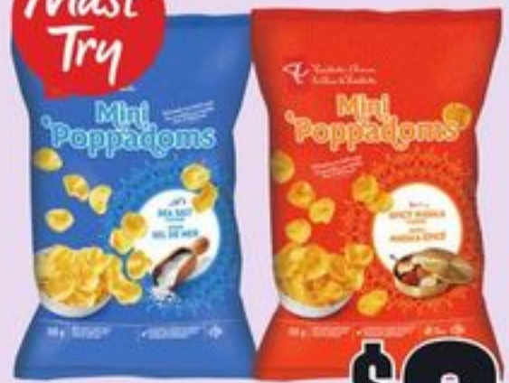
PC® FLAVORED MINI POPPADOMS SELECTED VARIETIES 113 G 21605321_EA/21605343_EA