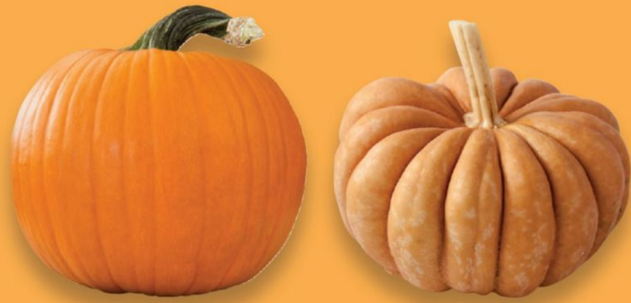
JUMBO JACK O'LANTERN PUMPKINS OR HEIRLOOM PUMPKINS 5.99