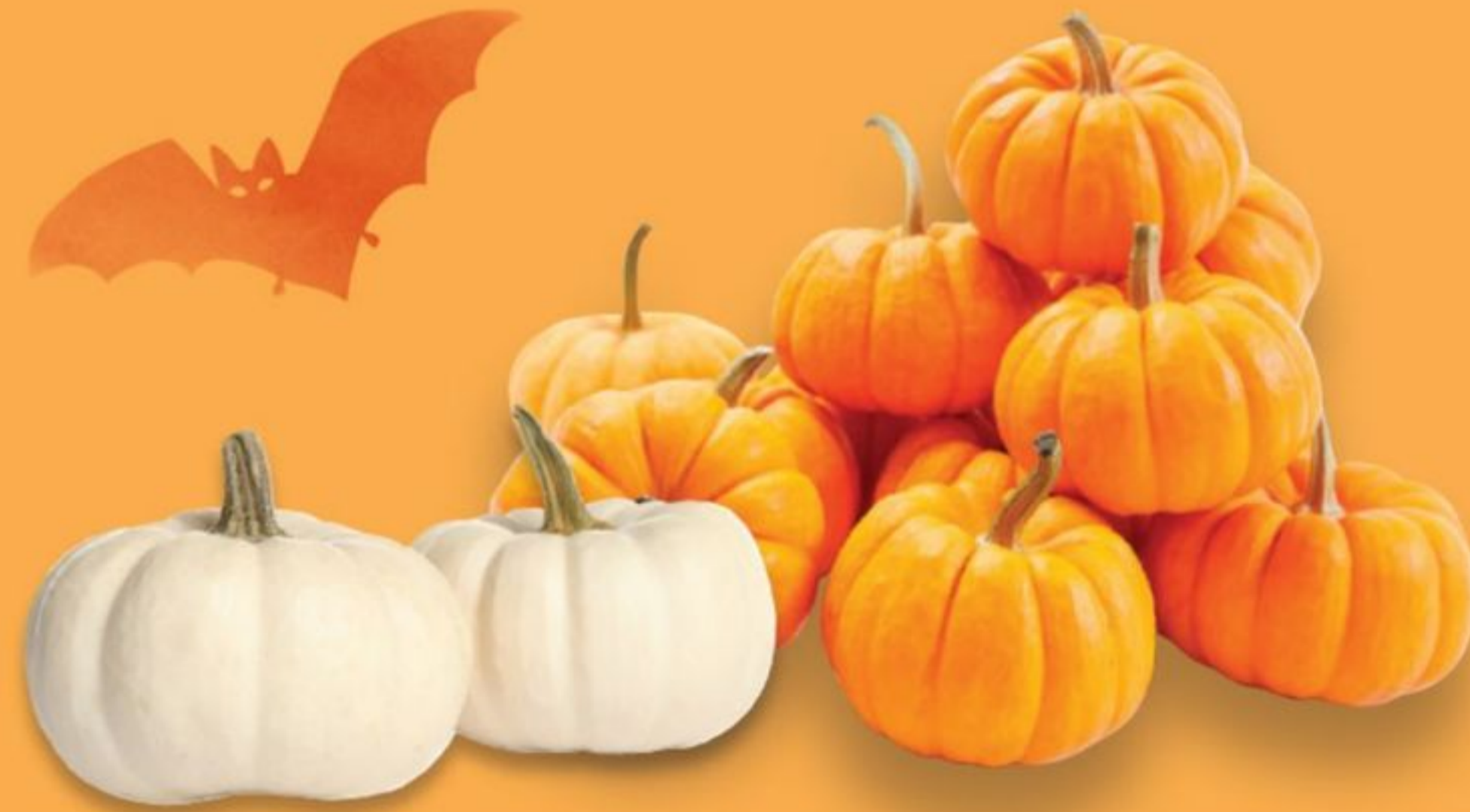
MINI WHITE OR ORANGE PUMPKINS 99¢