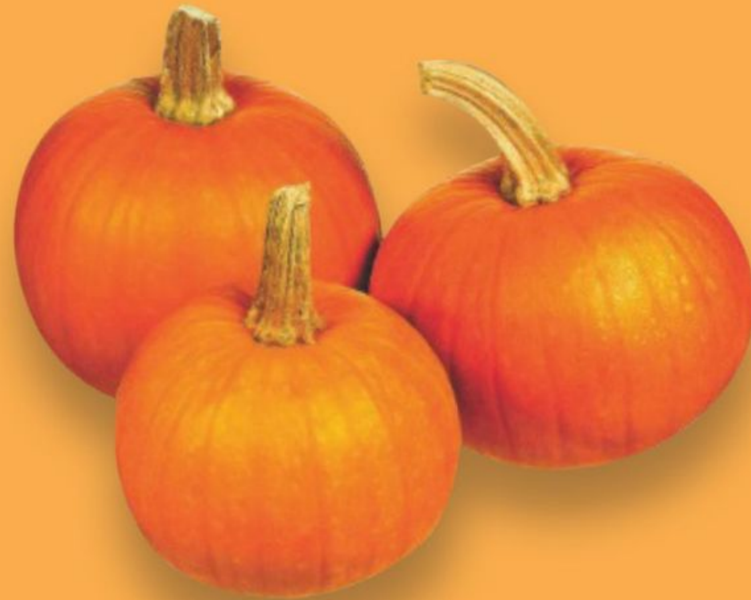
PIE PUMPKINS 2/$5