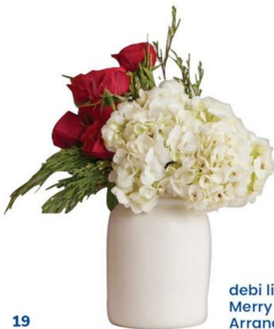
debi lilly design™ Merry Holiday Arrangement