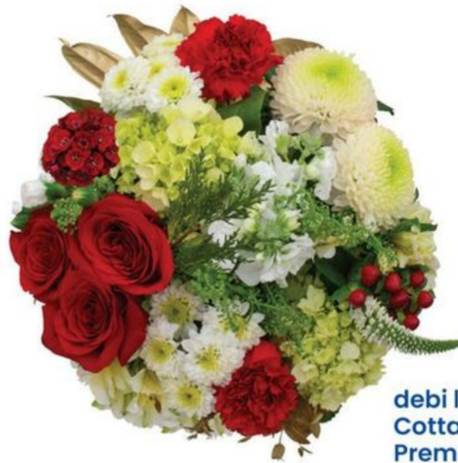
debi lilly design™ Cottage Christmas Premium A