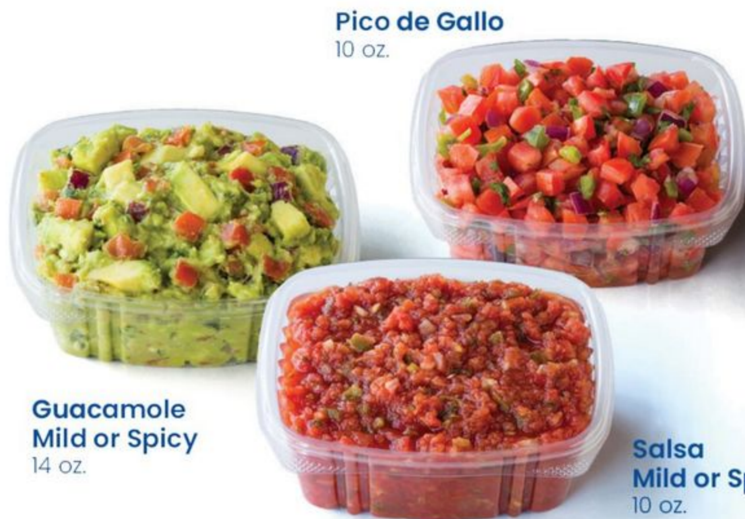
Guacamole Mild or Spicy 14 oz.

WHETHER YOU'RE HOSTING AN OFFICE LUNCH OR HAVING FRIENDS OVER TO WATCH THE GAME, OUR SANDWICHES ARE PREPARED WITH THE FRESHEST, MOST DELICIOUS INGREDIENTS, INCLUDING FRESH-CUT MEATS, FRESH-BAKED BREAD AND SPECIALTY CHEESES.