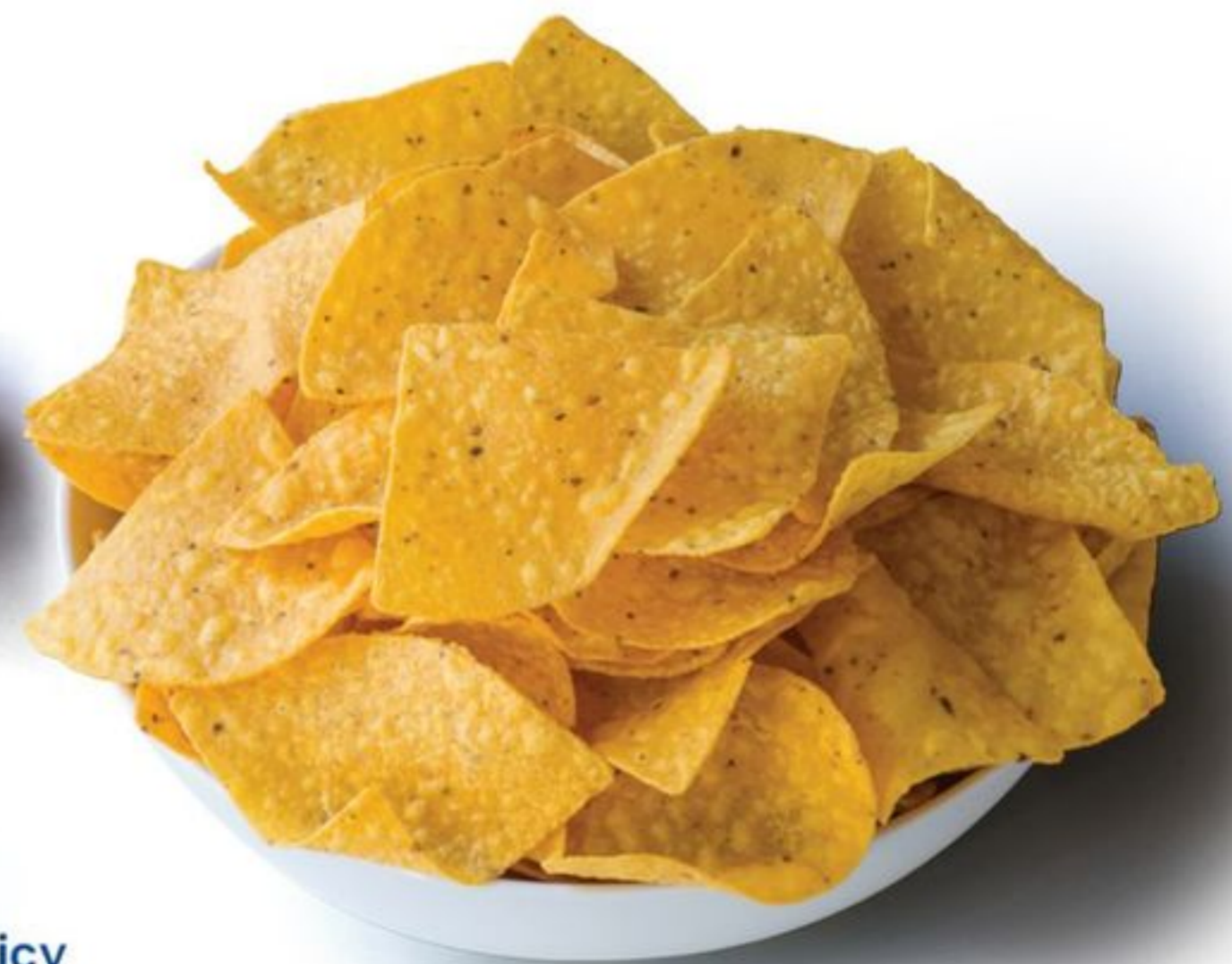
Deli Tortilla Chips