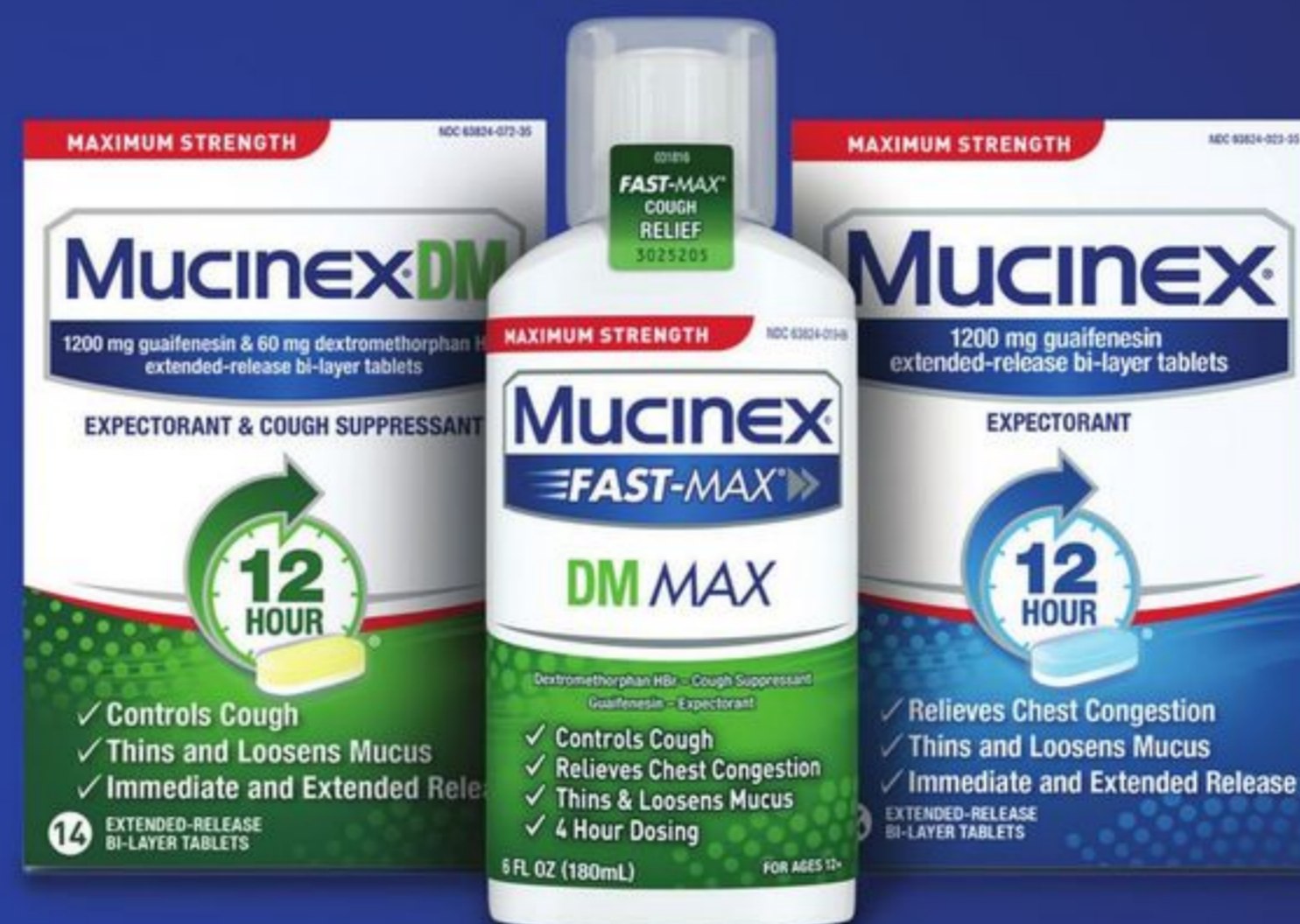
Cough & Chest Congestion