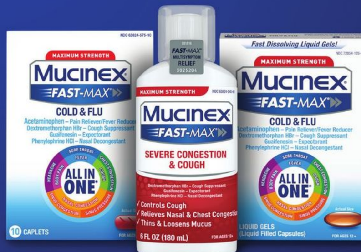
Cold & Flu