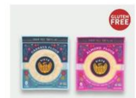
Siete Tortillas 7 oz Siete Bunde Size Tortilla 14.5 oz 6.99