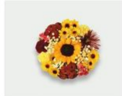
Fields of Gold Bouquet 12.99