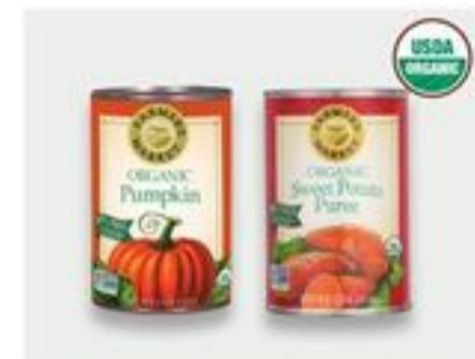
Farmer's Market Organic Pumpkin, Butternut Squash or Sweet Potato Puree 15 oz 2.99