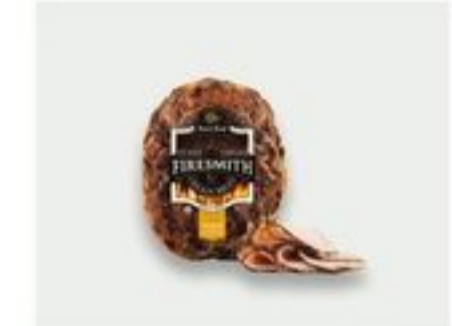
Boar's Head Firesmith Flame-Grilled Chicken Breast 10.99LB