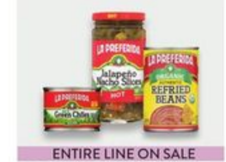
La Preferida Authentic Mexican Ingredients 20% OFF 4-16 oz