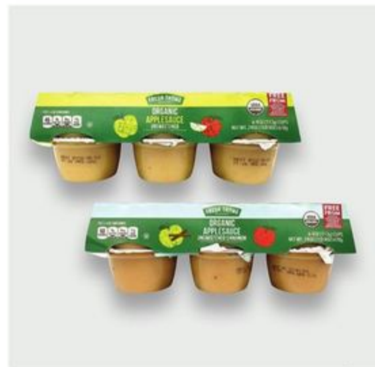
Fresh Thyme Organic Applesauce 23-24 oz