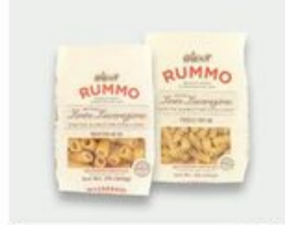
Rummo Bronze Cut Pasta 16 oz 2/6