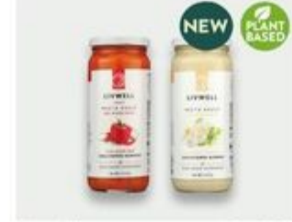
Liwel Plant-Based Superfood Pasta Sauce 16 oz 9.49