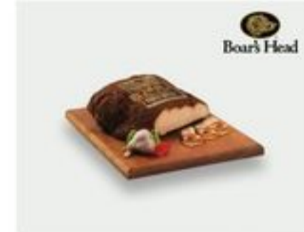
Boar's Head Boar's Head Cajun Turkey Boar's Head Vermont Cheddar... 7.99LB 11.99LB