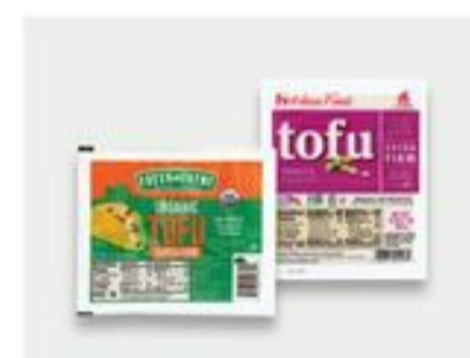
Fresh Thyme or House Foods Tofu 12-16 oz 2/4