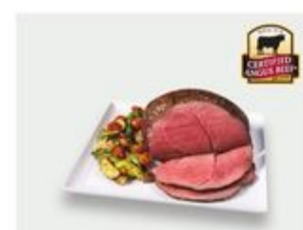
Certified Angus Beef® Bottom Round or Sirloin Tip Roast 4.99LB