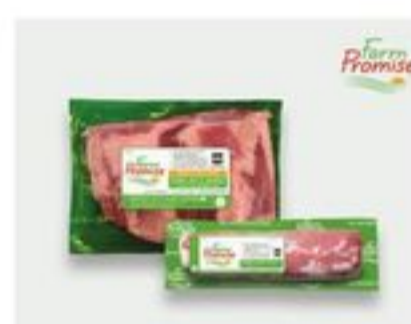
Farm Promise Sea Salt Butt Roast, Loin Filet or Pork Tenderloin equal or lesser value BOGO