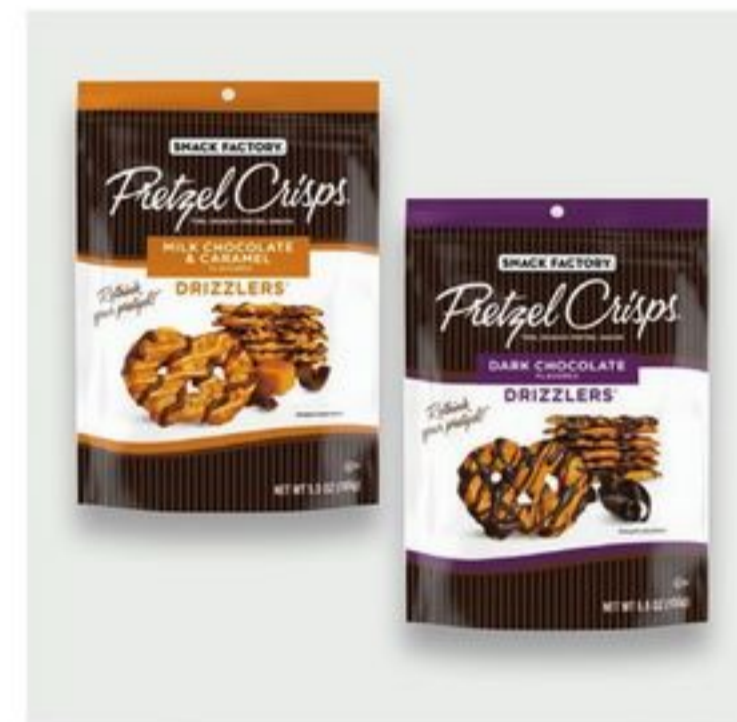
Snack Factory Chocolate Drizzled Pretzel Crisps 5.5 oz, while supplies last