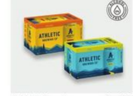
Athletic Brewing Non-Alcoholic Beer select varieties, 6 pk, 12 oz 9.99