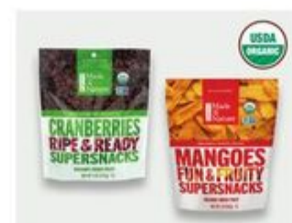
Made in Nature Organic Dried Fruit Supersnacks 5-20 oz 25% OFF