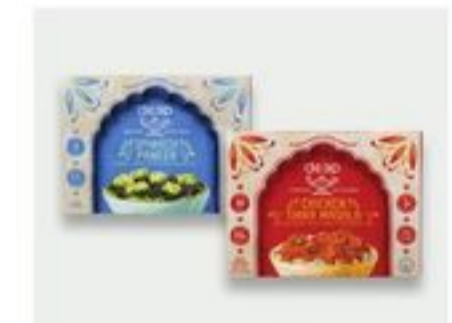
Deep Indian Kitchen Frozen Entrees 7.5-12 oz 4.99