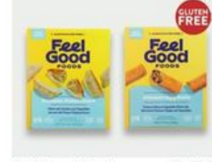
Feel Good Foods Frozen Appetizers 8.2-10 oz 6.99