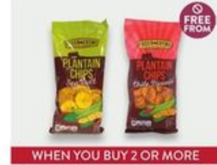
Fresh Thyme Plantain Chips 5-6 oz 2/5 quantities less than 2 are regular retail