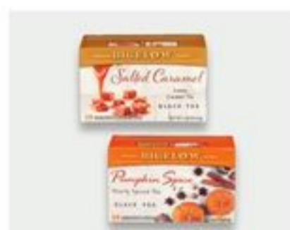
Bigelow Tea 18-20 ct 2/7