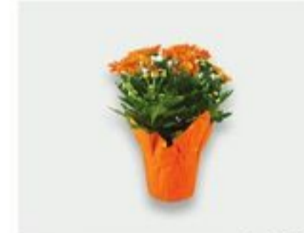
4.5" Fall Mums 3.99