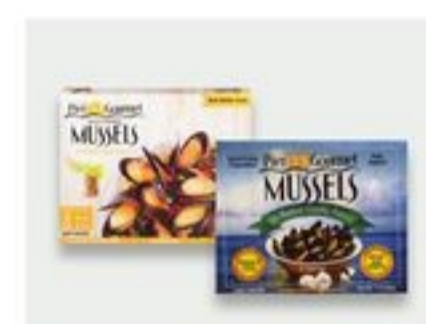
Pier 33 Gourmet Fully Cooked Mussels white wine, butter garlic or tomato garlic 16 oz BOGO