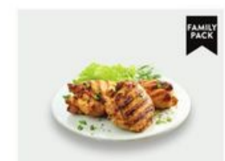
All-Natural Boneless Skinless Chicken Thighs 2.99LB