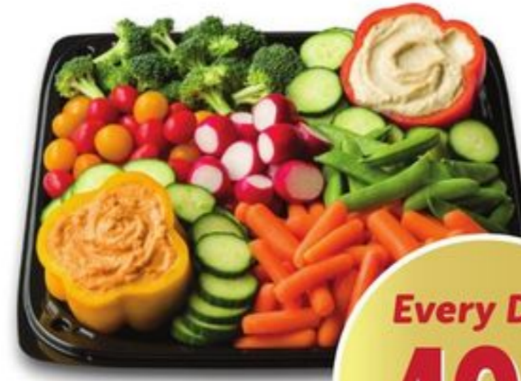
Vegetable and Hummus Tray