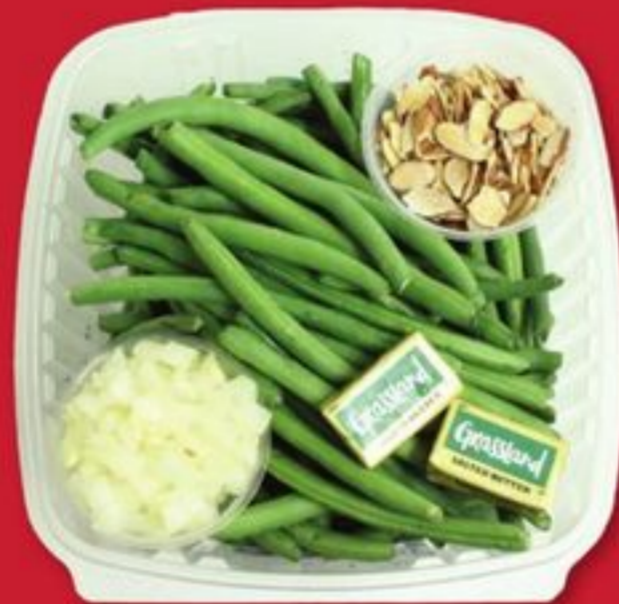
Charred Green Beans 18-oz.