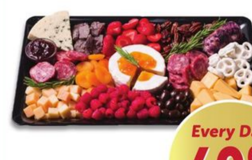
Sweet Treat Tray