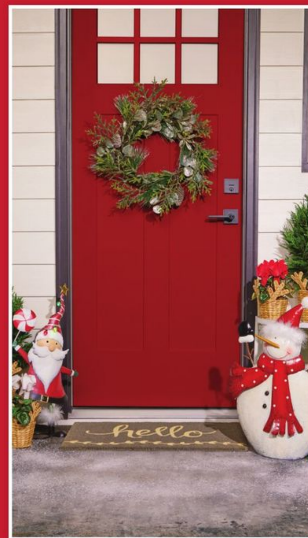
Celebrate the Holidays with Decorative Touches for your Home