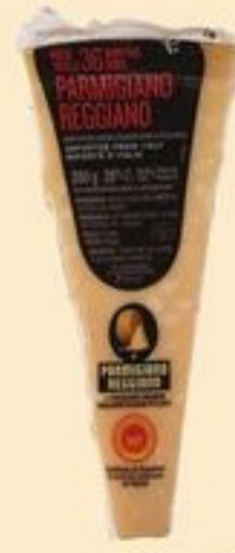
PC ® BLACK LABEL PARMIGIANO REGGIANO CHEESE PRODUCT OF ITALY AGED 36 MONTHS 200 G 20626019_EA