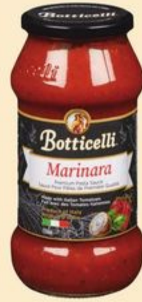
BOTTICELLI PASTA SAUCE SELECTED VARIETIES 370/710 ML 21544485_EA