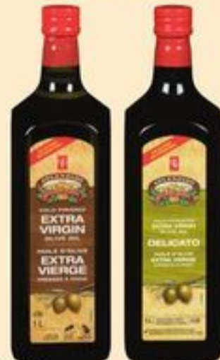
PC ® SPLENDIDO ® COLD-PRESSED OR COLD-EXTRACTED DELICATO EXTRA VIRGIN OLIVE OIL 1 L 20081865_EA 21401612_EA