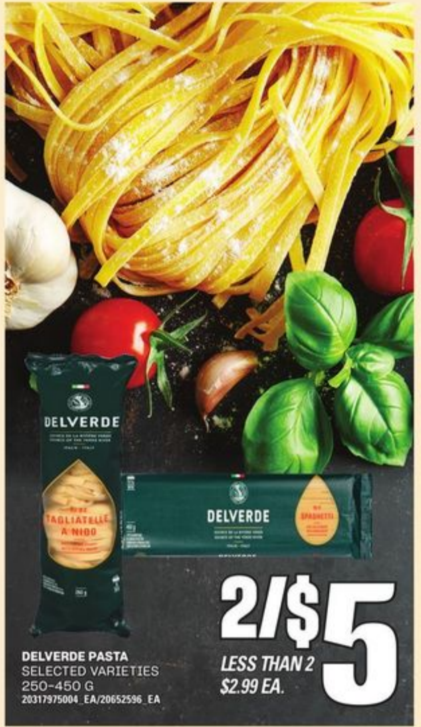
DELVERDE PASTA SELECTED VARIETIES 250-450 G 20317975004_EA/20652596_EA