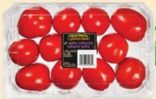
CANADA FARMER'S MARKET ™ ROMA TOMATOES PRODUCT OF CANADA 3 LB 20887458001_EA