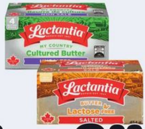
LACTANTIA BUTTER STICKS OR LACTOSE FREE BUTTER SELECTED VARIETIES 454 G 20056675_EA 21601669_EA