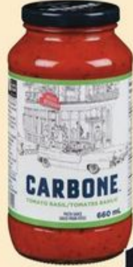
CARBONE PASTA SAUCE SELECTED VARIETIES 660 ML 21495459_EA