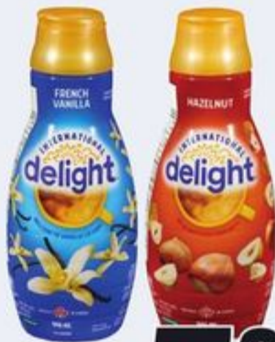
INTERNATIONAL DELIGHT COFFEE WHITENER OR COLD FOAM SELECTED VARIETIES 396-946 ML 20895480002_EA/20895480003_EA