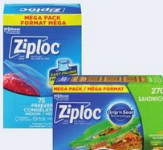
ZIPLOC MEGA PACKS SELECTED VARIETIES 75-270'S 21196101_EA/21196100_EA