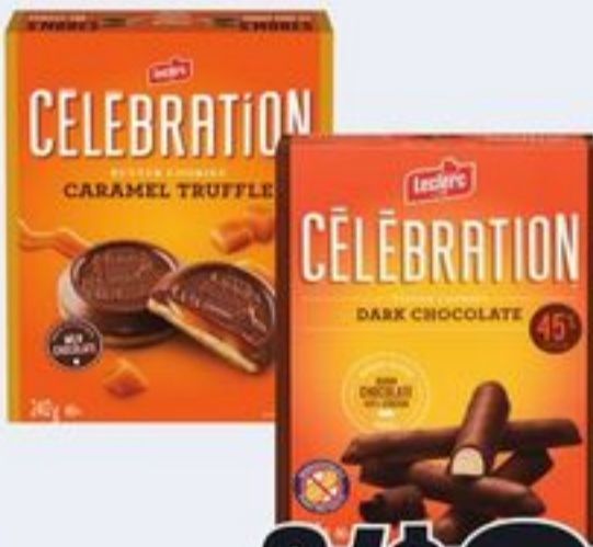
LECLERC CÉLÉBRATION COOKIES SELECTED VARIETIES 240 G 20853797001_EA 20965370_EA