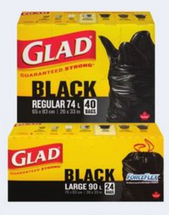
GLAD OUTDOOR BAGS SELECTED VARIETIES 10-90'S 21165477_EA