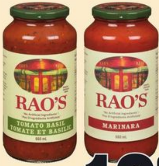
RAO'S PASTA SAUCE SELECTED VARIETIES 660 ML 20086654004_EA/20086654001_EA