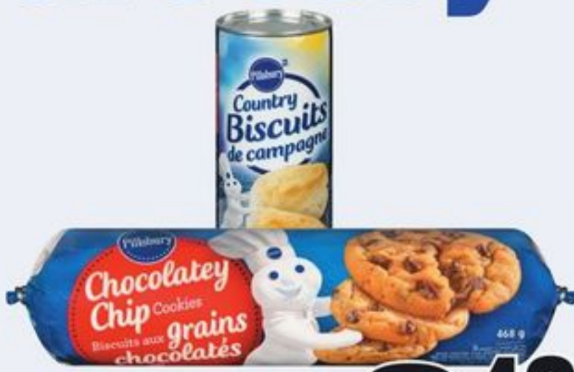
PILLSBURY READY TO BAKE CHUB COOKIE, ROLLS, CURST OR BISCUITS SELECTED VARIETIES 318-468 G 20317832003_EA/20318034001_EA