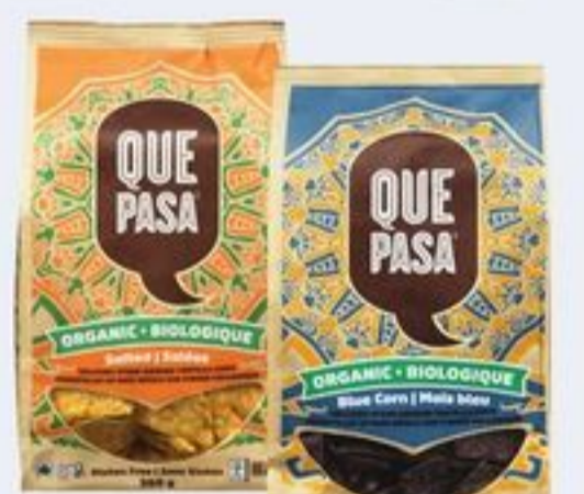
QUE PASA TORTILLA CHIPS SELECTED VARIETIES 300/350 G 21031315_EA/21031316_EA