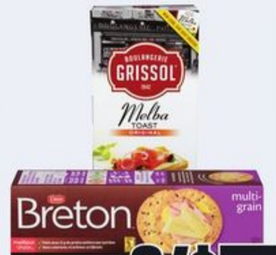
DARE BRETON OR VINTA CRACKERS SELECTED VARIETIES 132/225 G 20313040001_EA 21520685_EA