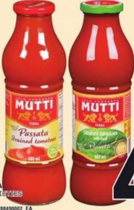
MUTTI PASSATA SELECTED VARIETIES 690 ML 20288490001_EA/20288490002_EA