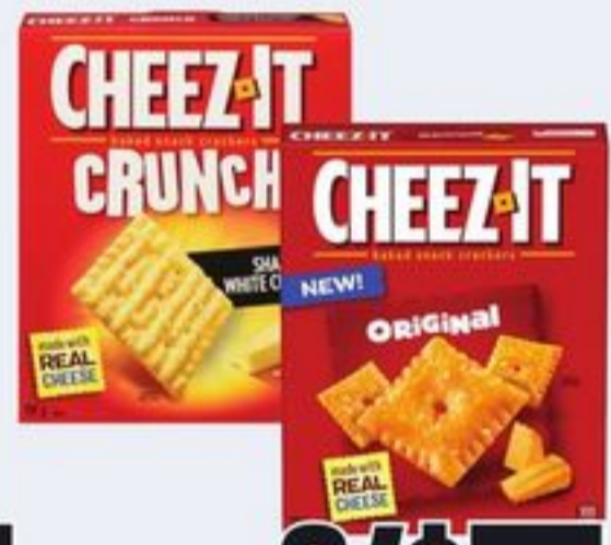
CHEEZ-IT CRACKERS SELECTED VARIETIES 191/200 G 21214559_EA 21214560_EA