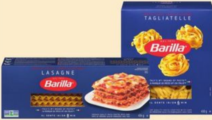
BARILLA LASAGNA 454 G OR NESTED PASTA 450 G SELECTED VARIETIES 20902949_EA/21531693_EA