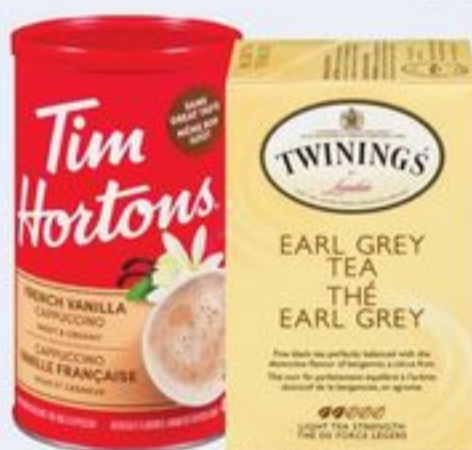
TWINING'S HERBAL TEA 20'S OR TIM HORTON'S HOT CHOCOLATE 500 G OR CAPPUCCINO FRENCH VANILLA, DOUBLE DOUBLE OR MOCHA 8'S SELECTED VARIETIES 20149985_EA/20308033001_EA