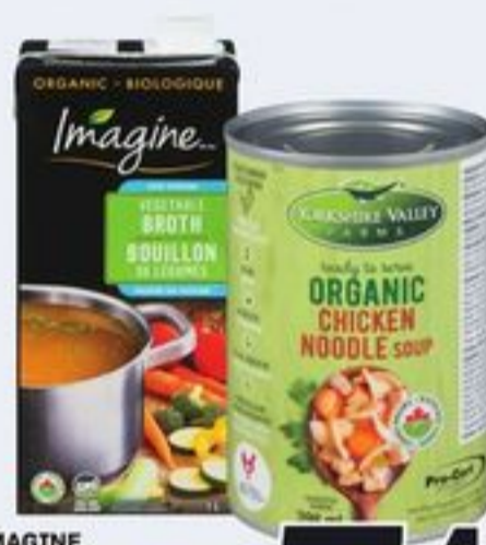
IMAGINE ORGANIC BROTH 1 L OR YORKSHIRE ORGANIC SOUP 398 ML SELECTED VARIETIES 20321614005_EA 21560109_EA