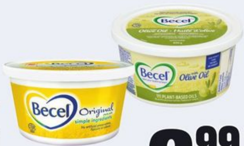
BECEL MARGARINE SELECTED VARIETIES 637/850 G 20297818002_EA/21279389_EA