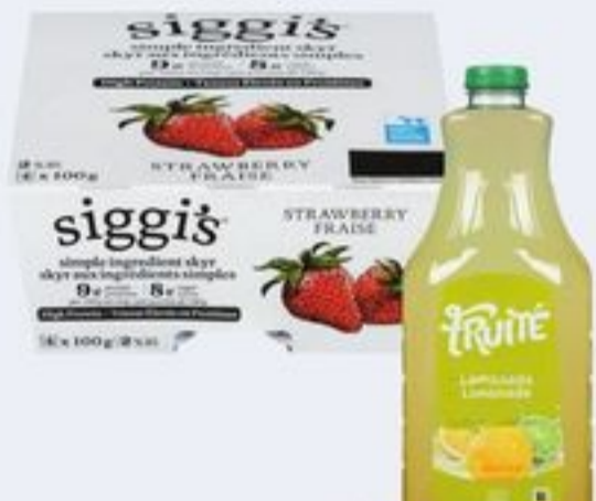
SIGGIS YOGURT 4X100 G OR FRUITÉ DRINK 1.54 L SELECTED VARIETIES 21589925_EA/21595744_EA