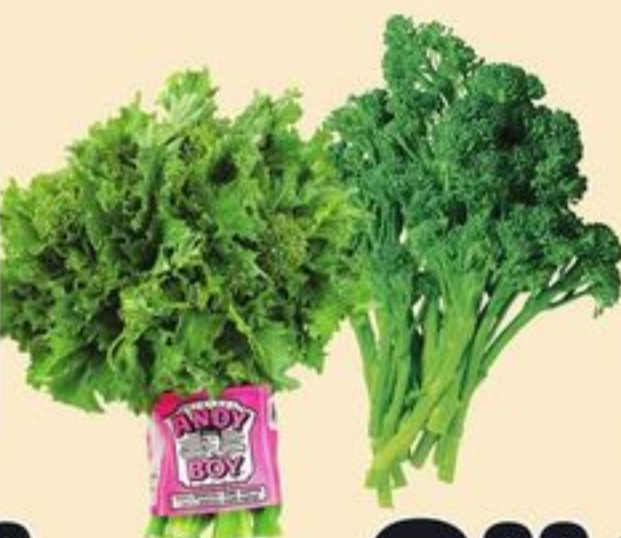
BROCCOLINI OR RAPINI PRODUCT OF USA EACH 20154907_EA/20048070001_EA