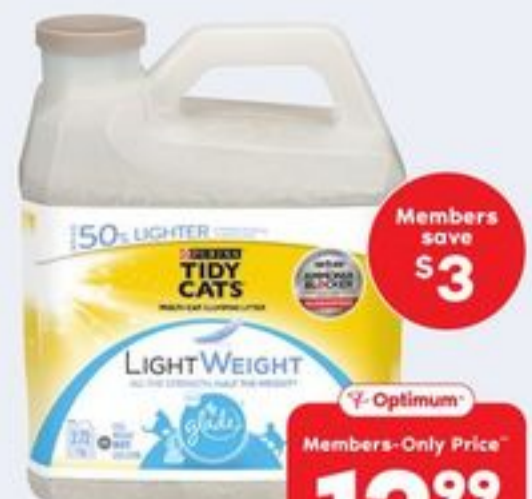
TIDY CATS LITTER SELECTED VARIETIES 2.72 KG 21206503_EA