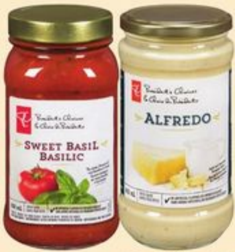
PC ® PASTA SAUCE SELECTED VARIETIES 410/650 ML 20131344009_EA 20320838001_EA