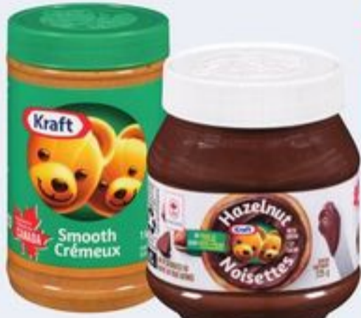
KRAFT PEANUT BUTTER 750 G-1 KG OR HAZELNUT SPREAD 725 G SELECTED VARIETIES 20039581001_EA/21285418_EA