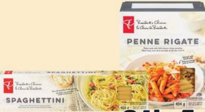
PC ® PASTA SELECTED VARIETIES 454 G 21001578_EA/21001588_EA