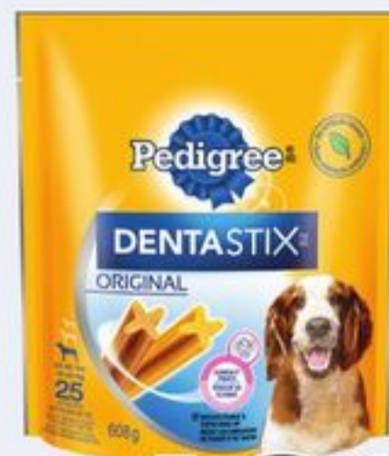
PEDIGREE DENTASTIX TREATS FOR DOGS SELECTED VARIETIES 100 G-1.9 KG 21081180_EA