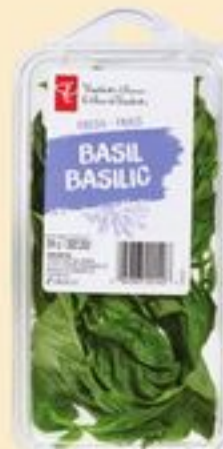
PC ® BASIL, BAY LEAF, SAGE, ROSEMARY OR OREGANO PRODUCT OF COLUMBIA, MEXICO, ECUADOR 28 G 21184798_EA/21212481_EA