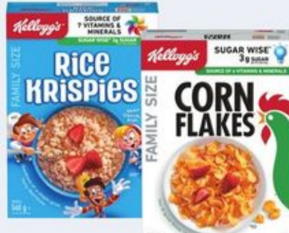
KELLOGG'S FAMILY SIZE CEREAL SELECTED VARIETIES 480-650 G 21449784_EA/21450811_EA