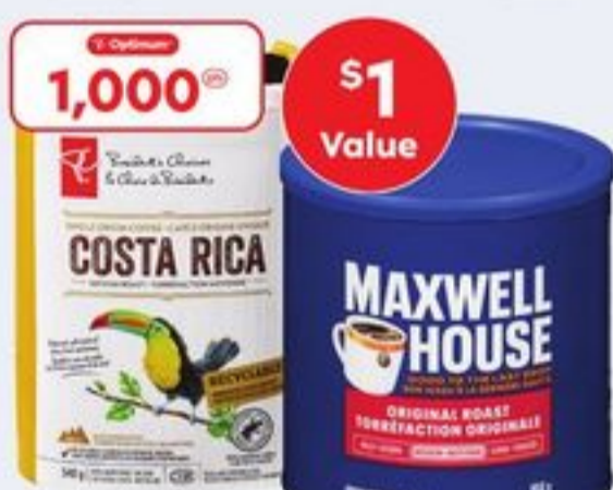
PC® WHOLE BEAN, ROAST OR GROUND 340 G OR MAXWELL HOUSE GROUND COFFEE 631-900 G SELECTED VARIETIES 21380541_EA/21606882_EA