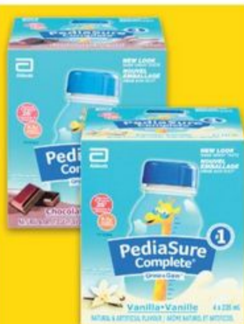
PEDIASURE COMPLETE selected varieties 4x235 ml supplément nutritif 20322414001 EA/20322414002 EA