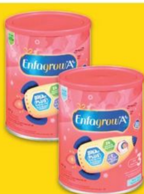
ENFAGROW A+ TODDLER NUTRITIONAL SUPPLEMENT selected varieties, 907 g supplément nutritif pour tout-petit 21407951 EA/21407971 EA