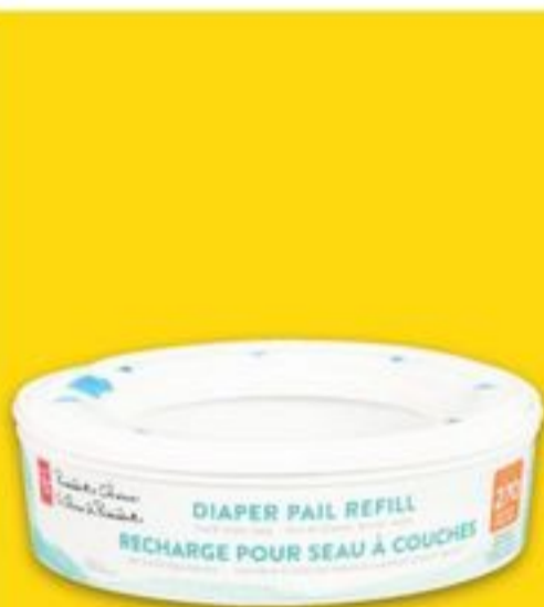
PC® DIAPER PAIL REFILL 270's recharge pour seau de couches 11307016 EA