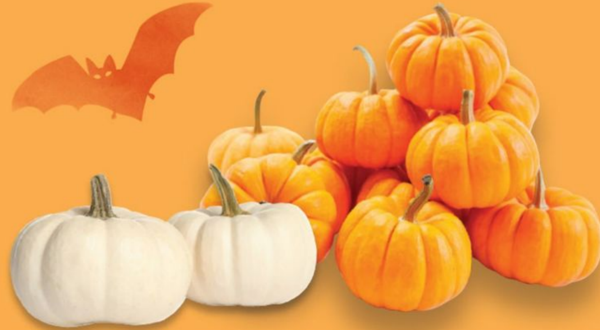
MINI WHITE OR ORANGE PUMPKINS 99¢