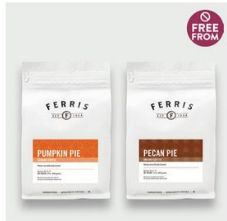
Ferris Pumpkin or Pecan Coffee 12 oz