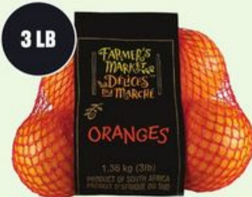
FARMER'S MARKET™ SEEDLESS ORANGE PRODUCT OF SOUTH AFRICA 3 LB 20162945001_EA