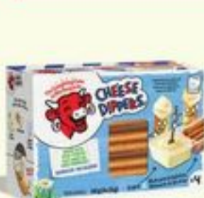
CHEESE DIPPER 4P, 140 G 21201454_EA