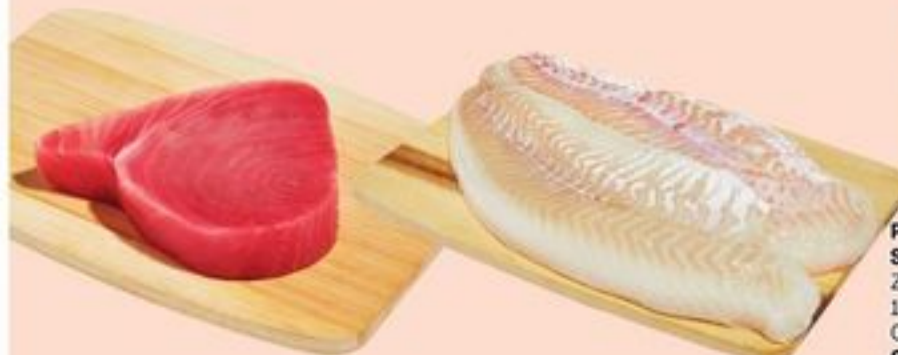
TUNA STEAKS FROZEN OR PREVIOUSLY FROZEN 29.74/KG 20753134_KG

Fresh seafood items subject to availability.