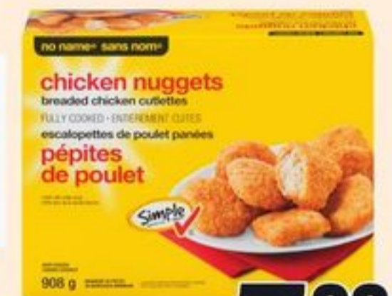
NO NAME® CHICKEN NUGGETS FROZEN 908 G 21178745_EA