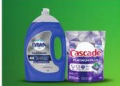
11.99 Dawn Dishwashing Detergent 2.21-2.64 L, Cascade Dishwasher Tabs 21-26's, Selected Varieties 21430600_EA/21516288_EA