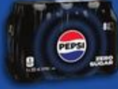
LESS THAN 2 $7.49 EA. 2/$13 PEPSI SOFT DRINK selected varieties 8 x 355 mL 21361864_C08