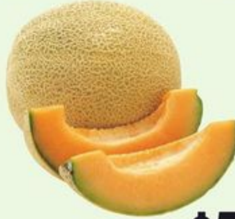
CANTALOUPE PRODUCT OF U.S.A. EACH 20162017001_EA