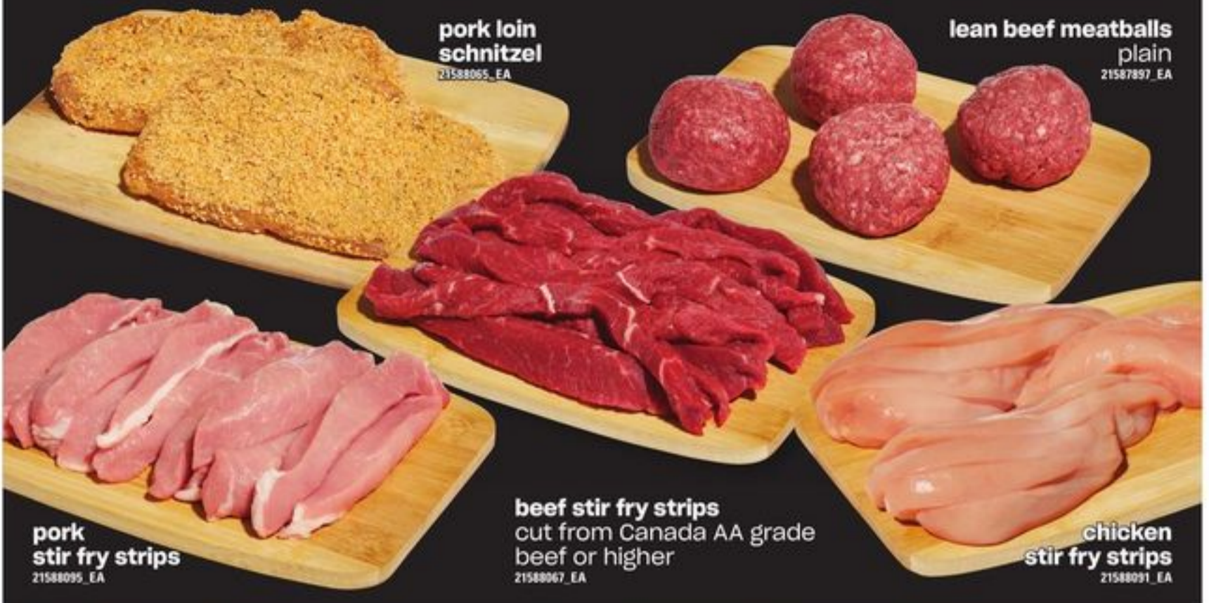
pork loin schnitzel 21588065_EA