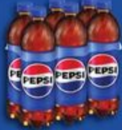
LESS THAN 2 $7.49 EA. 2/$12 PEPSI SOFT DRINK selected varieties 6 x 710 mL 20310546002_C06