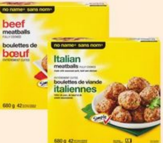
NO NAME® MEATBALLS SELECTED VARIETIES FROZEN 680 G 21537713_EA 21538491_EA