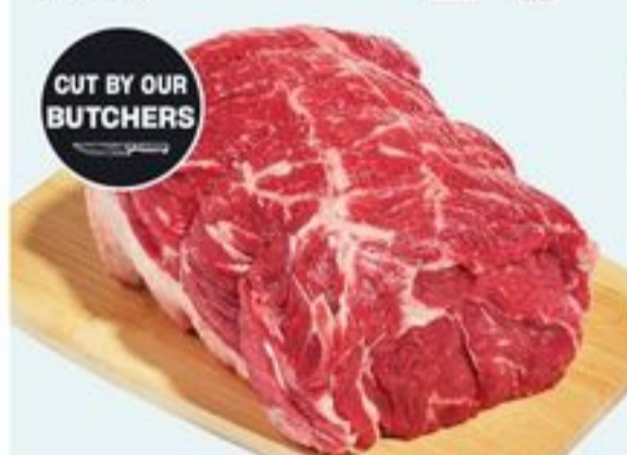
WEST BONELESS BLADE ROAST CUT FROM CANADA AA GRADE WESTERN BEEF 22.02/KG 20804772_KG