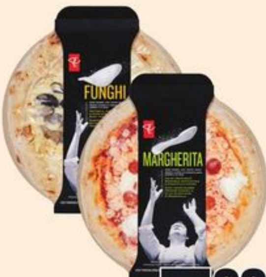
PC® BLACK LABEL PIZZA SELECTED VARIETIES FROZEN 370/420 G 21531412_EA/21531415_EA