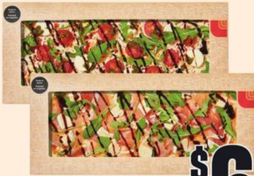
FLATBREAD PIZZA SELECTED VARIETIES 340-415 G 21487152_EA/21487153_EA