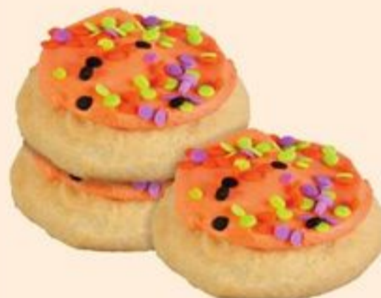
HALLOWEEN FROSTED COOKIES 12'S 21539438_EA