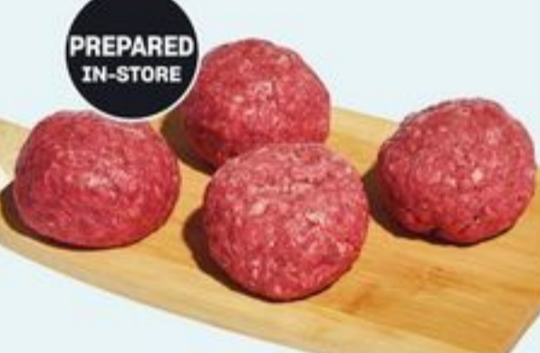
LEAN BEEF MEATBALLS SELECTED VARIETIES 425 G 21587897_EA