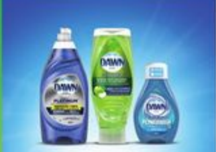
4.29 Dawn 825 - 982 mL, Dawn EZ Squeeze 535 - 650 mL, Dawn Powerwash Refill 473 mL, Selected Varieties 21430569_EA/21516486_EA