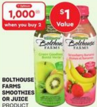
BOLTHOUSE FARMS SMOOTHIES OR JUICE PRODUCT OF U.S.A., SELECTED VARIETIES 946 ML 20316397_EA 20325816_EA