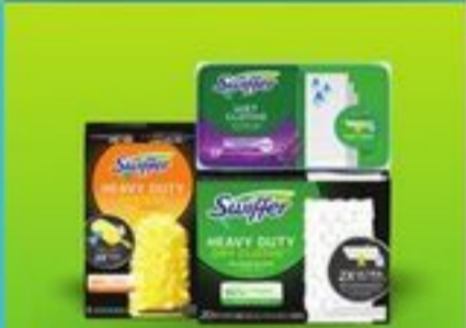
11.99 Swiffer Duster Refills 6-10's, Wet Refills 12-24's, Dry Refills 16-32's, Selected Varieties 21176851_EA/20028650_EA