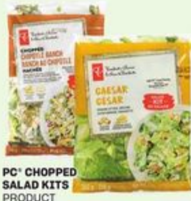
PC® CHOPPED SALAD KITS PRODUCT OF U.S.A., SELECTED VARIETIES 282-369 G 21378027_EA 21378005_EA