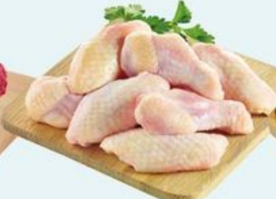
SPLIT CHICKEN WINGS FAMILY SIZE 12.10/KG 20761916_KG