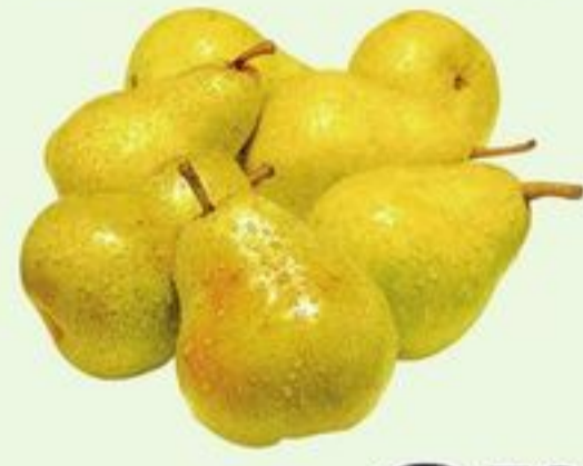
BARTLETT PEARS PRODUCT OF U.S.A., U.S.A. FANCY GRADE 5.51/KG 20172240001_KG