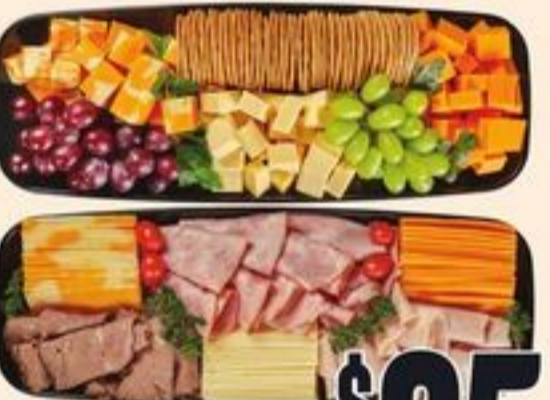
PARTY PLATTER SELECTED VARIETIES 696 G/1.8 KG 21217521_EA/21217522_EA