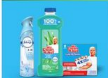
4.29 Febreze Air 250 g, Car 2 mL, Small Spaces 7.5 mL, Mr. Clean All Purpose Cleaner 1.2 L, Magic Eraser 2-3's, Clean Freak 473 mL, Refill, Selected Varieties 21005017_EA/21574751_EA