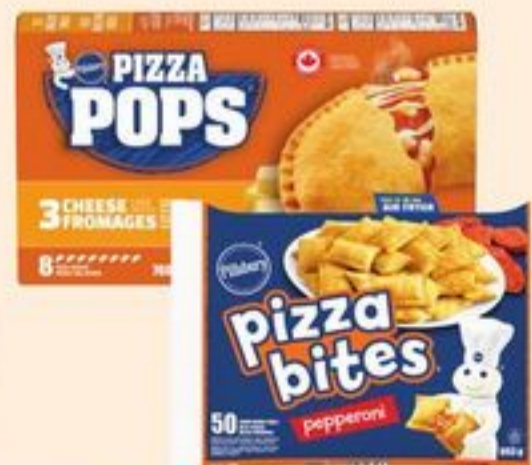
PILLSBURY PIZZA POPS OR BITES SELECTED VARIETIES FROZEN 693-760 G 21439538_EA 20972958_EA