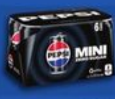
LESS THAN 2 $4.99 EA. 2/$8 PEPSI SOFT DRINK selected varieties 6 x 222 mL 2189960_C06