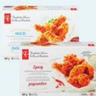
PC® WINGS SELECTED VARIETIES, FROZEN 700-907 G 20708932_EA/20708933_EA