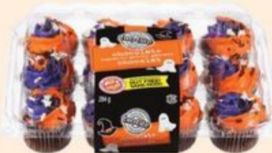
MINI HALLOWEEN CUPCAKES CHOCOLATE OR VANILLA 12'S 21296828_EA