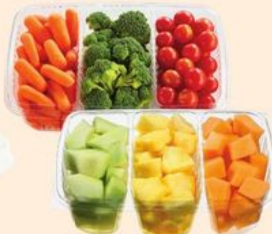
FRUIT OR VEGGIE TRI PACKS PREPARED FRESH IN-STORE DAILY 830-1200 G 20022119_EA/21209367_EA