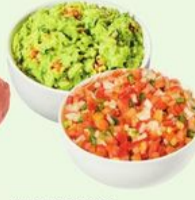
GUACAMOLE 320 G OR PICO DE GALLO SALSA 220 G PREPARED FRESH IN-STORE 21552215_EA/21422263_EA