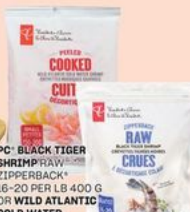
PC® BLACK TIGER SHRIMP/RAW SHRIMPRAW ZIPPERBACK™ 16-20 PER LB 400 G OR WILD ATLANTIC COLD WATER SHRIMP COOKED PEELED 150-200 PER LB 340 G FROZEN 20021832_EA 20801192_EA