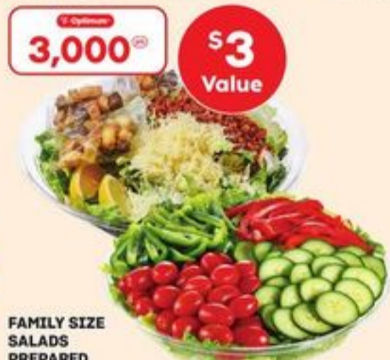
FAMILY SIZE SALADS PREPARED FRESH IN-STORE DAILY SELECTED VARIETIES 740 G-1.47 KG 20972500_EA 20972512_EA