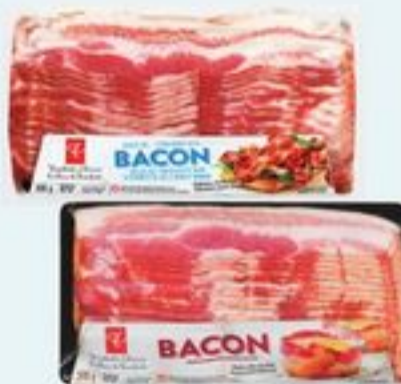
PC® NATURALLY SMOKED BACON SELECTED VARIETIES 375-500 G 20152629_EA/21525048_EA