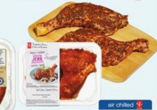
PC® WORLD OF FLAVOURS™ JERK CHICKEN LEGS AIR CHILLED 13.21/KG 21454286_KG