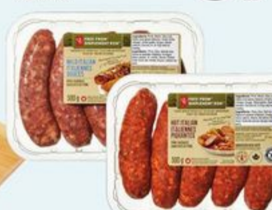
PC® FREE FROM™ SAUSAGE SELECTED VARIETIES 375/500 G 20119782_EA/20562167_EA