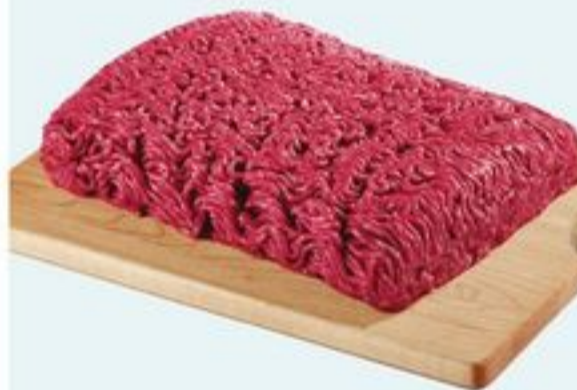
LEAN GROUND BEEF FAMILY SIZE 16.51/KG 20357787_KG