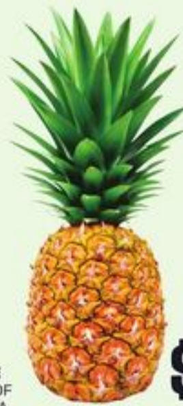
PINEAPPLE PRODUCT OF COSTA RICA EACH 20119813001_EA