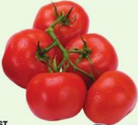
WEST ENGLISH CUCUMBERS 2.50 EACH OR TOMATOES ON THE VINE 2.50 LB 5.51/KG PRODUCT OF WESTERN PROVINCES 20070132001_EA/20026703001_KG