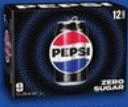
PEPSI SOFT DRINK selected varieties 12 x 355 mL 20322361001_C12

OFFICIAL SOFT DRINK OF THE NATIONAL FOOTBALL LEAGUE