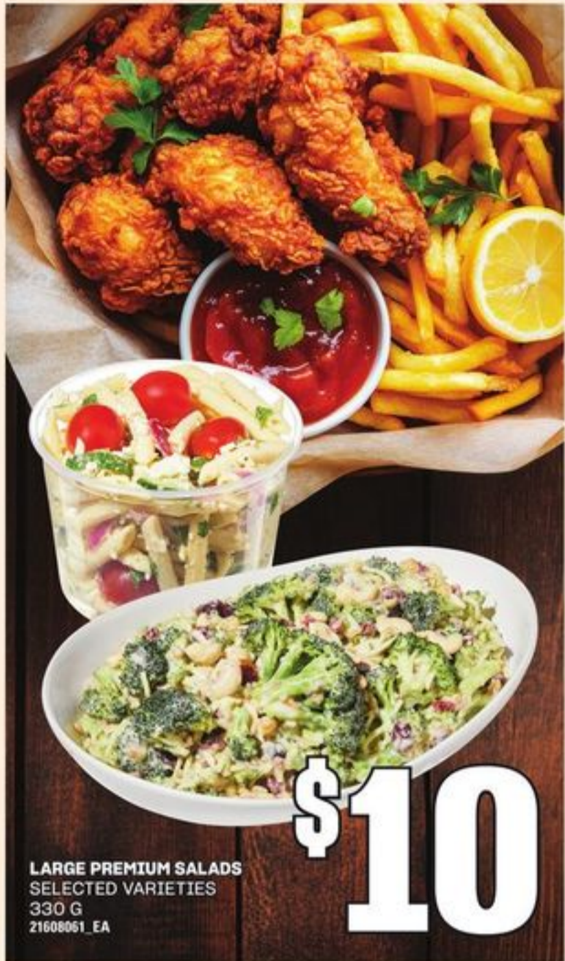
LARGE PREMIUM SALADS SELECTED VARIETIES 330 G 21608061_EA