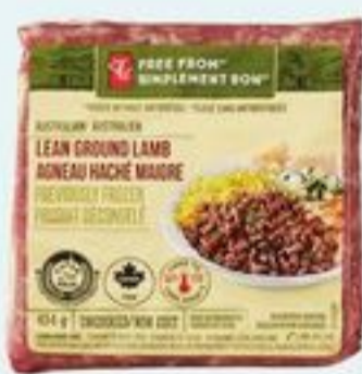
PC® FREE FROM™ GROUND LAMB 454 G 21352008_EA