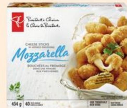
PC® MOZZARELLA CHEESE STICKS FROZEN 454 G 21116020_EA