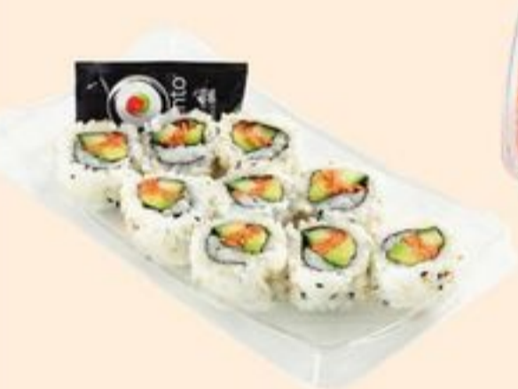
BENTO CALIFORNIA ROLLS SELECTED VARIETIES 200-220 G 20974851_EA