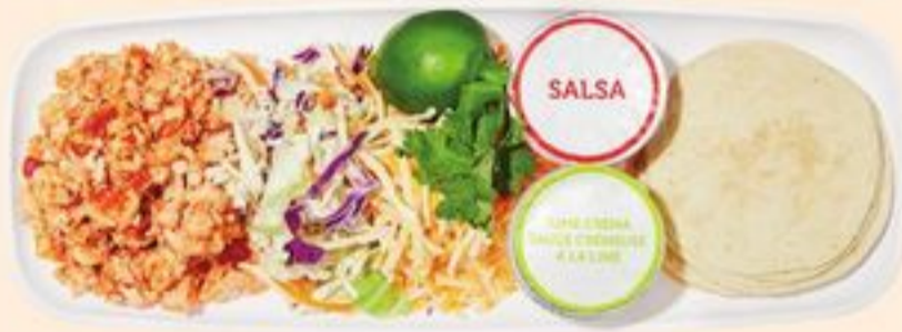
CHICKEN, FAJITA, GYRO OR SOUVLAKI CHICKEN TACO TRAYS 1-1.1 KG 21395977_EA