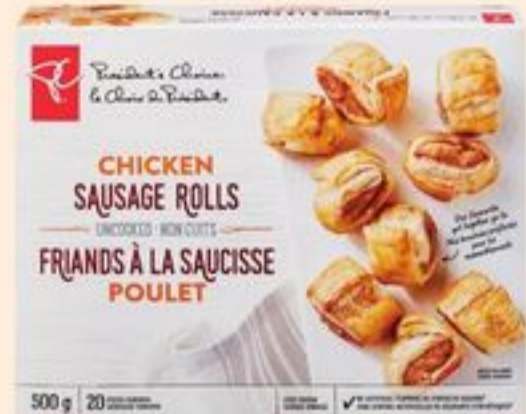
PC® CHICKEN SAUSAGE ROLLS FROZEN 500 G 21439588_EA