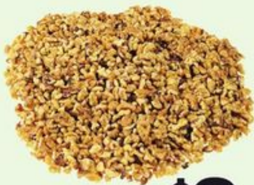
WALNUTS PRODUCT OF U.S.A. 6.61/KG 20123893001_KG