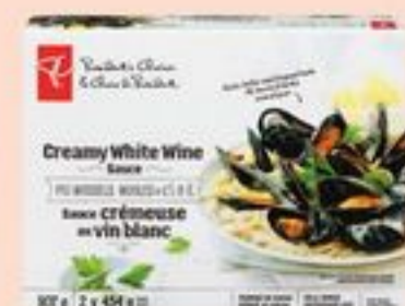
PEI MUSSELS IN PROVENCEALE OR CREAMY WHITE WINE SAUCE 907 G FROZEN 20838560_EA