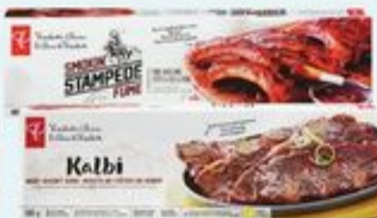
PC® BBQ PORK BACK RIBS 680 G OR KOREAN BEEF SHORT RIBS 500 G SELECTED VARIETIES, FROZEN 20071715_EA/21394197_EA