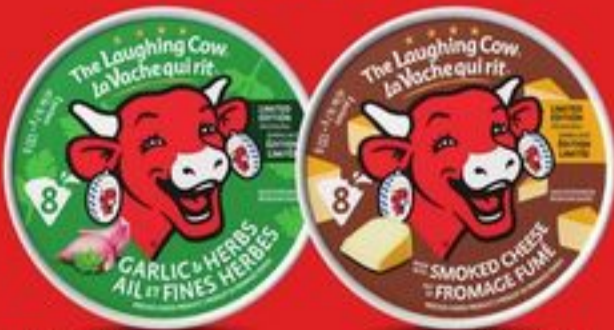
$4.99 THE LAUGHING COW, 8P, 133 G