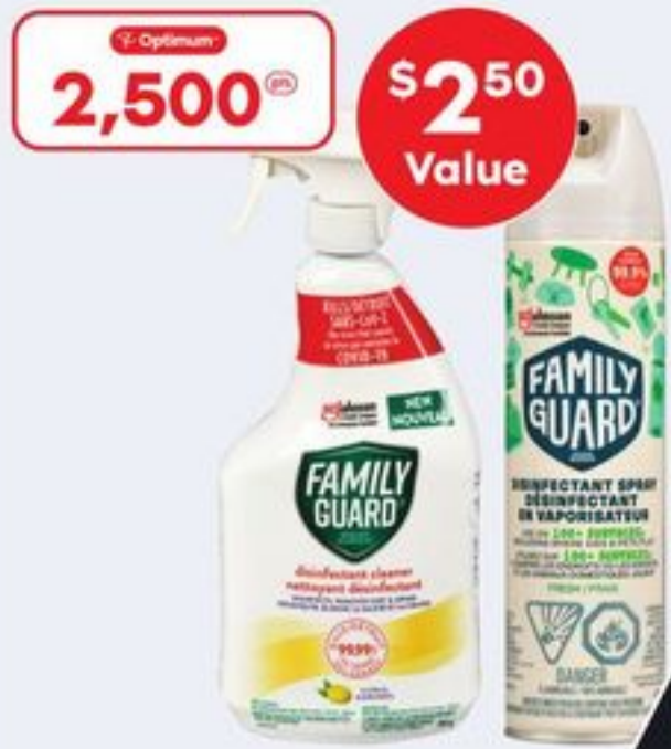
FAMILY GUARD DISINFECTING SPRAY SELECTED VARIETIES 496 G/946 ML 21428112_EA