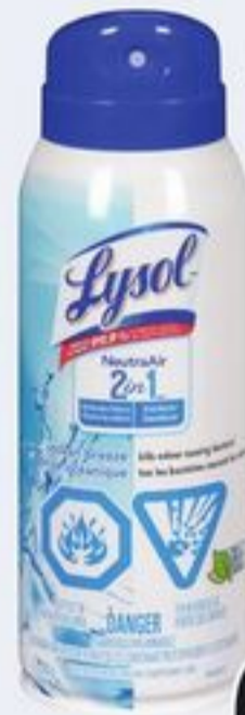
LYSOL NEUTRA-AIR DISINFECTANT SPRAY & FRESHENER SELECTED VARIETIES 283 G 21433312_EA