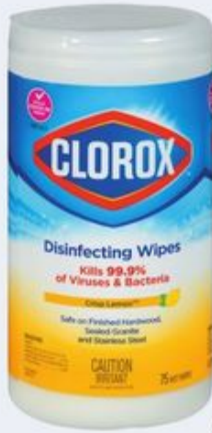
CLOROX DISINFECTING WIPES SELECTED VARIETIES 75'S 20348537002_EA