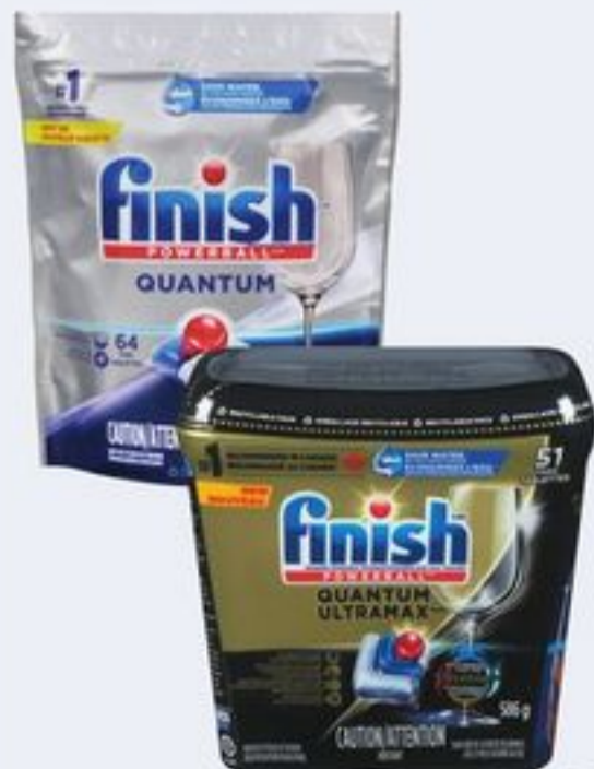
FINISH QUANTUM, ULTIMATE & ULTRAMAX 51-64'S DISHWASHER DETERGENT TABS SELECTED VARIETIES 21217949_EA