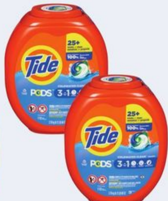
TIDE PODS 112/85'S OR POWER PODS 63'S SELECTED VARIETIES 21450133_EA