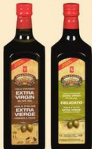
PC ® SPLENDIDO ® COLD-PRESSED OR COLD-EXTRACTED DELICATO EXTRA VIRGIN OLIVE OIL 1 L 20081865_EA 21401612_EA