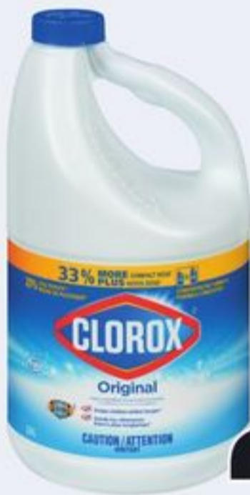
CLOROX BLEACH 2.4 L 21283179_EA