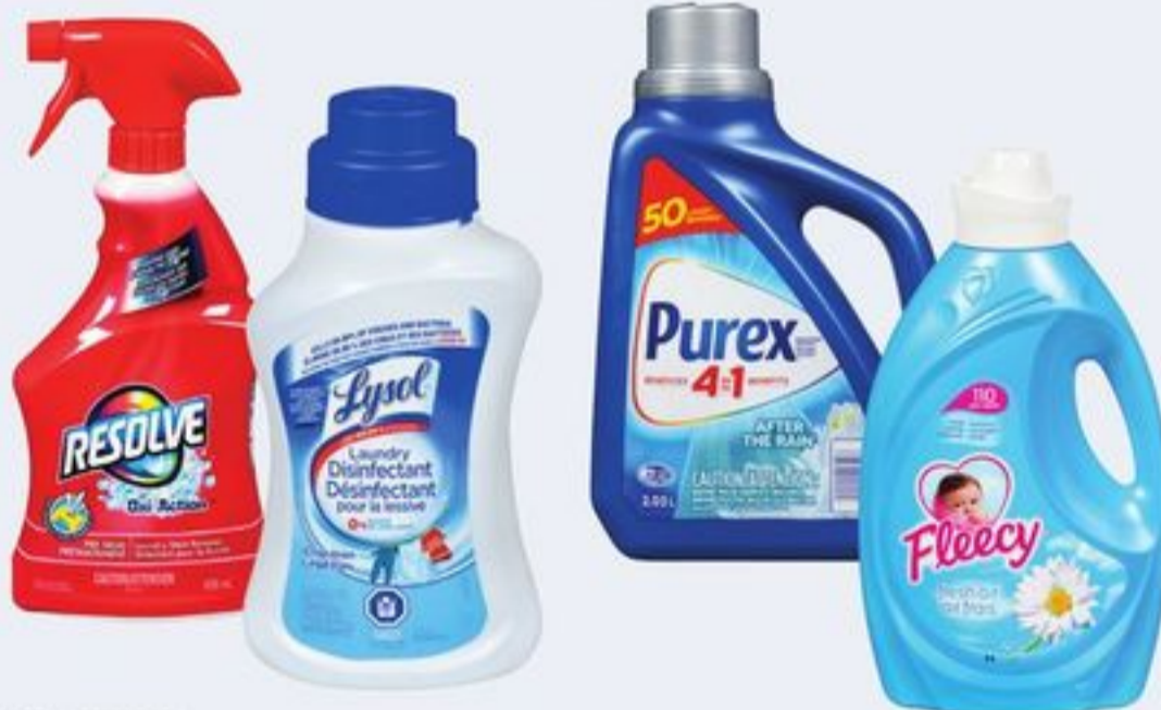
LYSOL LAUNDRY DISINFECTANT 1.2 L OR RESOLVE IN WASH POWDER OR SPRAYS 625 G/650 ML SELECTED VARIETIES 20323370_EA/21487308_EA