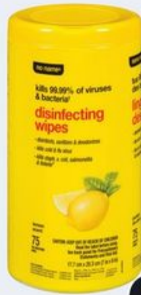
NO NAME® DISINFECTANT WIPES SELECTED VARIETIES 75'S 21386771_EA