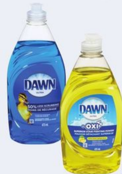
DAWN DISHWASHING LIQUID SELECTED VARIETIES 431-473 ML 21430501_EA/21516564_EA