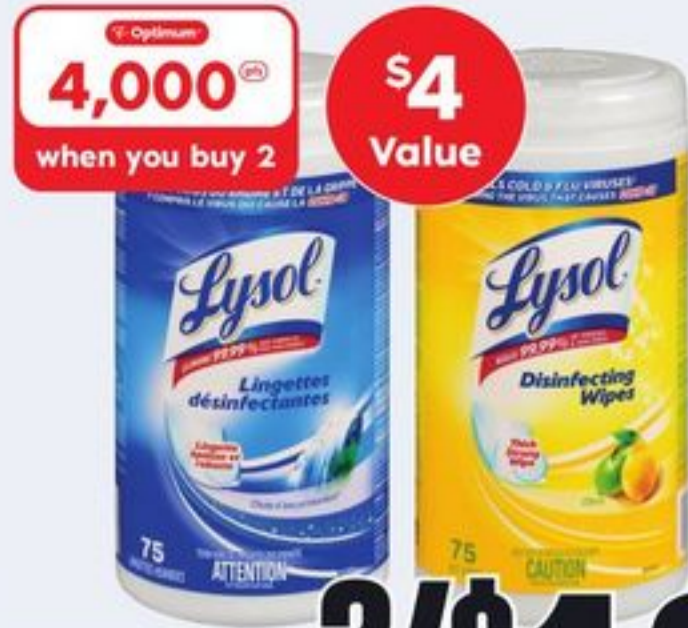
LYSOL WIPES 75-84'S, DISINFECTANT SPRAY 50 G OR TOILET BOWL CLEANER 946 ML SELECTED VARIETIES 21449826_EA/21449829_EA