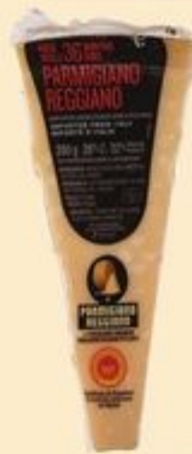
PC ® BLACK LABEL PARMIGIANO REGGIANO CHEESE PRODUCT OF ITALY AGED 36 MONTHS 200 G 20626019_EA