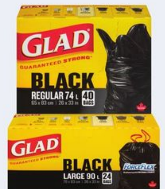
GLAD OUTDOOR BAGS SELECTED VARIETIES 10-90'S 21165477_EA