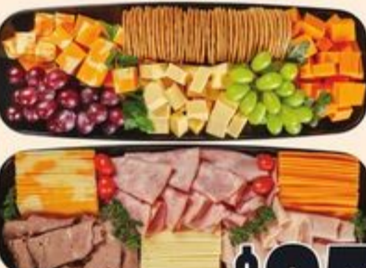
PARTY PLATTER SELECTED VARIETIES 696 G/1.8 KG 21217521_EA/21217522_EA