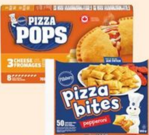
PILLSBURY PIZZA POPS OR BITES SELECTED VARIETIES FROZEN 693-760 G 21439938_EA 20972958_EA