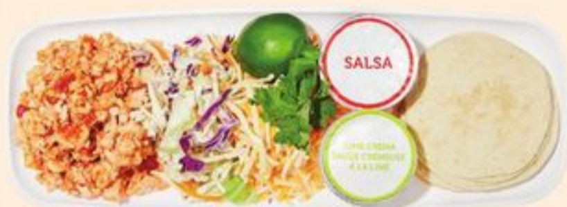
CHICKEN, FAJITA, GYRO OR SOUVLAKI CHICKEN TACO TRAYS 1-1.1 KG 21395977_EA