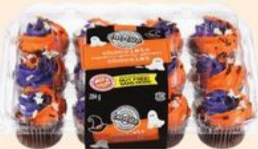
MINI HALLOWEEN CUPCAKES CHOCOLATE OR VANILLA 12'S 21296828_EA