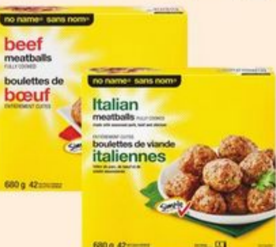
NO NAME® MEATBALLS SELECTED VARIETIES FROZEN 680 G 21537713_EA 21538491_EA