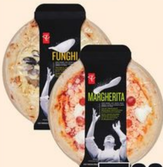
PC® BLACK LABEL PIZZA SELECTED VARIETIES FROZEN 370/420 G 21531412_EA/21531415_EA