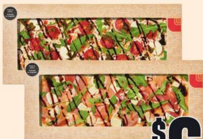
FLATBREAD PIZZA SELECTED VARIETIES 340-415 G 21487152_EA/21487153_EA