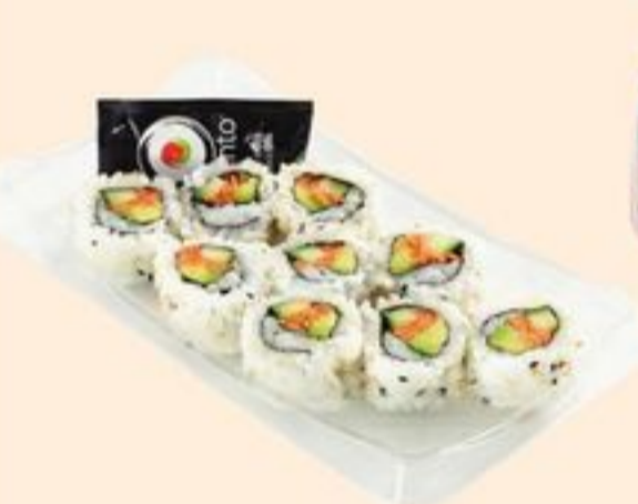
BENTO CALIFORNIA ROLLS SELECTED VARIETIES 200-220 G 20974851_EA