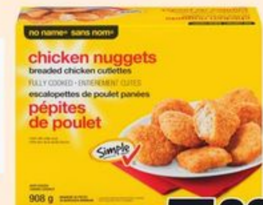
NO NAME® CHICKEN NUGGETS FROZEN 908 G 21178745_EA