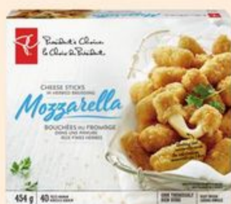
PC® MOZZARELLA CHEESE STICKS FROZEN 454 G 21116020_EA