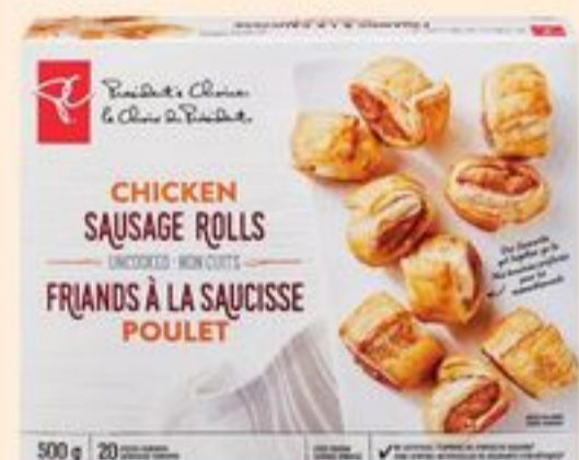
PC® CHICKEN SAUSAGE ROLLS FROZEN 500 G 21439588_EA