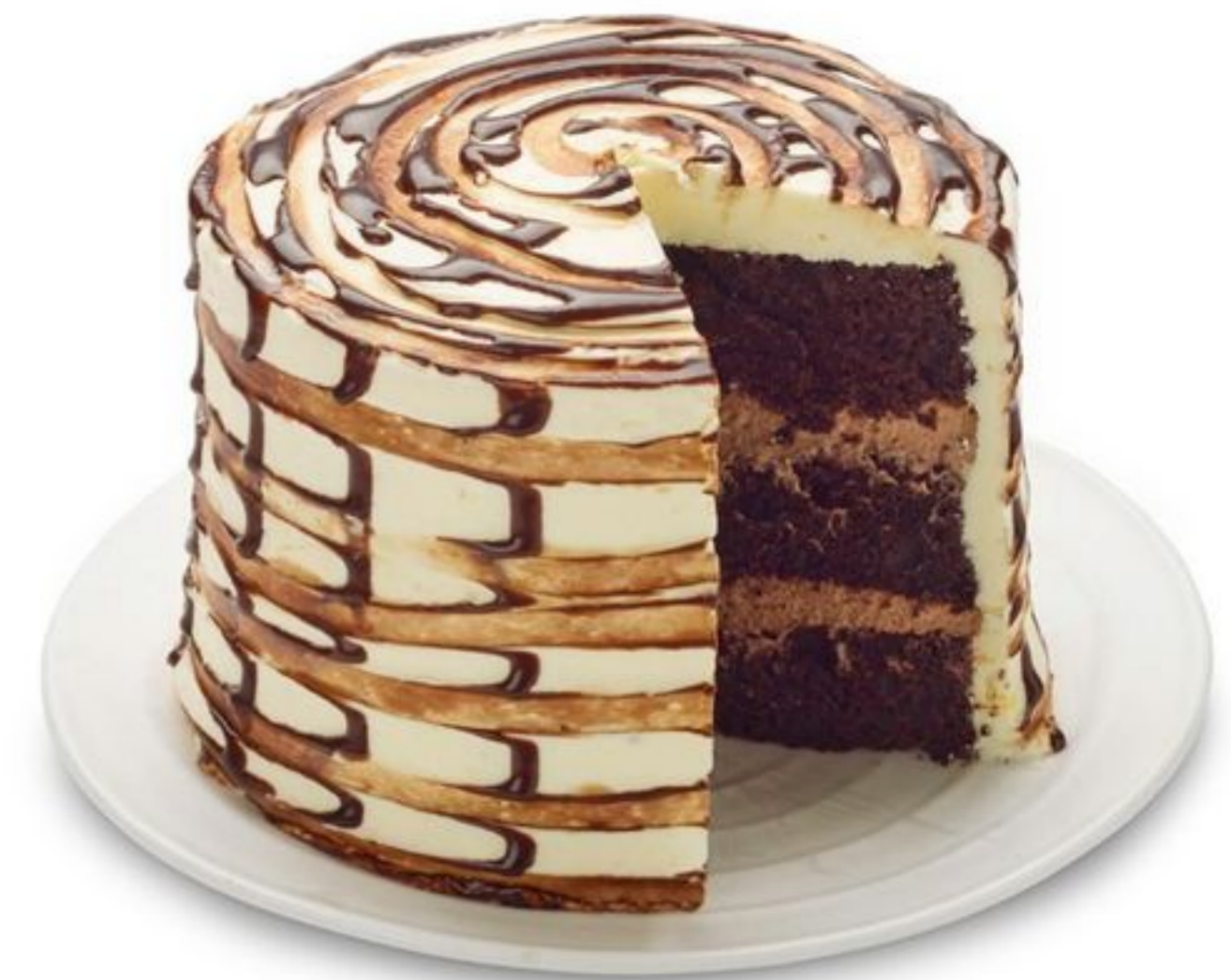
Chocolate Swirl Cake $18 99 Also Selected Varieties, 700g