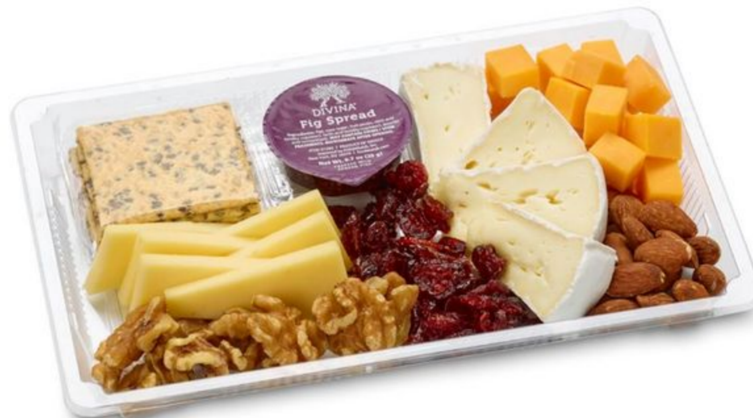
Urban Fare Cheese Plate Made in Store, 200g