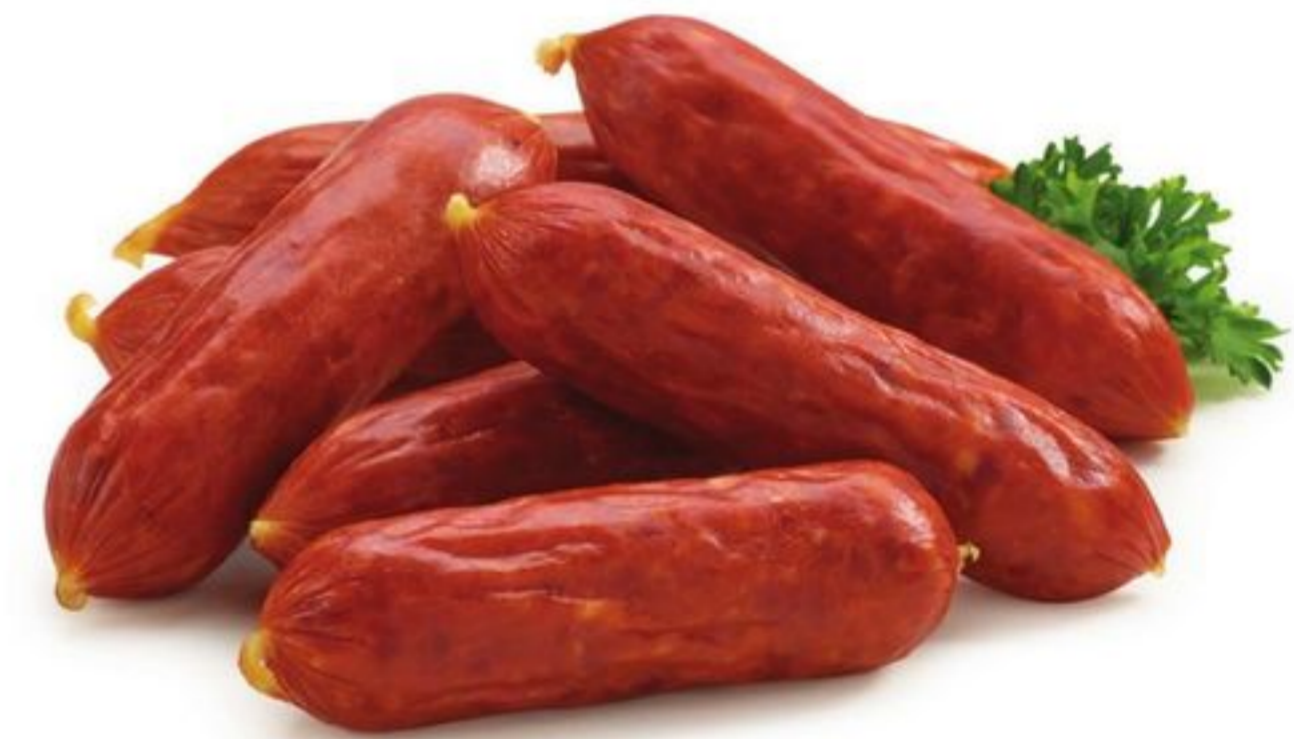
Grimm's Pepperoni Bites Selected Varieties