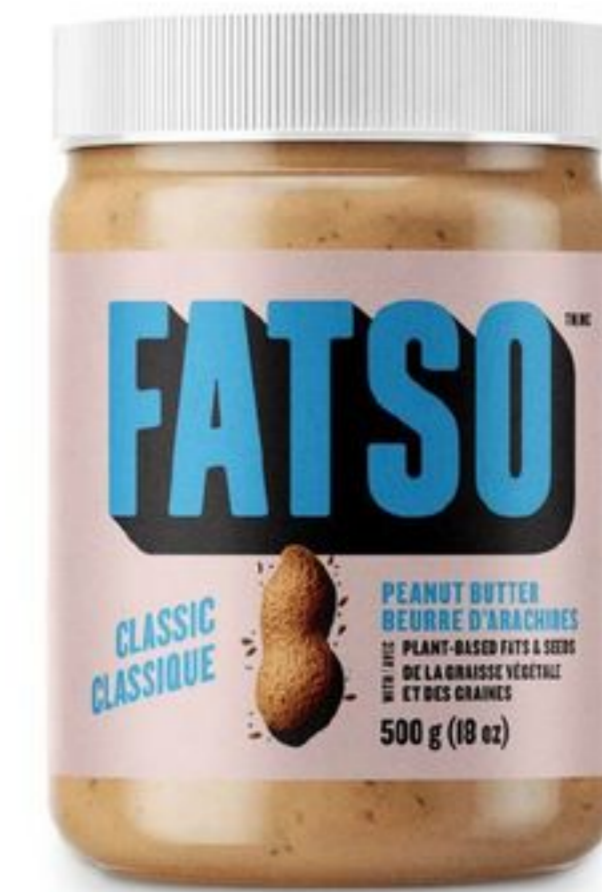
Fatso High Performance Peanut Butter $7 99