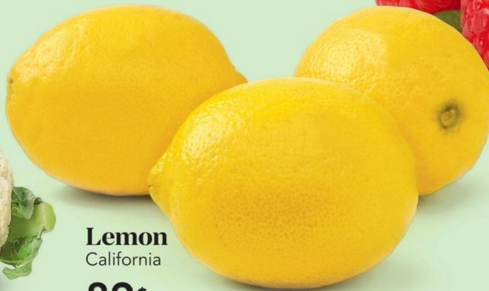
Lemon California 89¢