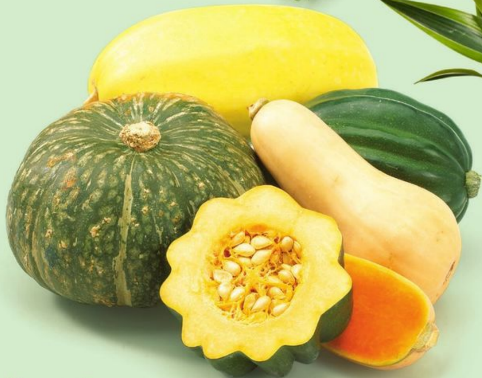
Squash BC, Selected Varieties, 3.73/kg $1 69 /lb