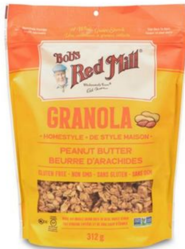
Bob's Red Mill Granola 312g $7 99