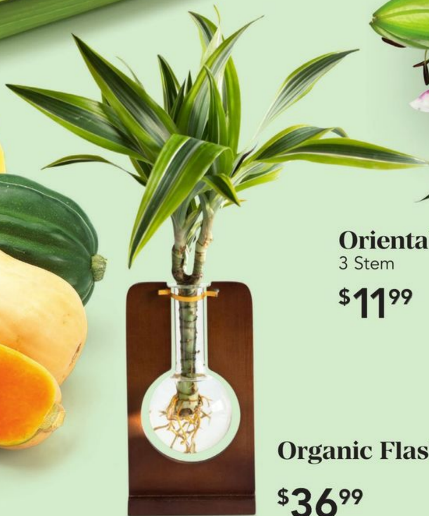
Organic Flask $36 99