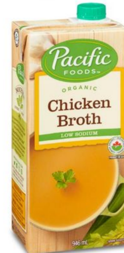
Pacific Foods Organic Broth Selected Varieties, 1 Litre $5 49