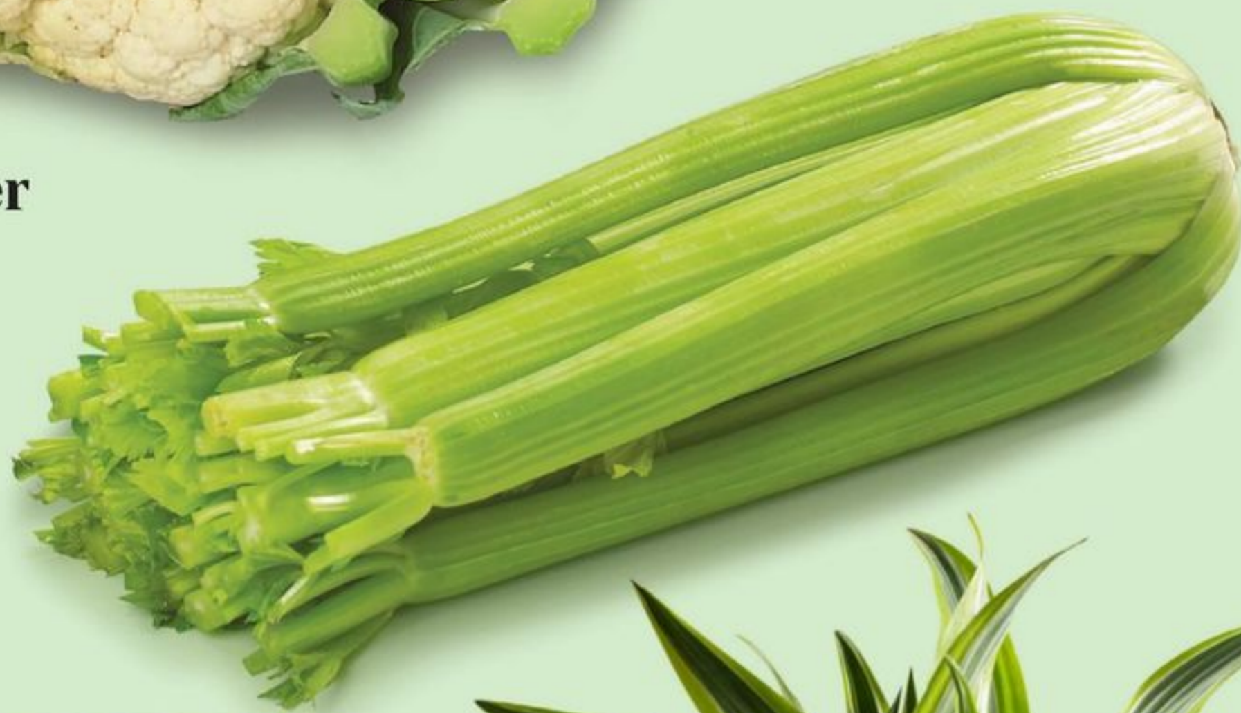
Celery USA, Bunch, 4.39/kg $1 99 /lb