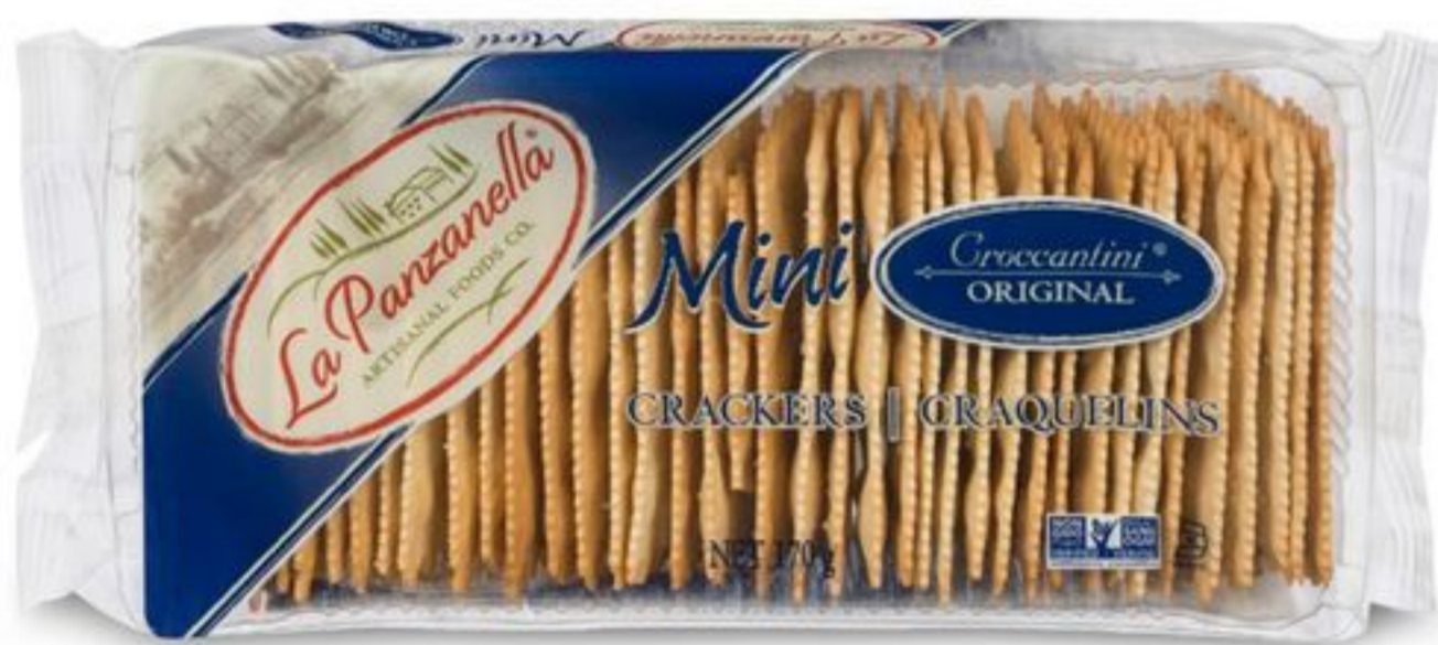
La Panzanella 170g $5 49