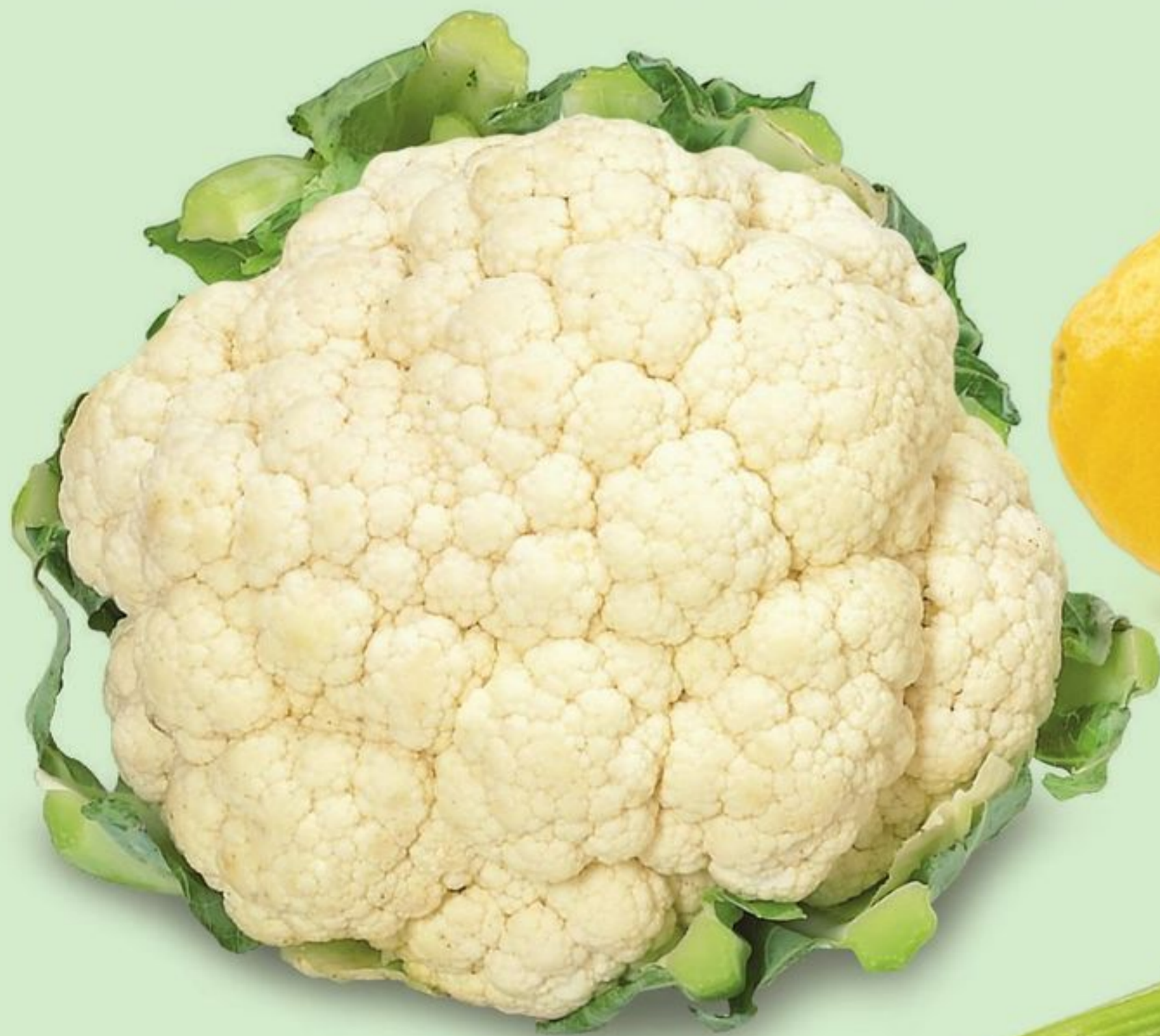
Cauliflower USA $3 99