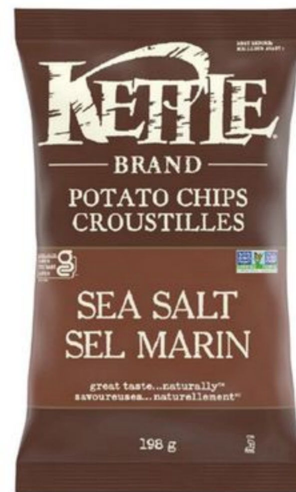
Kettle Brand Potato Chips Selected Varieties, 198g 2 for $8