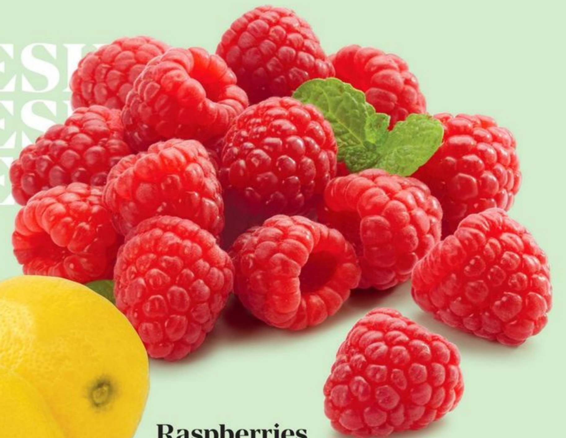
Raspberries California or Mexico, 170g $3 99