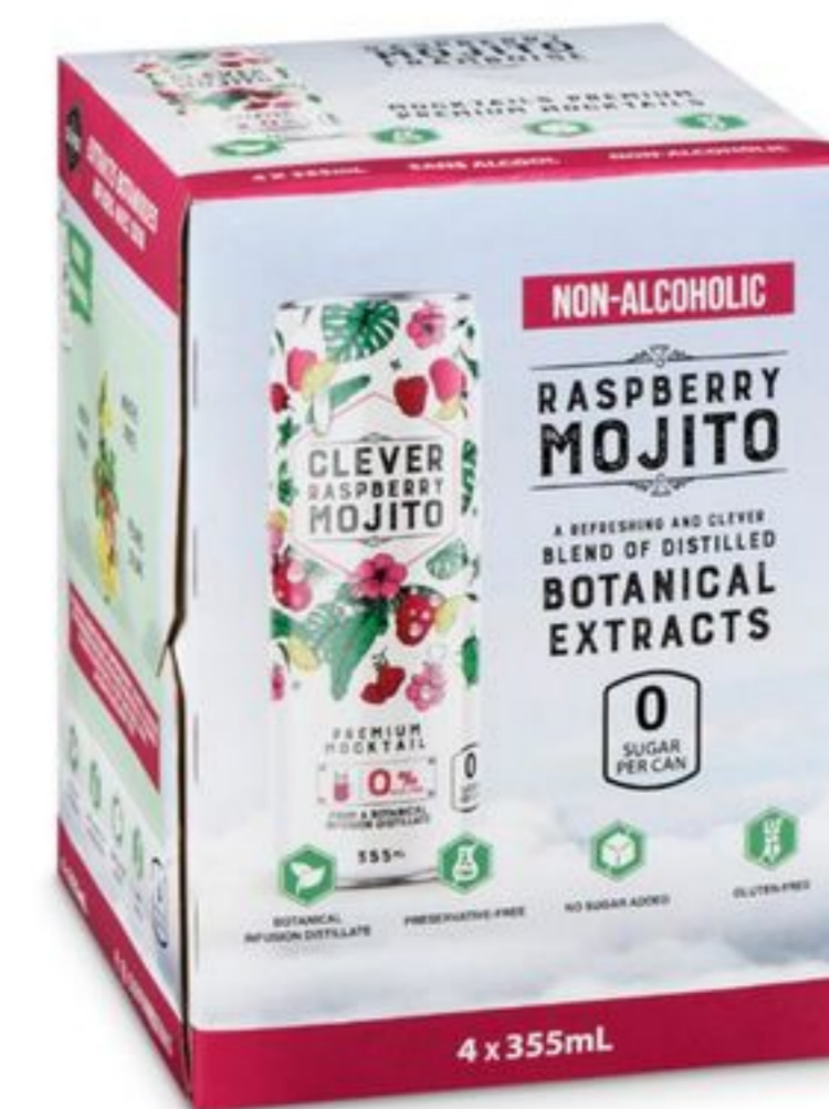
Clever Mocktails 4 x 355 mL $10 99