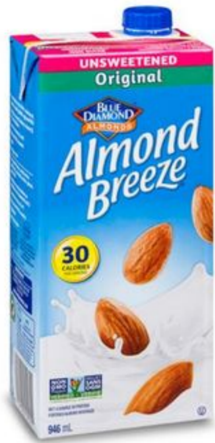
Blue Diamond Almond Breeze Beverage 946 mL $2 99