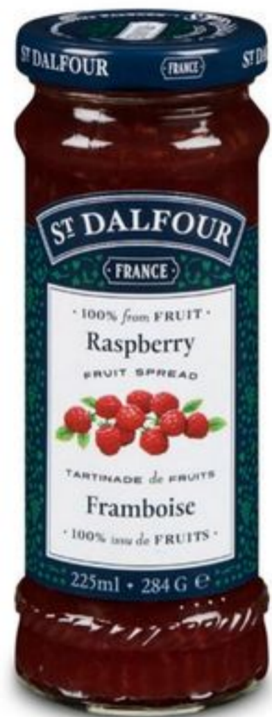
St. Dalfour Spread 225 mL $5 99