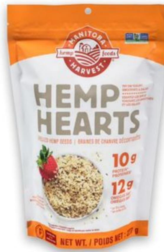
Manitoba Hemp Hearts 227g $7 49