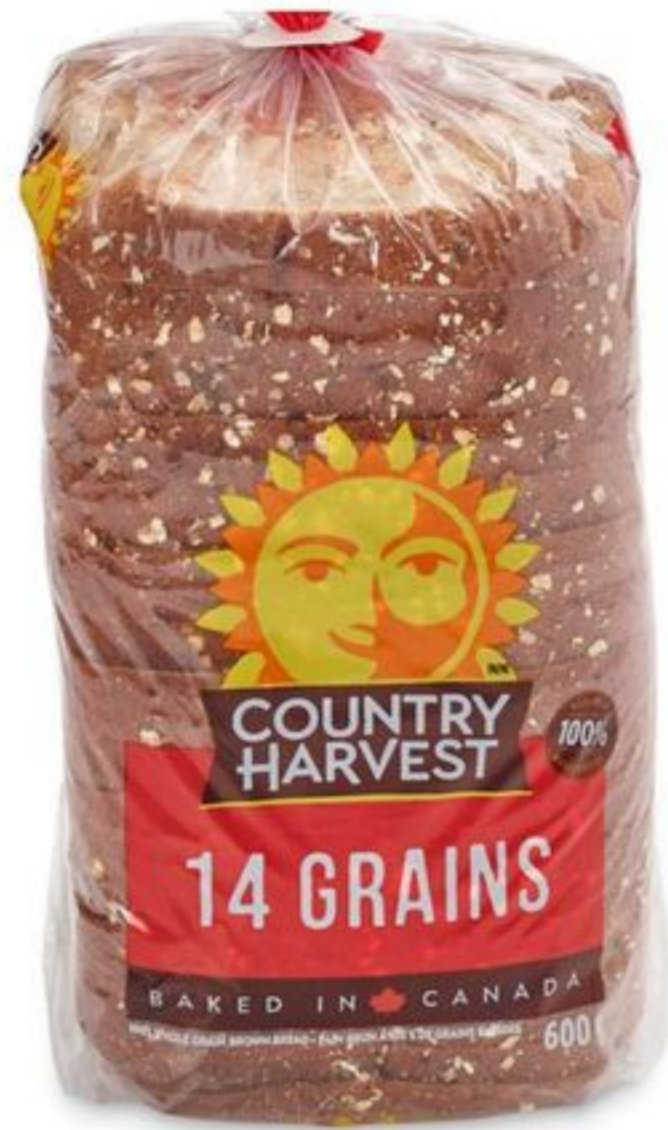
Country Harvest Bread Selected Varieties