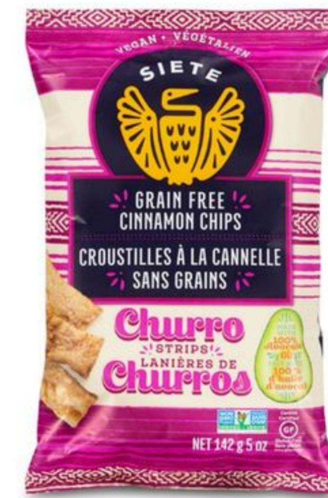
Siete Tortilla Chips 142g $5 99