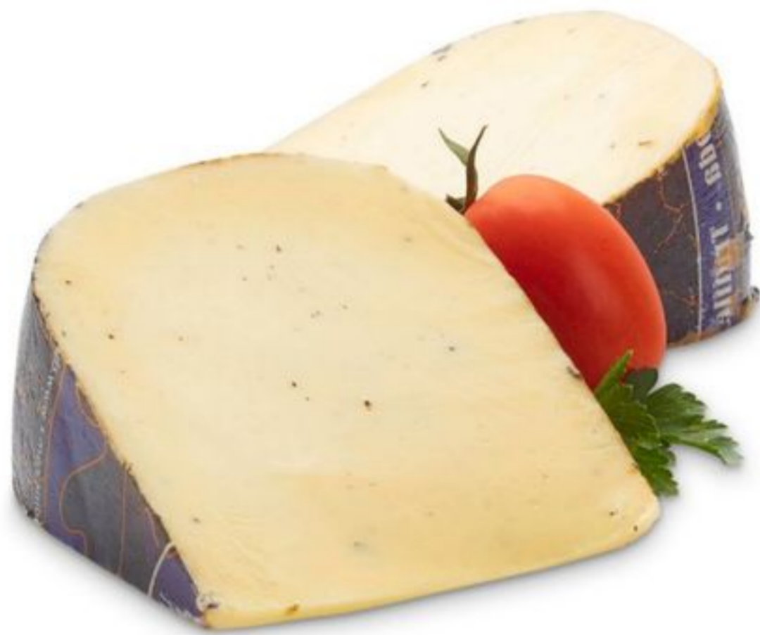
Truffle Gouda Cheese Imported, Selected Varieties