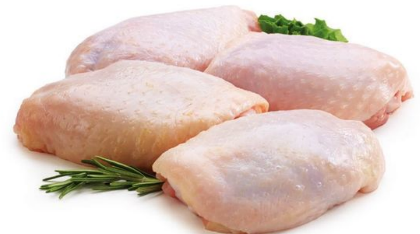
Chicken Thighs Fresh, Bone In, Raised without Antibiotics, 13.21/kg