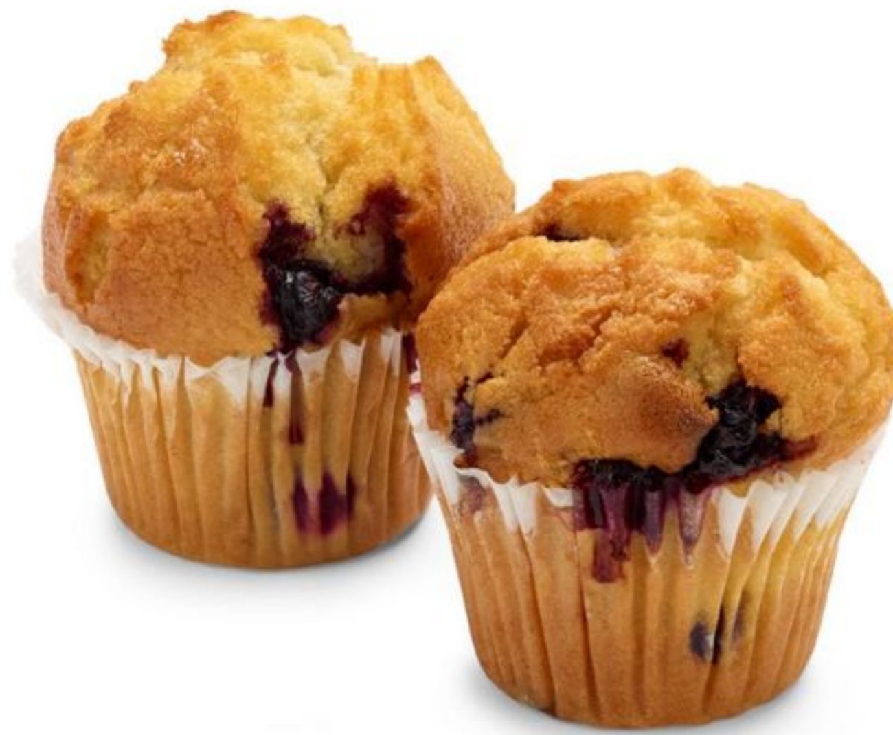
Pumpkin Muffins Selected Varieties, Pack of 4