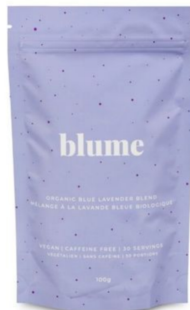
Blume Superfood Latte 100g $19 99