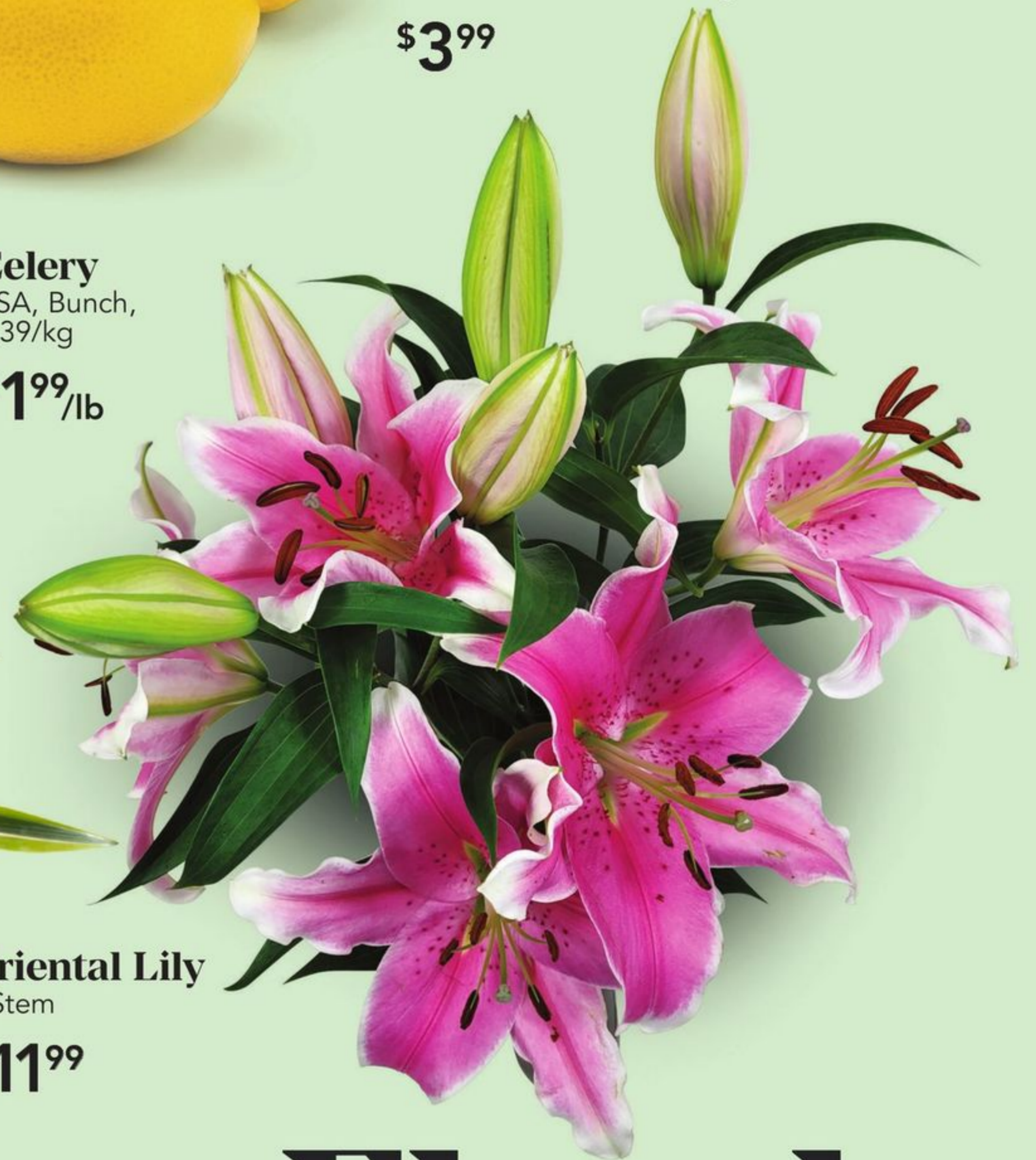
Oriental Lily 3 Stem $11 99