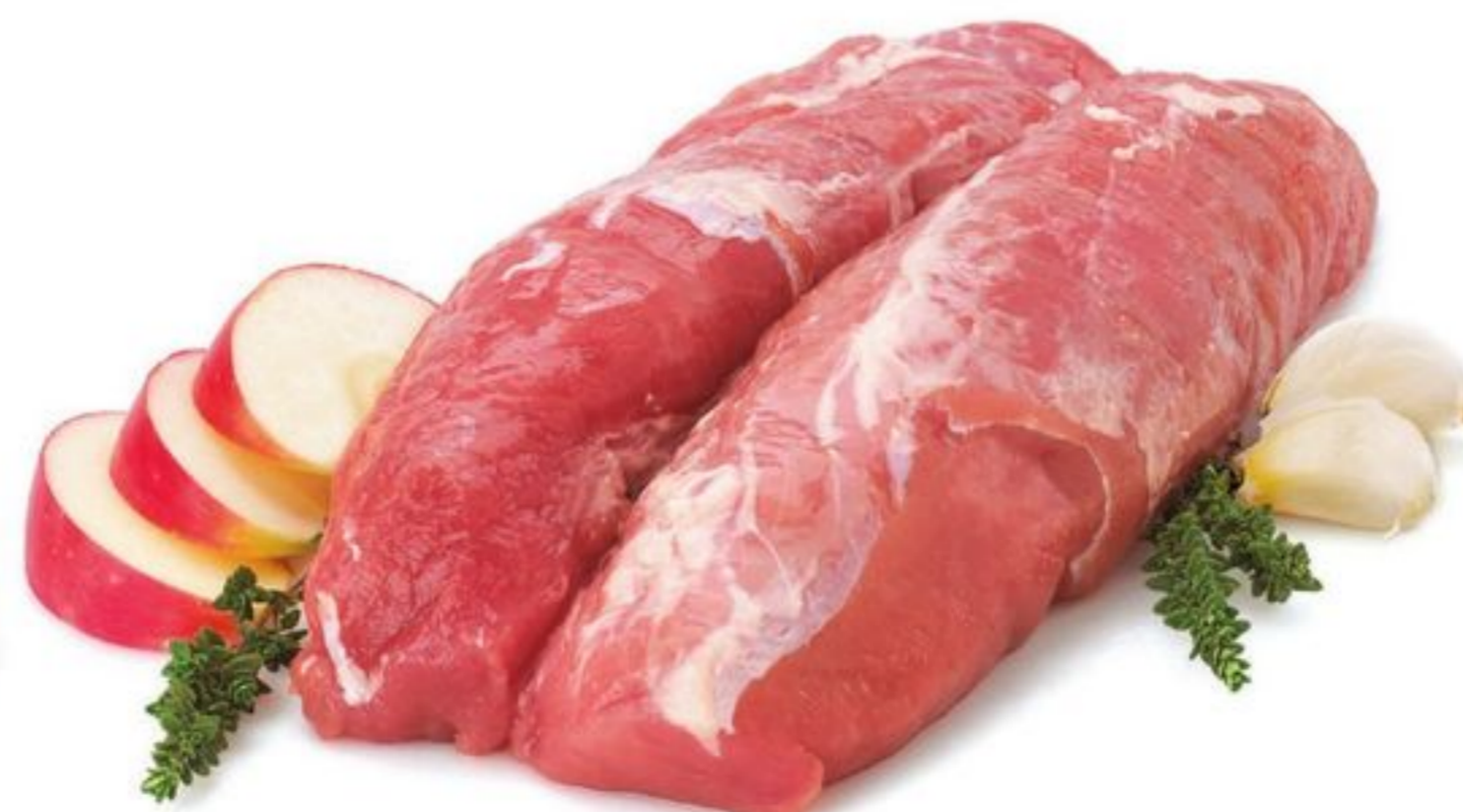
Signature Pork Tenderloin Fresh, Premium Natural, 19.82/kg