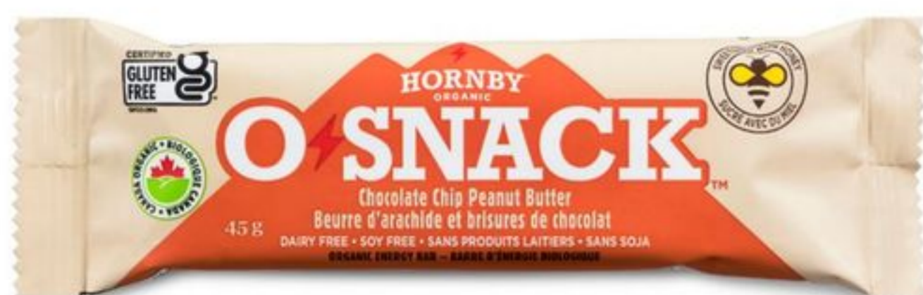
Hornby Organic O Snack Bar 45g 2 for $4