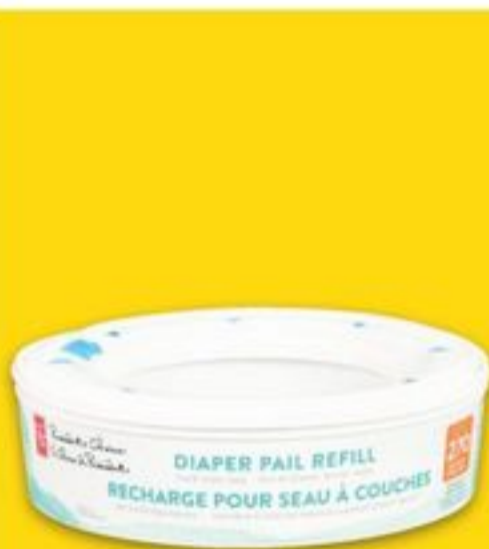
PC® DIAPER PAIL REFILL 270's recharge pour seau de couches 21307016 EA