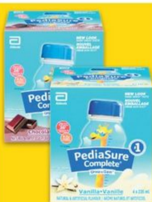
PEDIASURE COMPLETE selected varieties 4x235 ml supplément nutritif 20322414001 EA/20322414002 EA