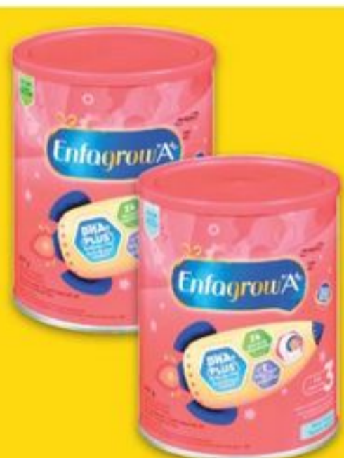
ENFAGROW A+ TODDLER NUTRITIONAL SUPPLEMENT selected varieties, 907 g supplément nutritif pour tout-petit 21407951 EA/21407971 EA