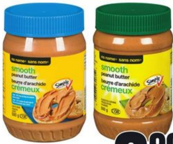
NO NAME® PEANUT BUTTER SELECTED VARIETIES 500 G 20316212001_EA/20316212003_EA