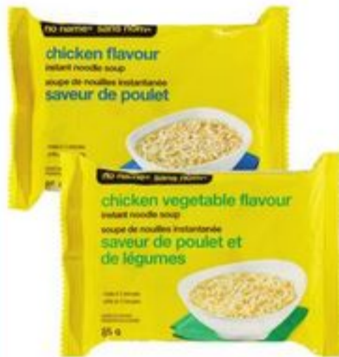
NO NAME® INSTANT NOODLES SELECTED VARIETIES 85 G 20301274001_EA 20305832_EA