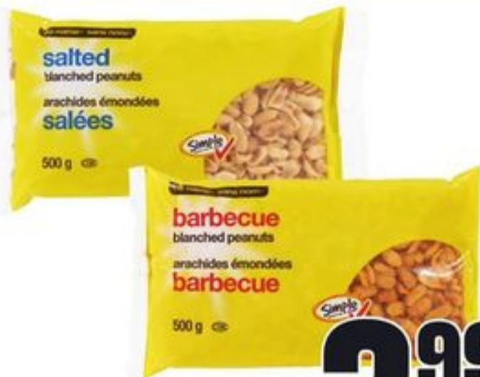
NO NAME® BLANCHED PEANUTS SELECTED VARIETIES 500 G 20318062001_EA 20318062002_EA