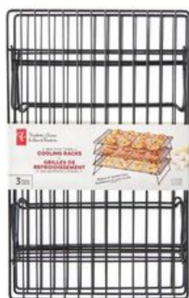
PC® METAL BAKEWARE SELECTED VARIETIES 21154308_EA/21499789_EA