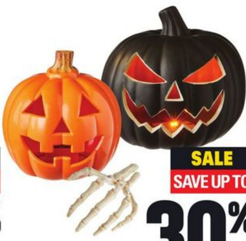
HALLOWEEN DÉCOR SELECTED VARIETIES 21576582_EA/21576480_EA/21176280_EA