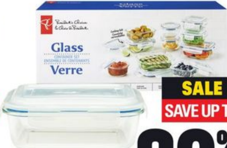
PC® GLASS FOOD STORAGE CONTAINERS SELECTED VARIETIES 21070296_EA/21339856_EA