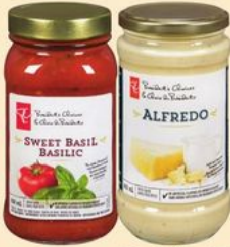
PC ® PASTA SAUCE SELECTED VARIETIES 410/650 ML 20131344009_EA 20320838001_EA