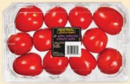
CANADA FARMER'S MARKET ™ ROMA TOMATOES PRODUCT OF CANADA 3 LB 20887458001_EA