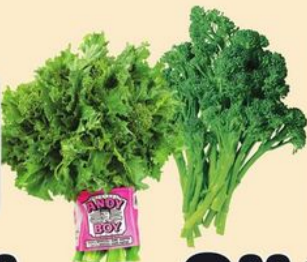
BROCCOLINI OR RAPINI PRODUCT OF USA EACH 20154907_EA/20048070001_EA