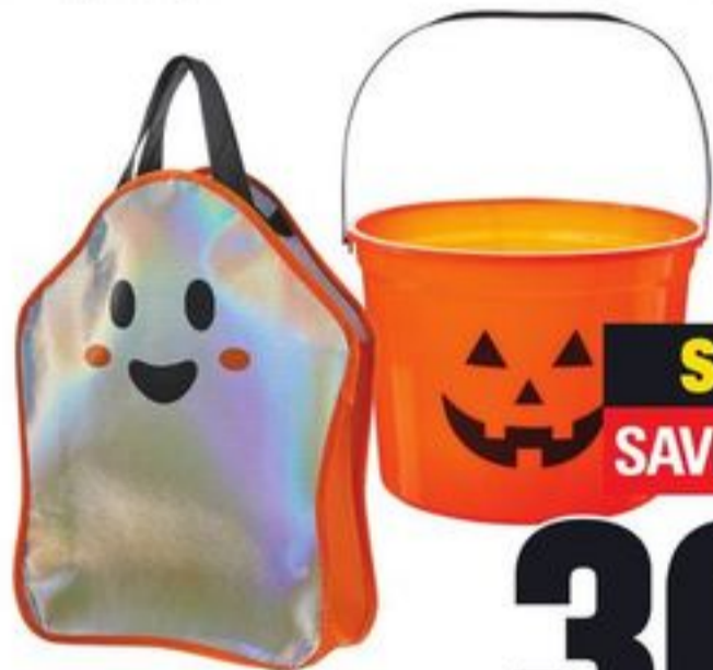
HALLOWEEN BAGS & PAILS SELECTED VARIETIES 21496809_EA/21576468_EA