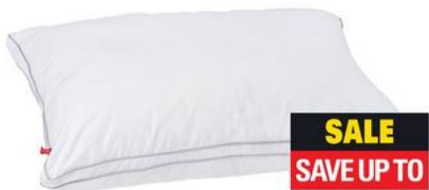
PC® PILLOWS SELECTED VARIETIES 21220214_EA