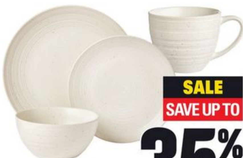
PC® DINNERWARE, DRINKWARE OR SERVEWARE SELECTED VARIETIES 20155343_EA/20748408_EA