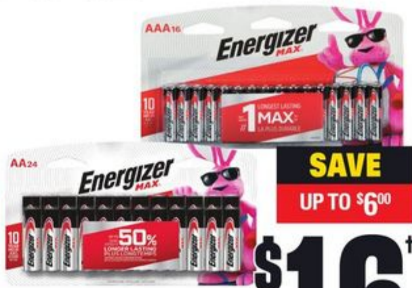
ENERGIZER MAX AA24, AAA16 OR 9V6 BATTERIES SELECTED VARIETIES 21026466_EA/21062566_EA