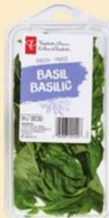
PC ® BASIL, BAY LEAF, SAGE, ROSEMARY OR OREGANO PRODUCT OF COLUMBIA, MEXICO, ECUADOR 28 G 21184798_EA/21212481_EA