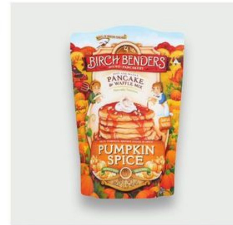
Birch Bender Pumpkin Spice Pancake Mix 16 oz