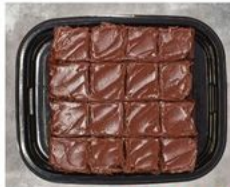
16 COUNT Brownie Tray $14 99