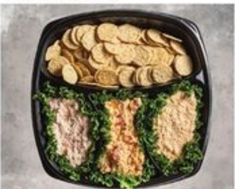
FEATURES SALMON, SHRIMP & CAJUN KRAB DIPS Seafood Dip Platter $28 99