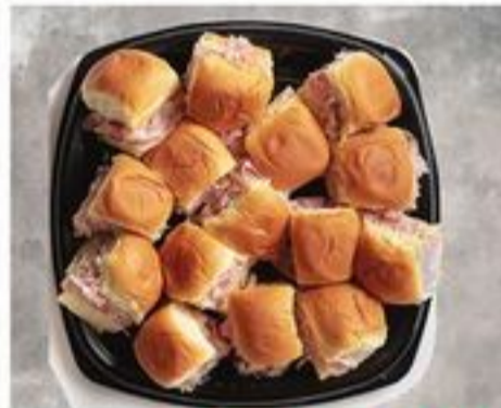
15 COUNT King's Hawaiian Ham & Swiss Tray $23 99