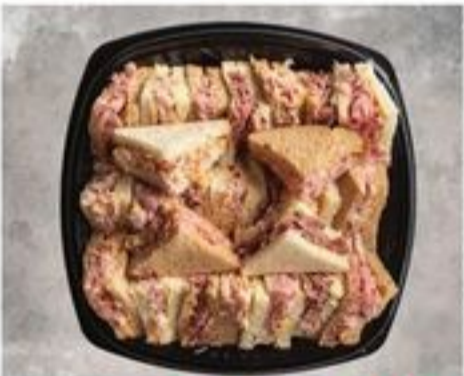
24 COUNT Finger Sandwich Tray $18 99