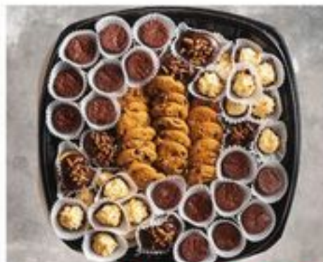
66 COUNT Cookie & Brownie Tray $29 99