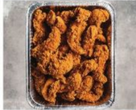
25 COUNT Fried Chicken Tenders $39 99