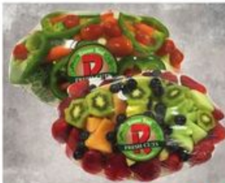
FRESH MADE IN OUR PRODUCE DEPARTMENT Vegetable or Fruit Luau Bowl $6 49 LB