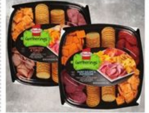
28 OZ Hormel Gatherings Party Tray $14 99