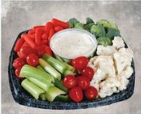
FRESH MADE IN OUR PRODUCE DEPT 12 INCH Vegetable Tray With Dip $19 99