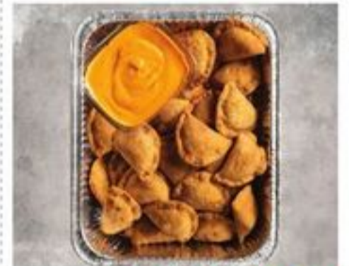
25 COUNT Mini Meat Pies Tray $25 99