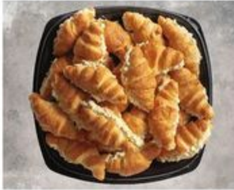
25 COUNT Chicken Salad Croissants $33 99