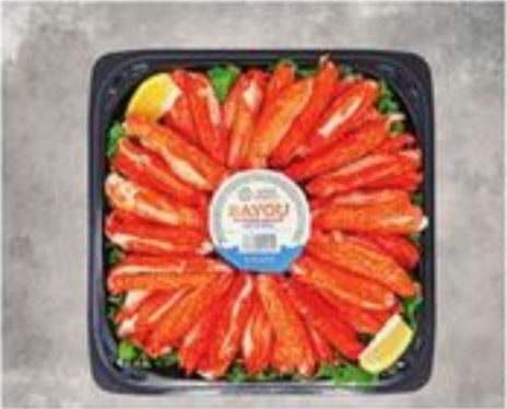
SURIMI BLEND OF CRAB MEAT AND ALASKA POLLOCK Alaska Snow Leg Platter $18 99