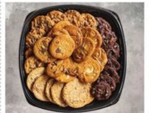
24 COUNT Gourmet Cookie Tray $32 99