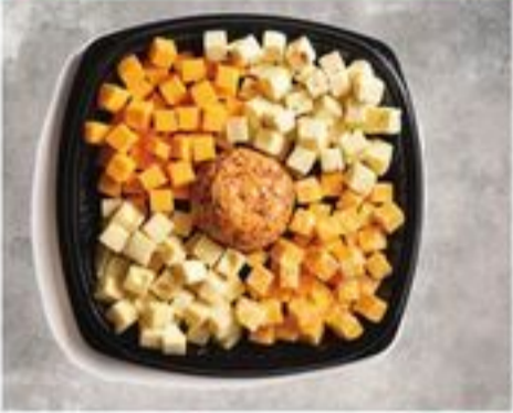
12 INCH Cheese Tray $24 99