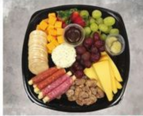
12 INCH Sampler Charcuterie Tray $29 99