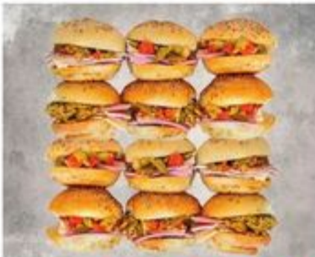
12 COUNT Mini Muffaletta Tray $20 99