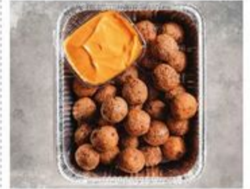
40 COUNT Boudin Balls $39 99