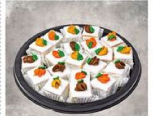
LARGE 20 CT White Almond Petit Fours $24 99