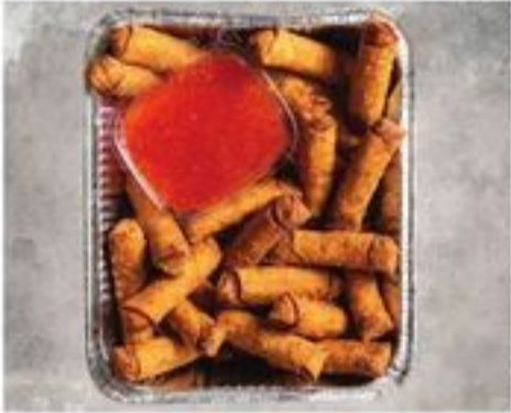
25 COUNT Eggroll Tray $27 99