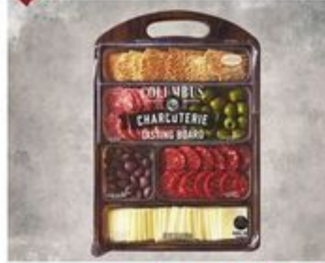
12.5 OZ Columbus Charcuterie Tasting Board $14 99

Please contact your local Rouses or email catering@rouses.com to place an order.