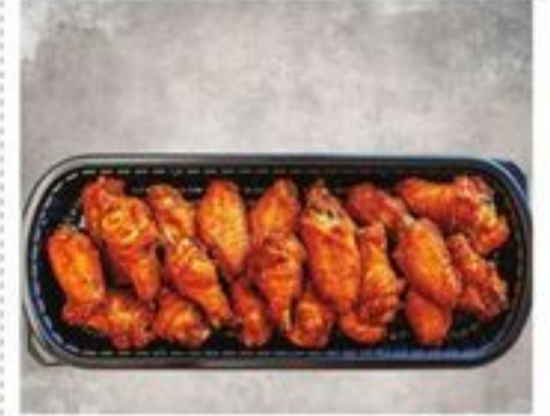
20 COUNT Chicken Wings $17 99