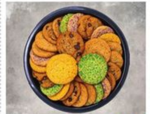
36 COUNT Cookie Party Tray $19 99