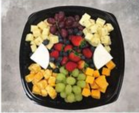
12 INCH Fruit & Cheese Tray $29 99