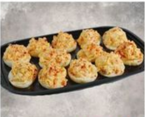
FRESH MADE IN OUR SEAFOOD DEPARTMENT ONE DOZEN Cajun Shrimp or Cajun Krab Deviled Eggs $9 99