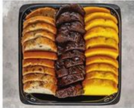
30 COUNT Cream Cake Tray $19 99