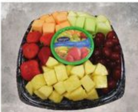
FRESH MADE IN OUR PRODUCE DEPT 12 INCH Fruit Tray With Dip $23 99