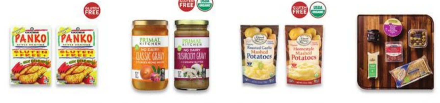
Kikkoman Panko Style Coating 3.99 Pinal Kitchen No Dairy Gravy 7.99 Edward & Sons Organic Potatoes 2/55 Fresh Thyme Charcuterie Essentials board not included 29.99