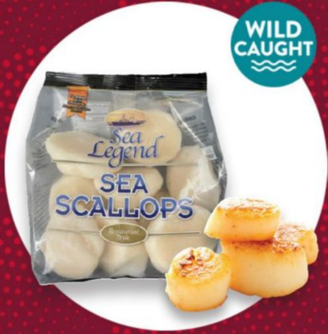
Sea Legend Colossal U10 Dry Sea Scallops 16.99LB

Scallops are an excellent source of high quality protein and contain nutrients to promote immune health and brain function.