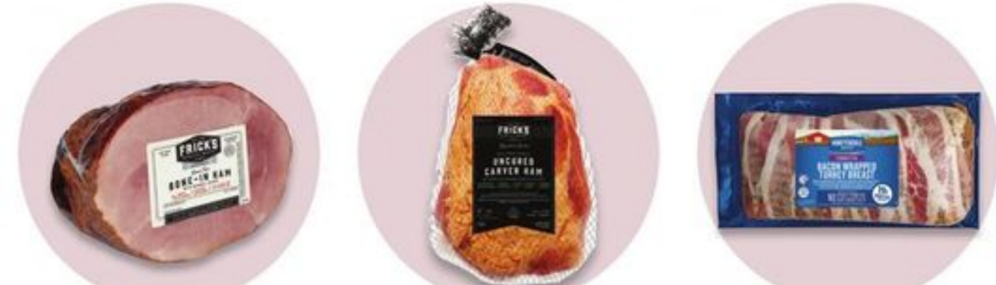
Frick's Super Cured Shank or Butt Half Ham 2.69LB Frick's Applewood Smoked Uncured Carver Ham 5.49LB Honeyuckle Bacon Wrapped Turkeys or Boneless Half Turkey Breast while supplies last 5.99LB