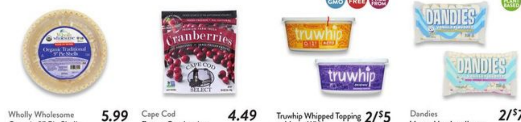
Wholly Wholesome Organic 9" Pie Shells 5.99 Cape Cod Frozen Cranberries 4.49 Truwhip Whipped Topping or Vegan Whip 2/55 Dandies Vegan Marshmallows 2/57