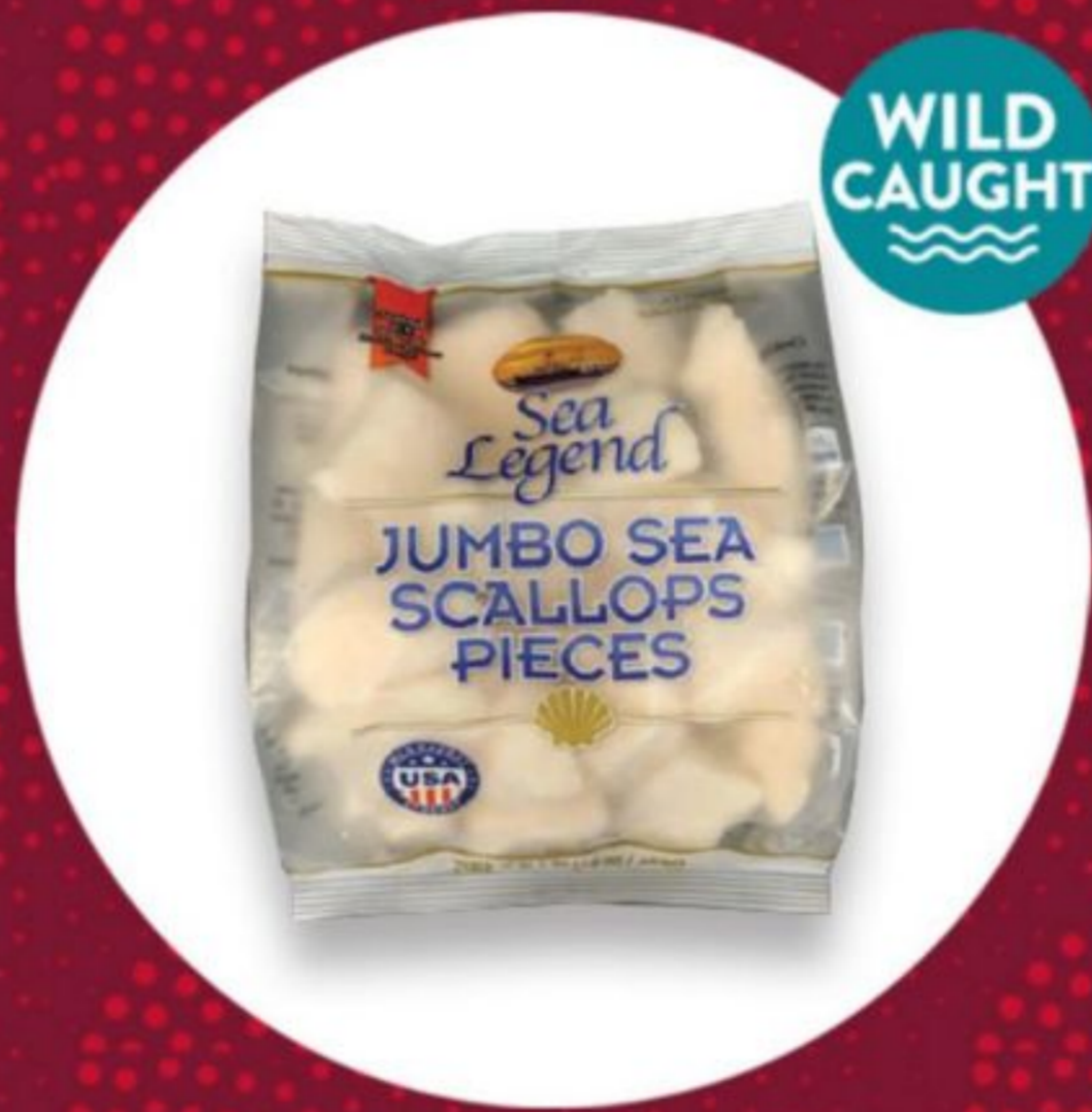
Lund's Jumbo Dry Sea Scallop Pieces 16 oz 10.99