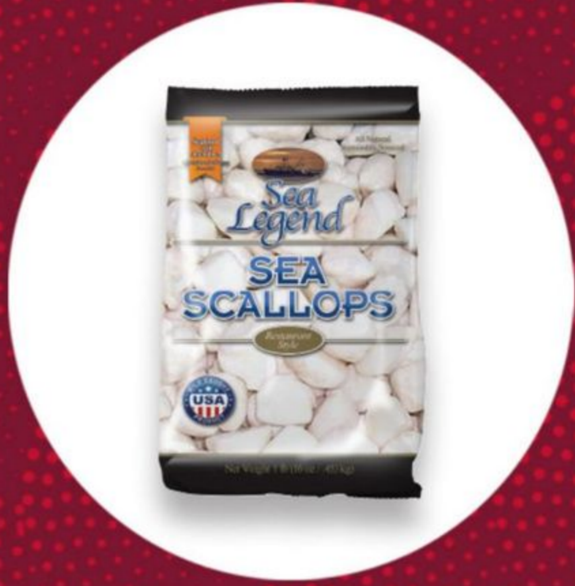
Lund's Jumbo 10/20 Dry Sea Scallops all-natural 16 oz 14.99