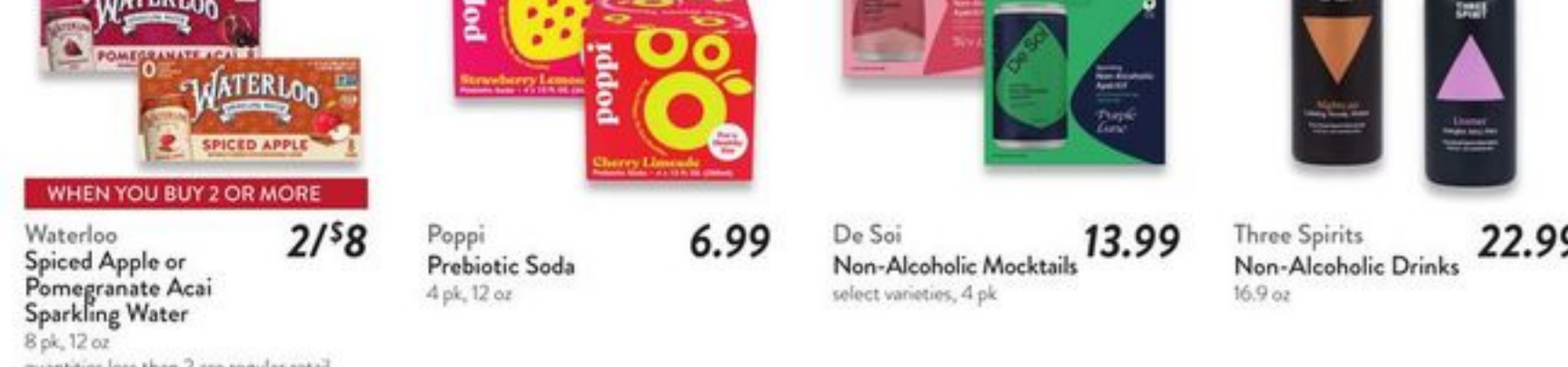
Waterloo Spiced Apple or Pomegranate Acai Sparkling Water 2/58 Poppi Probiotic Soda 6.99 Dr. Sui Non-Alcoholic Mocktails 13.99 Three Spirits Non-Alcoholic Drinks 22.99