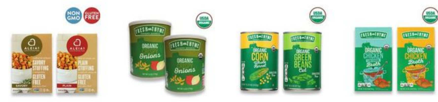
Aleias Gluten-Free Stuffing 5.49 Fresh Thyme Organic Crispy Onions 2/56 Fresh Thyme Organic Crispy Vegetables 1.69 Fresh Thyme Organic Broth 2/54