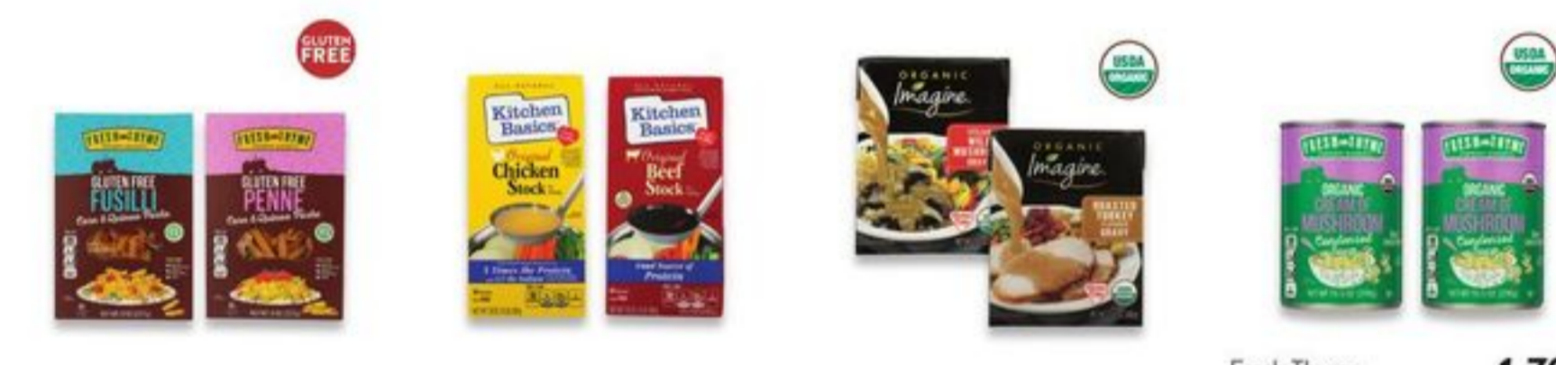
Fresh Thyme Gluten-Free Pasta 2/56 Kitchen Basics Steak 2/56 Imagine Organic Gravy 2/56 Fresh Thyme Organic Cream of Mushroom Soup 1.79