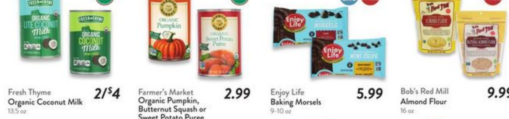
Fresh Thyme Organic Coconut Milk 2/54 Farmer's Market Organic Pumpkin, Butternut Squash or Sweet Potato Puree 2.99 Enjoy Life Baking Morsels 5.99 Bob's Red Mill Almond Flour 9.99