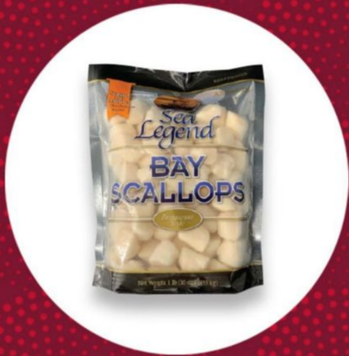
Lund's 80-100ct Bay Scallops all natural 16 oz 10.99