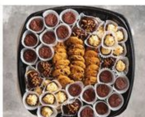
66 COUNT Cookie & Brownie Tray $29 99