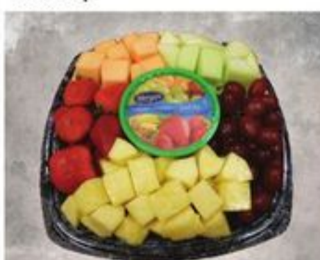
FRESH MADE IN OUR PRODUCE DEPT 12 INCH Fruit Tray With Dip $23 99