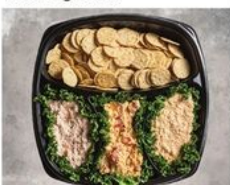
FEATURES SALMON, SHRIMP & CAJUN KRAB DIPS Seafood Dip Platter $28 99