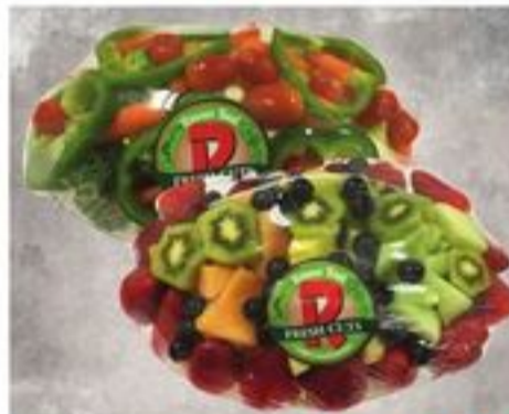
FRESH MADE IN OUR PRODUCE DEPARTMENT Vegetable or Fruit Luau Bowl $6 49 LB