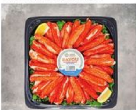
SURIMI BLEND OF CRAB MEAT AND ALASKA POLLOCK Alaska Snow Leg Platter $18 99