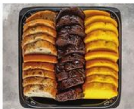
30 COUNT Cream Cake Tray $19 99