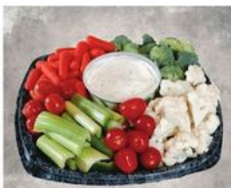
FRESH MADE IN OUR PRODUCE DEPT 12 INCH Vegetable Tray With Dip $19 99