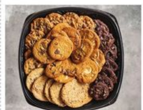
24 COUNT Gourmet Cookie Tray $32 99