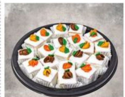
LARGE 20 CT White Almond Petit Fours $24 99