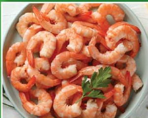
Head-Off Shrimp 51-60 count sold in 4 lb. box