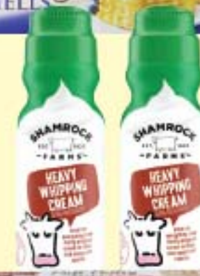
Shamrock Farms Whipping Cream 16 oz.