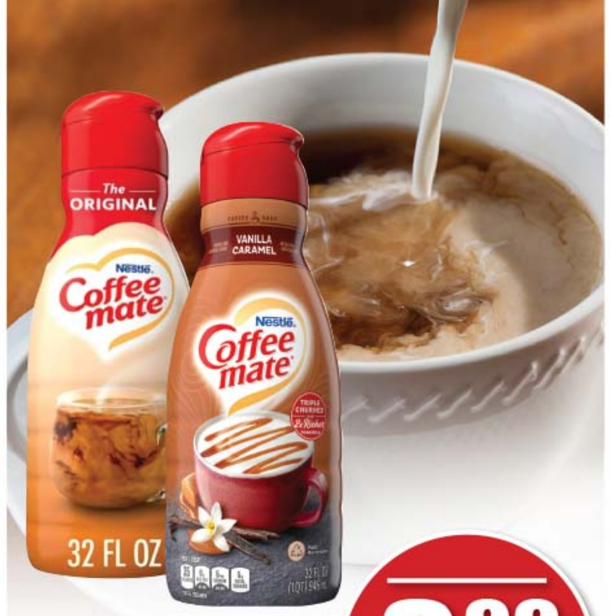
Coffeemate 32 oz.