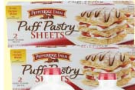
Pepperidge Farm Pastry Sheets 17.3 oz.