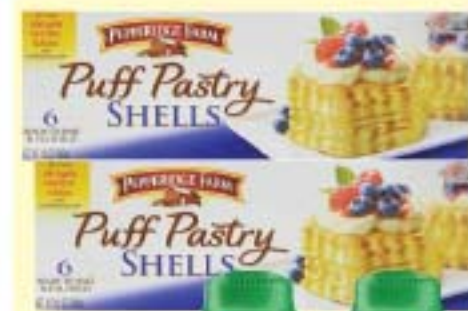
Pepperidge Farm Pastry Shells 10 oz.