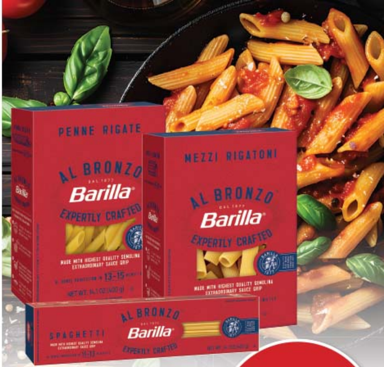
Barilla Al Bronzo Pasta 12-14.1 oz.