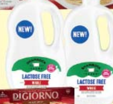
Shamrock Farms Lactose Free Milk 96 oz.