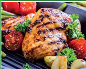
Boneless Skinless Chicken Breast