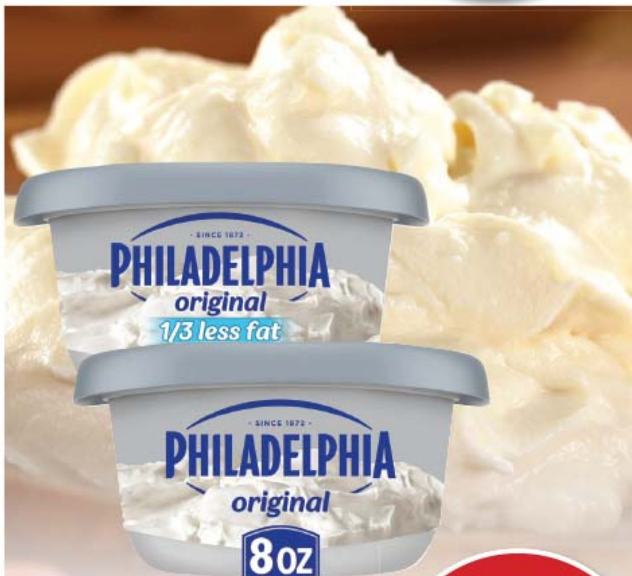
Philadelphia Soft Cream Cheese 7.5-8 oz. tub