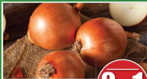
Jumbo Brown Onions