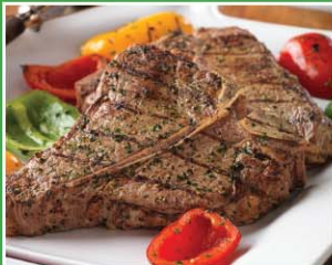
IGA Beef Porterhouse With T-Bone