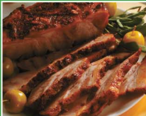
Midwest Pork Bone-In or Boneless Pork Butt Roast