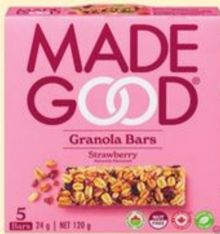
MADEGOOD GRANOLA, MORNINGS BARS, SOFT BAKED COOKIES OR SQUARES SELECTED VARIETIES 110-150 G 20927046_EA/21107622_EA