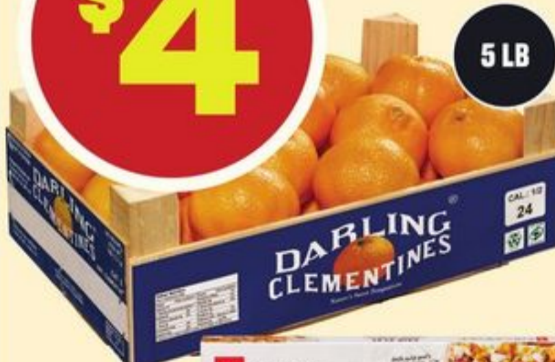
CLEMENTINES PRODUCT OF MOROCCO OR SPAIN 5 LB 20182566001_EA