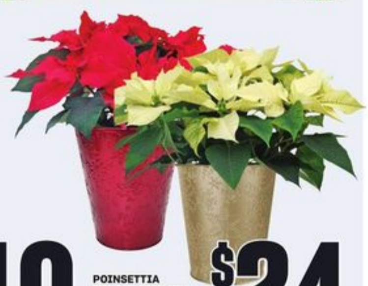
POINSETTIA IN UPGRADED TIN 8 INCH EACH 20287881_EA