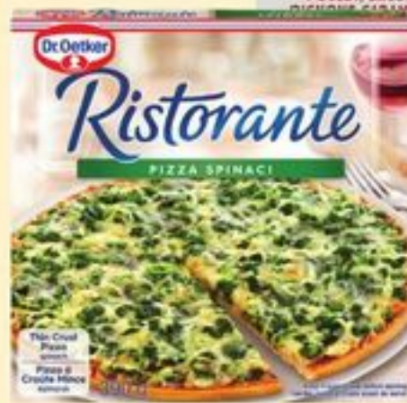
DR. OETKER PIZZA 320-410 G OR PC® THIN & CRISPY, LOADS OF OR FLATBREAD PIZZA 330-455 G SELECTED VARIETIES, FROZEN 20296100001_EA/21013452_EA