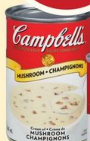
CAMPBELL'S TOMATO, CREAM OF MUSHROOM, VEGETABLE OR CHICKEN NOODLE SOUP 284 ML 20176214001_EA/20176214004_EA