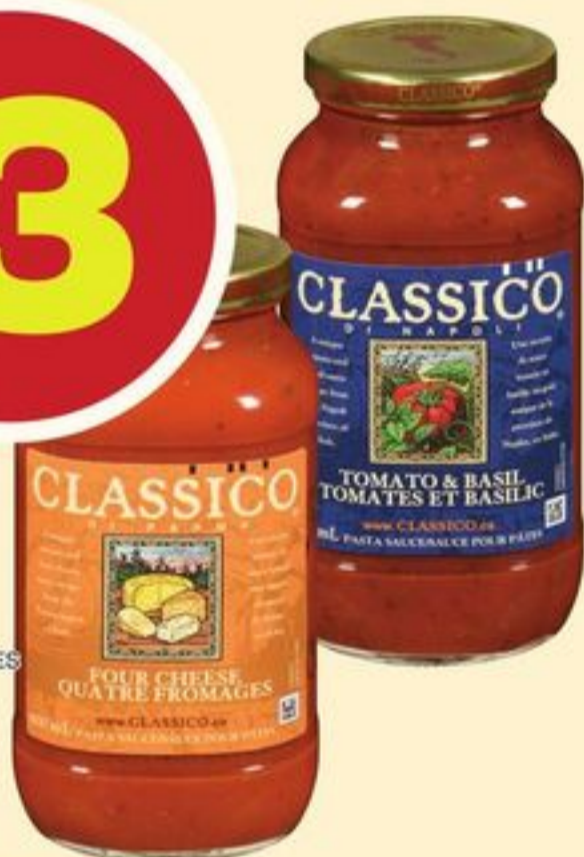
CLASSICO SAUCE SELECTED VARIETIES 600/650 ML 21618217_EA/21618218_EA