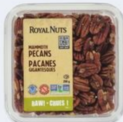
ROYAL NUTS PECANS 250 G 21192386_EA