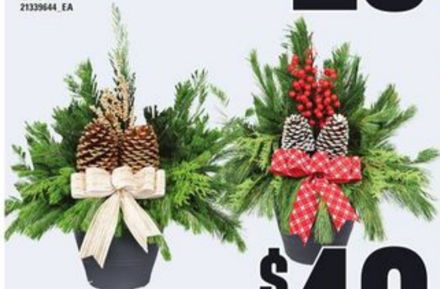
PC® LARGE OUTDOOR ARRANGEMENT WITH PINE & BERRIES EACH 20144803_EA