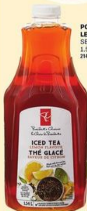
PC® TEA OR LEMONADE SELECTED VARIETIES 1.54 L 21430684_EA/21506771_EA