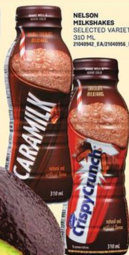
NELSON MILKSHAKES SELECTED VARIETIES 310 ML 21040942_EA/21040956_EA