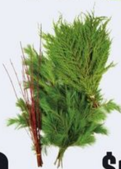
PC® BOUGHS OR BRANCHES SELECTED VARIETIES EACH 20213216_EA/20214311_EA