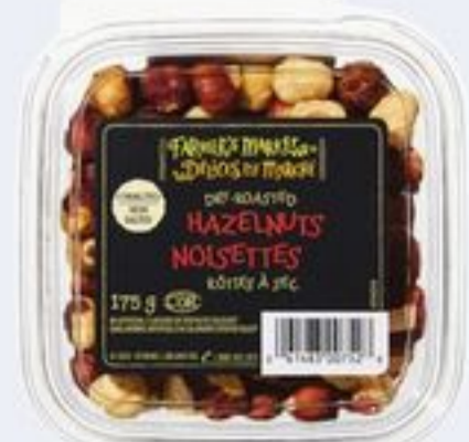
FARMER'S MARKET™ HAZELNUTS 175 G 21519996_EA