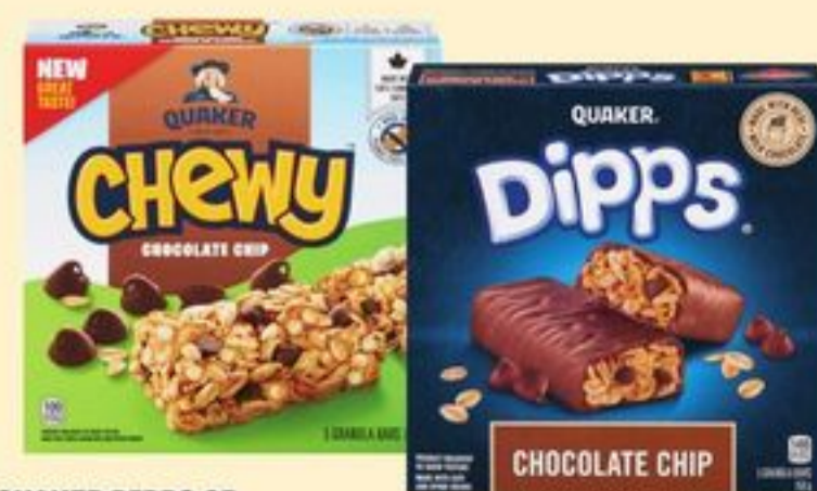
QUAKER DIPPS OR CHEWY GRANOLA BARS SELECTED VARIETIES 120-156 G 21359366_EA/20847582_EA