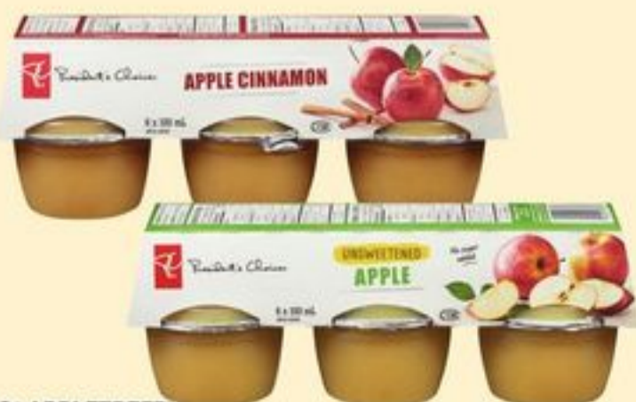
PC® APPLETREE™ APPLE SAUCES SELECTED VARIETIES 6X100 ML 20309701001_EA/20309701002_EA