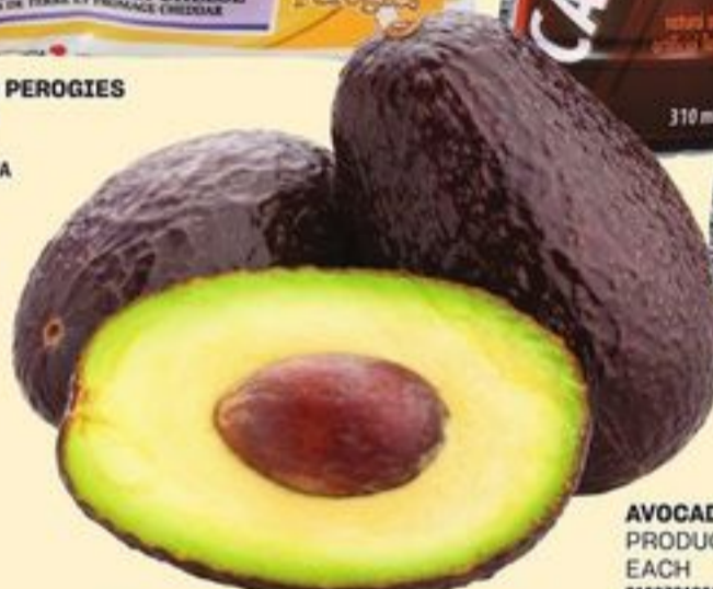
AVOCADO PRODUCT OF MEXICO EACH 21097012001_EA