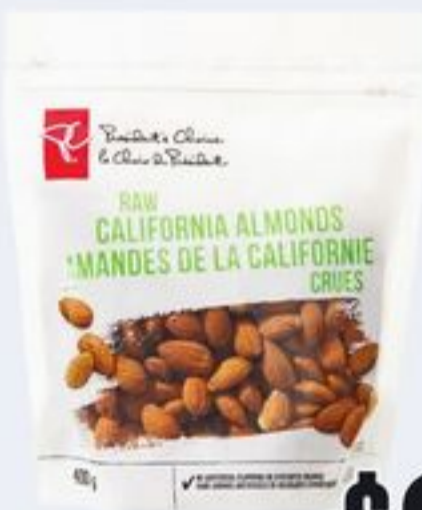
PC® RAW ALMONDS 400 G 21408053_EA