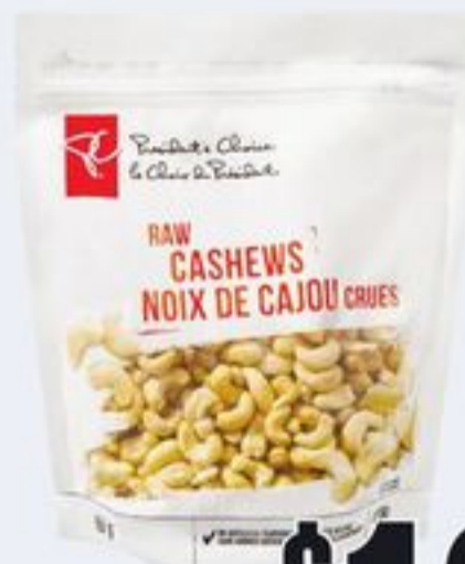
PC® RAW CASHEWS 680 G 21404971_EA