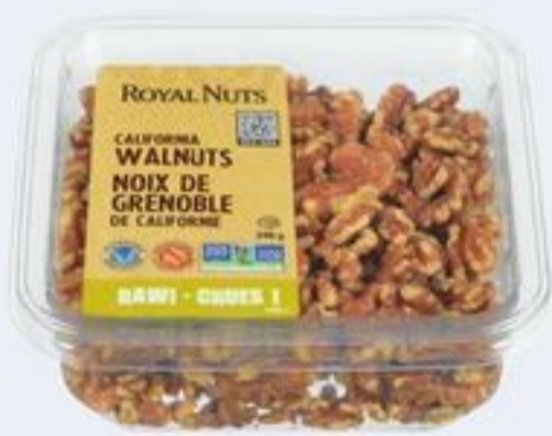
ROYAL NUTS CALIFORNIA WALNUTS 240 G 20771610_EA