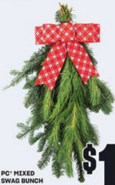
PC® MIXED SWAG BUNCH EACH 21339643_EA

Set the mood, hang some cheer and enjoy the scents of the season.