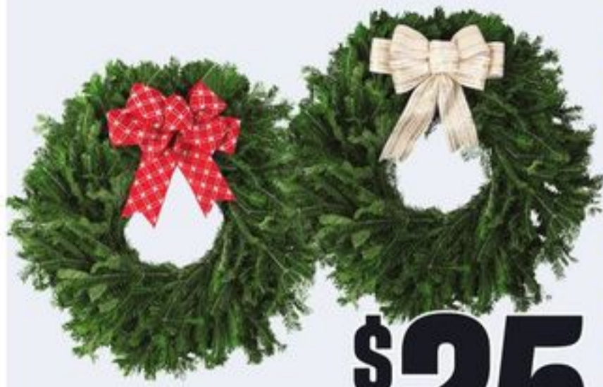
PC® HOLIDAY WREATH WITH BOW 22 INCHES EACH 21339644_EA