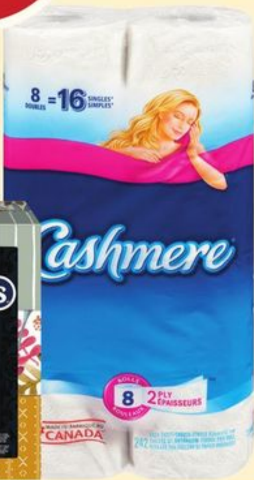
CASHMERE BATHROOM TISSUE 8=16 ROLLS OR SCOTTIES FACIAL TISSUE 6'S SELECTED VARIETIES 20318667_EA/21204742_EA