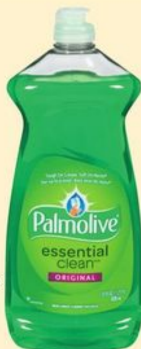
PALMOLIVE DISH DETERGENT SELECTED VARIETIES 591/828 ML 20861400_EA/21004368_EA