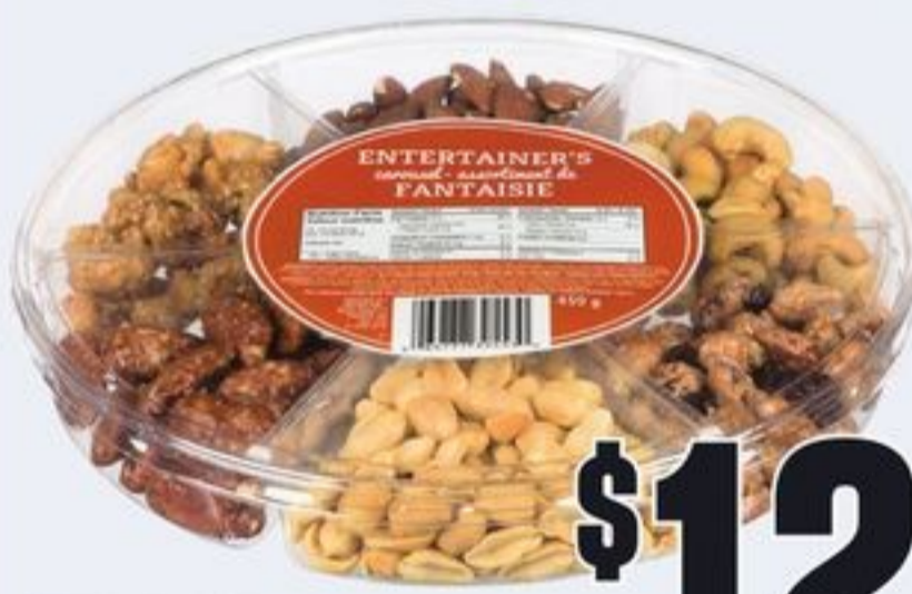
ENTERTAINER CAROUSEL 450 G 20907773_EA